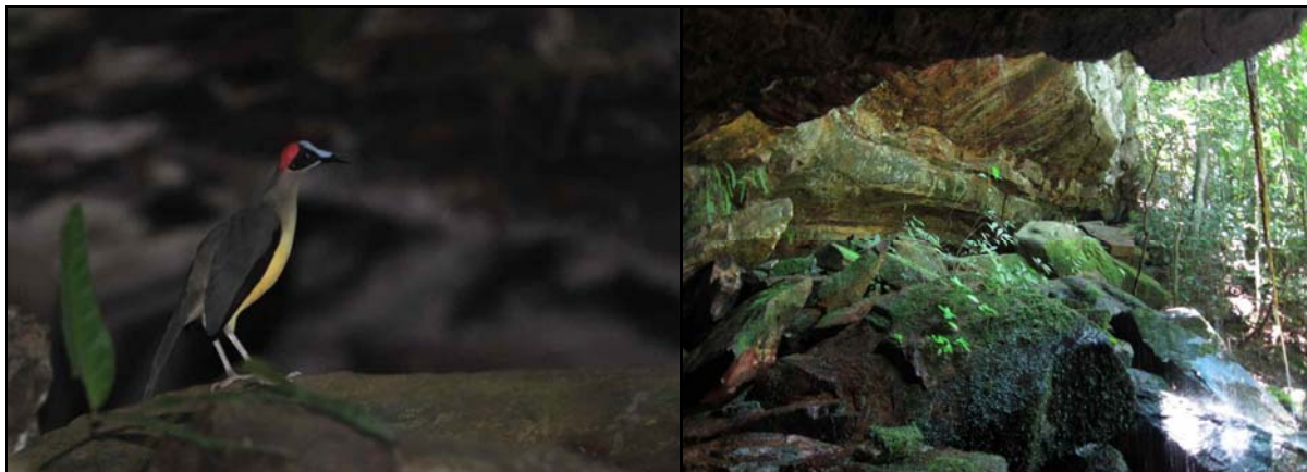
Red-headed Picathartes and the rock overhang where the birds breed.