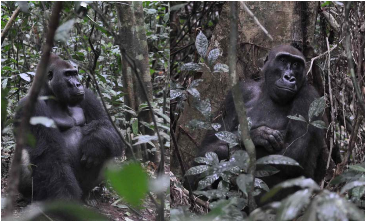
Makoumba (silverback Bai Hoku)

Western Lowland Gorilla Gorilla gorilla gorilla – a total of about 30-35 different individuals was seen, the family of silverback Kingo was seen at Mondika, about 15-20 different individuals were seen at Mbeli bai, and at Bai Hoku we followed the family of silverback Makoumba. Near the Mbeli swamp boardwalk and on the walk from Mondika camp to the parking gorillas were heard not far from the trail.