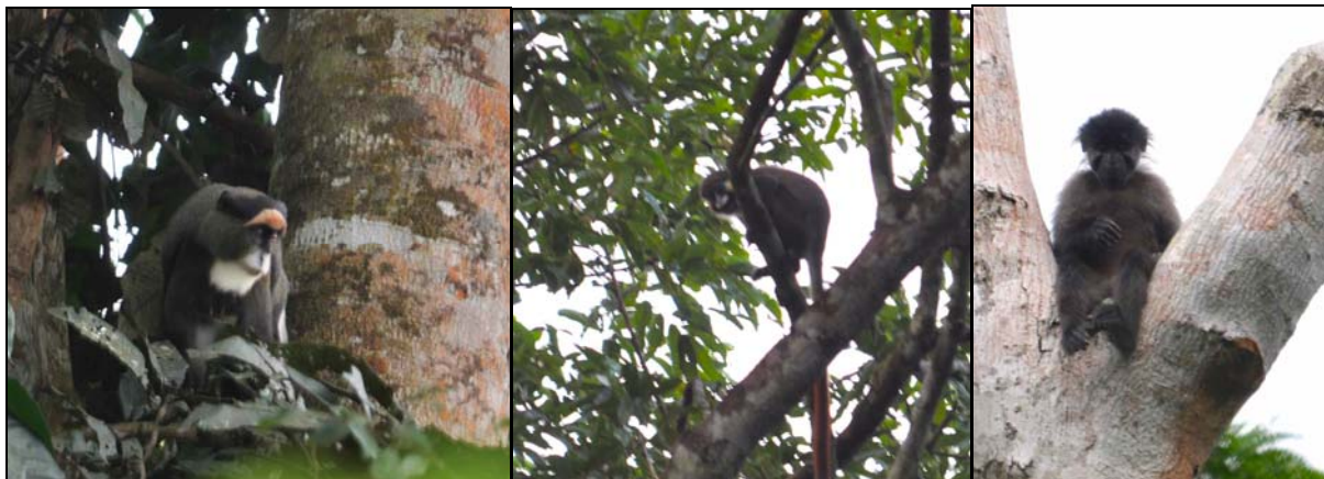
De Brazza Monkey

It was dry this evening and Rod, Tim, and I agreed to go for a night walk. We had barely entered the forest when we located our first potto!! The animal was fairly high up but we had good views. I would have been completely happy with this sighting, but on a very short side-trail where you overlook an area that steeply drops down to the river we found another potto but now at eye level and only some 10-15 meters away. Superb and long views were had of this animal. The distance was unfortunately a little too far to catch it with the camera's flash. In the same area Rod pointed out a calling Thomas's galago, but it called from a very dense area. We continued slowly and again did not get far. On a large pale-barked tree we found a Beecroft's anomalure!! At one point I could see the head and a major part of the body, but most of the time the animal hid at the back side of the tree. We waited for a while, but the animal would not come into view. Not perfect, but not bad either. A bit further on we found yet another potto, but the rest of the walk no new mammals were seen (but I guess it doesn't get much better than this on rainforest night walks). A nice finale and big surprise was a sleeping blackcap illadopsis along the trail.