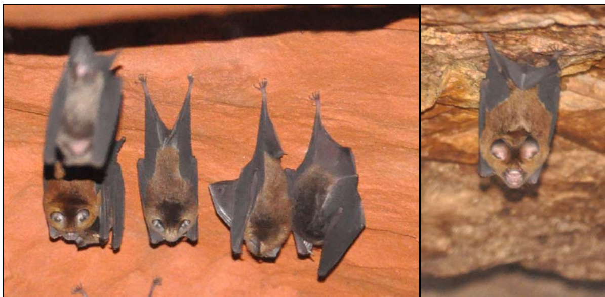
Left: Bats at Bai Hoku and right: bat at the Picathartes site