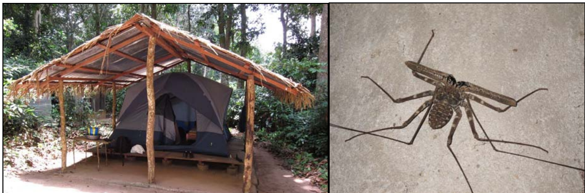
Mondika Camp and the friendly “hammerhead spider” that keeps the toilet free from scary insects

We arrived at Mondika Camp around 12.30; after installing ourselves in our tents we had lunch. There was nothing planned for this afternoon, so I explored the area in and around the camp a bit. Most noticeable and spectacular was the large variety of beautifully coloured butterflies. Birding proved to be extremely difficult and slow. The trees in the camp are very high and the undergrowth is very dense. Directly next to the camp there is a small river that is flanked by a swampy area on both sides. A boardwalk crosses this area. From the boardwalk green malkoha, Cassin’s spintail and a flushed kingfisher that must have been shining blue were seen. Anja decided to take a break and I explored the path that starts from the kitchen area and runs parallel to the river/swamp. Many beautiful butterflies were seen again. There were birds around but I managed to see almost nothing in the poor light. Nevertheless, I saw the attractive red-bellied flycatcher and I flushed a Peter’s duiker that seemed to be resting on the forest floor only 200 meters from camp.