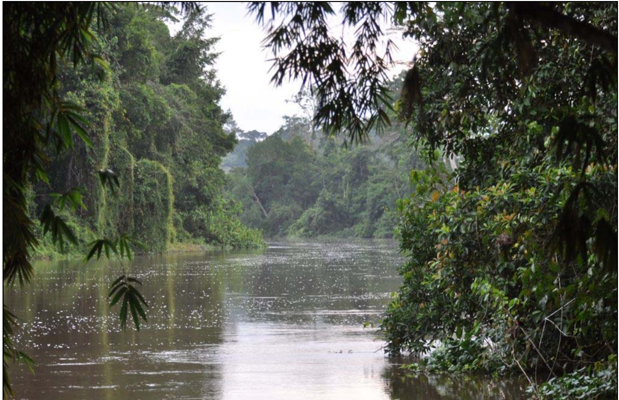
Sangha River at Bomassa

people in the train, but I had seriously underestimated the German pensioners and their perception of major issues in the world. Yes, in theory, you have to sit in your reserved seat in a TGV train, but hey, the train broke down, the train was half empty, so when people have to switch train out of the blue, they just grab a seat, which, besides, proves to be efficient and quick. Whatever people tell you about German pensioners, they don't care about efficiency and being practical, they care about rules and order. Throughout the train there was yelling, anger, distressed people, people being commandeered out of their seats, and always German pensioners were involved. In one of the train units one of the pensioners was going completely berserk against a young guy just because he was sitting in his seat (there were at least 10 seats free around the guy), and right in front of us two German pensioner couples disciplined each other into the right seats. Welcome back.