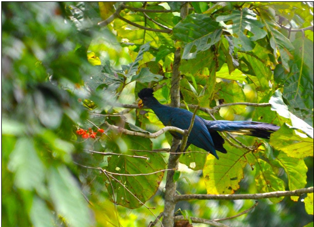
Great Blue Turaco

Around 9 we arrive at the bai. A male sitatunga and a young male gorilla are present, but then it remains rather quiet for a while. Anja and I walk to the toilet area where we see a female sitatunga at close range. After lunch things suddenly get busy, a family of gorillas emerges from the forest to feed in the bai and a big male elephant moves to the centre of the bai. We have a spectacular sighting of a great blue turaco flying past the mirador and landing at eye level only some 25 meters from the mirador. When I descend down the stairs of the mirador for a toilet stop I hear an animal crashing loudly through the dense vegetation next to the mirador. The others quickly join and after a few minutes of great anticipation we see a male gorilla feeding in the undergrowth. After foraging for a while in dense vegetation he finally emerges from the forest, sits down besides the boardwalk for a while and then crosses the boardwalk behind the mirador some 10-12 meters from where we are sitting. Unforgettable.