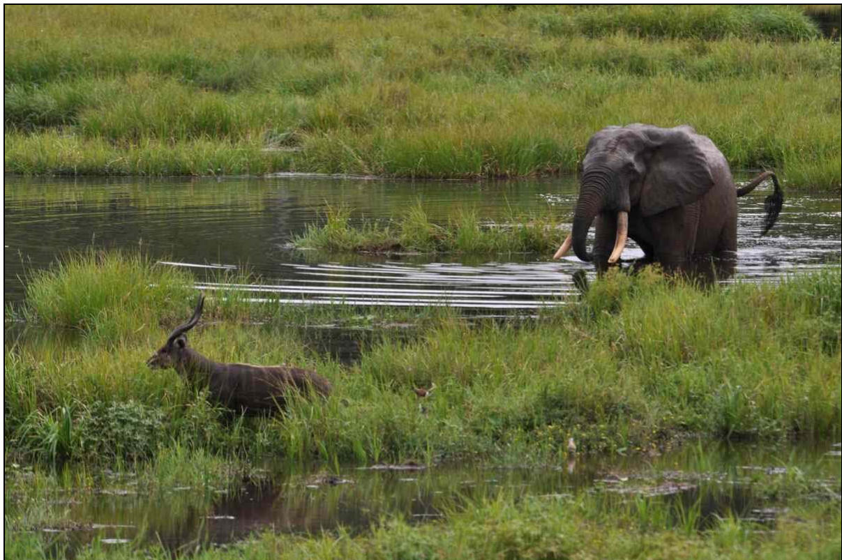
Sitatunga and forest elephant at Mbeli Bai