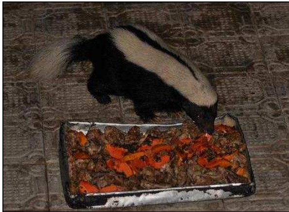
Striped Hog-nosed Skunk

Van Perlo's book has of course the advantage of being restricted to Brazilian birds, but some of the plates are mediocre (a lot better than the terrible De Souza guide though) and even contradict with the text here and there. However, what is really great are the maps that not only show the range of a species but also how common or rare a species is. The text parts in van Perlo are limited, but quite good for identification, but Ridgely and Tudor is clearly the guide to check for high-quality plates and more in-depth information (behavior, ecology, etc.). I did not use the Erize and Rumboll book that much, mostly because the non-passerine species posed less identification problems. In conclusion, you will be fine with van Perlo in 90% of the cases, but for more difficult identification problems it is handy to have Ridgely and Tudor.