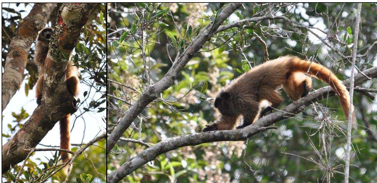
Masked Titi Monkey (territorial call from animal on the left)