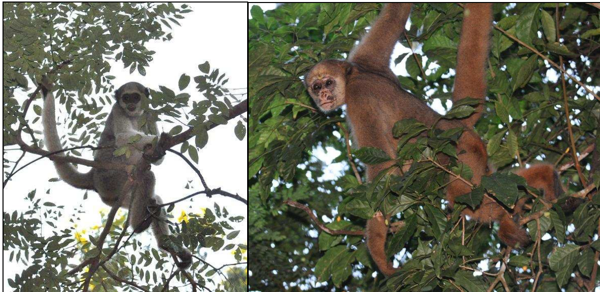
Muriquis from the last group seen around dusk

Northern Muriqui Brachyteles hypoxanthus – four different sightings at CBS, three times a group of about 15-25 animals, once only a few (visible).