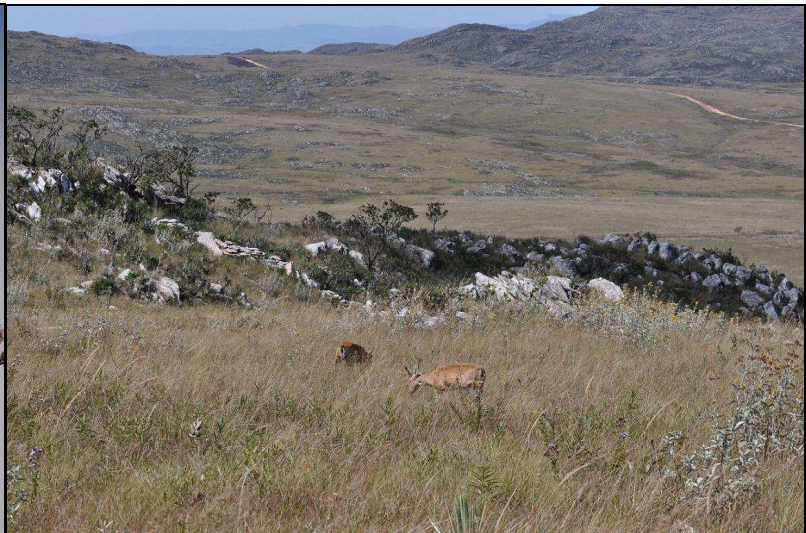
Typical landscape in Canastra/Pampas Deer

In the last hour before dark we found even more anteaters including a mother with her baby on her back. Just after dark we spotlighted a Brazilian cavy at the edge of the road. Amazingly, the animal just sat there for at least 10 minutes, but when it ran away it did not appear to be ill. Maybe it was just startled. Nightjar presence was quite good: scissor-tailed nightjar, band-winged nightjar, and pauraque were seen. A search for sickle-winged nightjar was unsuccessful though. Outside the park borders we encountered a tropical screech-owl and an unidentified large rat. All in all, a very enjoyable and productive day. Even when the birding and mammal watching were a bit slow, the views across the extensive rolling grasslands were amazing.