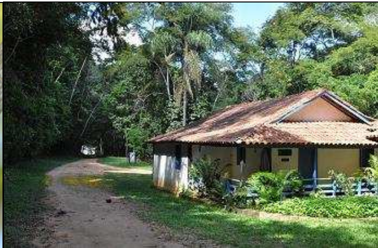
Road passing Caratinga Biological Station