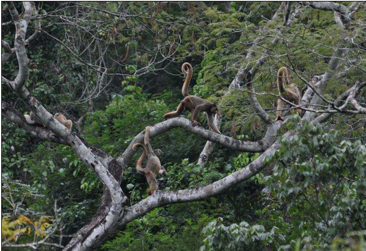
Muriquis (first group in the morning)

A bit later we found two PhD students along the road studying the muriquis. The monkeys had just woken up and were starting to move. They were a few hundred meters away but could be seen well through the scope. The monkeys were moving in a direction that was crossed by a second road. So we headed there and got very good views (15-40 meters distance) of about 15-20 muriquis moving swiftly through to the trees. They rarely stopped to feed so it was impossible to get good pictures. After this exciting encounter the muriquis moved away deeper into forest and we continued birding and look for other monkeys. First we had an hour with entertaining birding: sooretama slaty antshrike, spot-backed antshrike, green-backed becard, rufous-tailed jacamar, pileated finch, rufous-capped motmot and more crescent-chested puffbirds. At an abandoned farmhouse we found sooty grassquit.