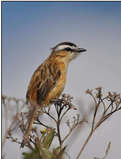
Sharp-tailed Grass Tyrant

After enjoying the fantastic views of the rolling grasslands at a stone-walled corral, we headed deeper into the park. Cerrado birds kept trickling in, but the giant anteaters just wouldn't show. Sharp-tailed grass-tyrant, cock-tailed tyrant, sedge wren, great pampafinch, wedge-tailed grassfinch and greater rhea were some of the birds seen. Around noon we still hadn't found any anteaters, so we decided to try a remoter area that usually holds a lot of anteaters, but even here we couldn't find any. After the lunch break we continued our search and it took until about 4 pm before Toninho spotted the first anteater. We parked our car and walked up to the animal. It could be approached up to about 20-30 meters, but it kept a healthy distance between us and him. We could follow this magnificent and bizarre animal for about 15 minutes when it outsmarted us and disappeared in higher grassland. After this brilliant encounter we drove slowly back to the park exit. Soon we encountered another anteater in beautiful afternoon light, but it disappeared very quickly in the high grass. Blue ground-dove and aplomado falcon were nice additions to the bird list.