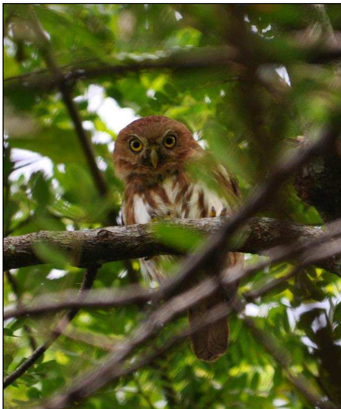
Ferruginous Pygmy Owl

Around 5 pm the diluvial downpour that had raged all afternoon had slowed down to just rain and I went out again. I was hoping to walk to the start of Sao Jose trail and spotlight back. On the Light Blue trail I caught several short glimpses of a very shy channel-billed toucan and ran into a couple of white-bearded manakins. I had completely forgotten that there is a small stream to cross on the way to the Sao Jose trail. The harmless stream had turned into a deep, fast-flowing torrent. While I was checking if there was a way to get across, I almost slipped from the steep, slippery bank into the water so I decided that common sense should prevail and started walking back. Parts of the Light Blue trail were completely flooded and an open grassy area that had been completely dry and had held a pauraque yesterday now had been turned into a little lake. Spotting proved to be very difficult; the rain had increased again around dusk and scattered the light in all directions. I walked back via one of the higher hills expecting that animals might hide up there, and indeed twice I saw a shadow (possibly an agouti and opossum) race across the trail. Eventually I made it back to the lodge completely soaked.