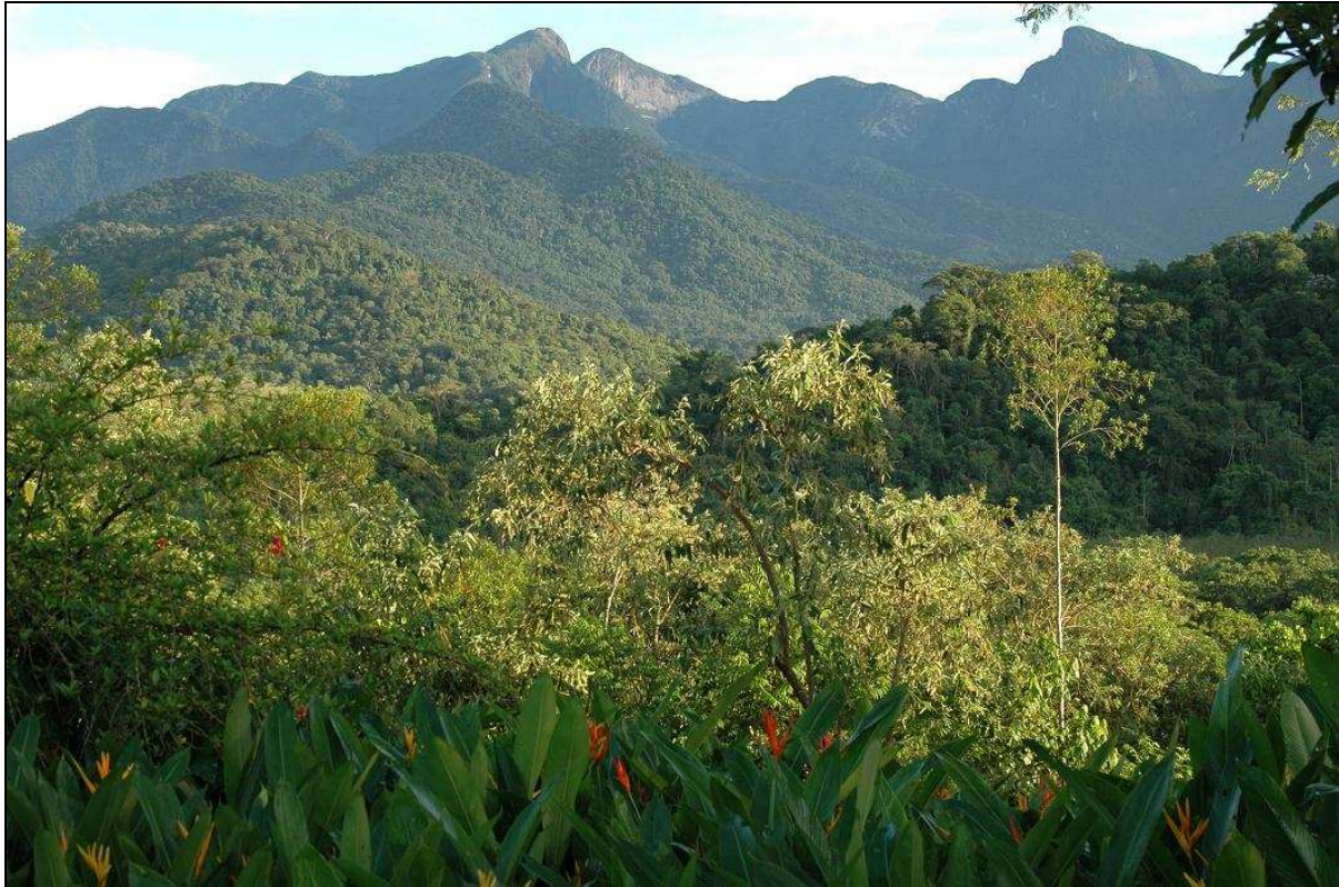
View from Guapi Assu Bird Lodge

This report deals with our second trip to Brazil. This time we focused almost exclusively on a few Atlantic rainforest sites but we also explored good cerrado habitat for a few days by visiting Canastra national park. Main focus were birds and (macro)mammals. Bats and other small mammals were largely ignored (lack of time and usually lack of knowledge to determine them properly).