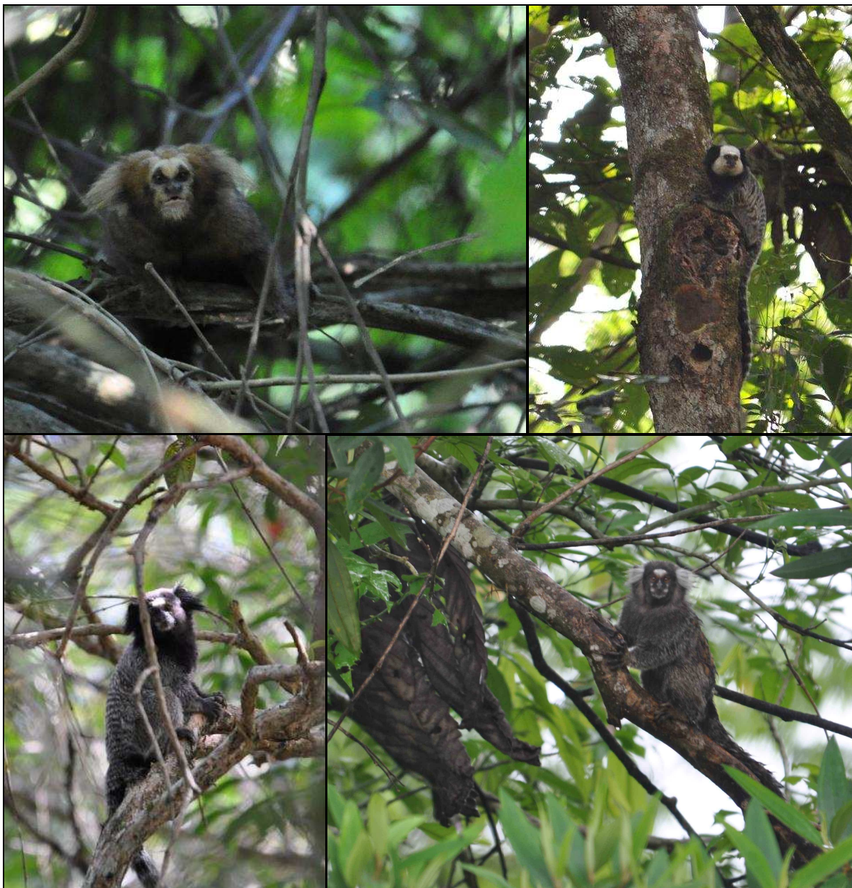
Marmomania: buffy-headed marmoset (upper left), Geoffrey's marmoset (upper right), black-tufted ear marmoset (lower left) and white-tufted ear marmoset (lower right)

All in all, it was a great trip and despite a few days of rather terrible weather, we did not miss that much. I again excelled in not being where the cotingas and bellbirds are. I missed most of them, but was very glad with to see the beautiful hooded berryeater. A week earlier most of the cotinga species were still around (and being seen) but it seemed that they all disappeared towards the coast or other areas with the bad weather in the first week of April. Mammalwise, most disappointing was not seeing red-rumped agouti, but I probably should have spent a bit more time in Caratinga. A bit of a surprise was missing the maned wolf and not seeing South American coati at all, but we had seen these species on our previous Brazil trip. I can be contacted at olpa {at} onsneteindhoven.nl