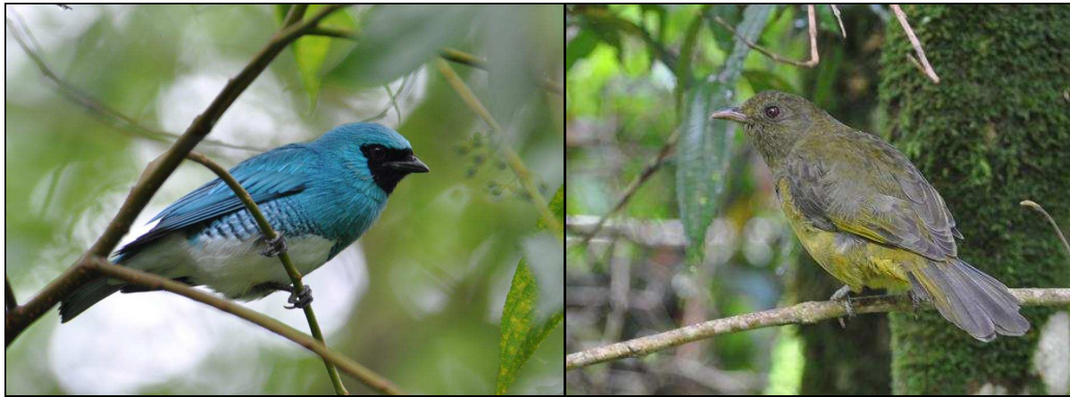
Male Swallow Tanager

Swallow Tanager Tersina viridis - one male hiding from the rain in the lodge garden on April 1, smashing views of one male feeding almost at eye level in a low tree on the wetland trail in REGUA on April 6.