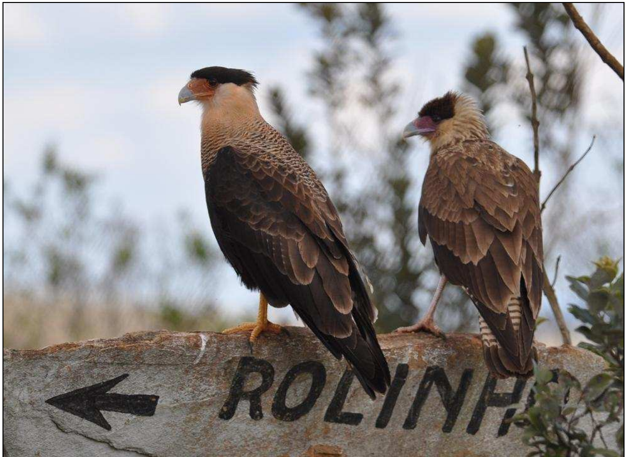
Southern Crested Caracara (juvenile right)

Brazilian Guinea-Pig Cavia aperea – one was seen after dark in in Canastra and two were seen on the edge of the small pool next to the parking lot at Caracas.