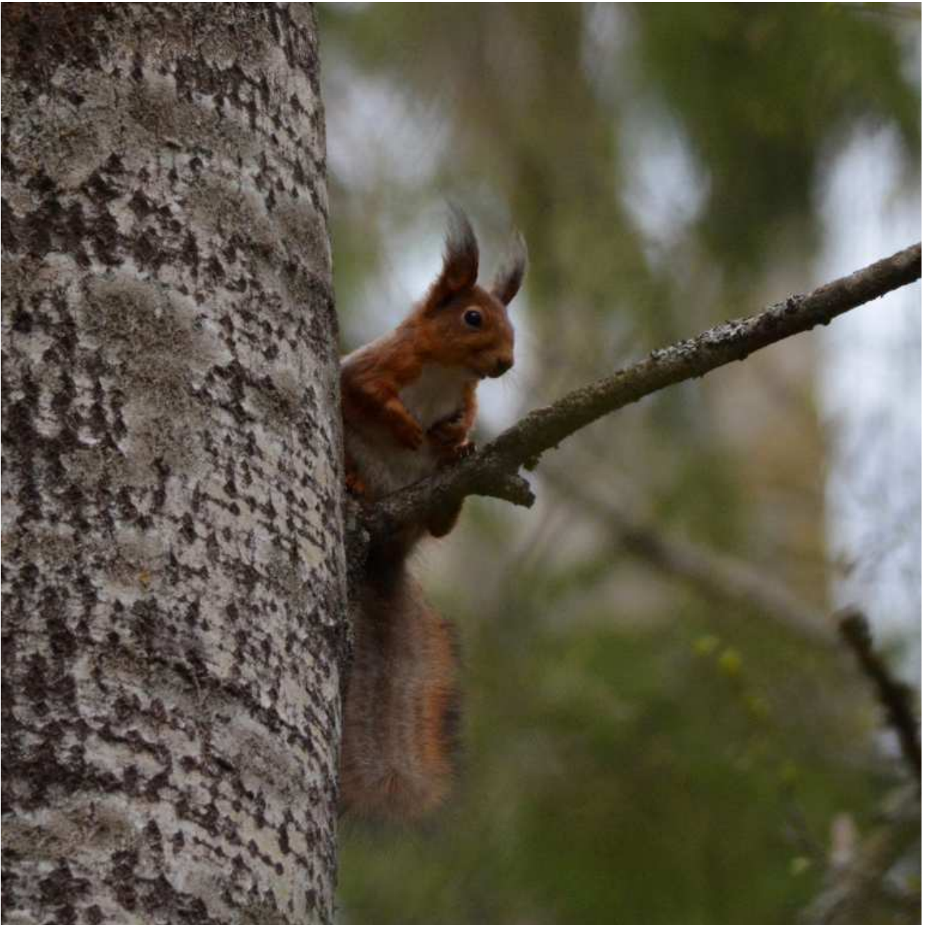
Eurasian Red Squirrel - Soomaa NP.

Mallard 2m+2f , Tufted Duck 1m+f , Common Goldeneye 6m+2f , Buzzard 1 , Common Crane 1 , Northern Lapwing 2 , Herring Gull 2 , Stock Dove 2 , Wood Pigeon 1 , Magpie 2 , Jackdaw 5 , Carrion Crow 2 , Barn Swallow 4 , Skylark 2 , Starling 3 , Whinchat 1 , White Wagtail 3 , Chaffinch 15 , Yellowhammer 4.