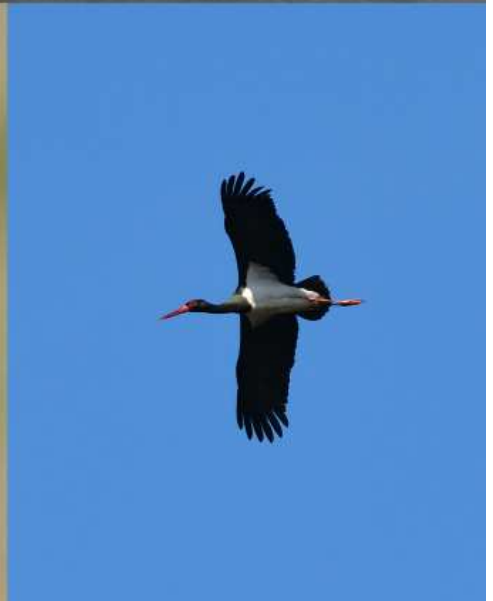
Elk, Common Crane, Eurasian Beaver, Citrine Wagtail and Black Stork.