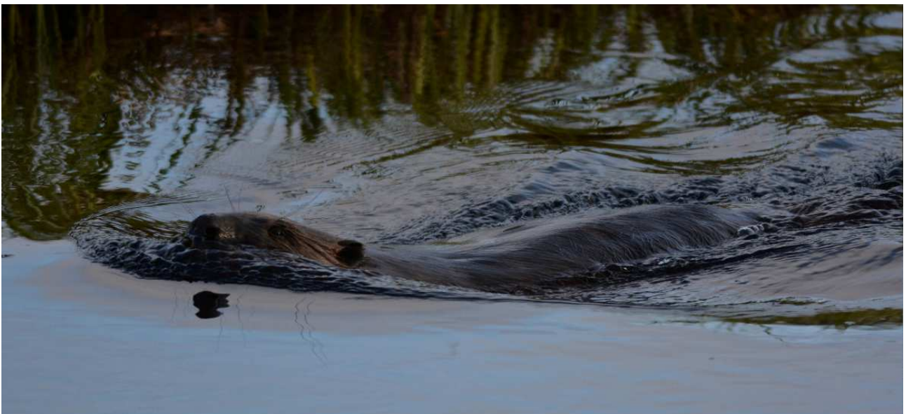
Eurasian Beaver - Soomaa NP.

- Quite easy to see at Matsalu NP, not least from the tower at Kloostri.