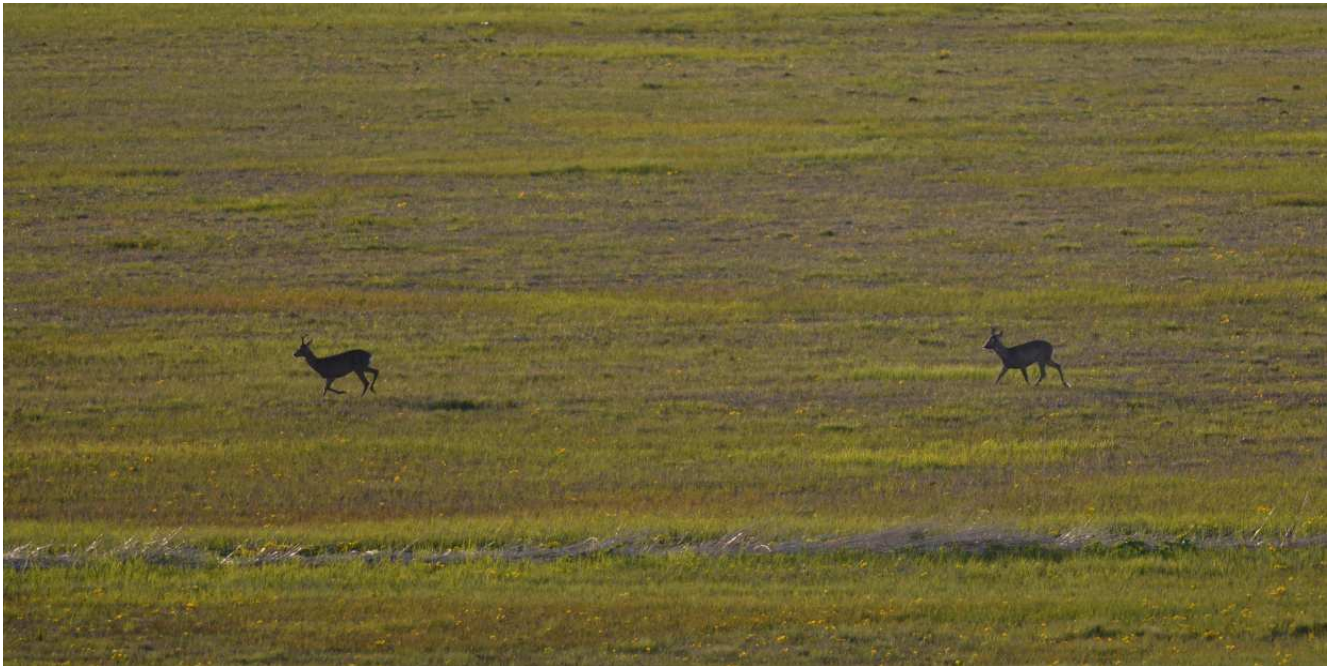
Roe Deer - Matsalu NP.

Luitemaa NR : From the main road (E67) I drove 7 kilometers south on road 333 from Uulu, and took a walk from here in the forest north of the bog. The forest here is obviously used commercially, but still quite good for bird watching. Several Hazel Grouses were found along the road just north of the bog, where they were feeding on fresh buds of the bushes along the road, before flying in to the coniferous forest. Different species of woodpecker were also seen here as well as Willow Tit, Parrot Crossbill, Northern Goshawk and a female Capercaillie. A Pine Marten was seen briefly crossing a path while several Elks favoured the area of grass and bushes on the other side of the road. All in all a pretty nice place, though probably no better than the forest further south and east.