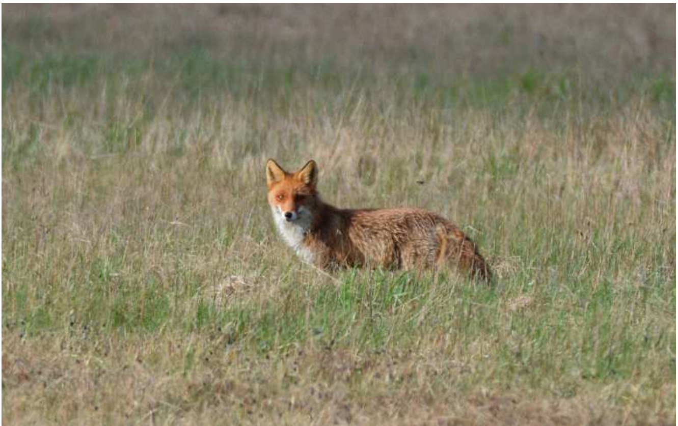
Red Fox - Matsalu NP.

Pakri : Situated some 50 kilometres by road west of Tallinn, and apparently the best place to find Black Guillemot in Estonia. I certainly had no problems finding them, but of course I was helped greatly by the weather which was very nice with almost no wind at all. The birds were lying on the water beneath the cliffs by the lighthouse at the tip of the peninsula. The places is easily found by driving north through the town of Paldiski, and then just following the road along the western coast of the peninsula almost to the end.