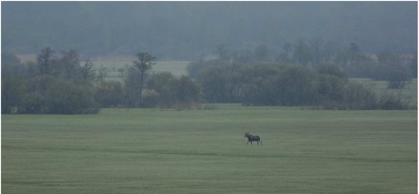
Elk - Matsalu NP.

Matsalu NP - Haeska - Panga - Haapsalu 20.00 - 22.05.