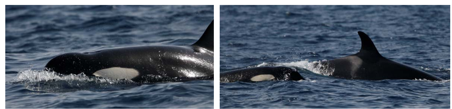
watched up to 10 for nearly an hour before we had to go back. As we headed towards the harbour we

Today we had to wake up early to go to Tarifa where we caught a boat to go Whale watching. We set out and within half an hour we saw some Bottle-nosed Dolphins . Shortly after we spotted a blow and then saw our first Killer Whales near some Moroccan fishing boats. We got really close to them and