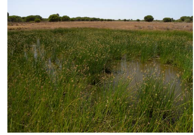
Darter, Black-tailed Skimmer, Broad Scarlet, Common Darter, Small Bluetail, Small Spreadwing , 2 really good Long Skimmers and after searching all the way around the

called Laguna de Moguer and we named it the pool of dreams because on it we had Red veined