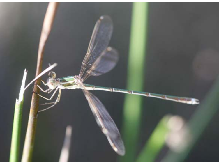
Spain – July 2009 by Tom Bird

we had to get to the other side of the lake so we drove to the other side and parked