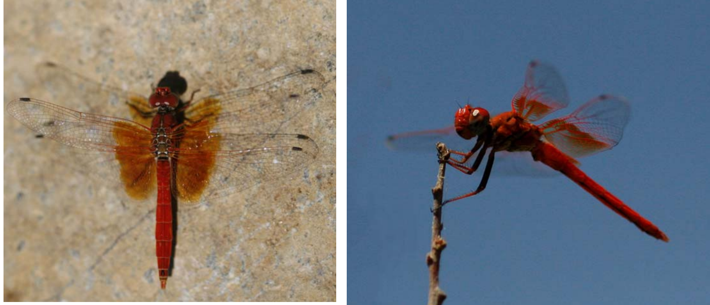
second stop for dragonflies was under a bridge at

as it is found in Africa. When my dad checked the book and photo he agreed that's what it was. Our