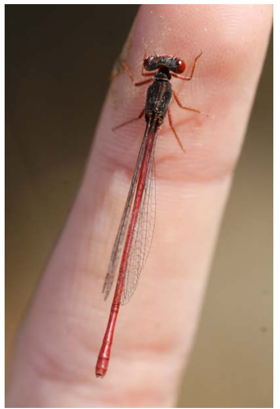
Small Red Damsel Keeled Skimmer