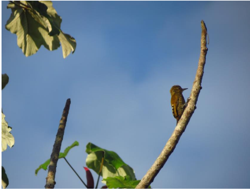
Little Woodpecker

25 May- We sailed back down the Maues River, and entered the Parana Anjira for a canoe trip in the early morning. We heard Klages's Antwren, which would be a range extension for that species.