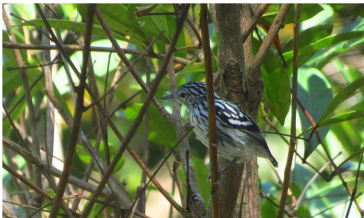
Amazonian Streaked Antwren

22 May - In the morning we explored the várzea along the Parana Araria close to the city of Maues. Highlights were Amazonian Black Tyrant, Amazonian Streaked Antwren, and Klages's Antwren.