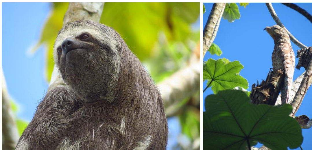
Three-toed Sloth and Great Potoo

We encountered a Black-tailed Trogon, several Hoatzins, Zimmer's, Straight-billed and Striped Woodcreepers, and a nest of Wattled Jacanas.