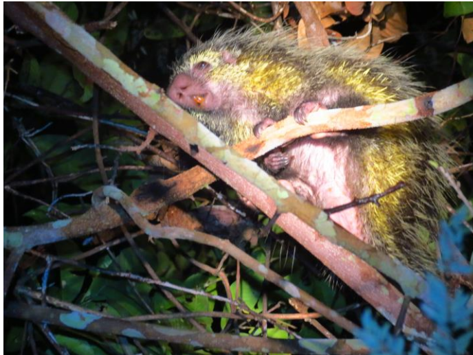
Black-tailed Hairy Dwarf Porcupine

15 May- We went up the Rio Cuieiras to look for the Zigzag Heron nest. We got to see loads of Dusky Parrots, a few Red Fan Parrots, Spangled Cotingas and Red Howler Monkeys in the early morning. We encountered some feeding flocks along the way with Chestnut-rumped Woodcreeper, Black-eared Fairy, Cinereous Antshrike and Wing-barred Piprites. We also had great looks at Green-and-rufous Kingfisher and some Cream-colored Woodpeckers responding to our whistle.