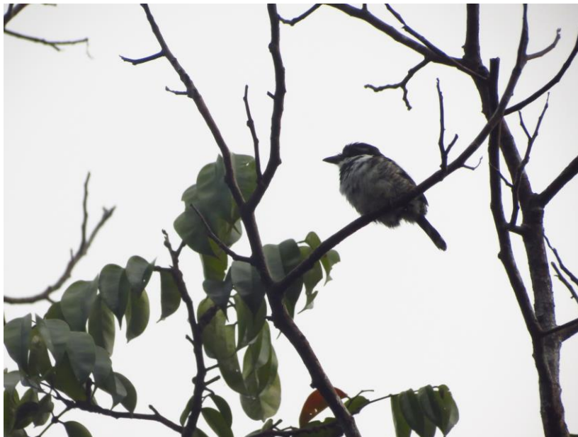
Pied Puffbird

Rosi and Edicarlos chopped through a fallen tree so we could continue up the igarape.