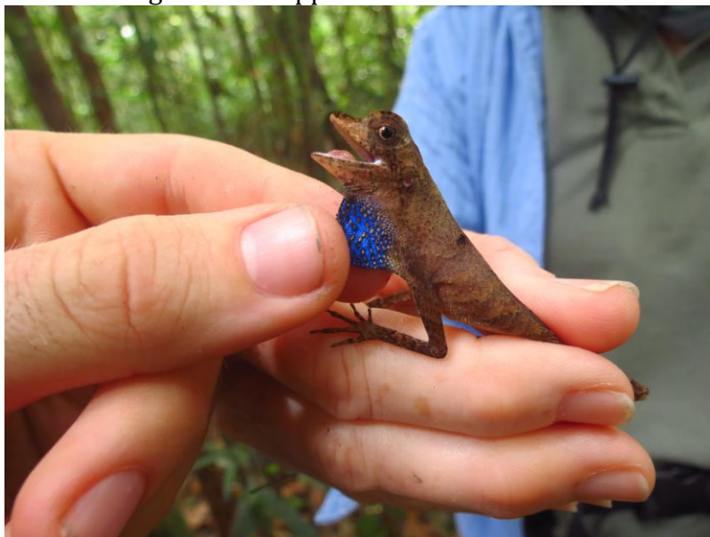
Blue-lipped Forest Anole Anolis bombiceps

After watching the swarm, we walked the trail and saw a Zimmer's Tody-tyrant. We also caught a Blue-lipped Forest Anole.