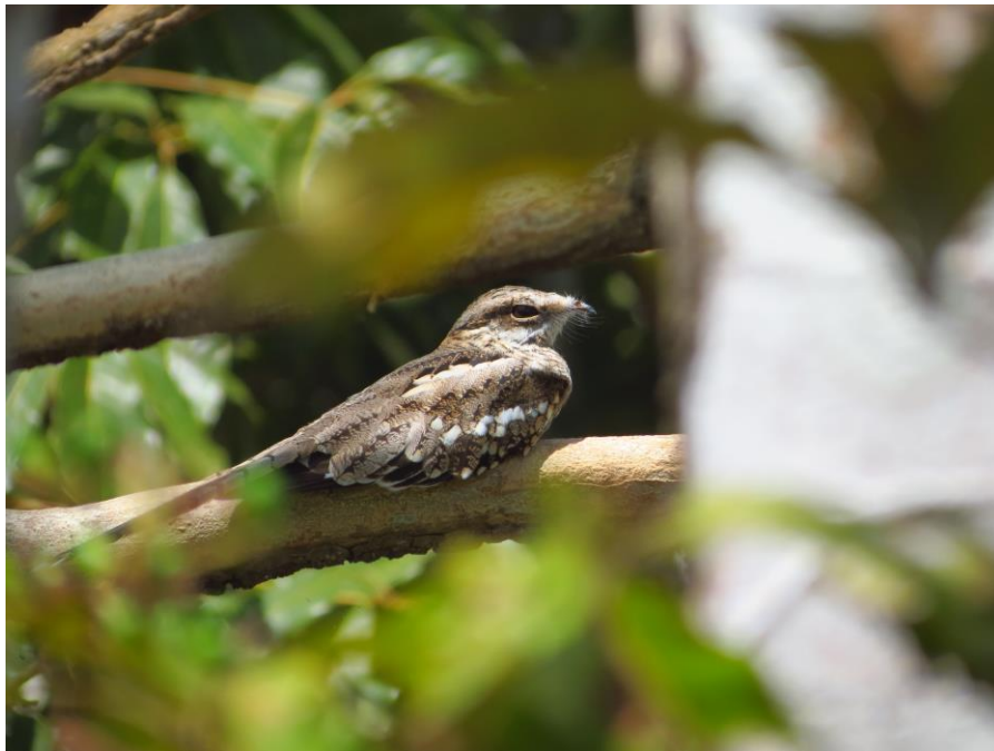
Ladder-tailed Nightjar

We had the Manaus tour in the afternoon and group from Prescott headed to the airport.