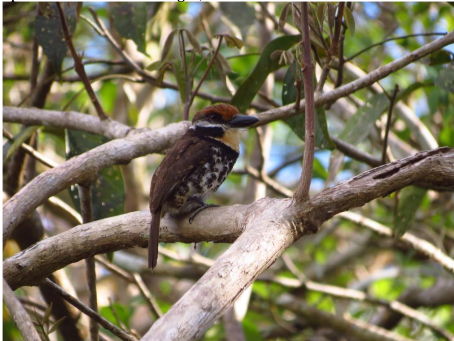
Spotted Puffbird

In the afternoon we canoed around Lago Arrozal and had stunning views of Spotted Puffbird. That night, we sailed to the Rio Amazonas.