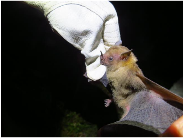
Yellow-shouldered Bat

In the afternoon we explored the Varzea on left bank Abacaxis. We found some Blackish Antbirds, Green-rumped Parrotlets, and Green-tailed Jacamars.