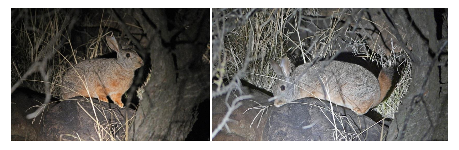
Smith's Red Rock Rabbit