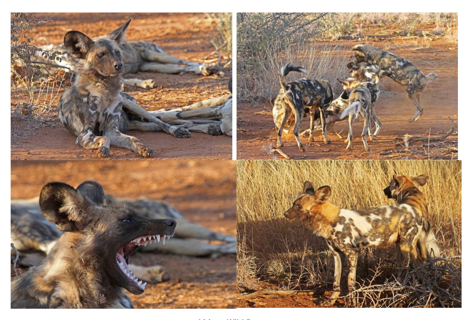
African Wild Dogs