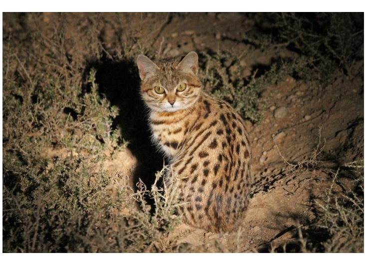
Aardvark Black-footed Cat