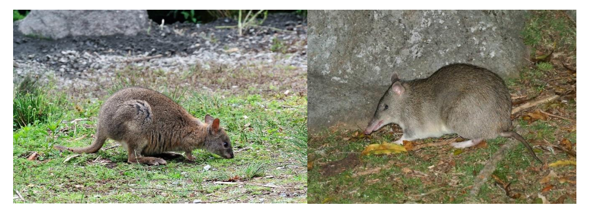
Above left, Red-necked Pademelon; above right, Northern Long-nosed Bandicoot; below left, Common Ringtail Possum, all O'Reilly's Rainforest Retreat, Lamington NP. Below right, Red-necked & Whiptail Wallabies, Laidley

Southern Long-nosed Bandicoot – Up to two around the picninc benches on the opposite side of the road to the reception building. Extremely confiding if you keep the torch beam dim.