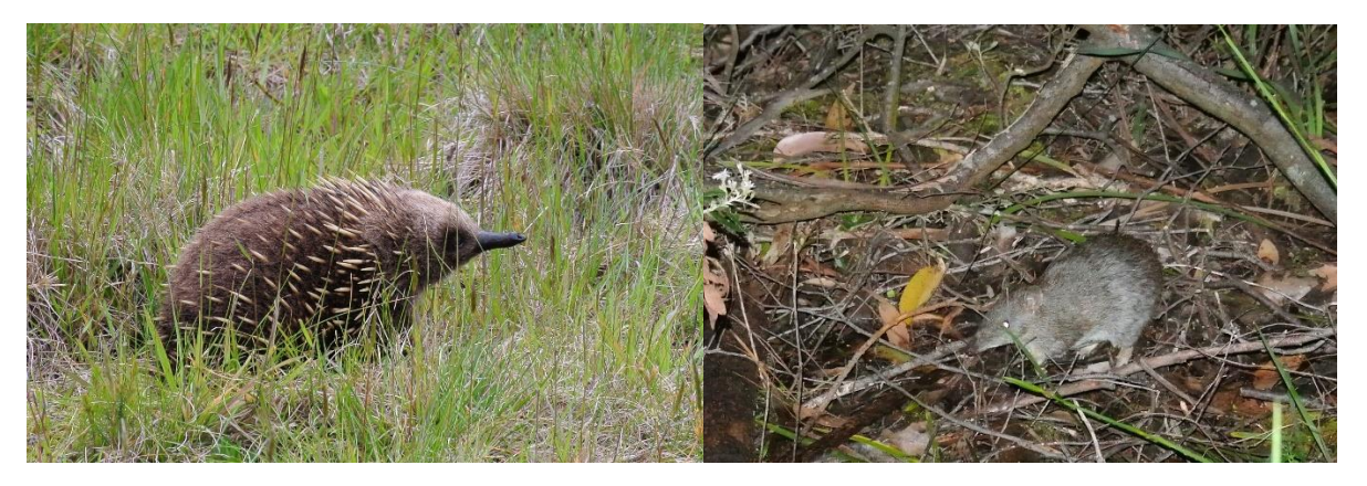
Left, Short-beaked Echidna; right, Southern Brown Bandicoot, both Port Arthur

Humpback Whale – One offshore from Remarkable Cave (south of Safety Cove) on the afternoon of 2<sup>nd</sup>, and three distant animals (though not as distant as the Right Whale) that evening off Devil's Kitchen/Tasman Arch. Certainly the latter sighting was only possible with a spotting scope.