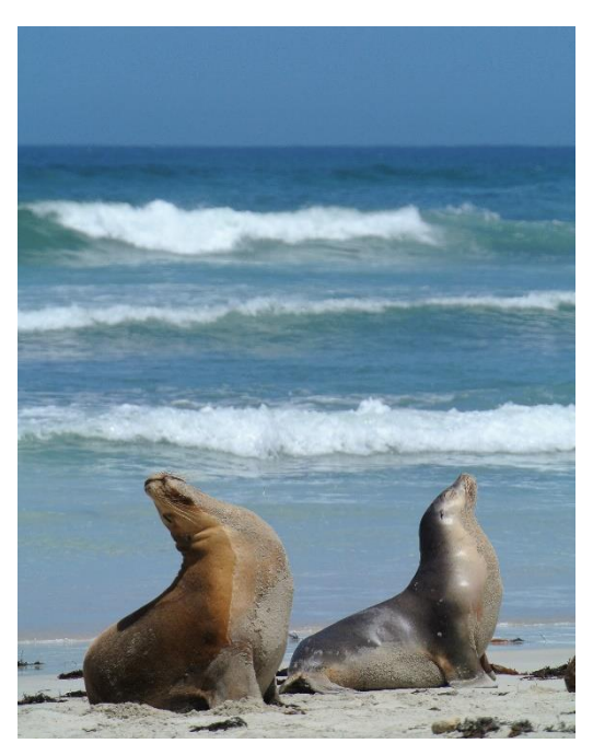
Australian Sea-lions, Kangaroo Island

Common Bottlenose Dolphin – Seven from the ferry shortly before arriving in Penneshaw on 19<sup>th</sup>, and three in the same area on 20<sup>th</sup>. Three (including a very young animal) feeding in the estuary of Pelican Lagoon on the rising tide on 20<sup>th</sup> from <u>Independence Point</u> shelter, quite far from open water.