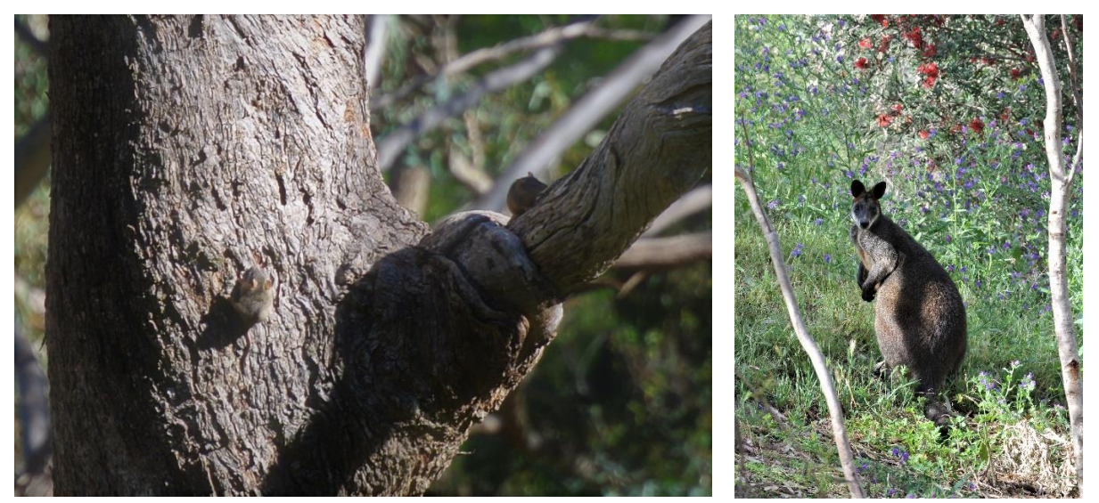
Left, Yellow-footed Antechinus pair, Chewton Railway Dam; right, Black Wallaby, Deniliquin

Eastern Grey Kangaroo – About a dozen Mt Ida track, and two in One Eye Forest.