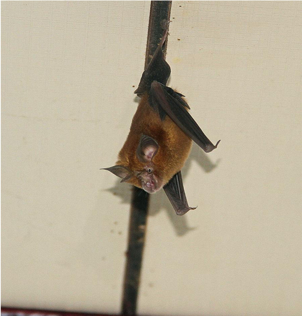
Formosan Lesser Horseshoe Bat

Formosan Rock Macaque/Taiwan Macaque ( Macaca cyclopsis ). Endemic. I thought I'd see more of this species than I did - maybe I was just unlucky - but they were incredibly shy of humans in the areas we were in at least - so no photos unfortunately. They primarily occupy the mountainous areas in the north-eastern and south-western parts of the island. Although the species is thought to have once been associated with coastal areas, it is now largely confined to inland hills because of human activity. First of all on a very wet and foggy afternoon high up in the Dasyueshan Forest we heard a group calling from a very dense woody and scrub covered slope close to the track we were on - we never got to see them. We saw a large adult male around our accommodation at the