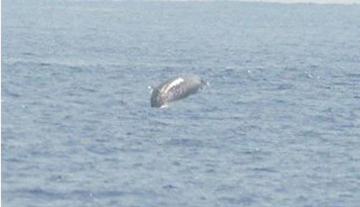
Blainville's Beaked Whale

Reeves's Muntjac ( Muntiacus reevesi ). Dasyueshan Forest Reserve. One heard barking at night and then one seen the following morning by the side of the road.