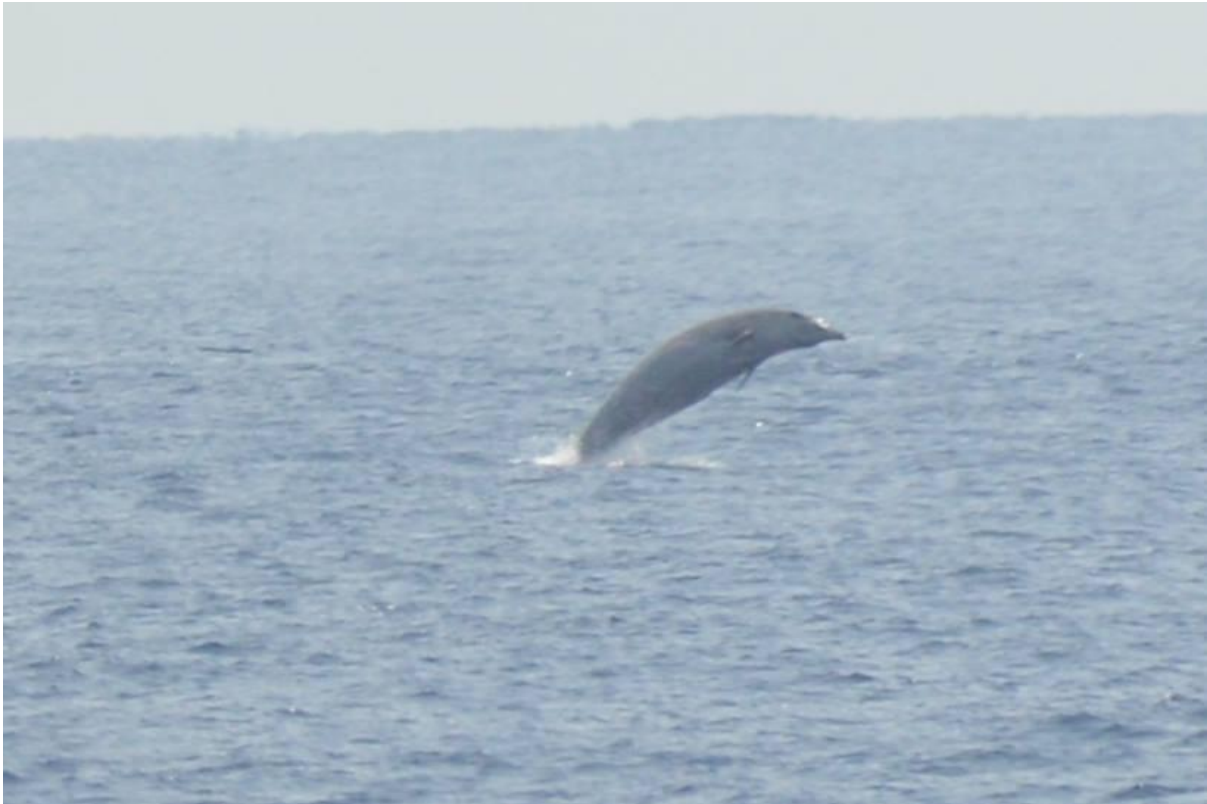
Blainville's Beaked Whale

Blainville's Beaked Whale ( Mesoplodon densirostris ). A pod of 5 or 6 with a couple of them breaching, seen from the ferry as we were approaching Lanyu Island.