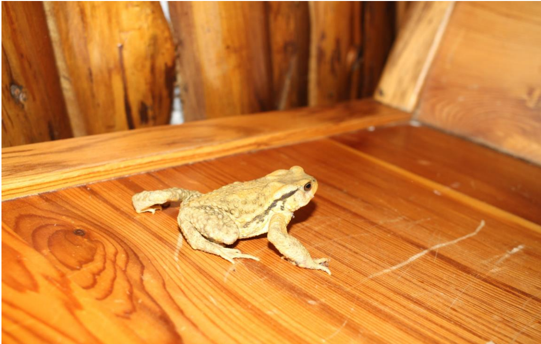
Central Formosa Toad

Common Sun Skink, Taiwan Alpine Skink, House Gecko, Long-tailed Skink, Swinhoe's Tree Lizard, Komai's Slug Eating Snake, Swinhoe's Frog, Central Formosa Toad.