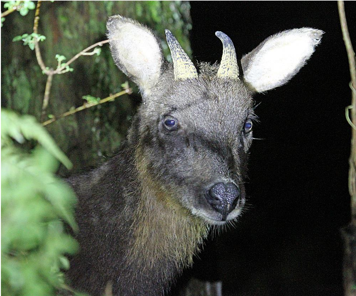
Formosan (Taiwan) Serow

Pallas's Squirrel ( Callosciurus erythraeus ). Relatively common being seen in Dasyueshan Forest, the forest area near Guanghua Village (Alishan Region), and the forest at Xintou (Xeitou) Nature Education Park, Nantou County.