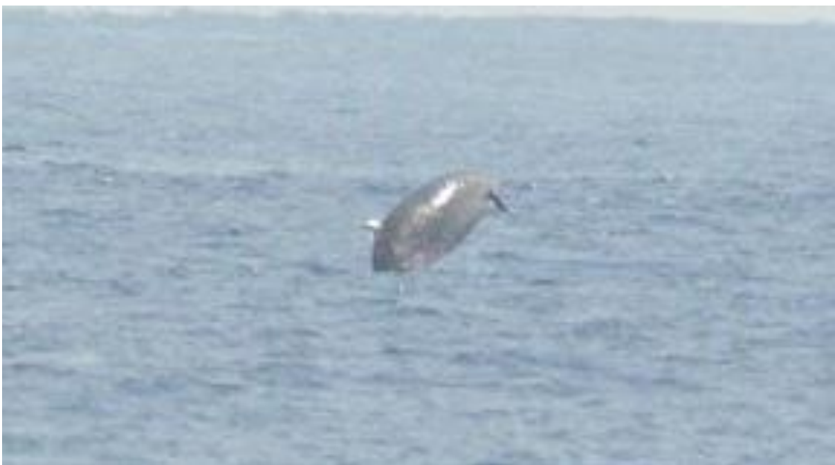
Blainville's Beaked Whale