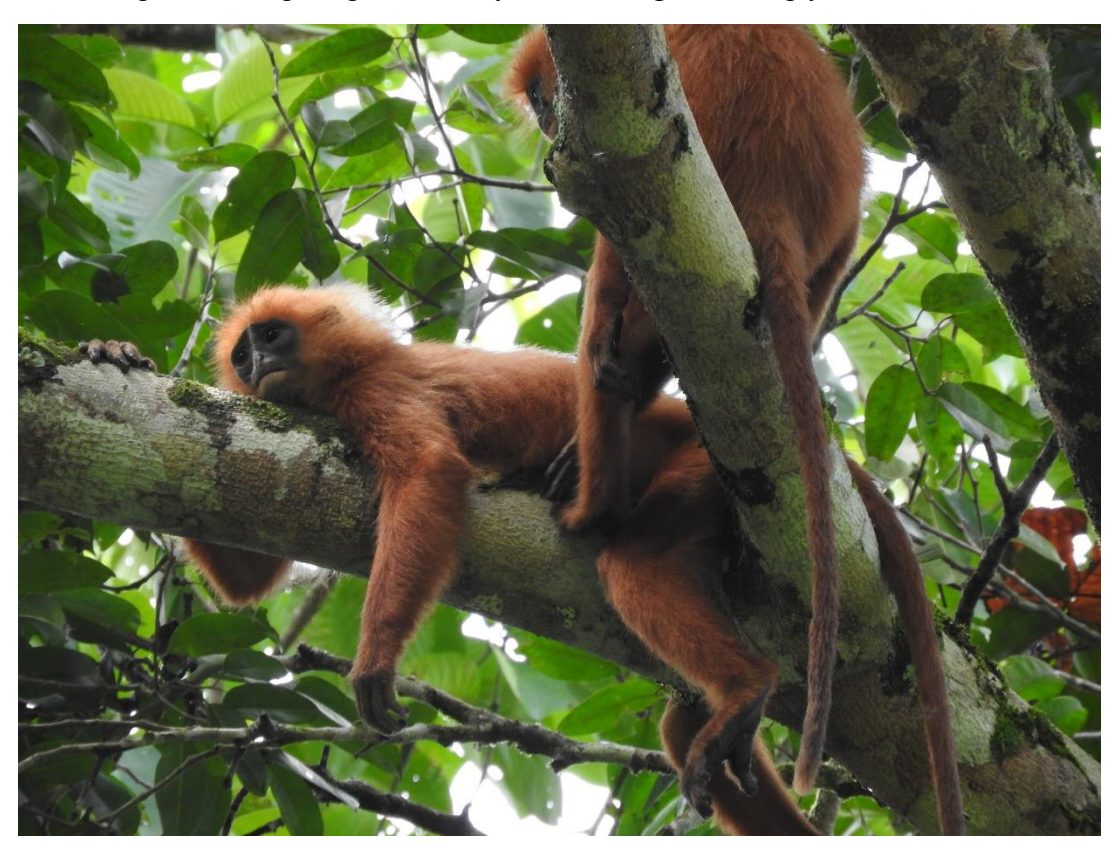
Maroon Leaf Monkey (Red Langur)

While our account is not as detailed on what we saw on each day, I will separate the day treks from the night drive sightings. As always, don't forget to bring your leech socks.