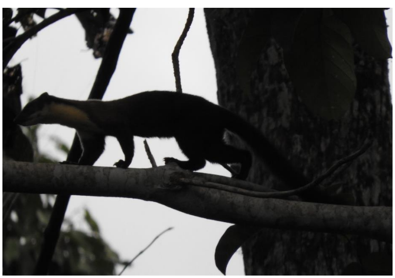
Yellow Throated Marten