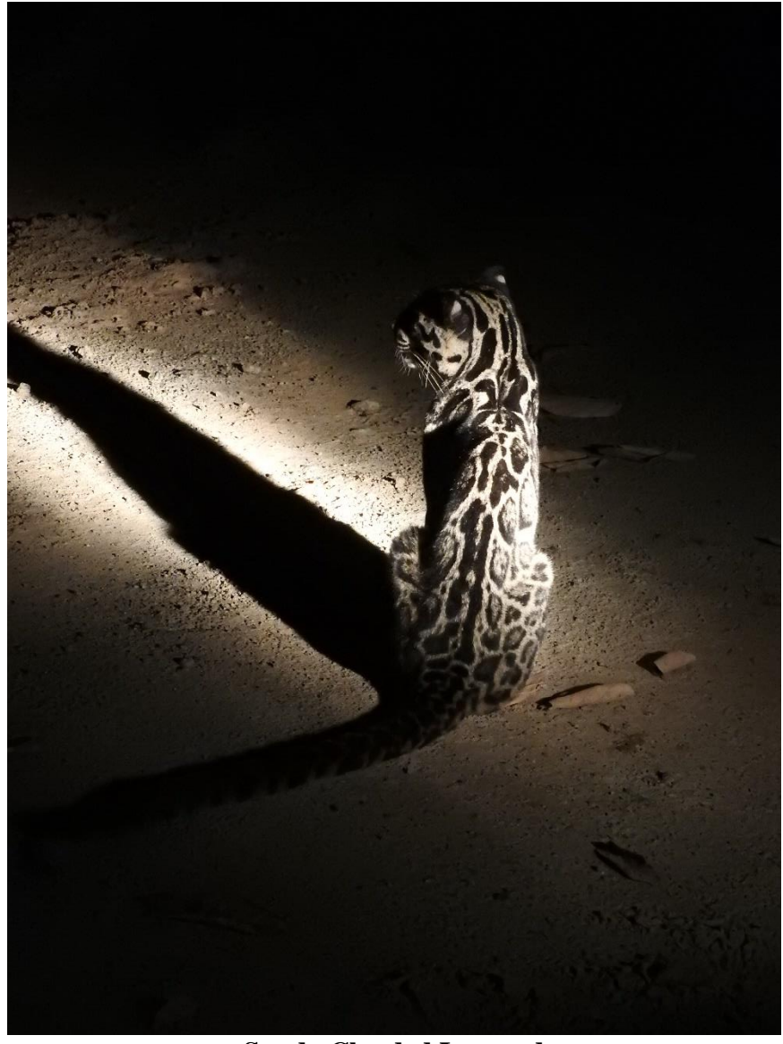
Sunda Clouded Leopard

Our third and last sighting of the Sunda Clouded Leopard was just as exquisite as the first and lasted at least 15 minutes, after which we left it in peace not to overstay our welcome.