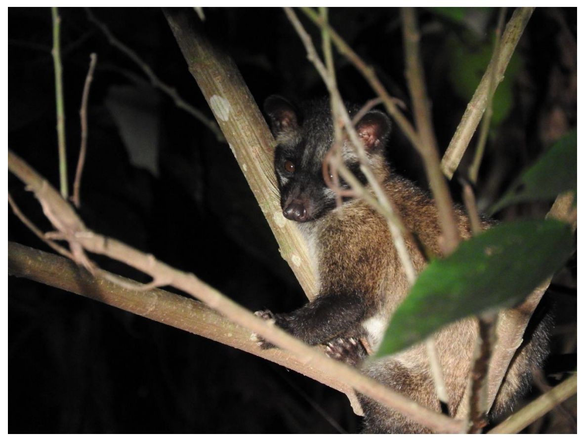
Island Palm Civet

In the very first hour, we drove towards the entrance of the park and saw Mousedeer, juvenile Sambar Deer, a Moon Rat and Red Giant Flying Squirrels.