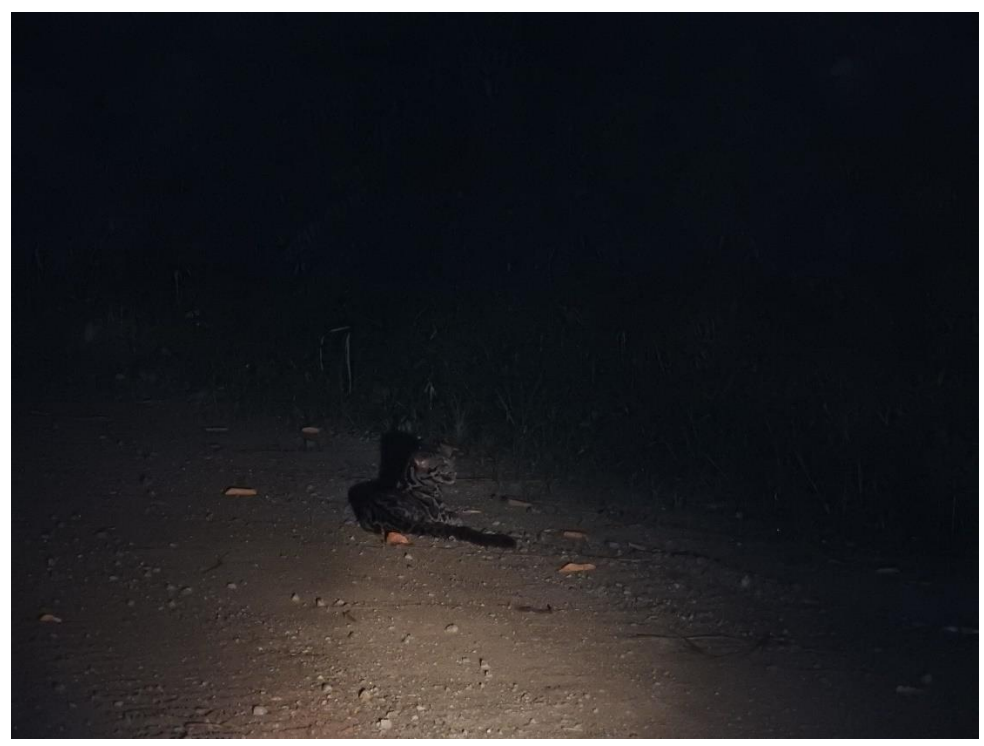
Our very first glimpse of the Sunda Clouded Leopard

After about an hour, we came to a sudden stop. None of us said a word, as we saw a very distinct shape on the road, aided by the moon's glow. It was unmistakable: a Sunda Clouded Leopard!