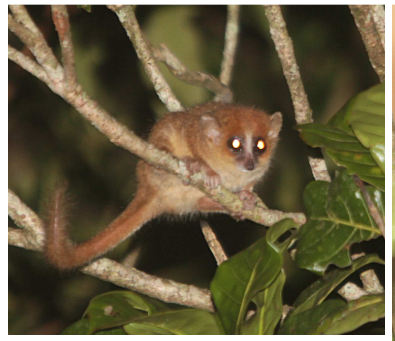
Andasibe Mouse Lemur 1