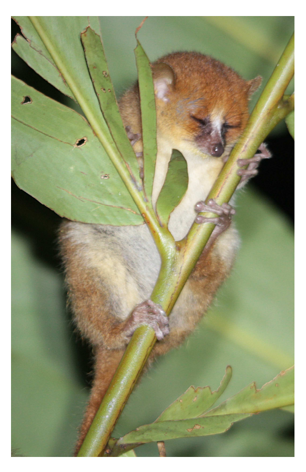
Masoala Mouse Lemur 1