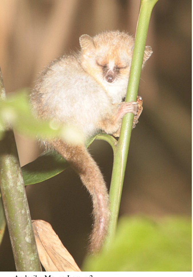
Andasibe Mouse Lemur 3