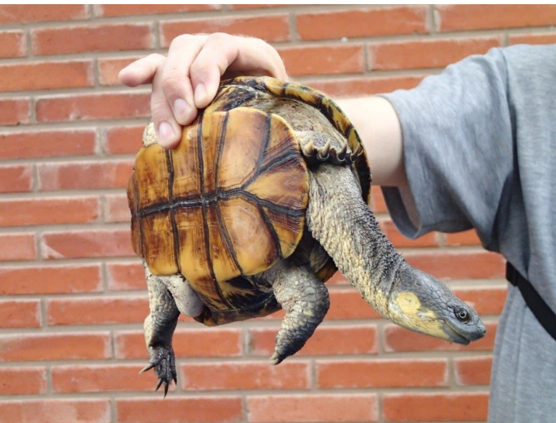
Pantanal Snakeneck Turtle (R. Foster)