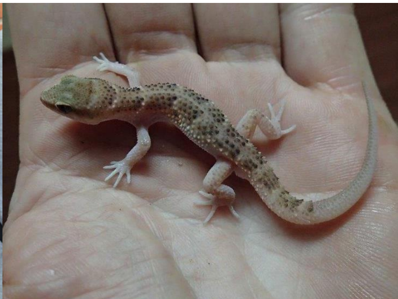
Chaco Straight-toed Gecko