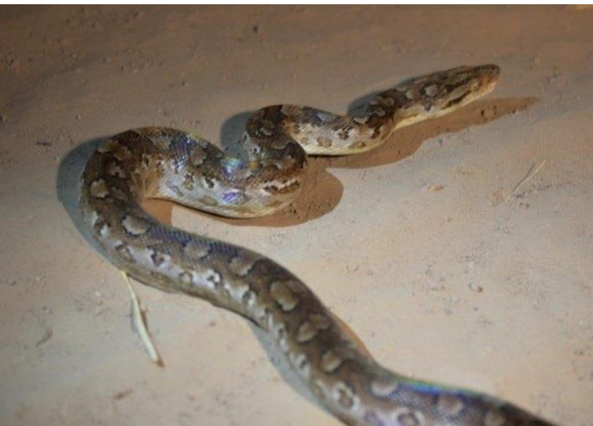
Chaco Rainbow Boa