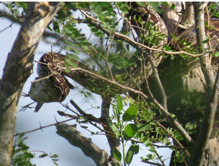
Boa Constrictor with Lark-like Brushrunner