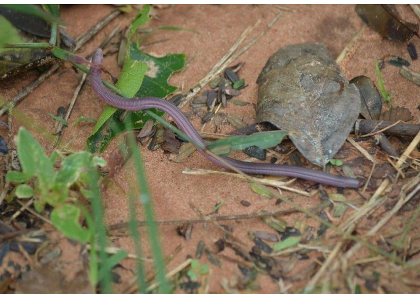
Cercolophia (T. Armstrong)