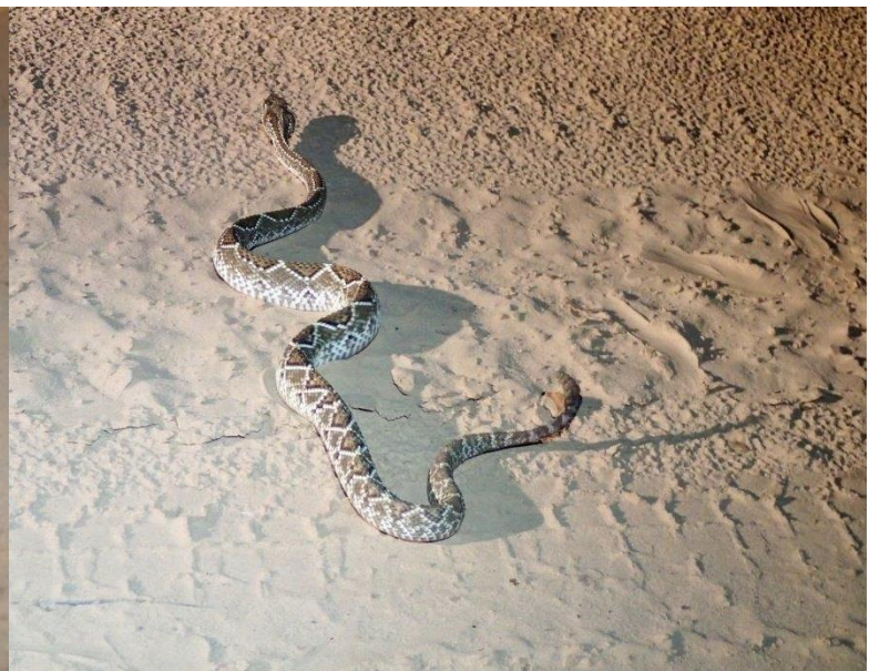
Tropical Rattlesnake (R. Foster)