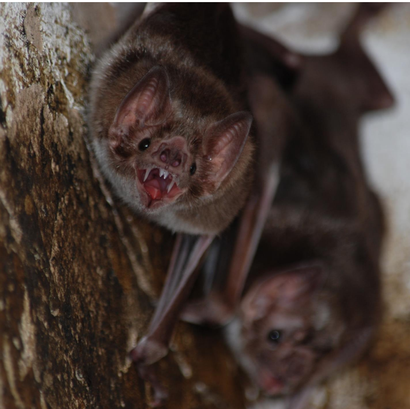
Common Vampire Bat