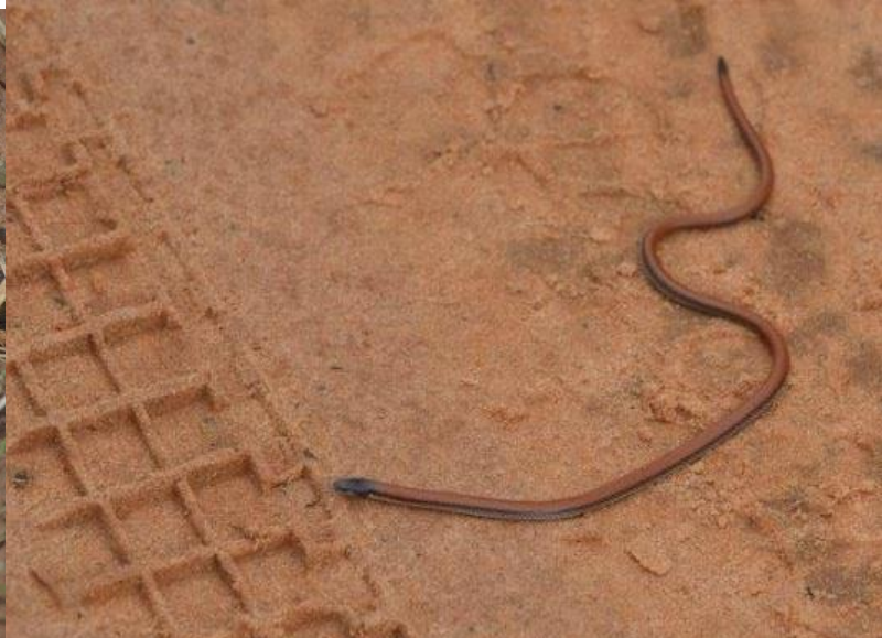
Variable Blackhead (T. Armstrong)