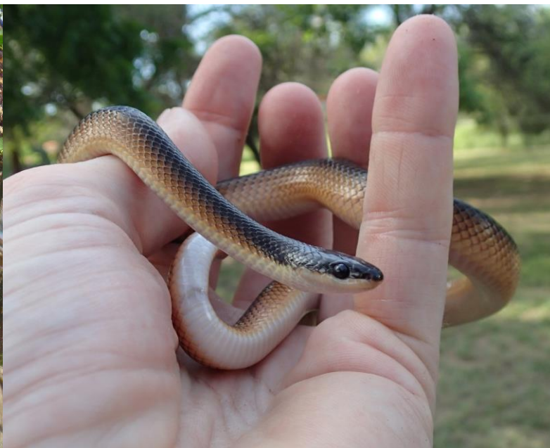
Bicoloured Mussurana