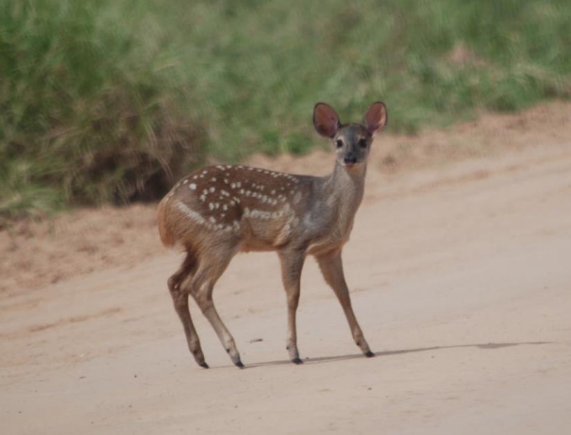
Grey Brocket Deer fawn (I. Thompson)