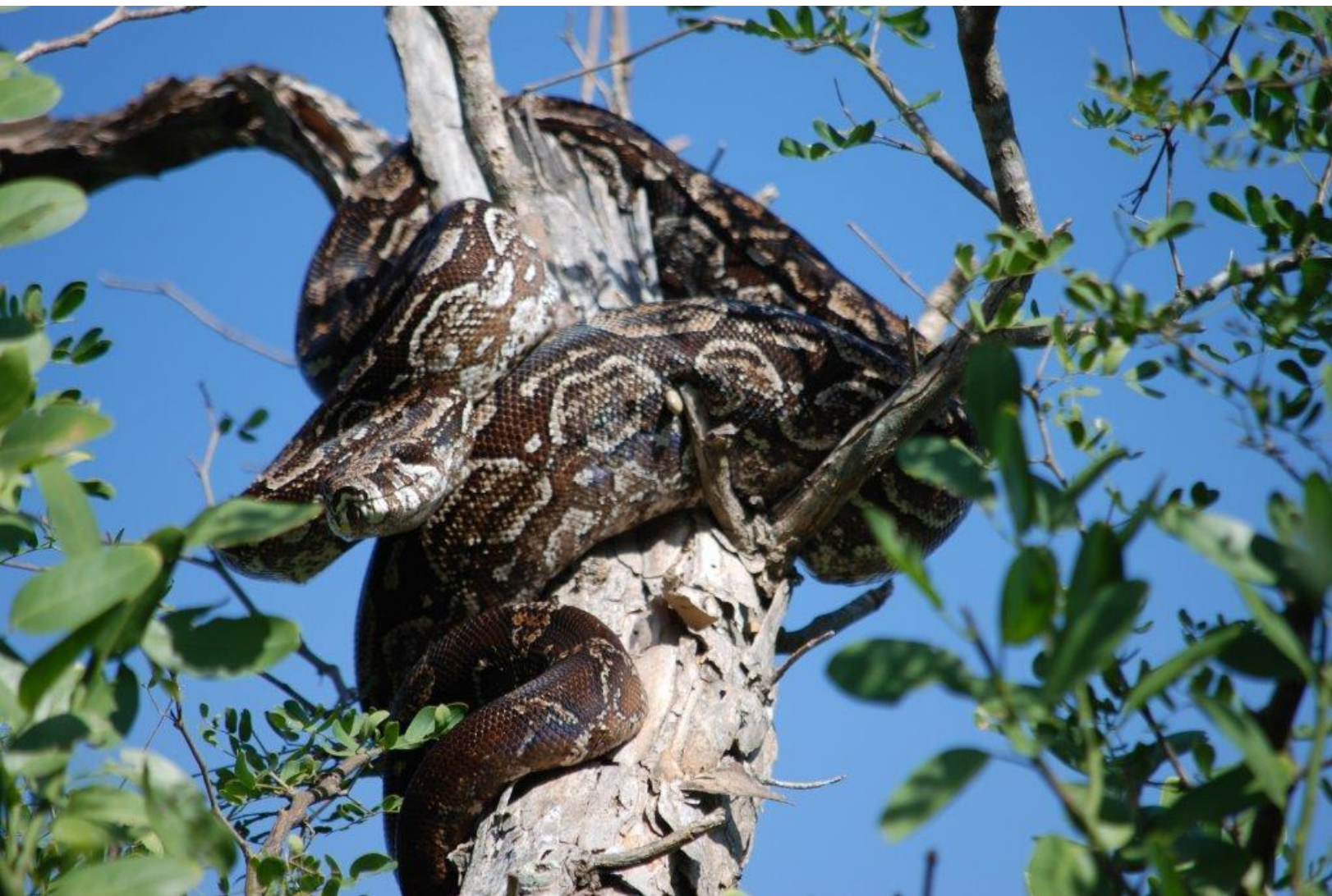
Boa Constrictor