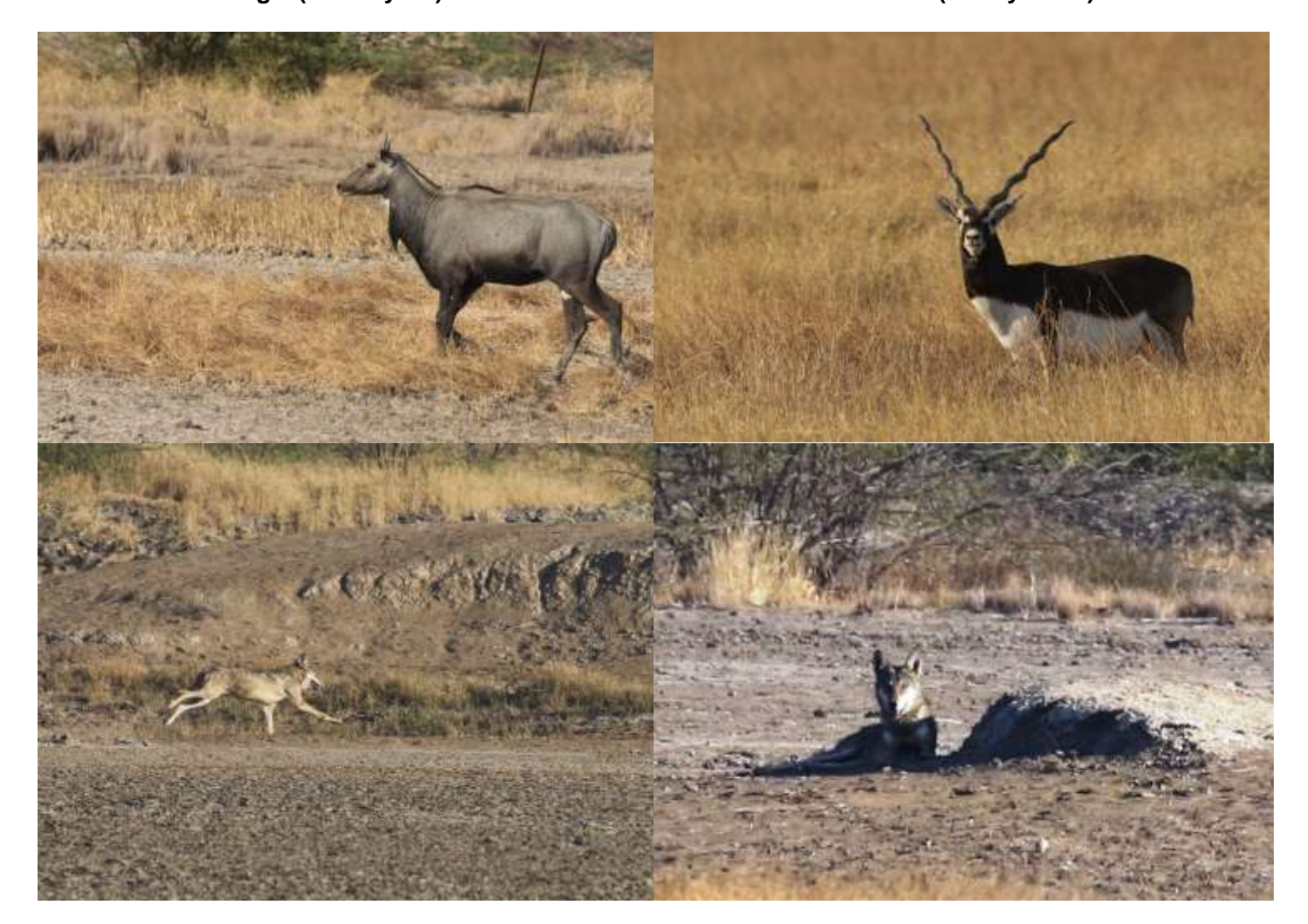
Indian Grey Wolf (Cat Rayner)

The second morning drive started frustratingly when the gate man turned up late and we were delayed by 20 minutes. Fortunately it turned out to be to our advantage. Having spent some time unsuccessfully staking out a Striped Hyaena den the first jeep was just driving off when their guide spotted an Indian Grey Wolf trotting across the grasslands towards the den. We headed back to join the second jeep and were able to watch the wolf as it headed across towards the hyaena den, grabbed part of a carcass and headed off across the grasslands. Moments later a Striped Hyaena emerged from the den and gave us prolonged views as it walked out across the grasslands. To add to the fun a distant Indian Fox appeared as we watched the hyaena departing. An excellent 20 minutes of mammal watching. The rest of the morning drive was not surprisingly quiet by comparison although another Jungle Cat was seen in the wetlands section and the afternoon drive produced another (distant) Jungle Cat in the grassland section of the park. An evening drive through cultivated áreas to the west of the park produced Asiatic Jackal and Indian (Black-naped) Hare.