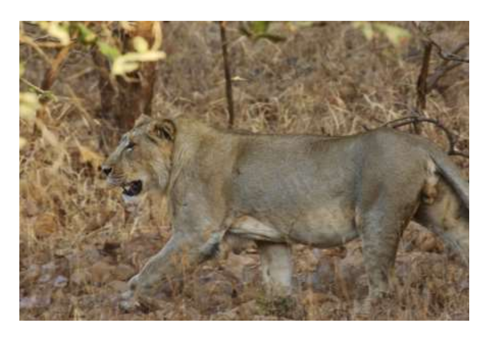
'Asiatic' Lion (Cat Rayner)

Birding in the park was reasonably productive with regular stops for Changeable Hawk Eagles, Crested Serpent Eagles and staked out Indian Scops Owl, Spotted Owlet and Indian Thicknee with a good range of other species as the supporting act. Marsh Mugger Crocodiles were also seen at one of the dams in the park.