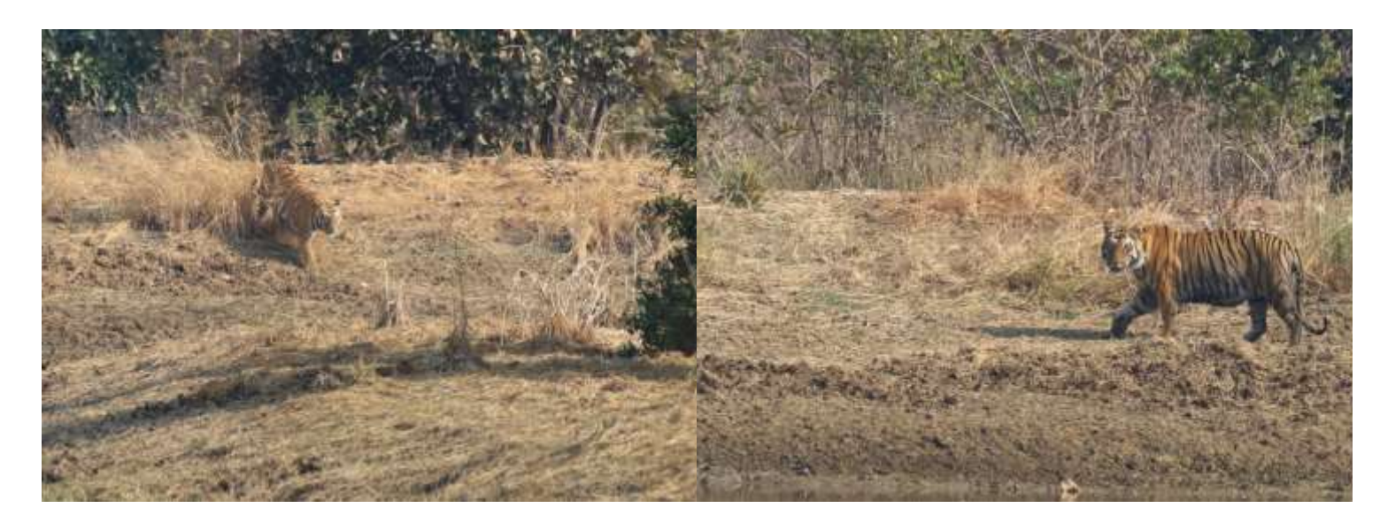
Tiger (Cat Rayner)

Fortunately Tigers were more obliging. On the first morning drive a large male appeared at the back of a waterhole and proceeded to lie in the water for almost half an hour before it disappeared back into cover with one of our jeeps having views of it dragging a carcass deeper into cover. The following morning one of our jeeps had brief views of two cubs crossing a track, their mother having already crossed ahead of them, before all three jeeps saw the first day's male at a waterhole close to where it had been seen the previous morning. That afternoon while the male had dissapeared a female had amazingly chosen to lie up in the shade on an island at the same waterhole. Finally a male was seen by two of the vehicles crossing one of the jeep tracks on the final morning although sadly this individual demonstrated the folly of the approach of the drivers. Several vehicles were patiently waiting for it as it had been seen by another jeep about 15 minutes earlier. When it walked out onto the track no more than 30-40 metres ahead the first two jeeps rushed forward blocking the view of everyone behind them and flushing the tiger. Marvellous!