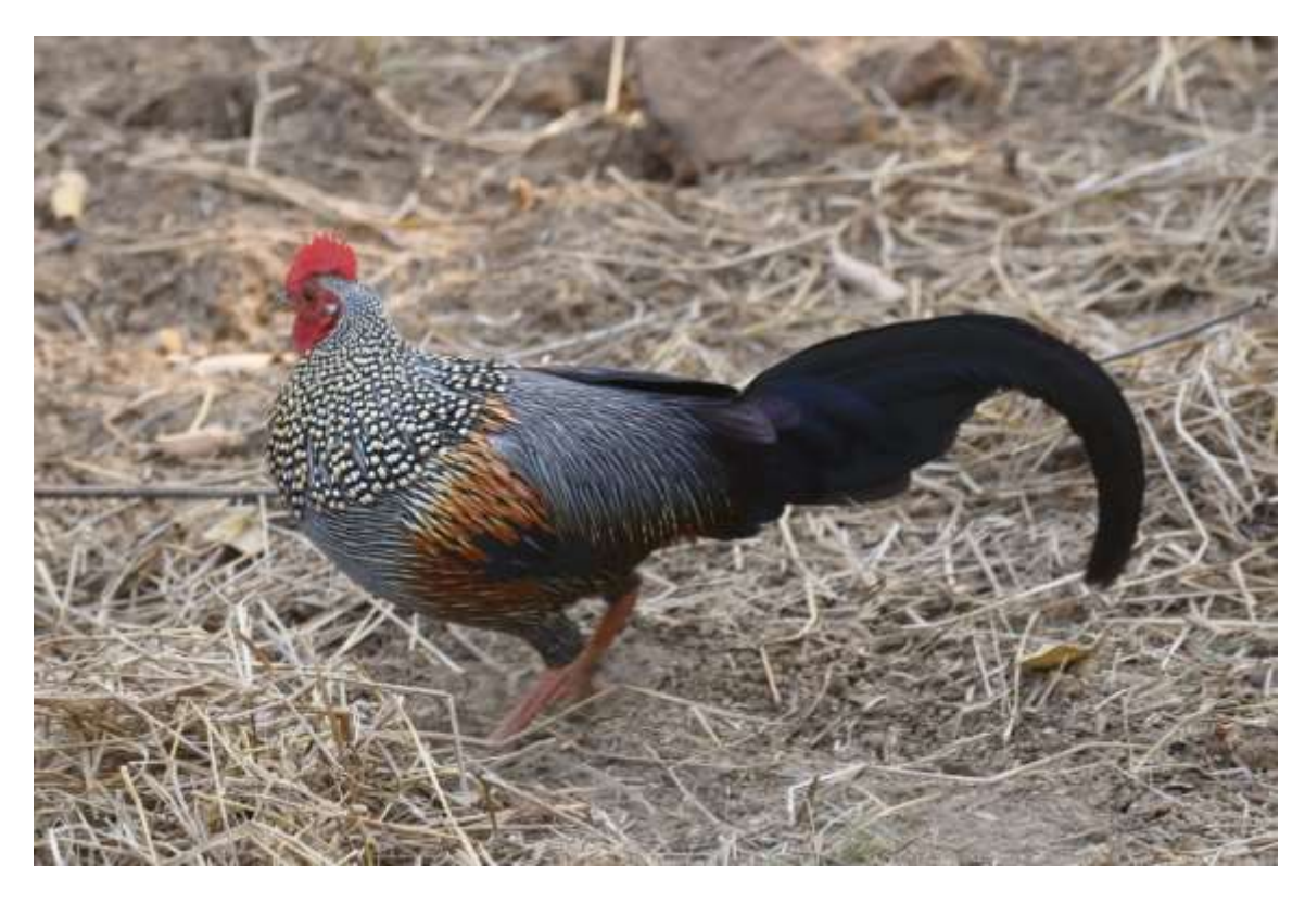
Grey Junglefowl (Kenny Ross)

Reptiles and amphibians seen included several Marsh Mugger Crocodiles and an Indian Rat Snake and back at the lodge we found Indian Bullfrog and Indian Tree Frog. The grounds of the lodge and the adjacent lake produced some interesting birding but the star performers at the lodge were the presumed Small Indian Field Mouse which left tooth marks on bars of soap in several of the tents and even stole the soap on some occasions. Interestingly the lodge were using soap as bait in mouse traps in the tents? Most remarkable was one particularly clever individual which was brazen enough to emerge during the day and somehow managed to remove the lid on a tube of Pringles by gnawing around the edge without tipping the tube over! An amazing feat!