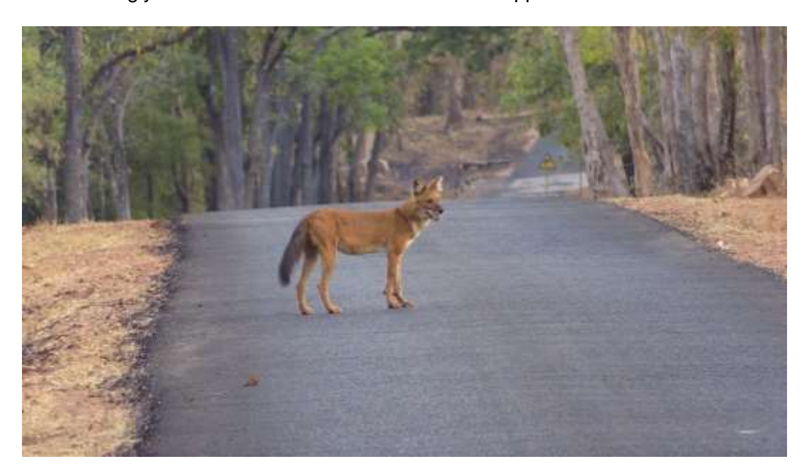
Dhole (Richard Webb)

Dhole provided slightly more obliging although only two of the three jeeps scored. Having narrowly missed a pack of Dhole hunting on the third morning one of the jeeps came across a lone male on the road through the buffer zone that evening and had great views of it along the road. Another jeep saw a couple of individuals at the back of a pack that had crossed the same road nearer the gate a few minutes later. Amazingly the first jeep encountered the same male the following evening and had prolonged views but despite trying to track down Cat and Kenny were frustratingly unable to do so but their efforts were appreciated.