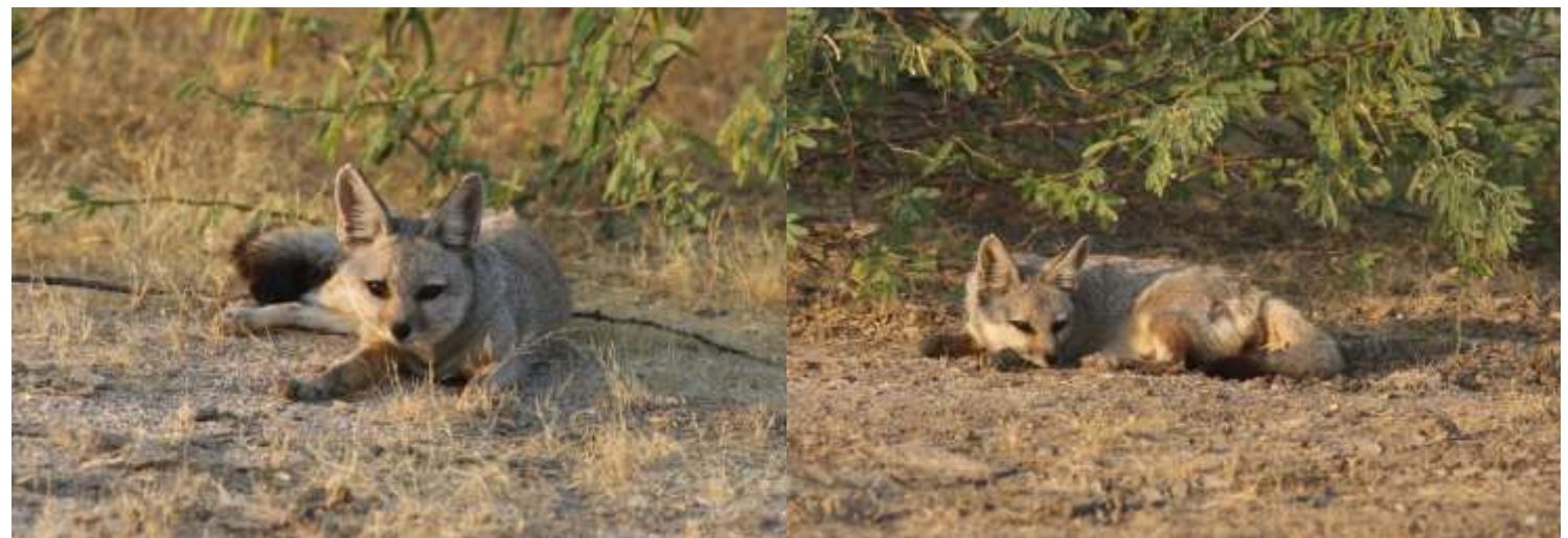
Indian Fox (Cat Rayner)

The following morning saw us back out in the same área with one jeep first encountering a Red (Desert) Fox and then having sensational views of a Striped Hyaena alongside the vehicle. Sadly it had disappeared having leapt across a gully before the second jeep arrived. After the excitement of the hyaena the same vehicle had the frustration of a puncture. Other mammals seen included more Asiatic Wild Ass and Nilgai .