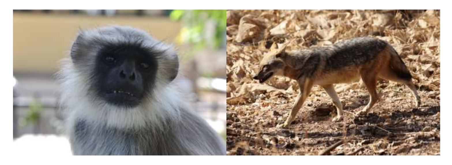
Hanuman Langur