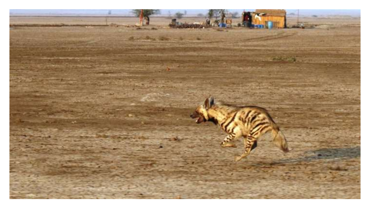
Striped Hyaena (Cat Rayner)

Bird wise the highlight was a MacQueen's Bustard, a species missed in 2015, although the 'hyaena jeep' also had a superb Rain Quail. Both jeeps encountered at least three Short-eared Owls, a number of Chestnut-bellied Sandgrouse and a nice variety of waterbirds including our first Cotton Pygmy Geese.