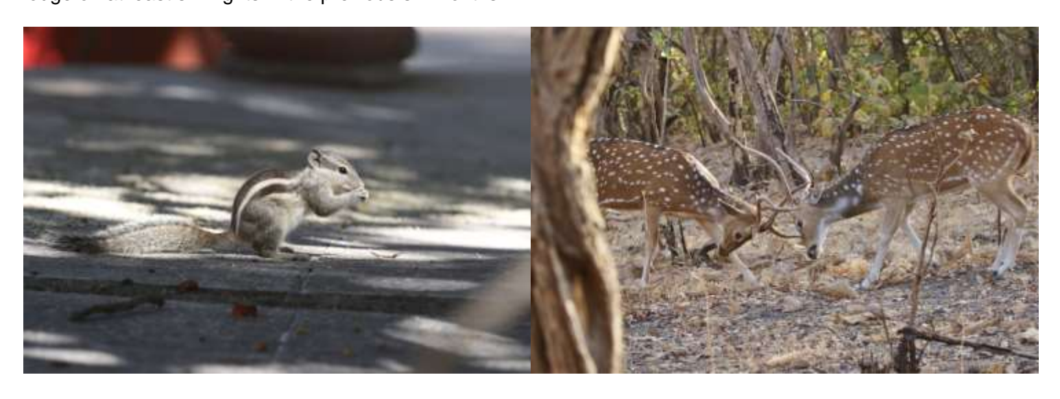
Five-striped Palm Squirrel (Cat Rayner)

We attempted one spotlighting session in the gounds of the lodge and did have a single Indian (Black-naped) Hare and Jungle Nightjar, while remaining alert to the fact that single lions had been seen in the grounds of the lodge on at least six nights in the previous six months.