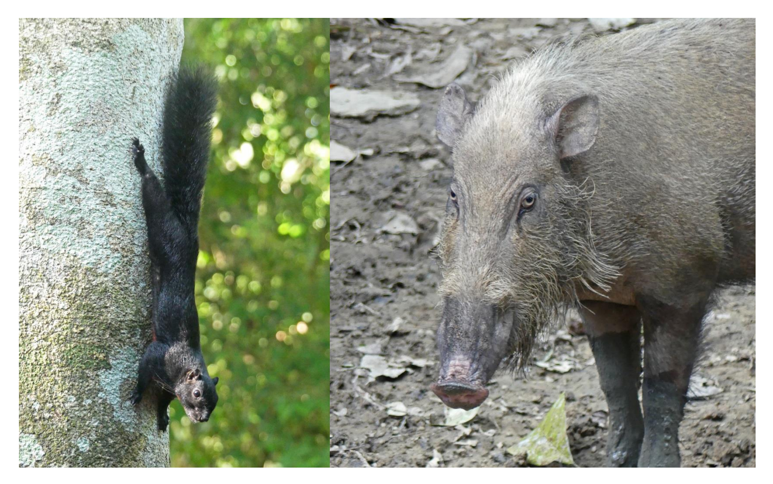
Prevost's Squirrel and Bearded Pig

After lunch and a period of recuperation at the lodge where sadly we were unable to find any roosting bats this year we were back on the river for a long late afternoon/early evening cruise. As we headed downriver we found another massive Bornean Orangutan although again it was somewhat distant along with our first Storm's Stork and a nice Wallace's Hawk Eagle along with both White-bellied Sea Eagle and Lesser Fish Eagle. Continuing downriver past the multiplicity of lodges in the Sukau área we eventually reached our destination where we found a superb herd of at least 27 Bornean Pygmy Elephants , a distinctive sub-species of Asian Elephant, feeding along the bank of the main river. We had a thoroughly enjoyable 30 minutes watching the elephants before heading back upriver with several stunning White-crowned Hornbills giving us good views.