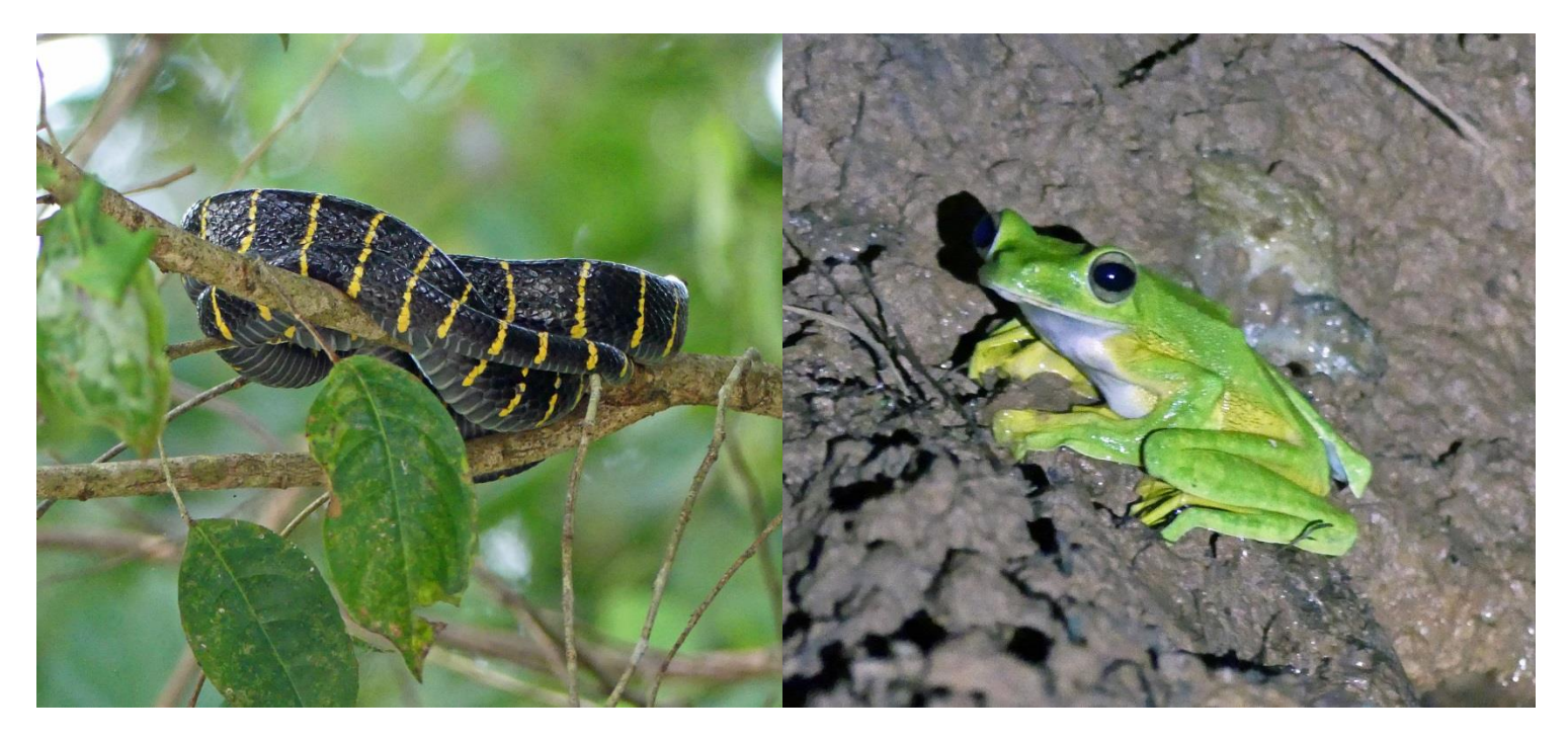
Mangrove Cat Snake and Wallace's Flying Frog