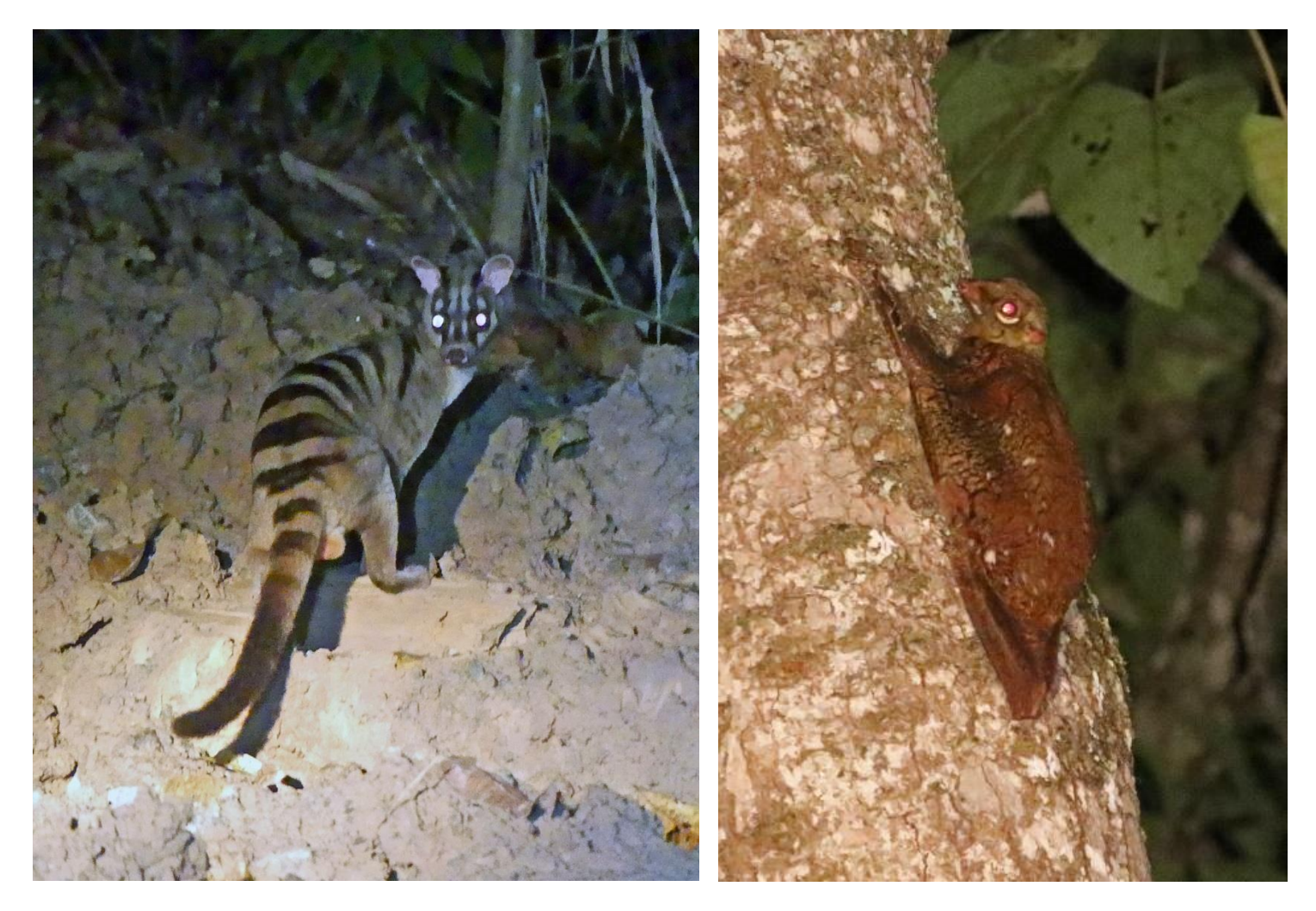
Banded Palm Civet and Bornean Colugo

On our second night two Hose's Pygmy Flying Squirrels put in brief appearances although one posed briefly on the side of a tree.