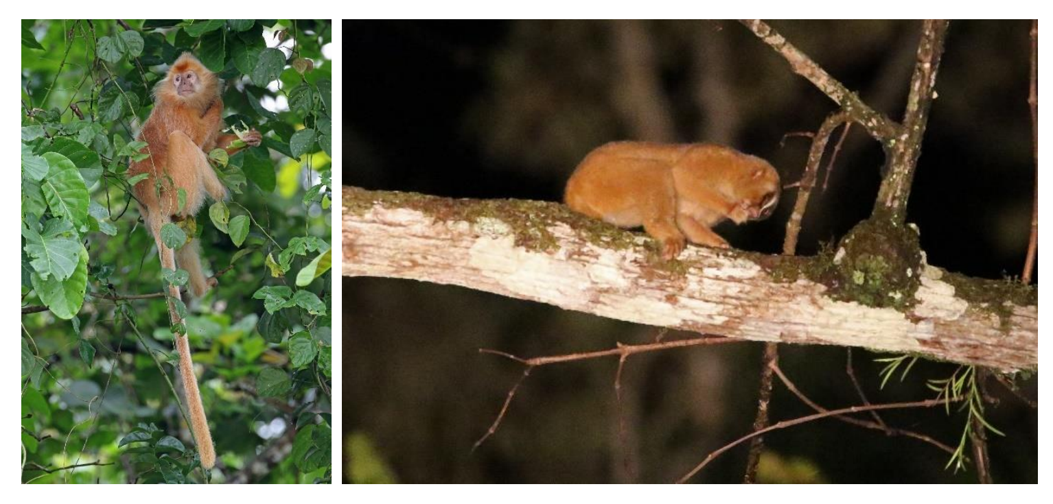
Silvered Langur and Philippine Slow Loris