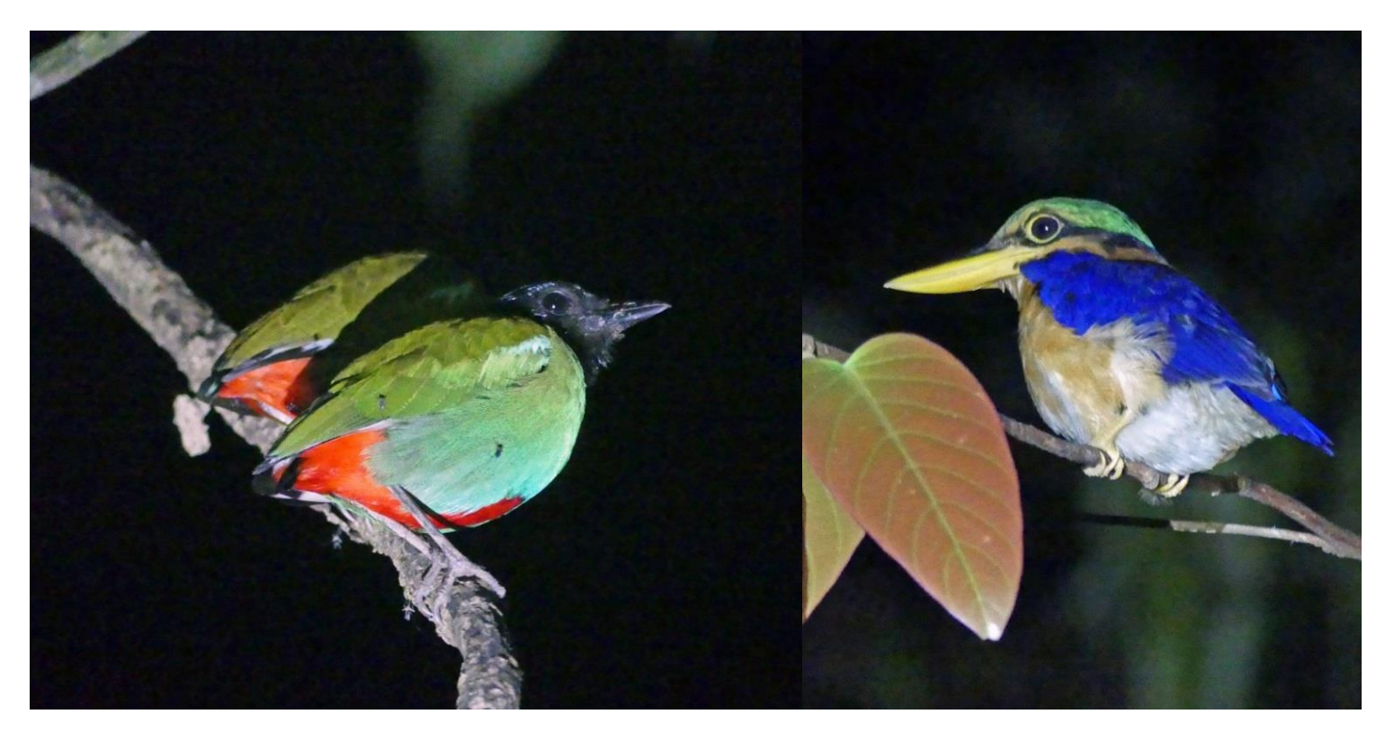
Hooded Pitta and Rufous-collared Kingfisher