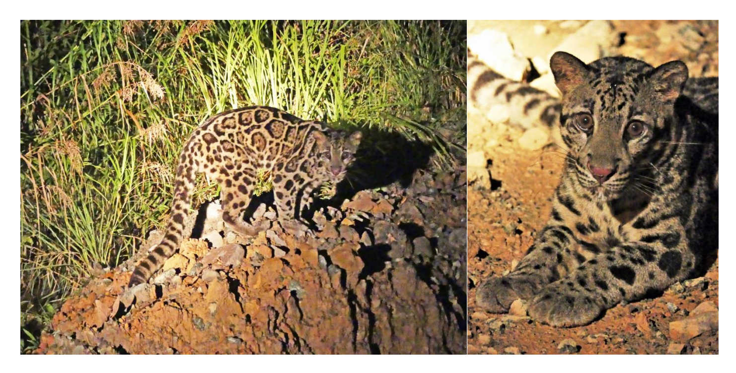
Sunda Clouded Leopard