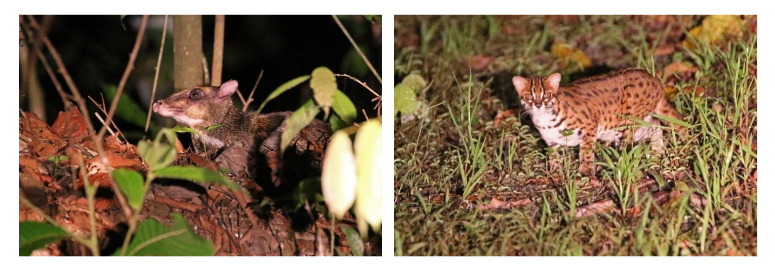
Lesser Mousedeer and Sunda Leopard Cat