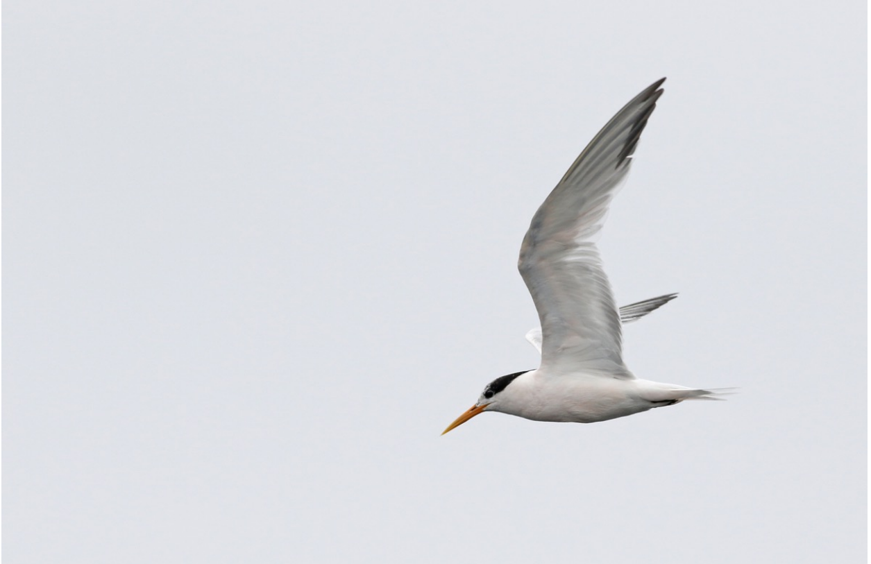
Elegant Terns were common around the coast (above) Clark's Grebe in the foreground & Western Grebe behind (below)