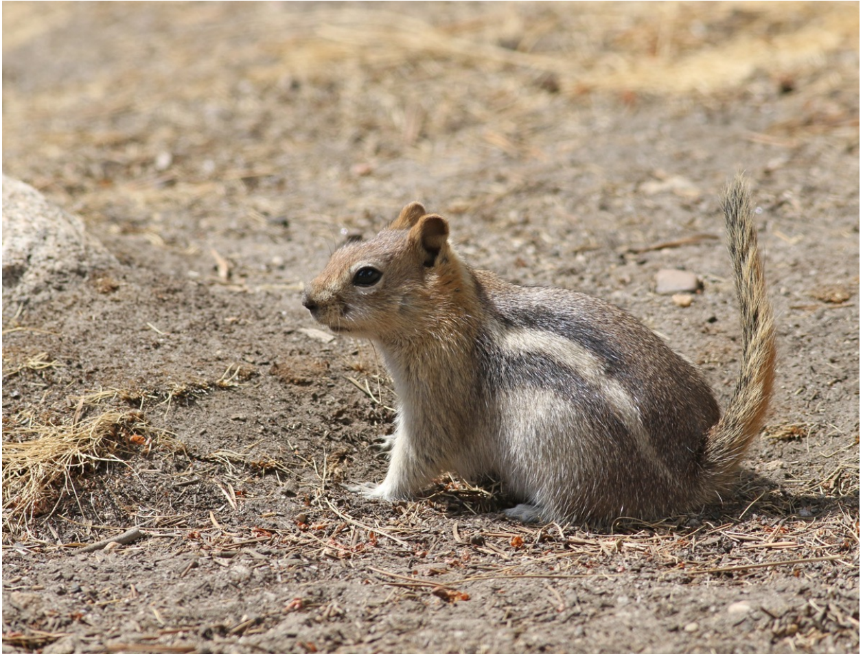
Golden-mantled Ground Squirrel in Yosemite NP (above) Douglas's Squirrel in Sequoia NP (below)