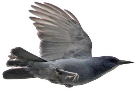
Pinyon Jay (above) Wise Birding Group in Sequoia NP