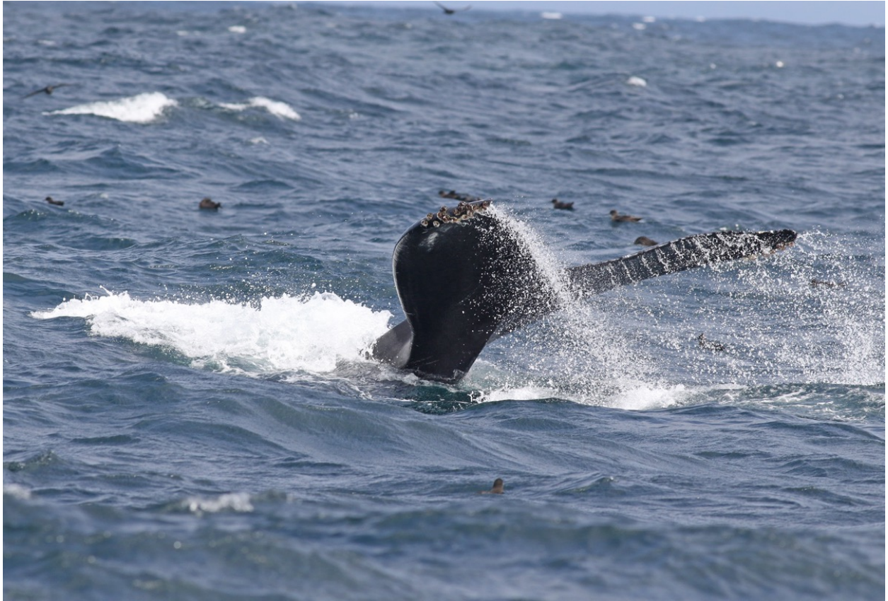
It was great year for Humpback Whales in Monterey Bay this year with numerous sightings of many different animals