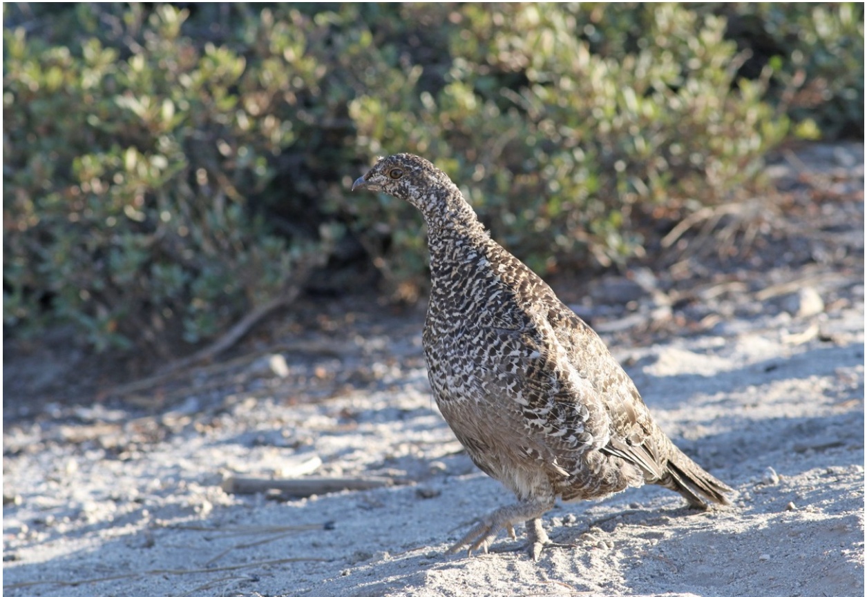
This Sooty Grouse was one of a group of six birds in Yosemite (above) Greater Roadrunner showed well on the Old Hernandez Road (below)