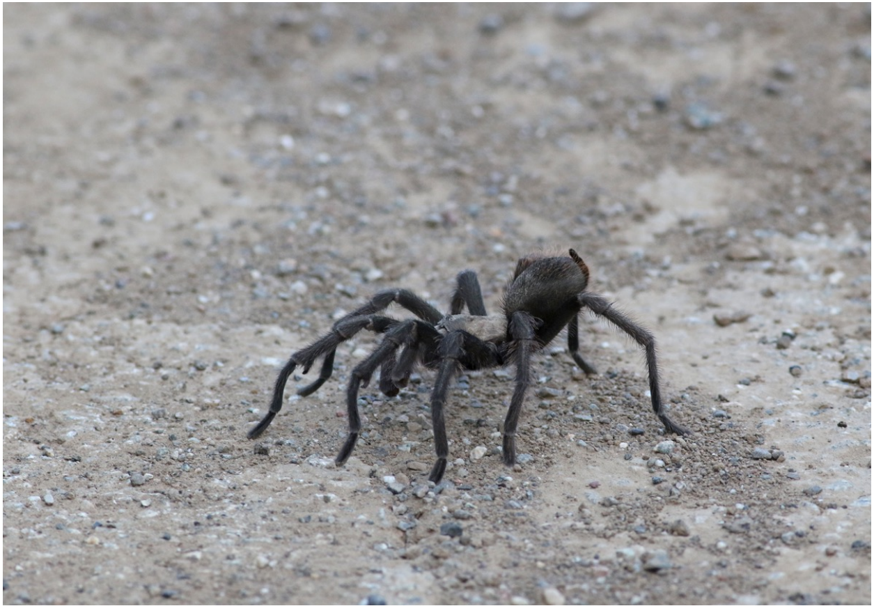
Wandering Tarantula (above) and Gopher Snake (below)