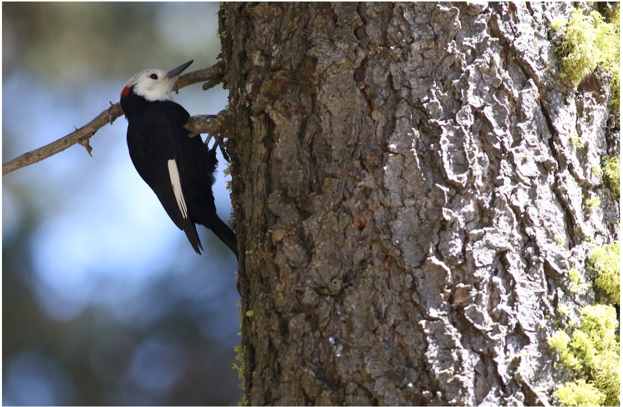
White-headed Woodpecker in Sequoia NP (above) One of the many meadows in Yosemite NP (below)