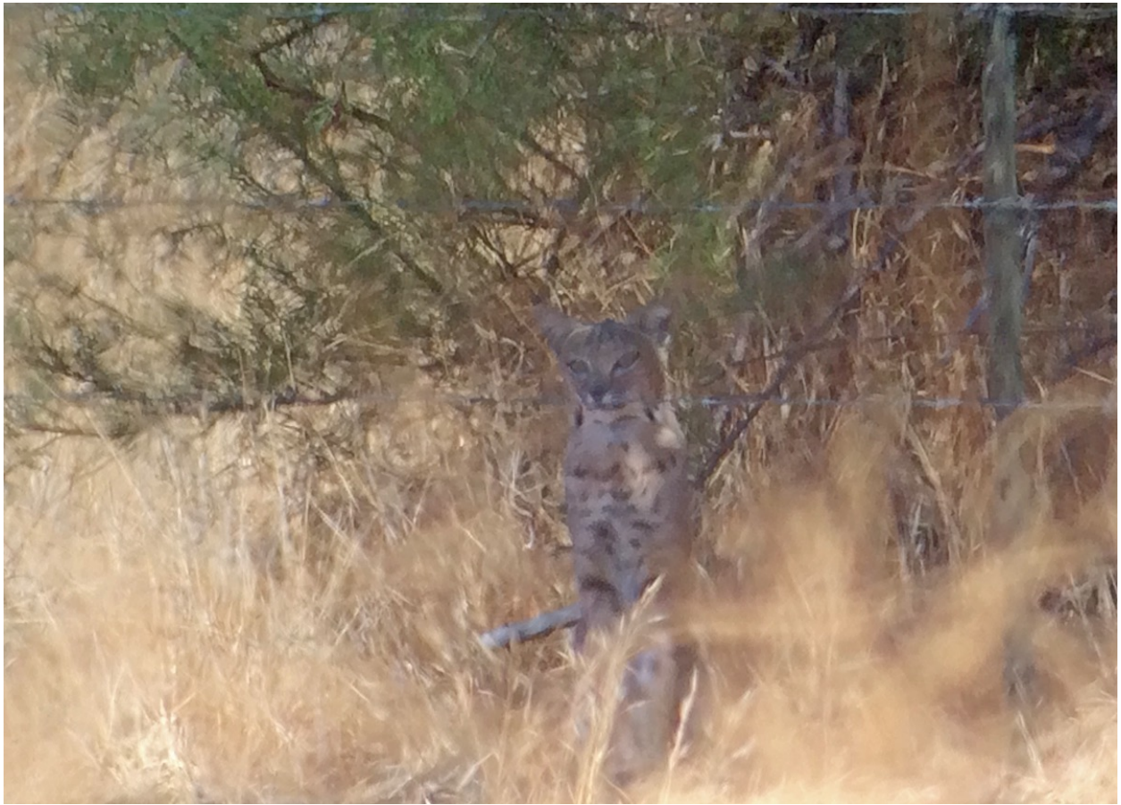
This young Bobcat showed very well as it hunted Rabbits off the Old Hernandez Road