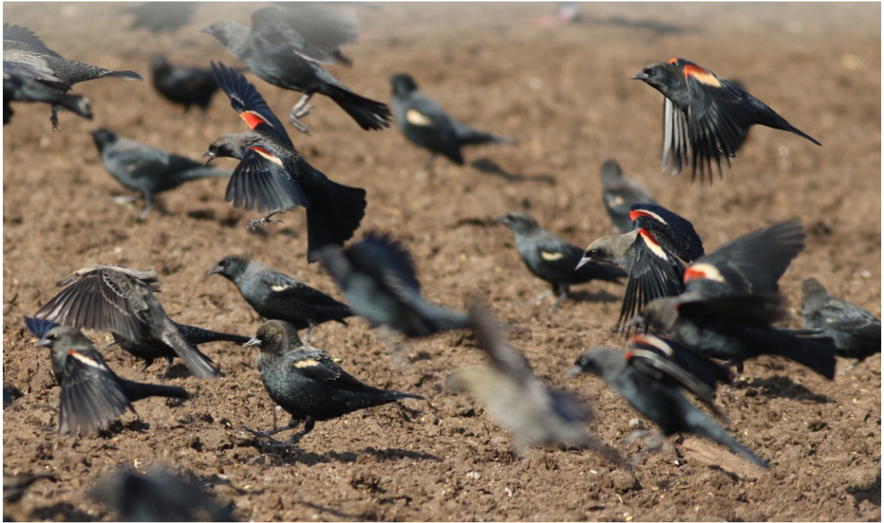
Red-winged Blackbirds at Moonglow Dairy (above) and Anna's Hummingbird (below)