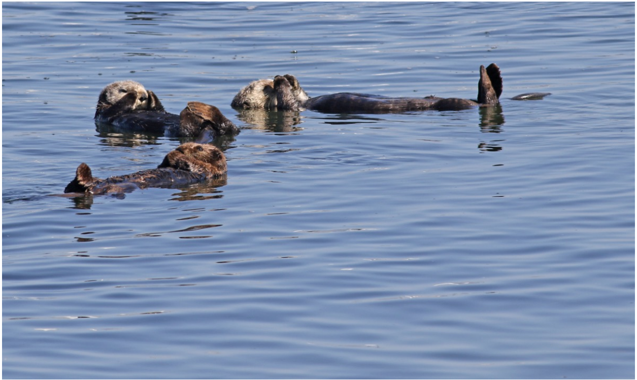
Sea Otters were common sight on the coast (above) and a Steller's Sea Lion resting with a California Sea Lion was seen on one of our pelagics (below)