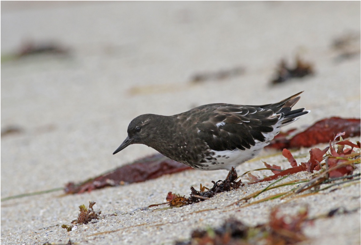
Black Turnstone (above) and Surfbird (below) are both west coast specialities