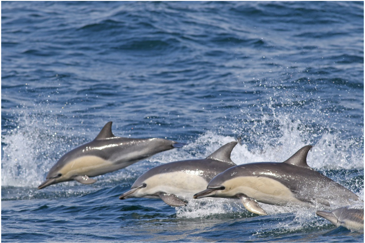
Short-beaked Common Dolphins (above) The seldom seen Baird's Beaked Whale (below)