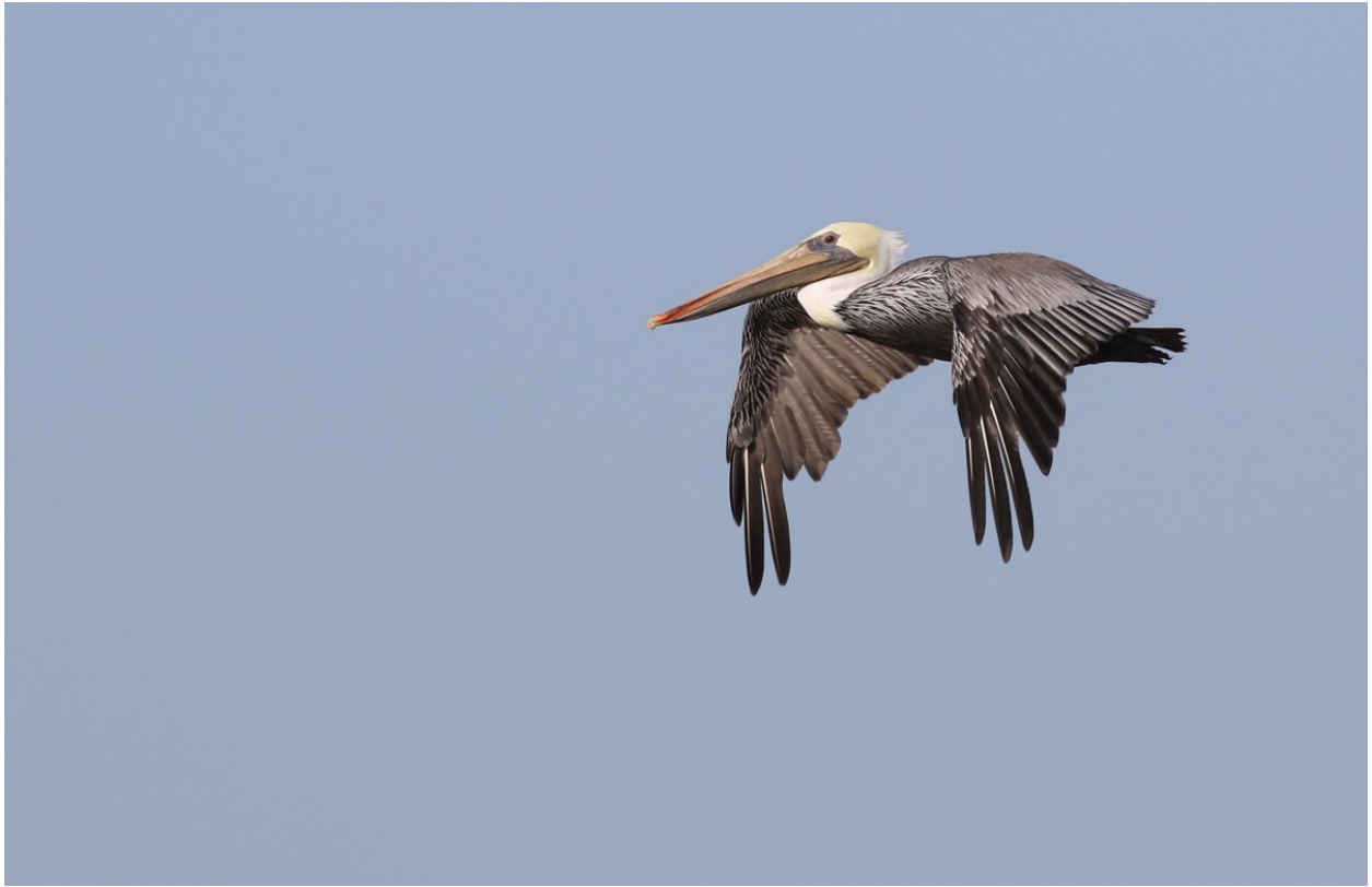
Brown Pelican (above) Heerman's Gull and California Gull (below)