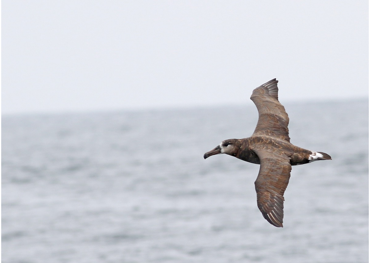
Black-footed Albatross were a joy to watch on the boat trips (above) and Rhinoceros Auklets were seen well in small numbers (below)