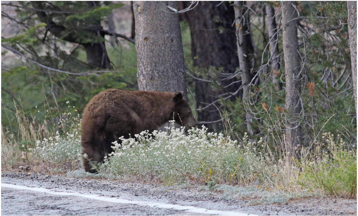
This Black Bear in Yosemite crossed the Glacier Point Road (above) The impressive face of El Capitan from Yosemite Valley (below)