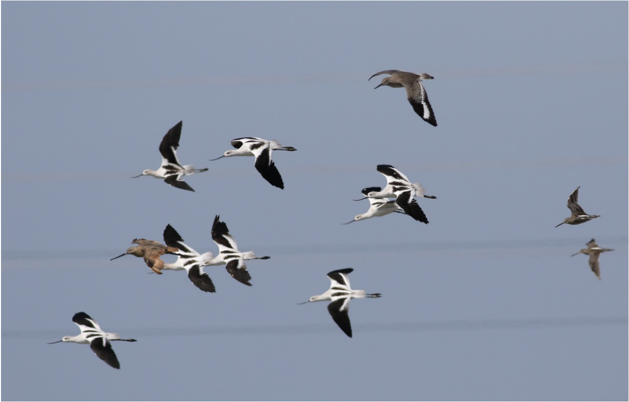
Mixed wader flock of Avocet, Marbled Godwit, Willet & LB Dowitcher (above) and Long-billed Curlew (below)