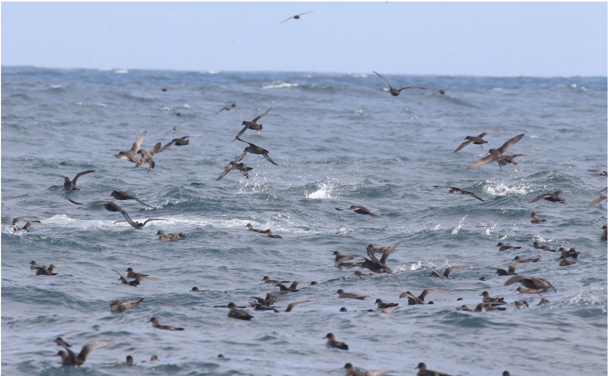
We saw an incredible 20,000+ Sooty Shearwaters in Monterey Bay (above) One of the tiny Pacific Tree Frogs seen in Tuolumne Meadow, Yosemite (below)