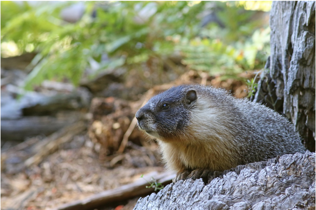
Yellow-bellied Marmots entertained us in Sequoia NP (above) Lodgepole Chipmunks posed also in Sequoia NP (below)