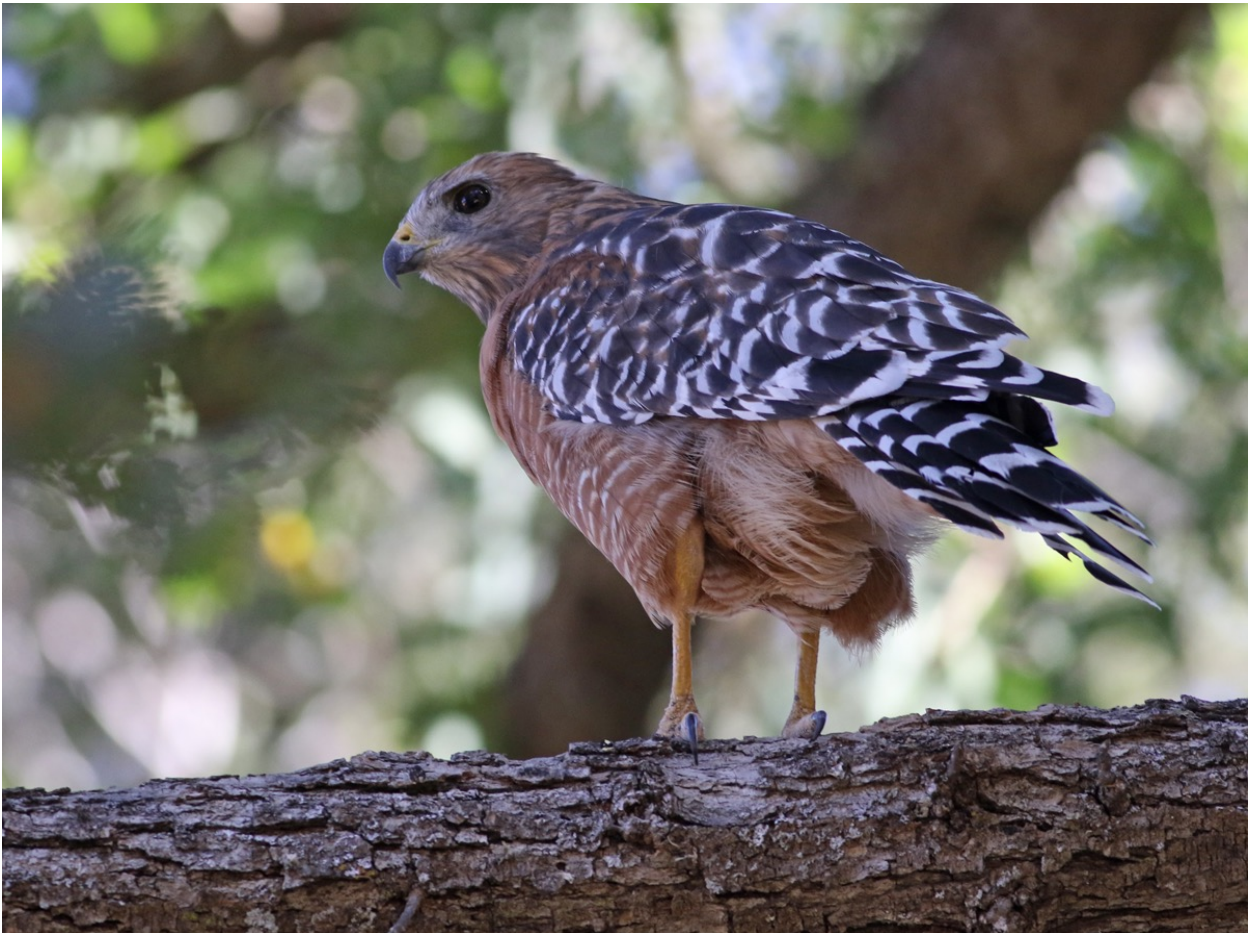
This Red-shouldered Hawk was far from shy at The Pinnacles (above) One of three Prairie Falcons seen in Yosemite on one day (below)