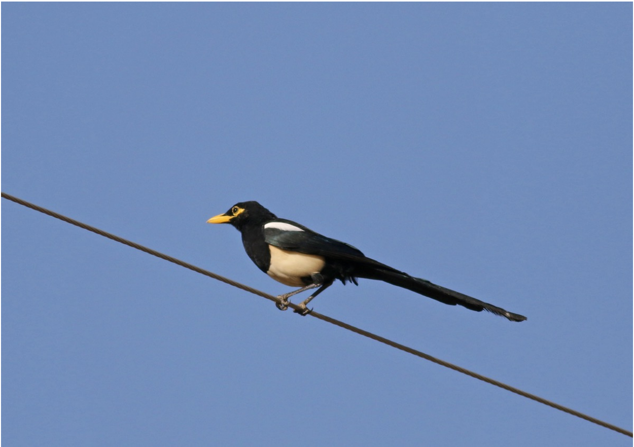
Yellow-billed Magpies (above) and Wrentit (below) are both specialities of California