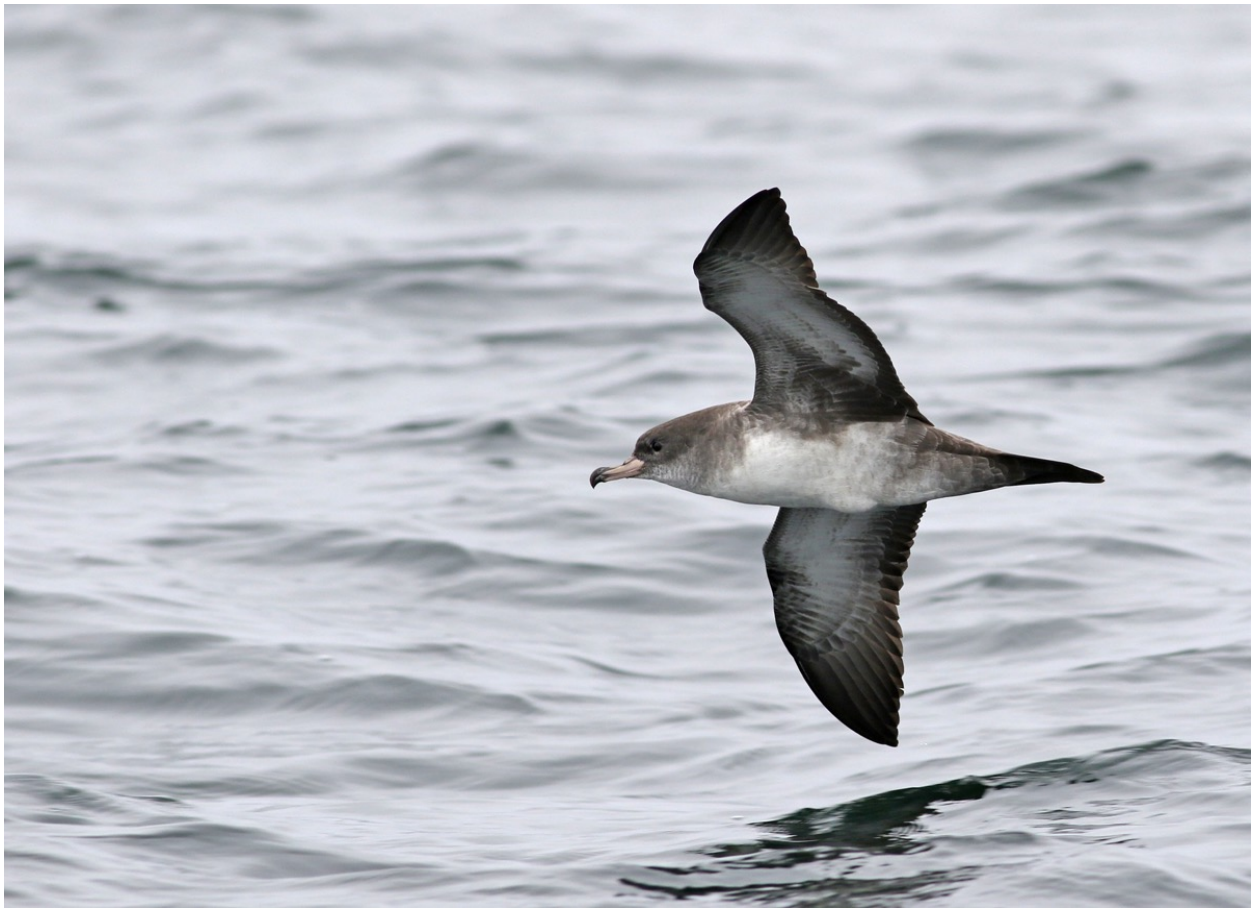
Pink-footed Shearwater (above) and the stunning Buller's Shearwater (below)