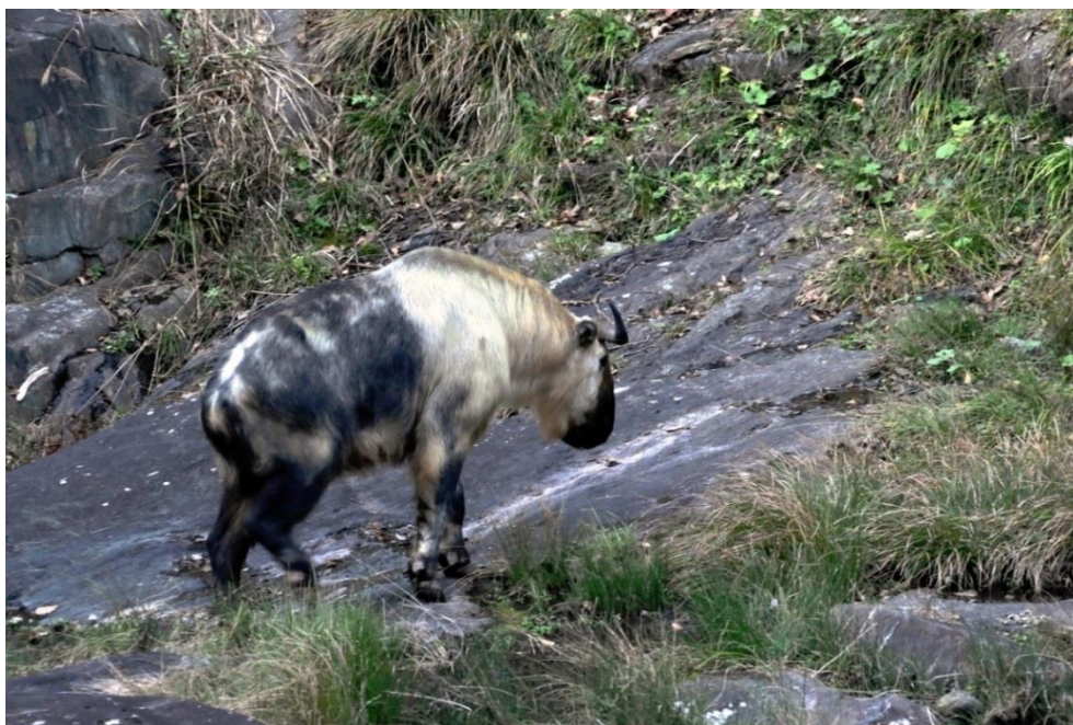
Takin (Steve Holloway)

Common at Tangjiahe with up to 15 being seen on each drive.