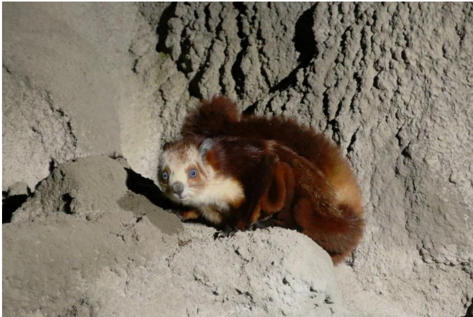
Red-and-White Flying Squirrel (Steve Holloway)

Not seen on either recce but four near Rouergai on the 28th and at least six at a second site on the 31st.