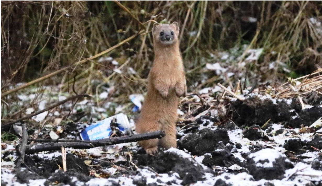
Siberian Weasel