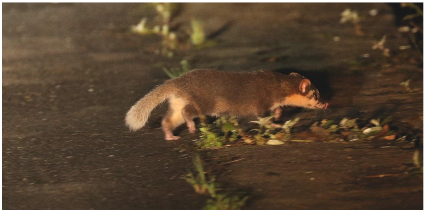
Chinese Ferret Badger (Pete Wheeler)