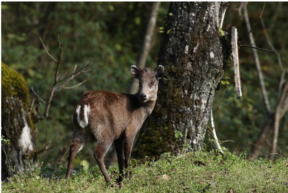
Tufted Deer (Pete Wheeler)