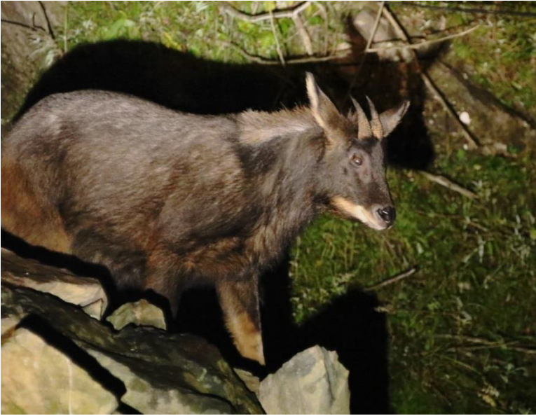
Chinese Serow (Steve Holloway)

Great views of a single sub-adult male while spotlighting at Labahe on the 24th and 25th.