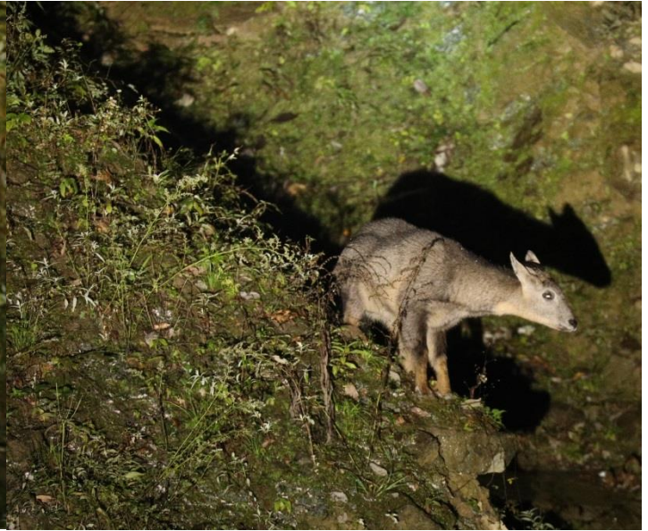
Chinese Goral (Pete Wheeler)