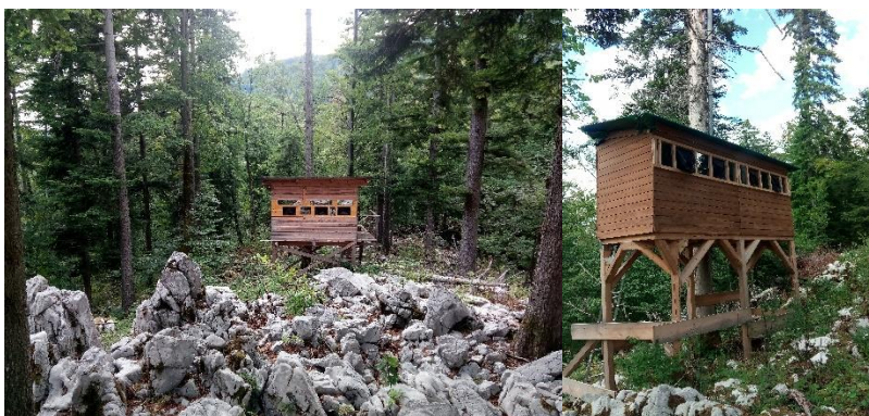
Croatian bear hides

A quick stop to sample (yet more) delicious local produce near Leskova Draga produced an unexpected bonus: a Lesser Horseshoe Bat roosting in the cellar of the traditional sawmill on the property.