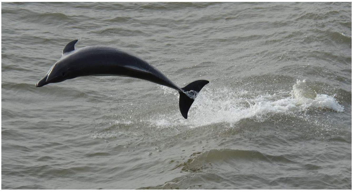
Day 8 - March 1 – Sarah and I woke up as the boat was leaving the Atlantic ocean and heading up the Cassamance River. We spent the morning watching Bottlenose dolphins swim in the boats wake to arrive in Ziguinchor around noon.