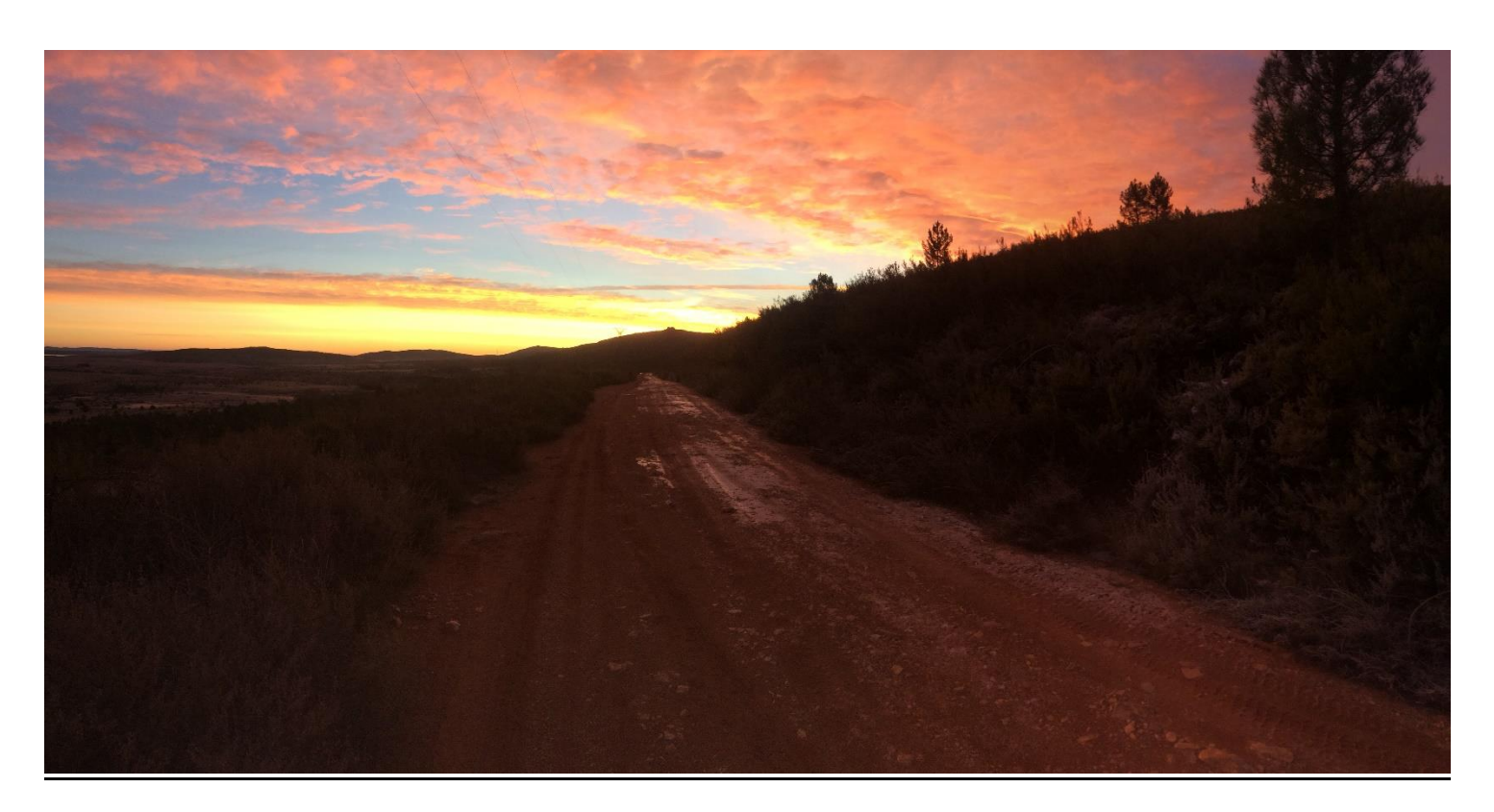
Sunrise in the Sierra de Culebra