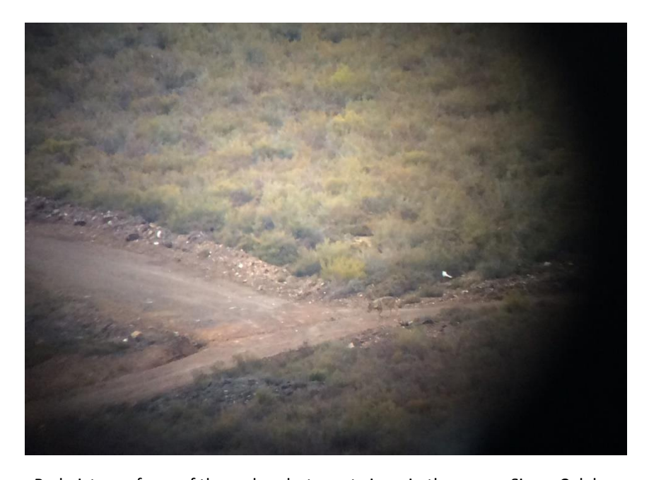
Bad picture of one of the wolves but great views in the scope, Sierra Culebra