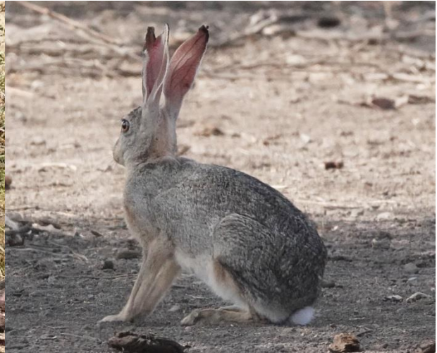
Abyssinian Hare