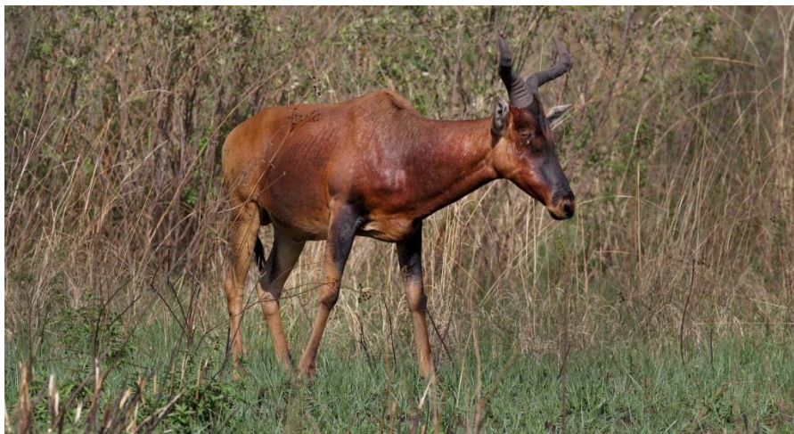
Swayne's Hartebeest