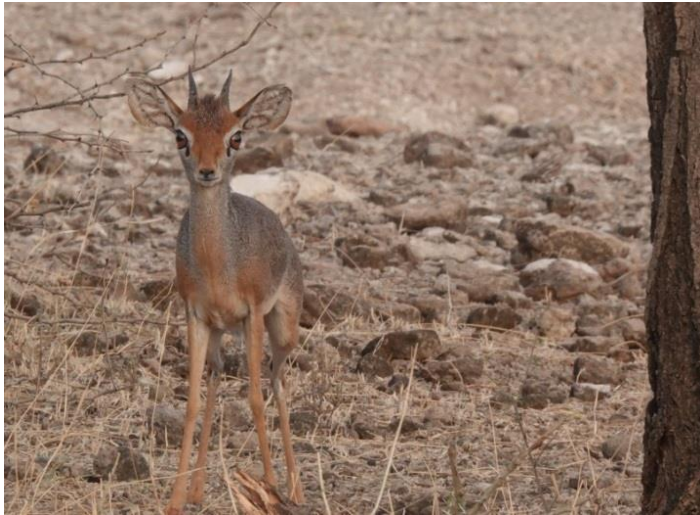
Salt's Dik-dik