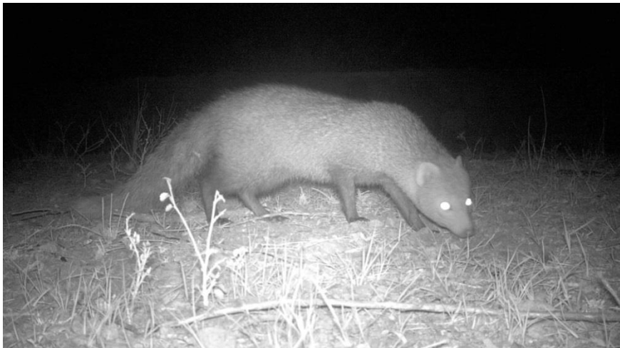
White-tailed Mongoose (Ewan Davies)