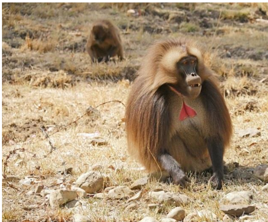
Gelada Baboon