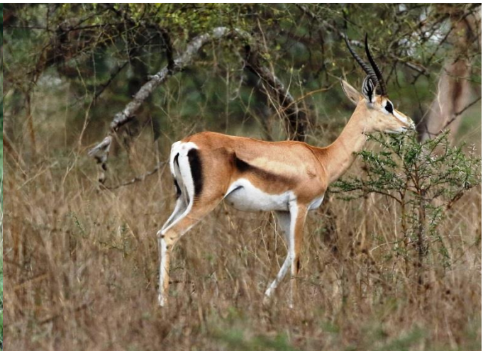
Bright's Gazelle