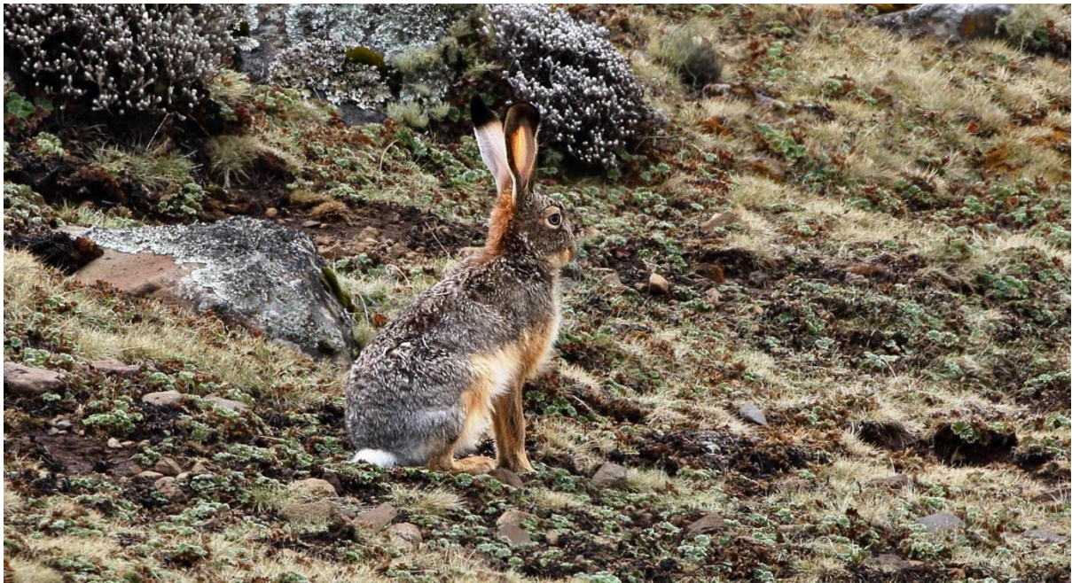
Starck's Hare