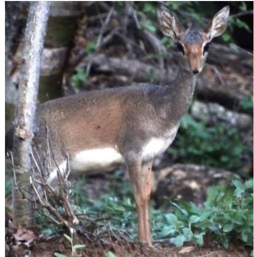
Guenther's Dik-dik