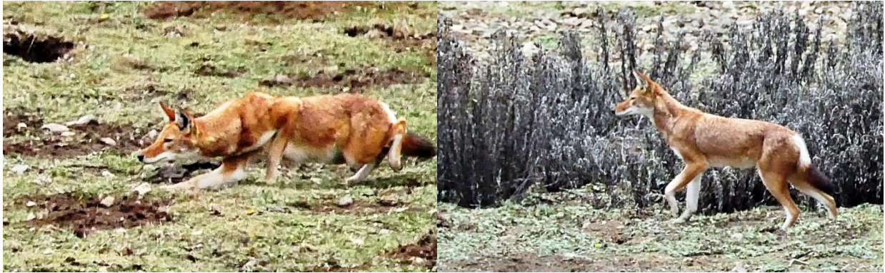
Ethiopian Wolf