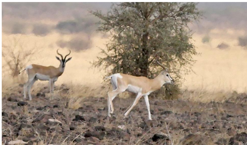
Soemmerring's Gazelle