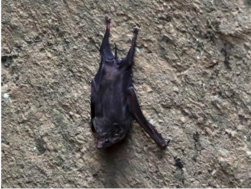
African Sheath-tailed Bat (Greg Dean)