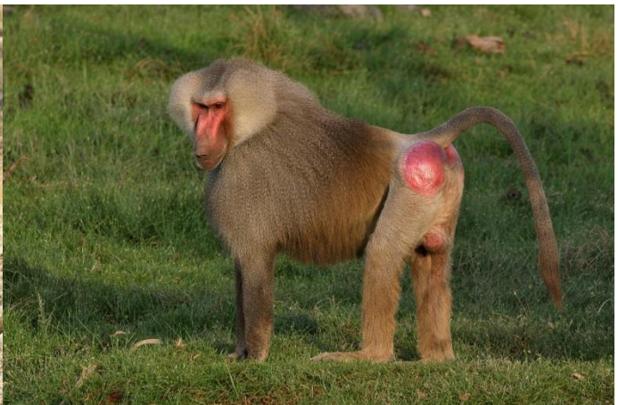
Hamadryas Baboon