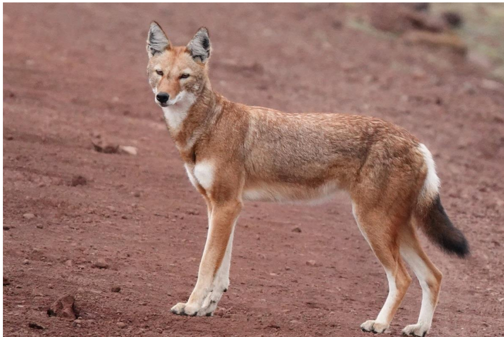
Ethiopian Wolf