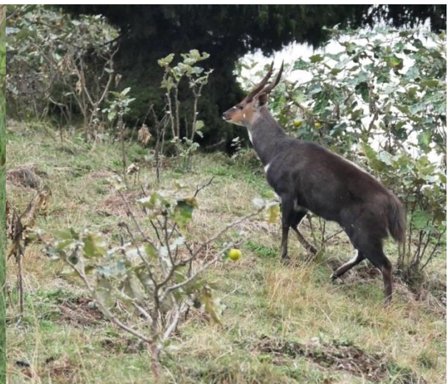
Menelik's Bushbuck