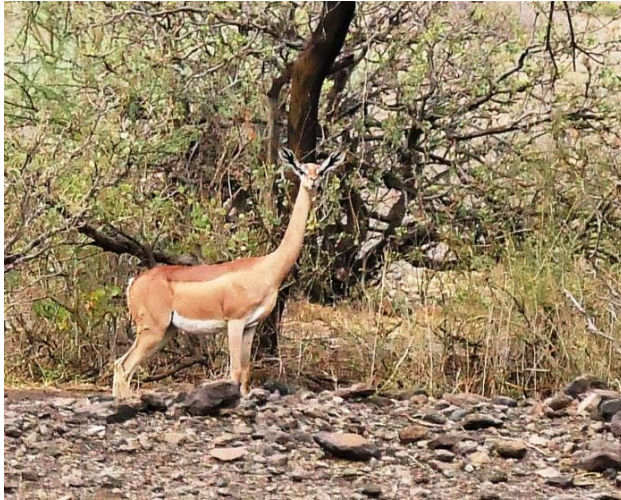
Northern Gerenuk