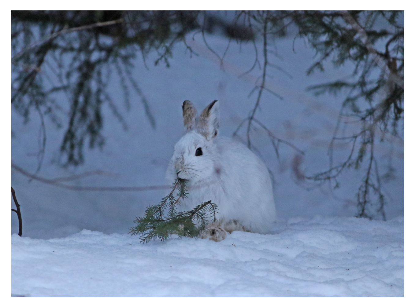
Snowshoe Hare (above) and Stoat (below)