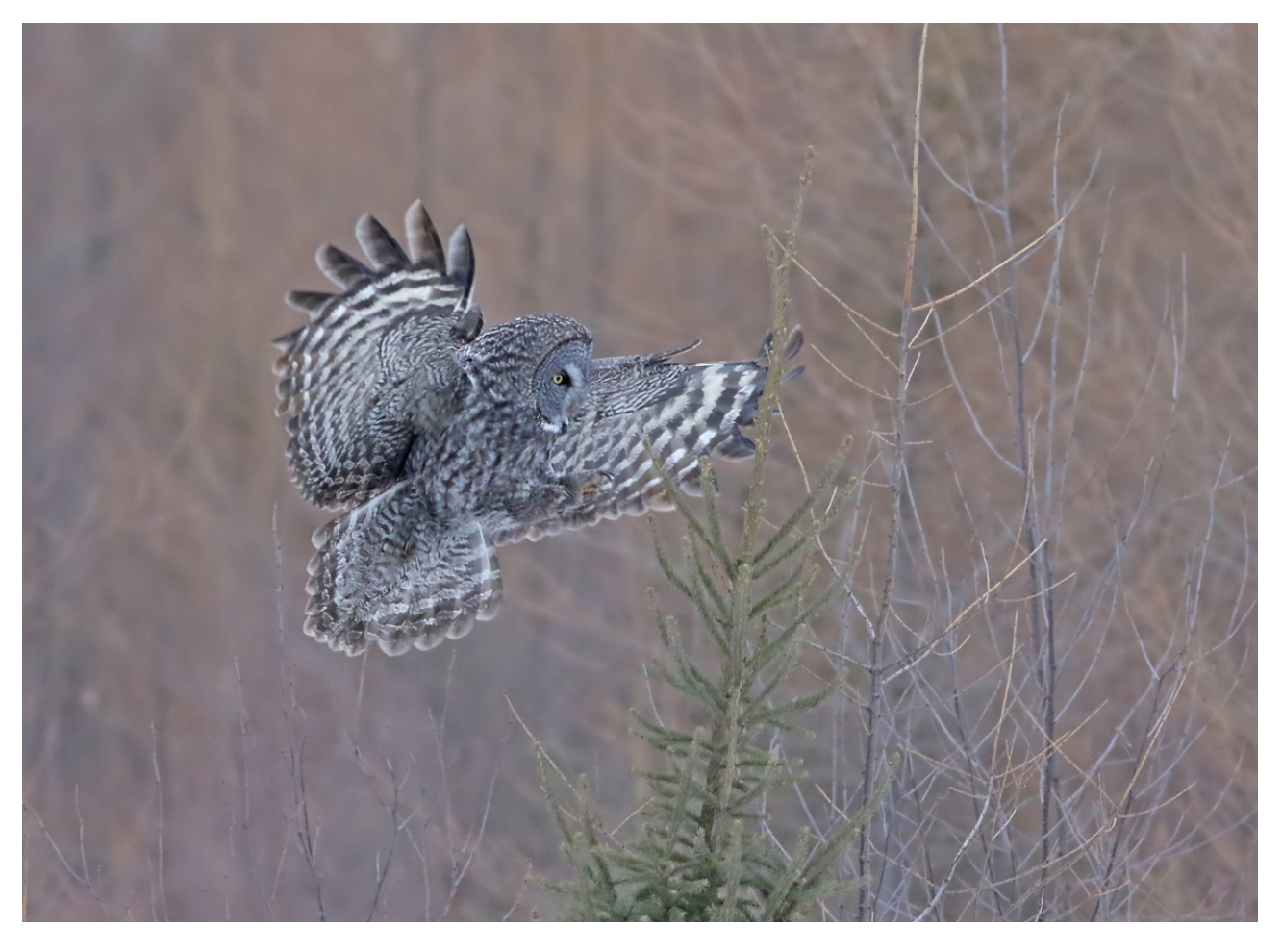
This Great Grey Owl at Sax Zim Bog performed incredibly well