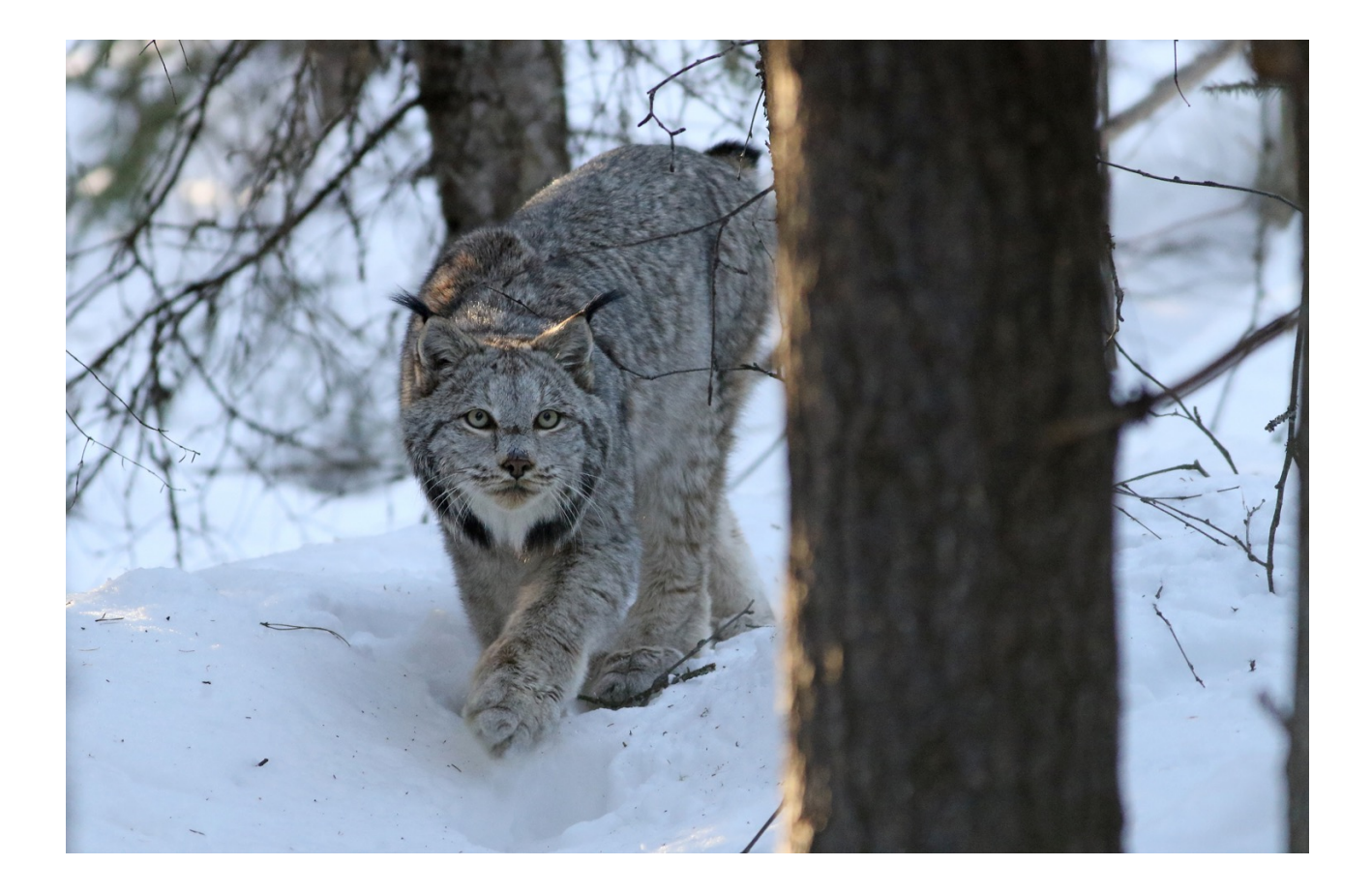
The Canada Lynx views this year were exceptional!