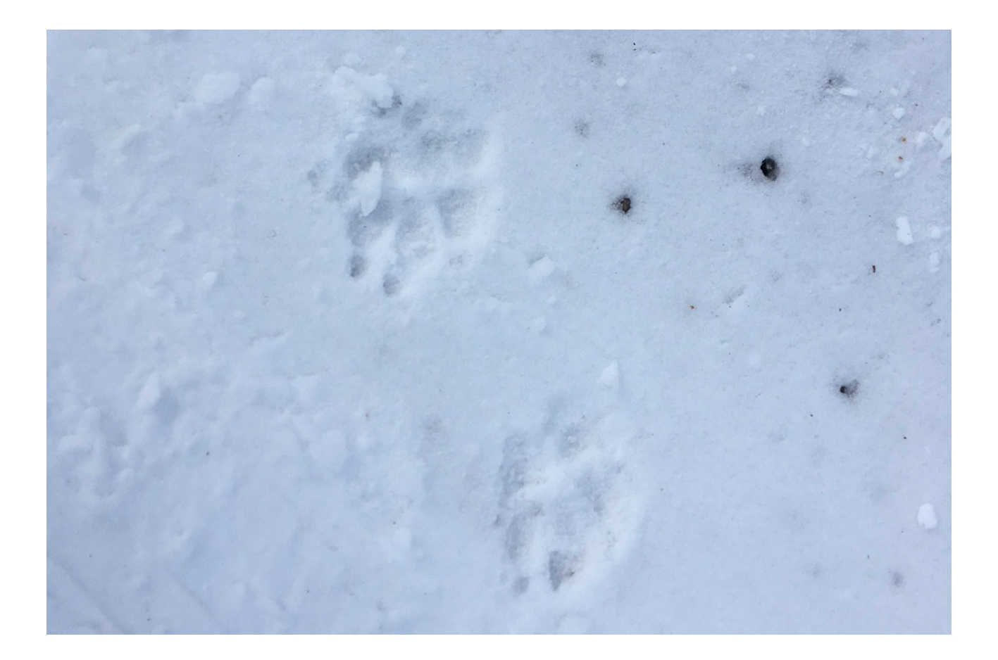
Wolf tracks (above) and Snowshoe Hare tracks (below)