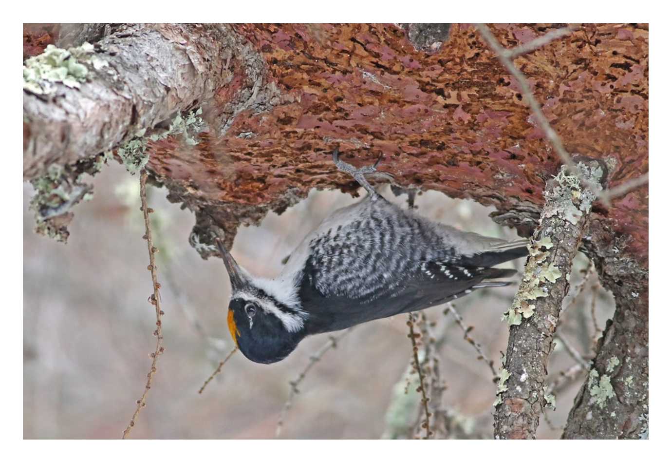
Male Black-backed Woodpecker (above) and Great Grey Owl (below)