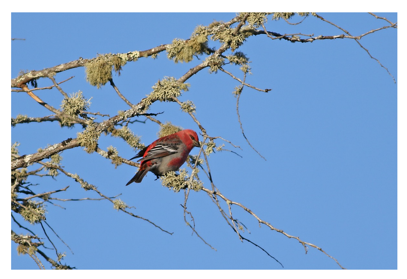
Male Pine Grosbeak (above) and male Spruce Grouse (below)