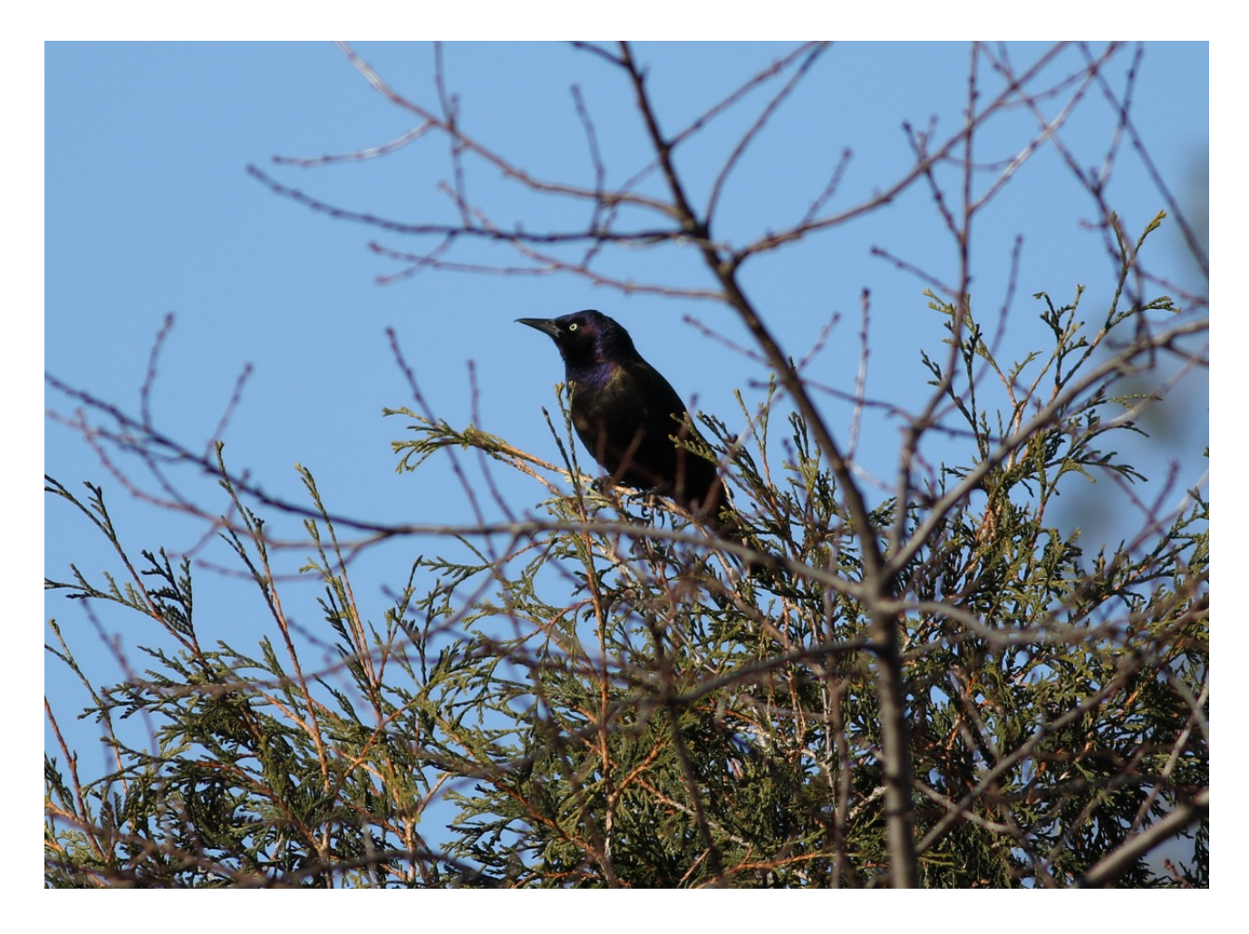
Common Grackle (above) and another Canada Lynx! (below)