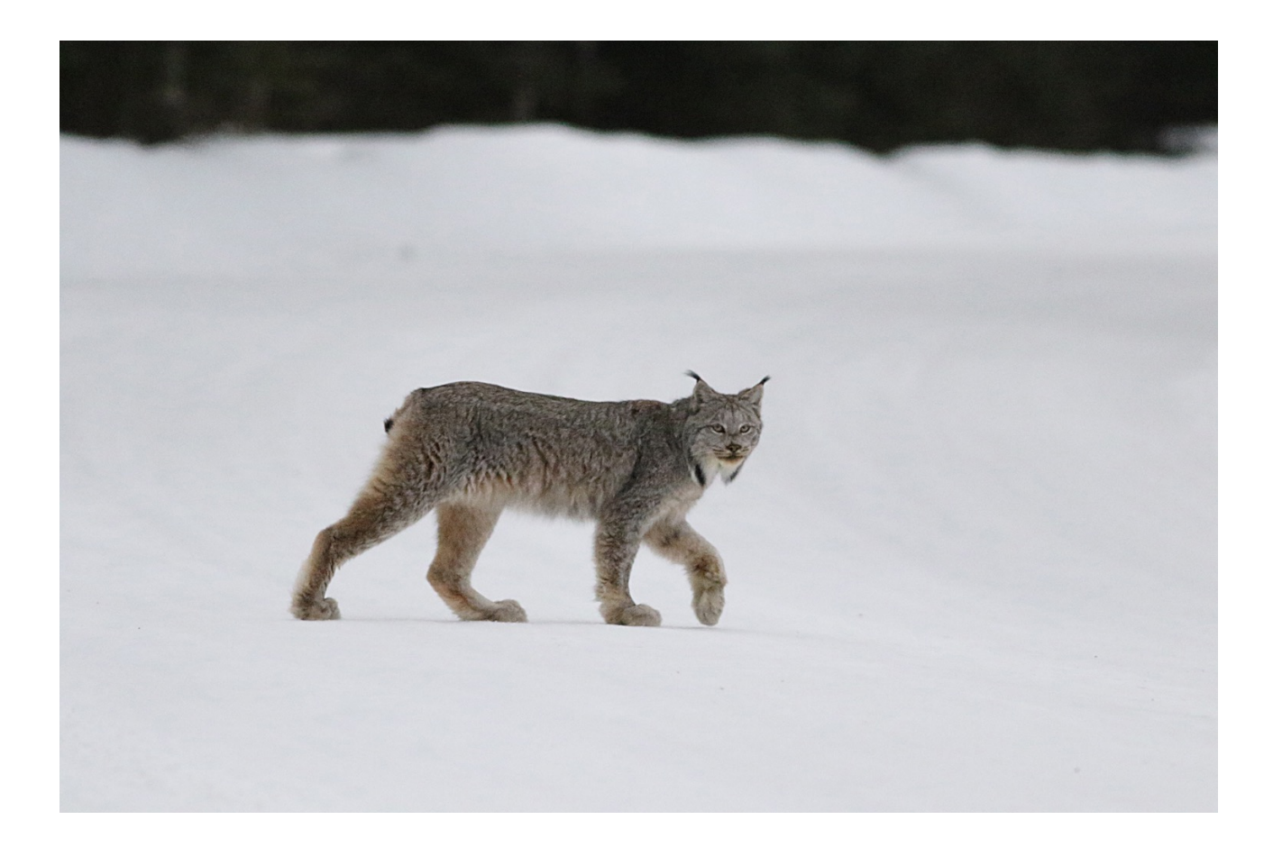
More Canada Lynx! Bottom photo by Andy Stanbury