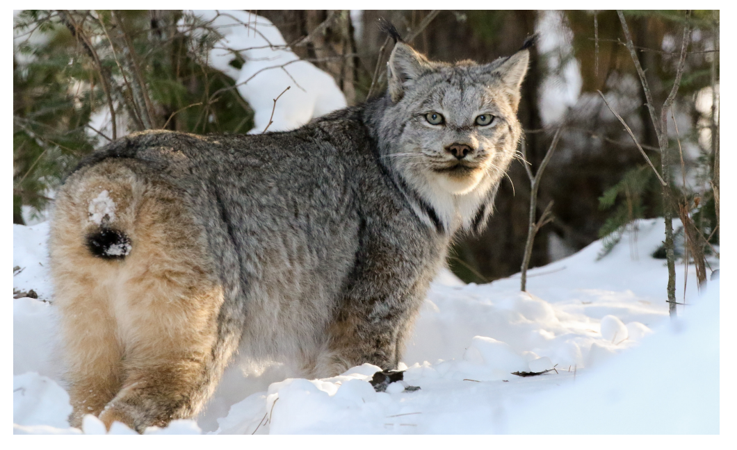
The undoubted highlight of the tour was seeing at least 3 different Canada Lynx for a number of hours!

Moose: Three animals on the Gunflint Trail on evening was a welcome sight particularly after the recent decline in numbers in the region.