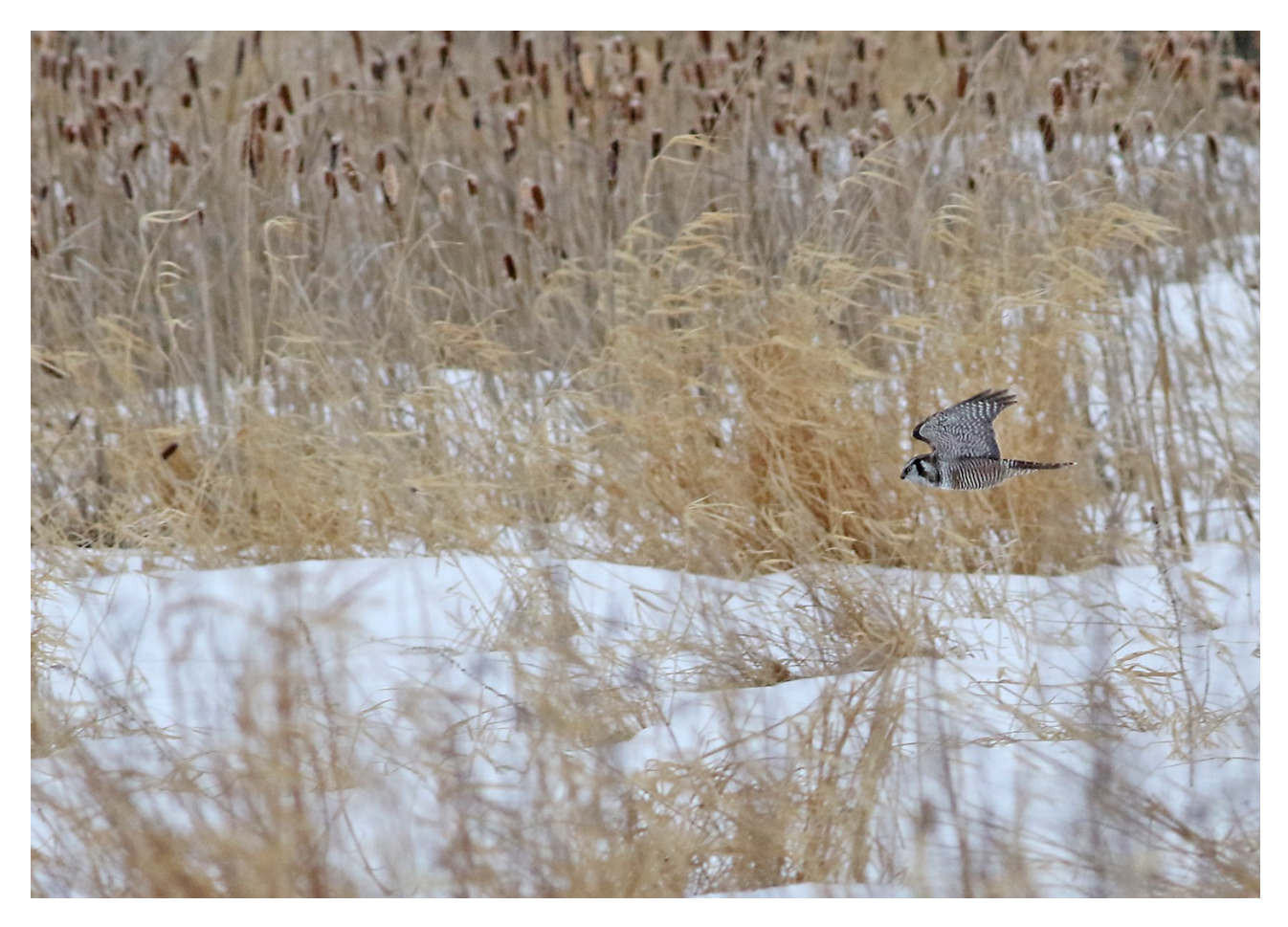
Northern Hawk Owl (above) and Boreal Owl (below)