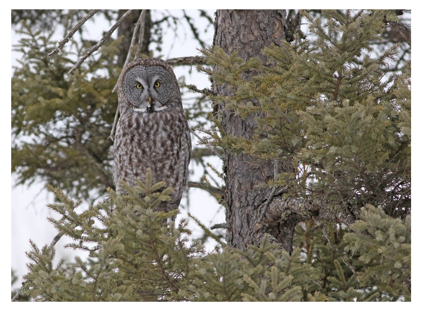
The hunting Great Grey Owl caught a vole just metres from us all!