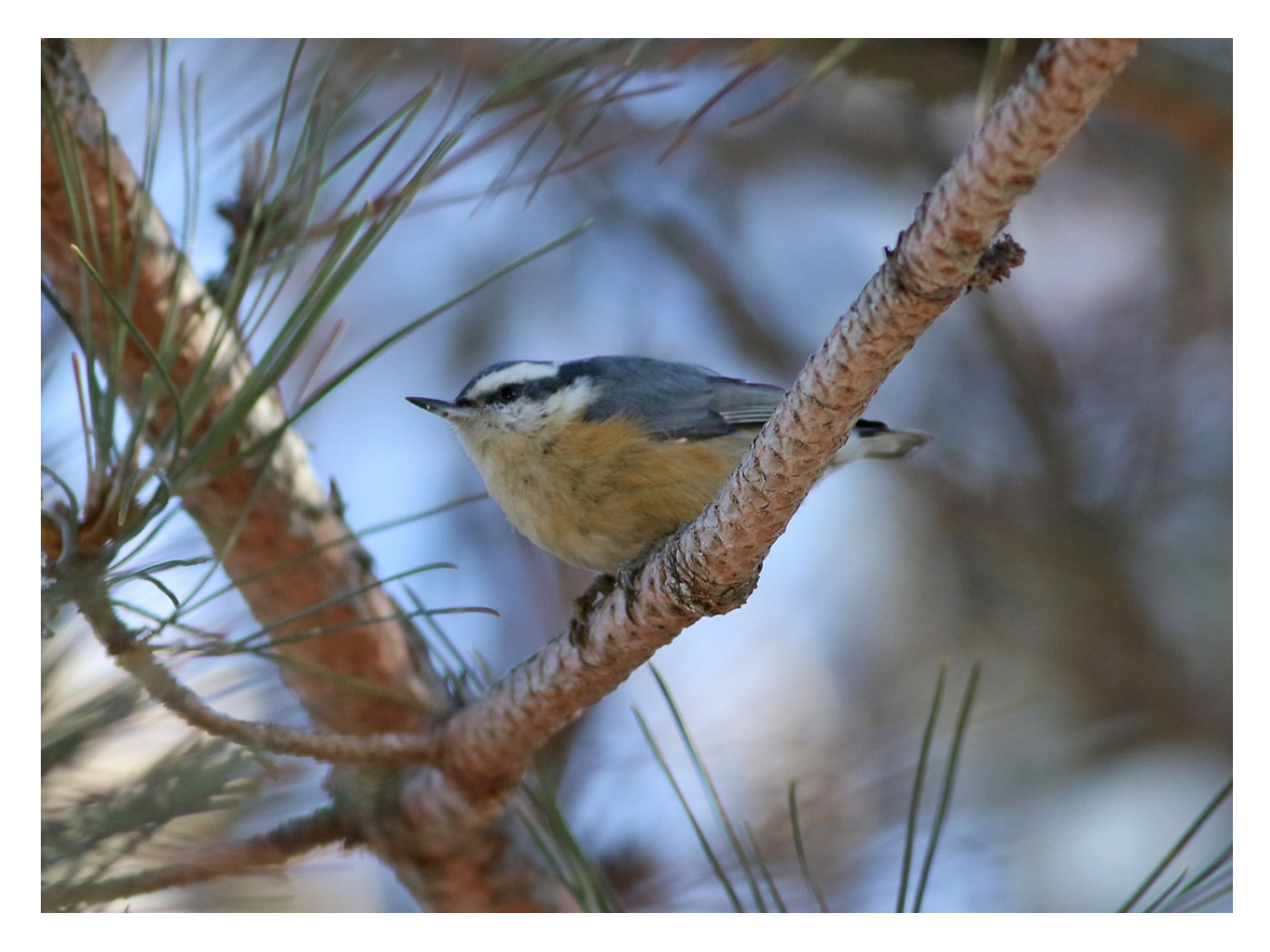
Red-breasted Nuthatch (above) and Black-capped Chickadee (below)