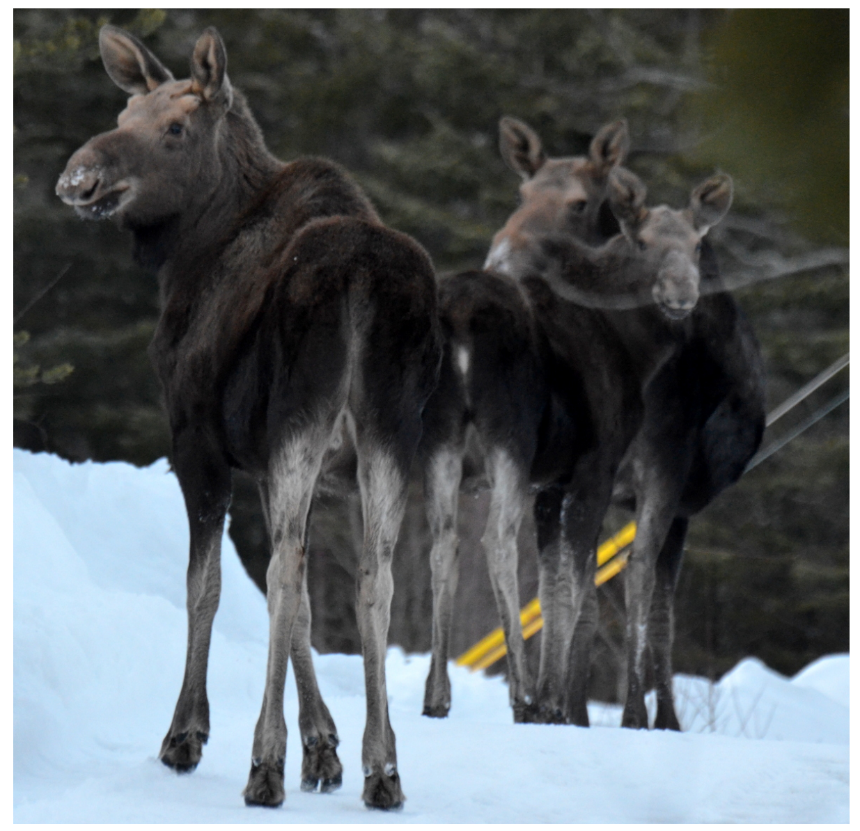
Moose (above) and Common Muskrat (below)