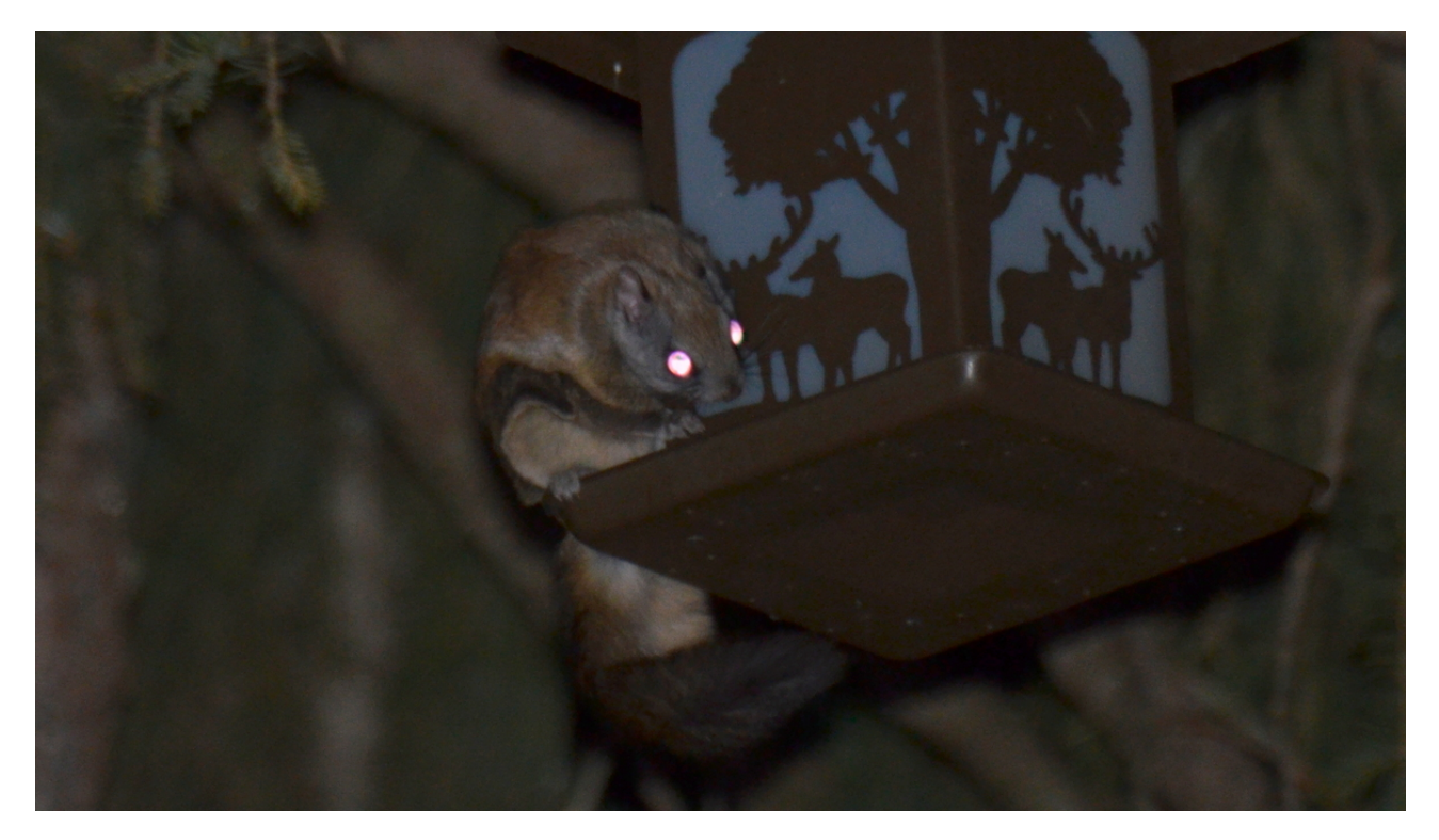
Northern Flying Squirrel (above) and American Red Squirrel (below)