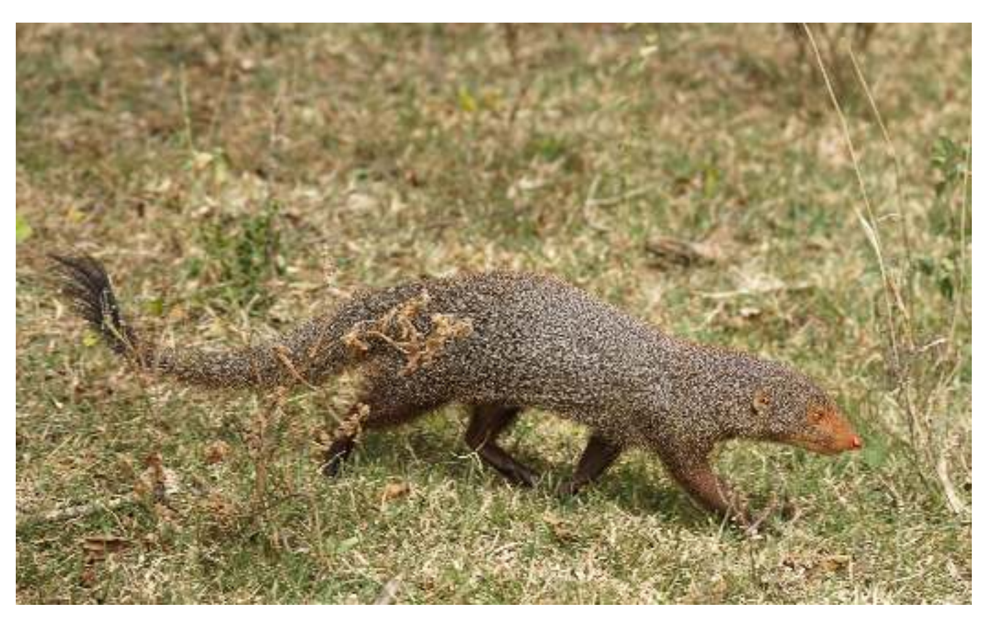
Ruddy mongoose, Yala