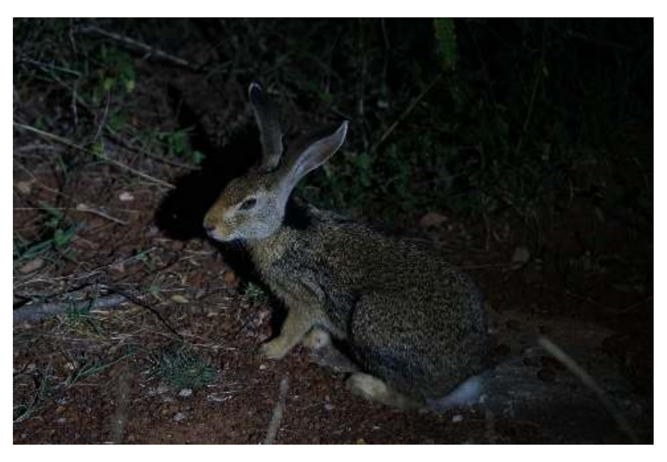
Indian hare spotliting in Sigirya