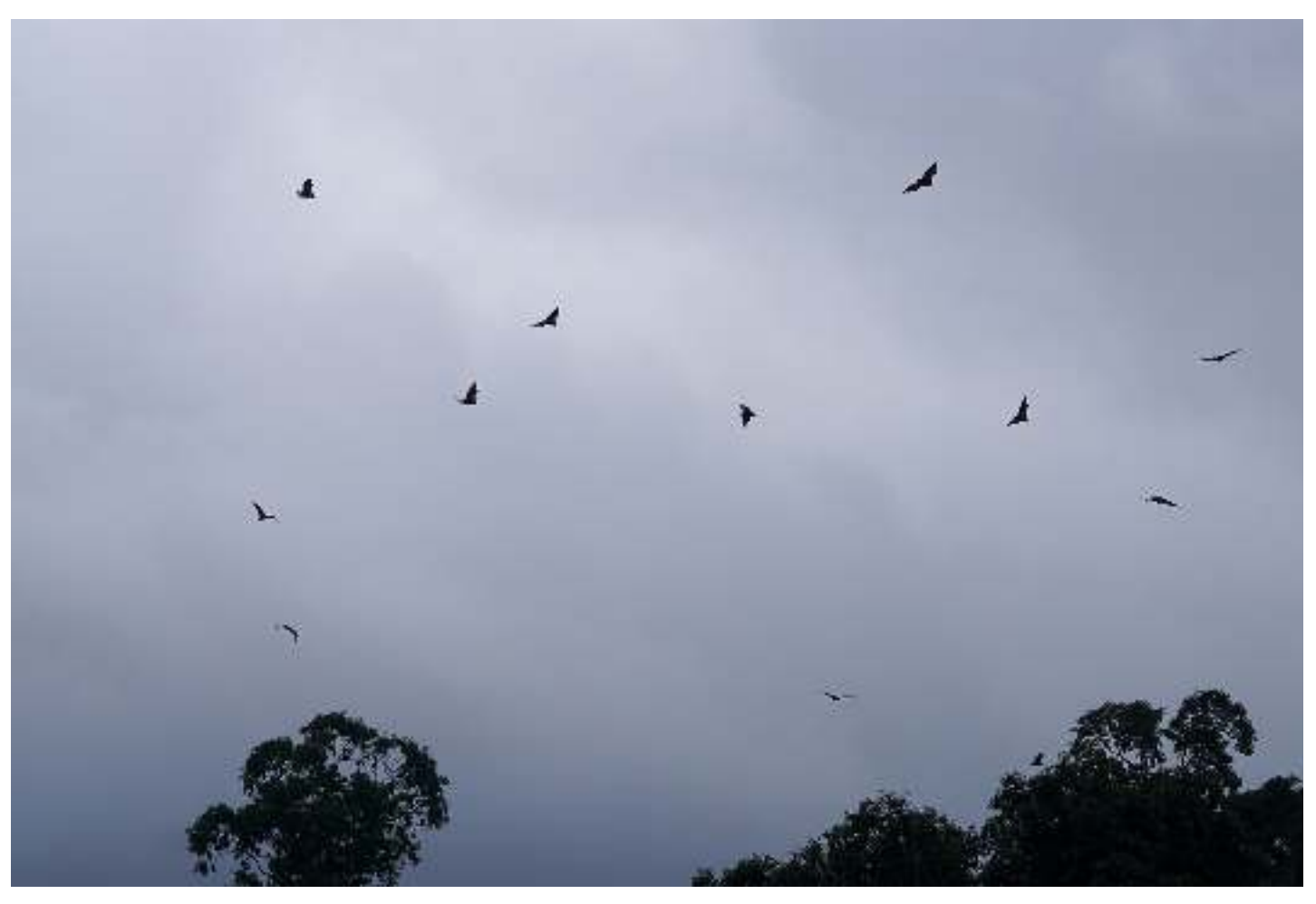
Flying fox, Kandy botanical garden