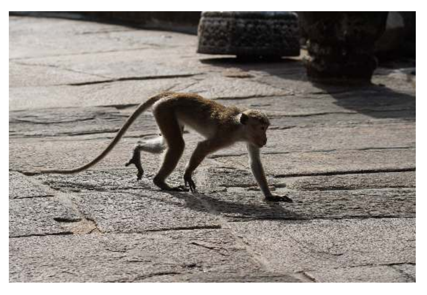
Toque Macaques common around the culture sites