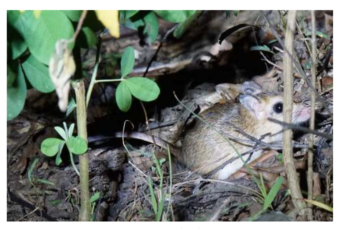
Probably a Gerbil (Sigirya)