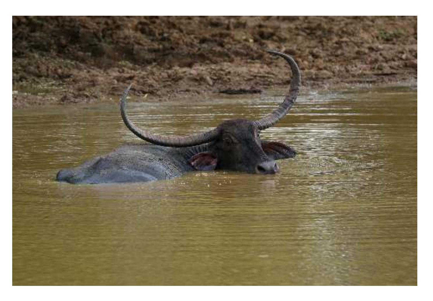
Wild water buffalo in Yala (above) & in Uduwalawa (under, mayby domestic?)