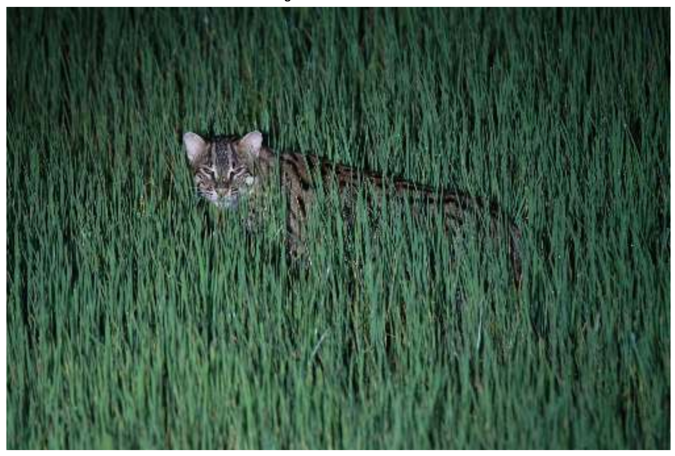
Second Fishing cat of the trip around Yala