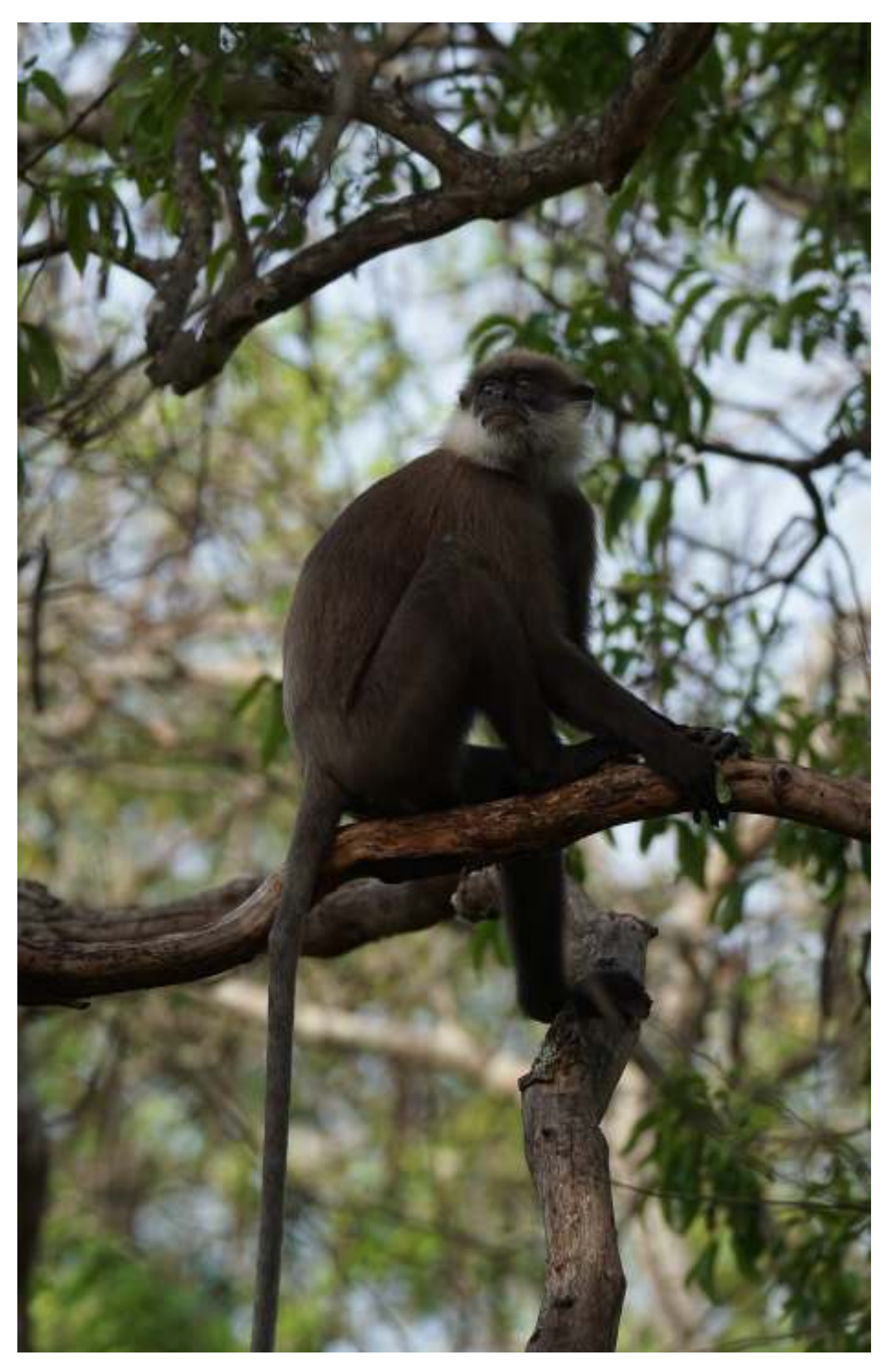
Purple-faced leaf monkey, Polonnaruwa culture site