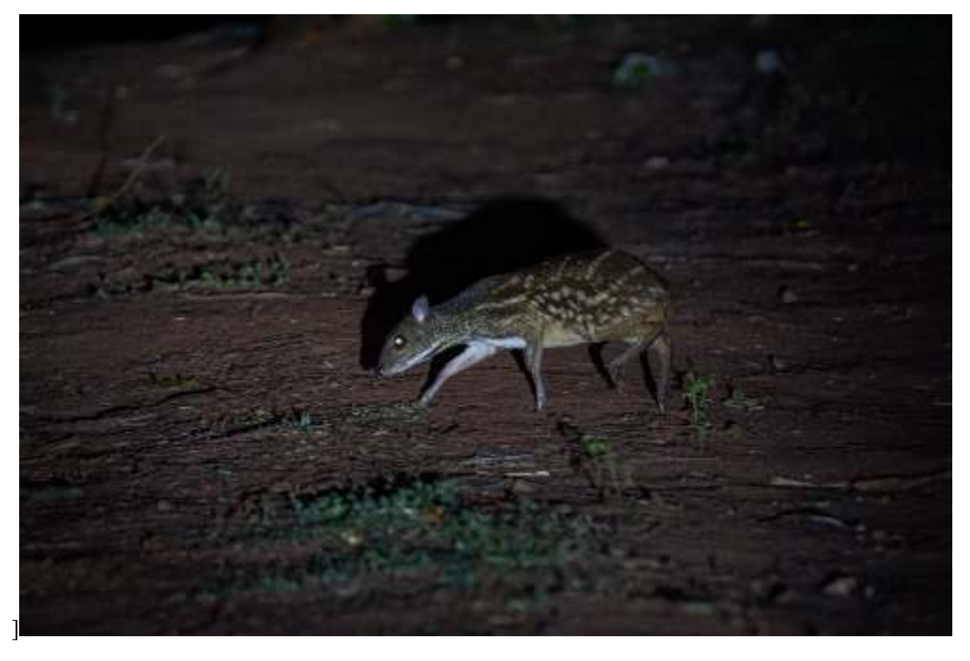
Mouse deer (above) & palm civet (under) in Sigiriya forests