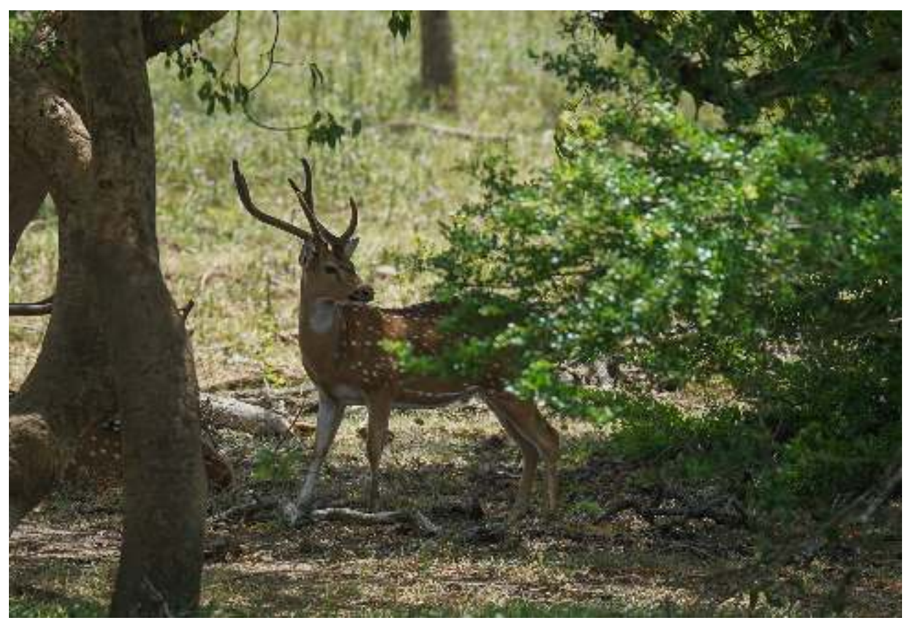
Male(s) spotted deer in Yala