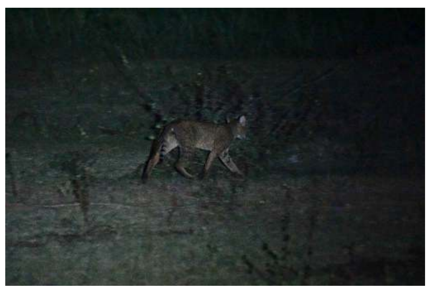
Jungle cat around Yala