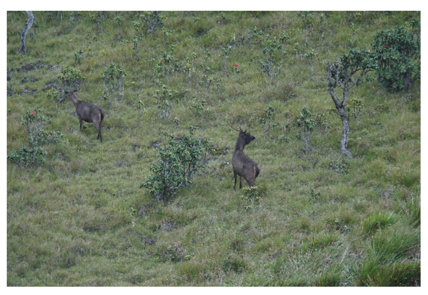
Male and female sambar in Horton Plains