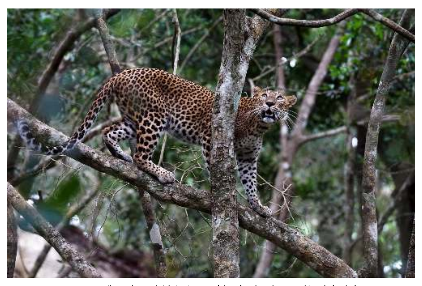
Wilpattu leopard sighting in a tree (above) and on the ground in Yala (under)