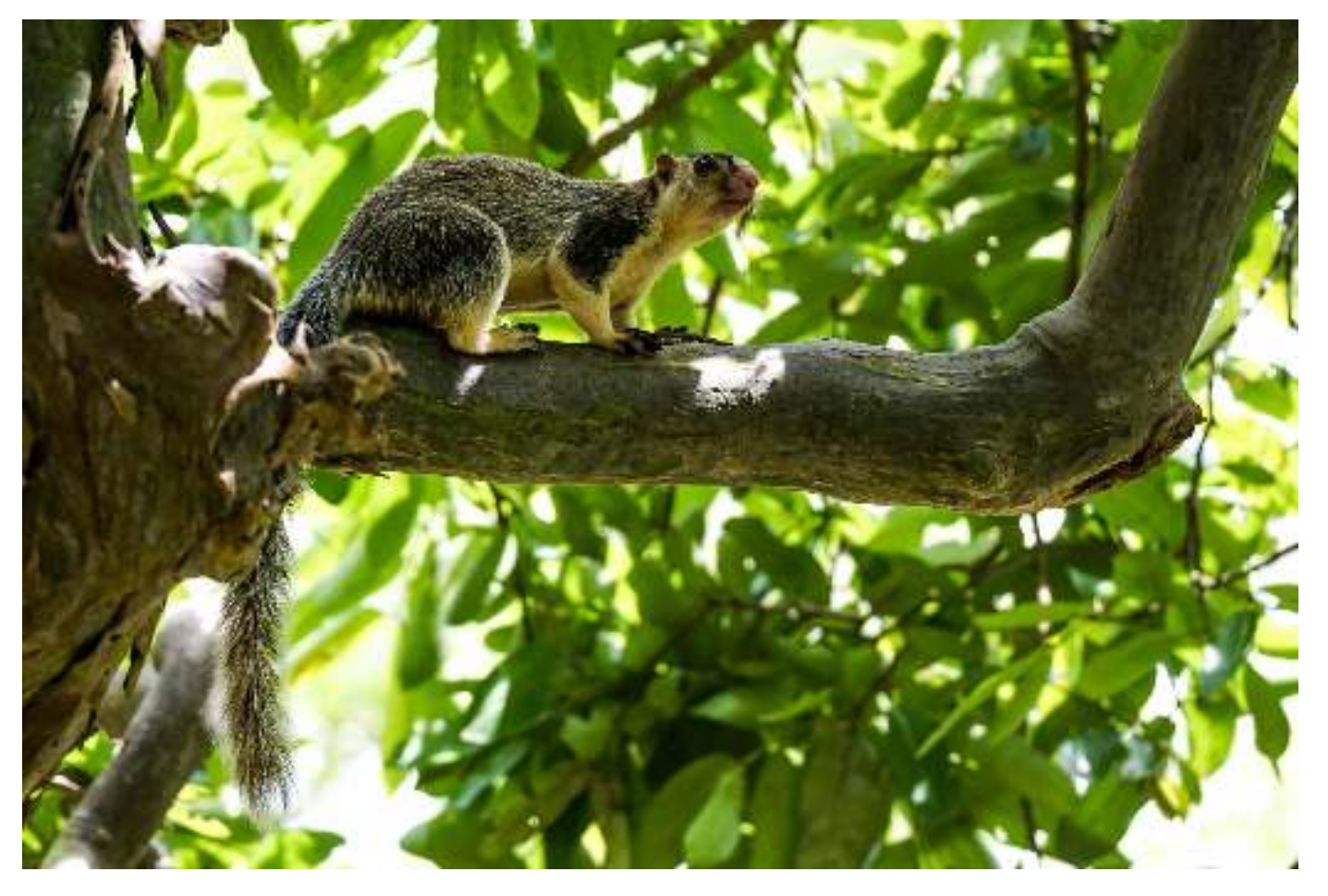
Giant squirrel, Yala