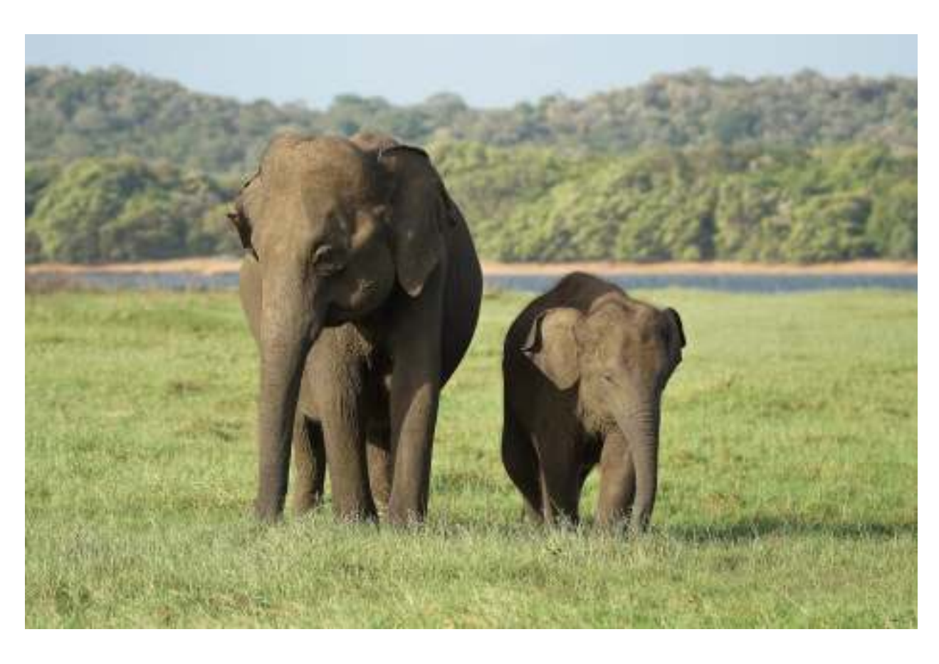
Asian elephants in Minneriya