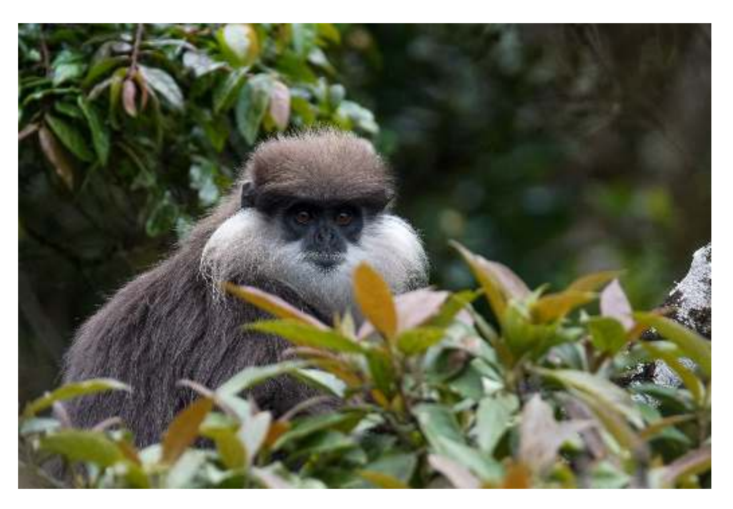
Purple-faced leaf monkey, Horton plains