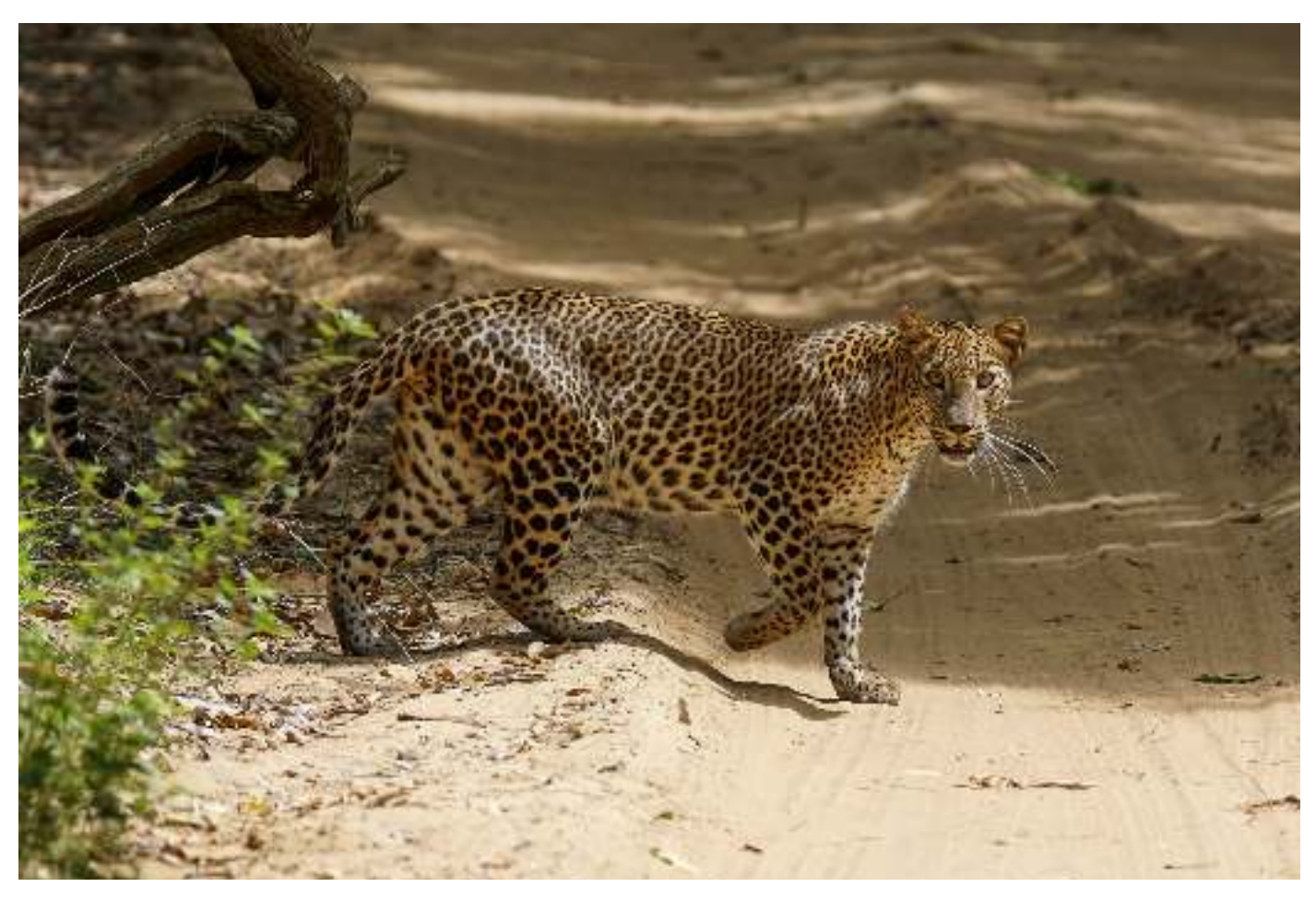
Wilpattu: above first leopard crossing in front of the jeep & sleeping in the forest beneath