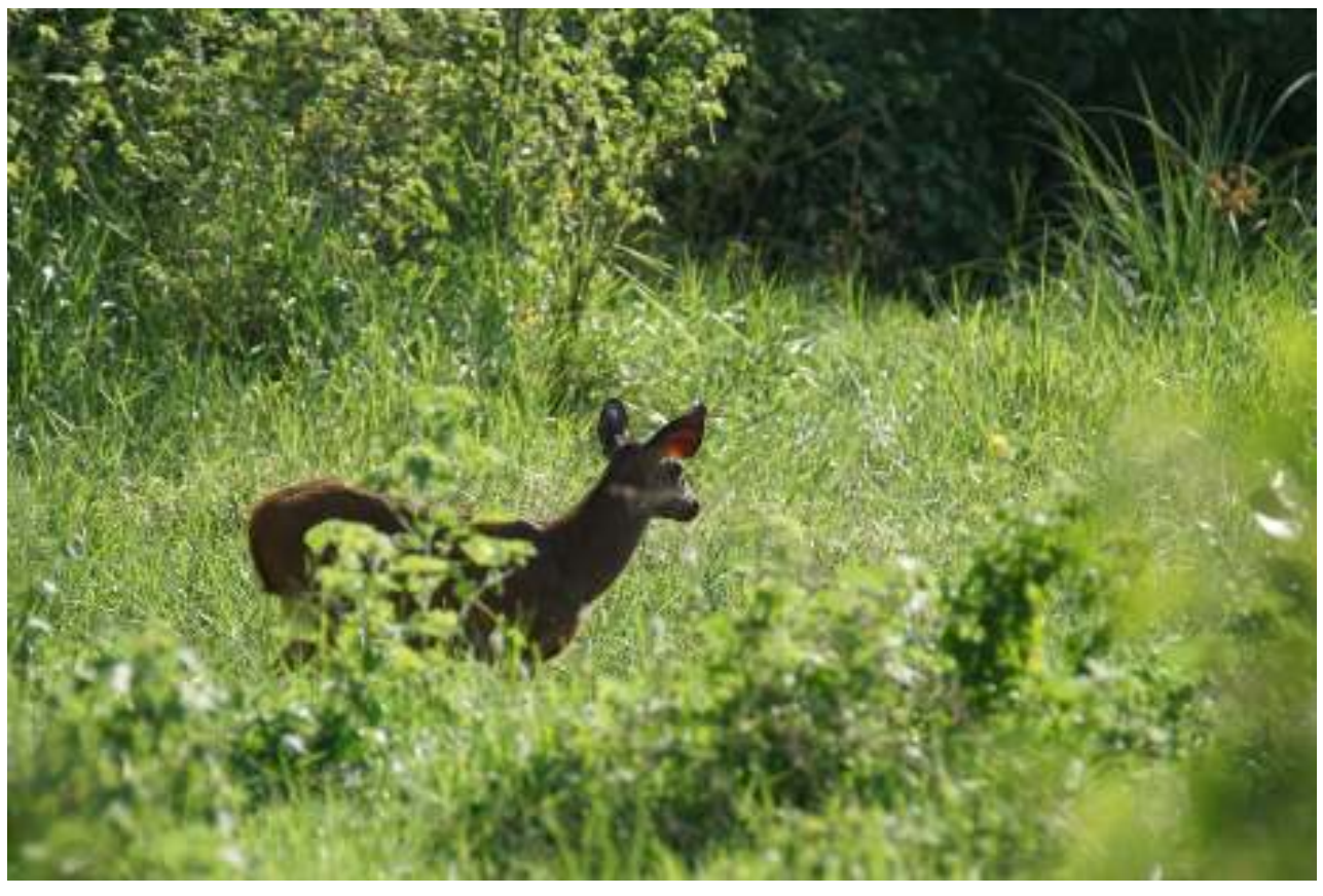
The only sambar seen in Minerya