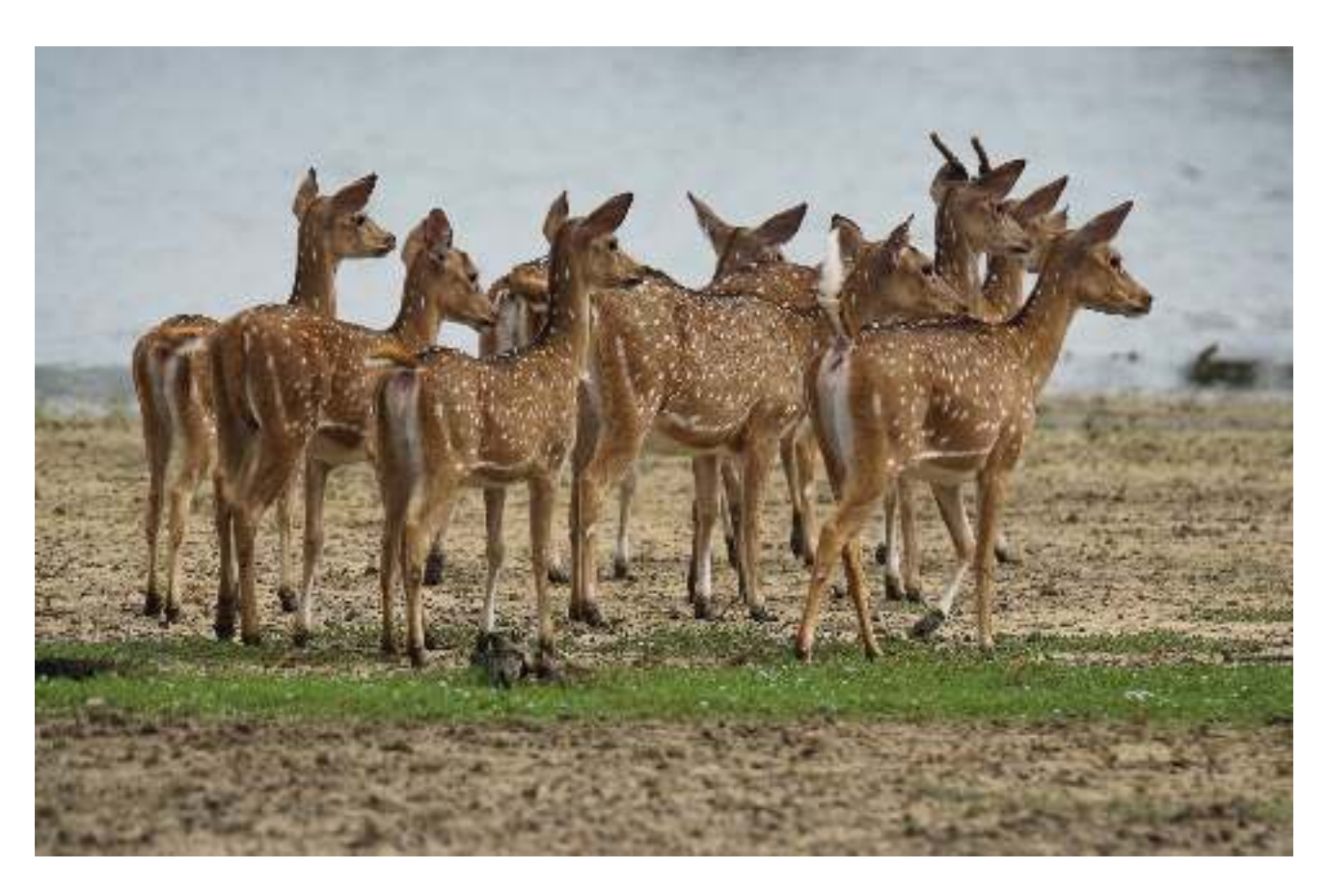
Wilpattu spotted deer, a bit nervous because of four jackals nearby