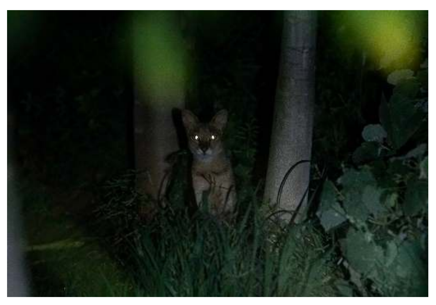
Jungle cats around Wilpattu