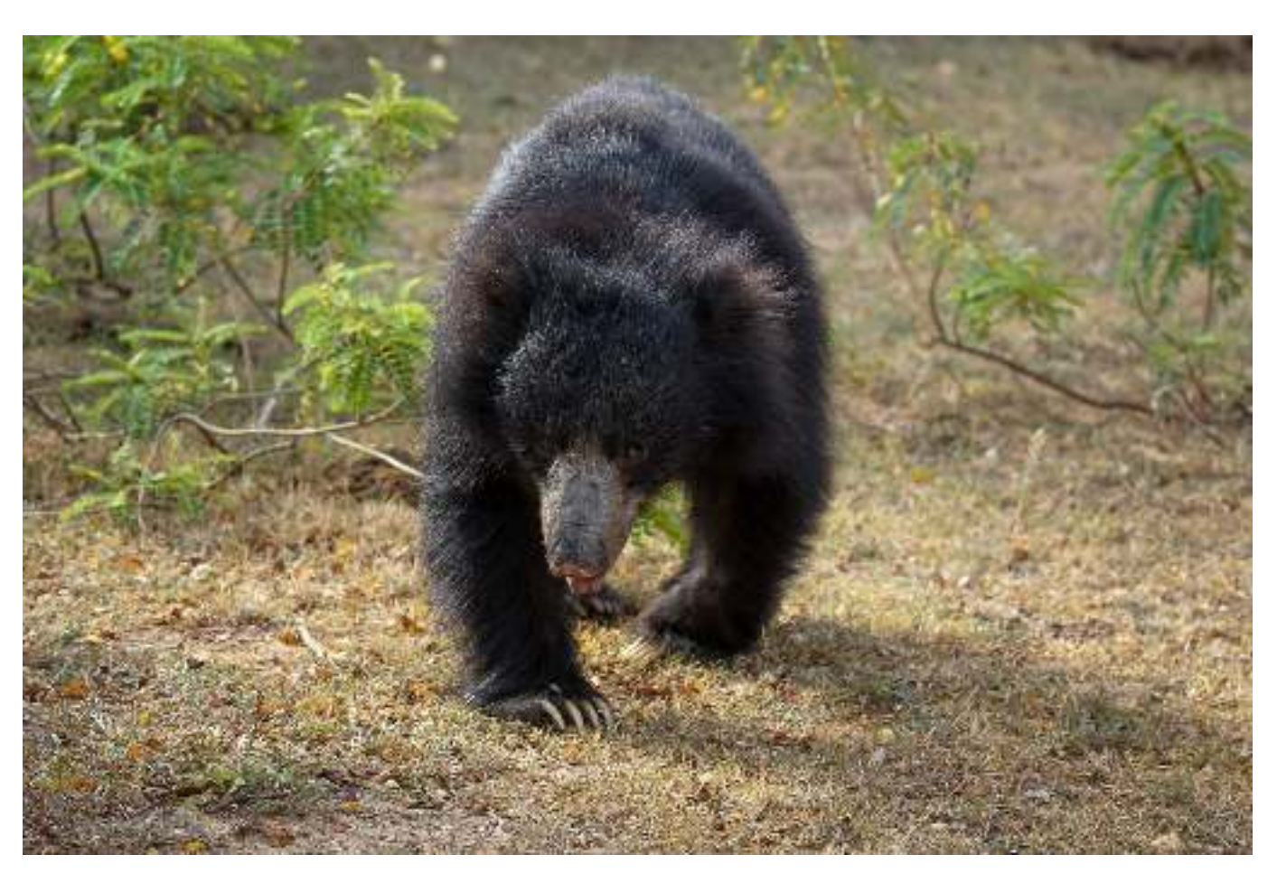
Sloth Bear in Yala