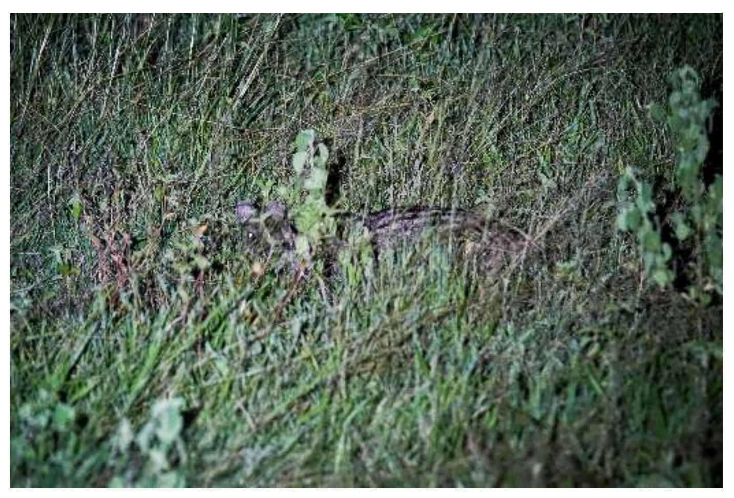
Small indian civet, Udawalawa spotliting