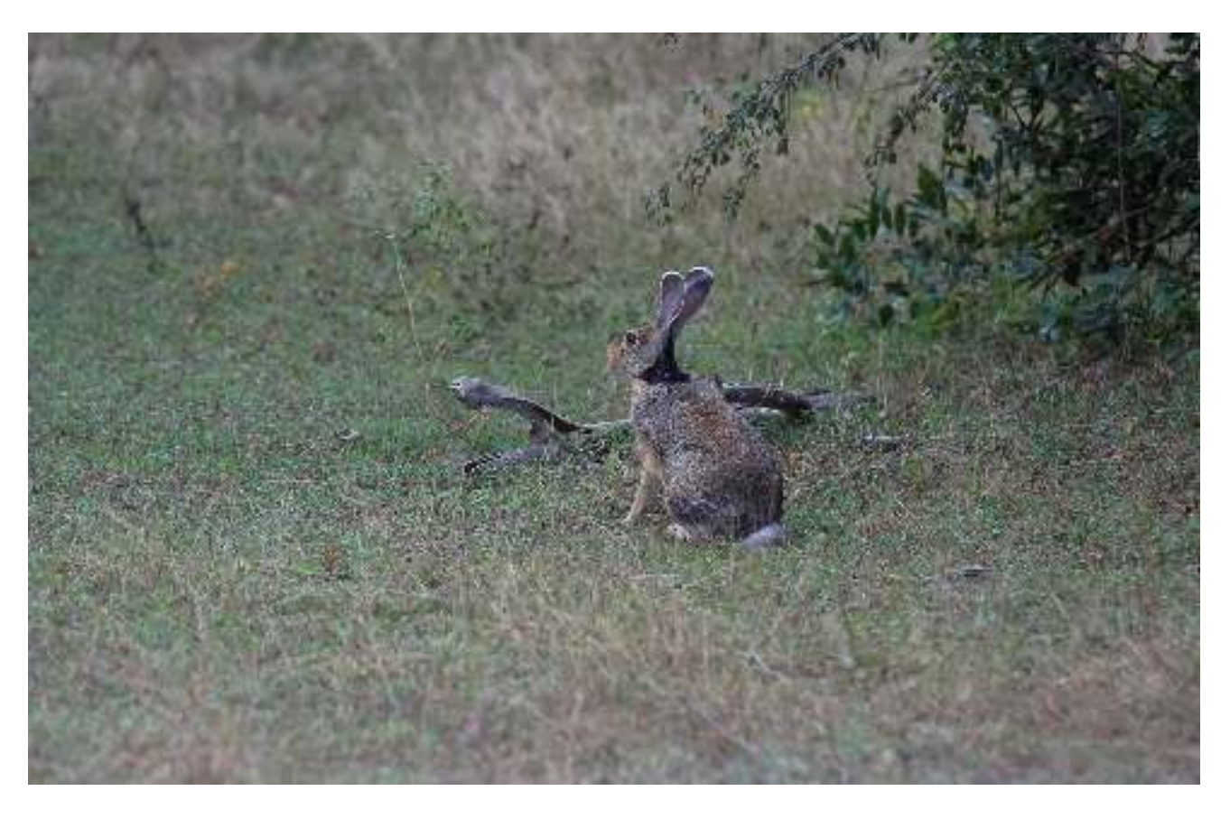
Indian hare daytime view Yala