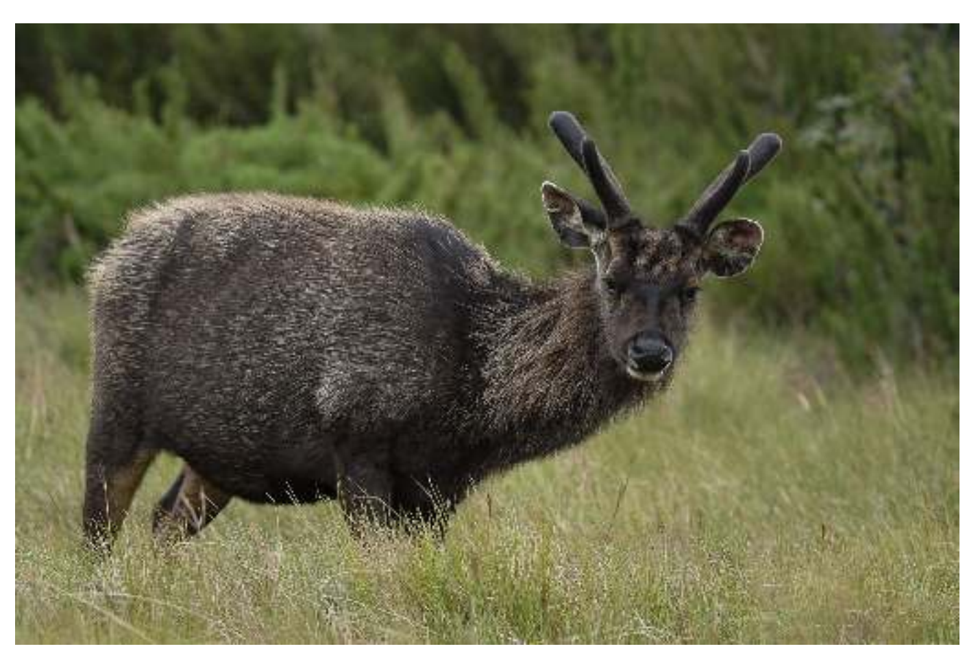
Sambar common seen in Horton Plains (if the fog clears out)