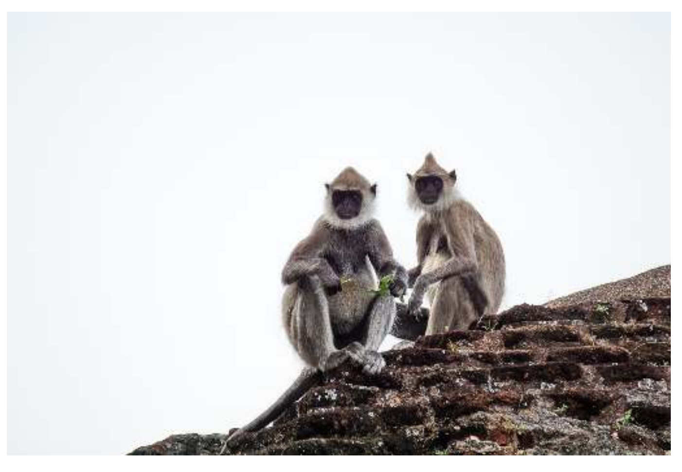
Tufted grey langur common in one of the culture sites