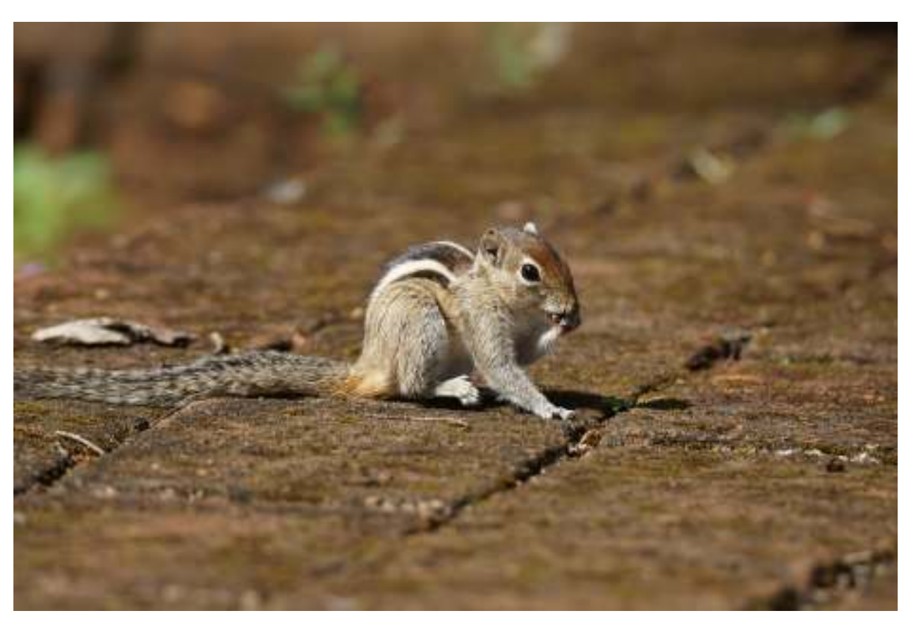
Indian palm squirrel in the garden of Sigirya rock