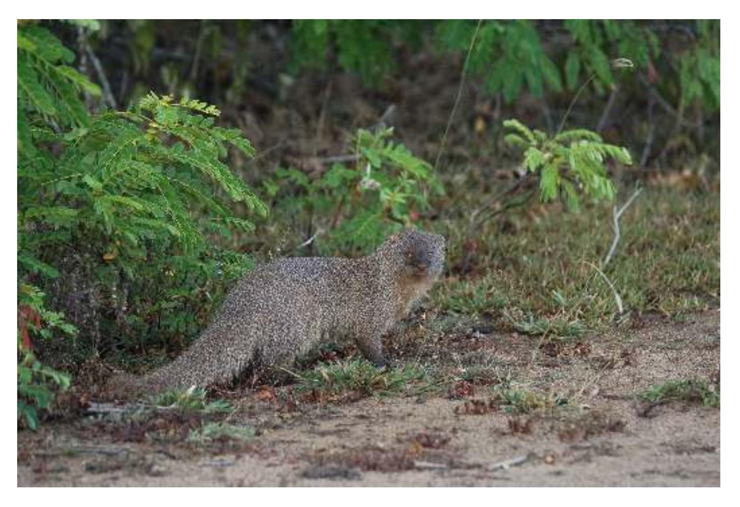
Grey mongoose, Bundula