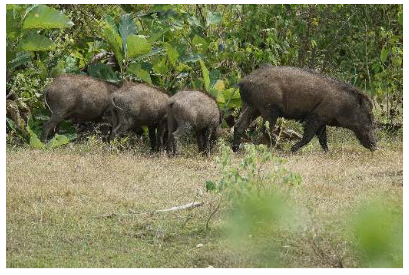
Wild boar, Udawalawa