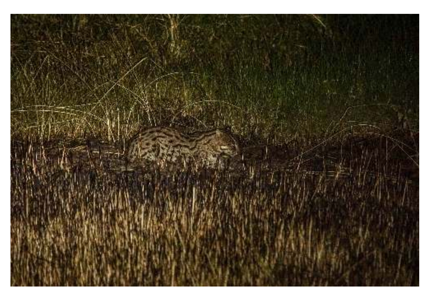
First Fishing cat around Wilpattu