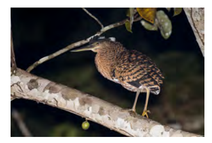
White-crested Tiger-heron, displaying