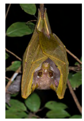
Pohle's Fruit Bat