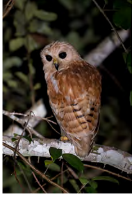
Rufous Fish Owl