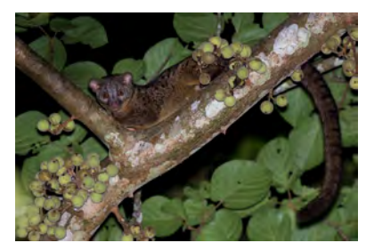
African Palm Civet

In addition to the Hippo, two notable misses were Red River Hog and Whitebreasted Guineafowl. The former is easier to see on this island than at other sites, where large groups wander widely. There is also a Picathartes colony that may be reached as a day trip from Tiwai.