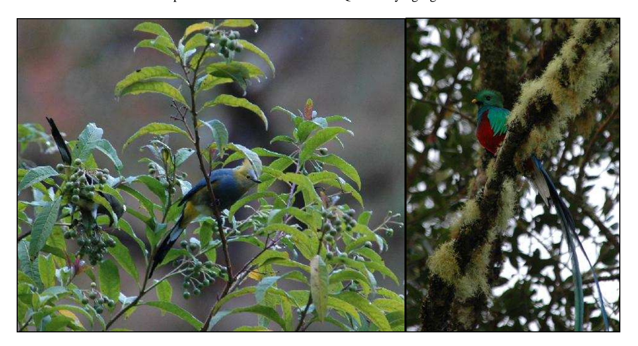
Dec. 10-11: Savegre Lodge

Around lunchtime we made the transfer to the San Gerardo de Dota/Savegre valley. The drive was quite productive with black-chested hawk, grey-headed tanager, streaked saltator and best of all fiery-billed aracari. The late afternoon at Savegre was spent in the lodge grounds mostly seeing common birds (slaty flowerpiercer, yellowish flycatcher, common bush tanager, collared redstart, ruddy treerunner, etc.) and lots of hummers at the feeders. At sunset I saw the spectacular silhouette of a male Quetzal flying right over our chalet.