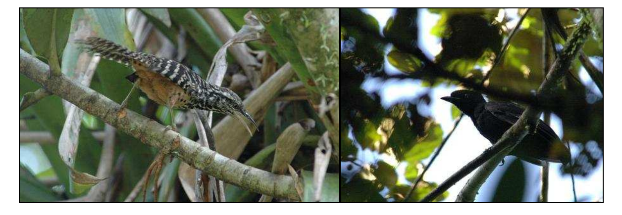
Dec. 15: Morning La Selva - afternoon La Fortuna

The guide had told us that green-and-black poison dart frog could be seen if we would walk deeper into the forest along the STR trail. I thought that our chances would be slim, but after lunch we walked the STR trail for about 2-2.5 km. After searching for a while we gave up, but amazingly we found one right next to the path on our way back. The bright green colour is just incredible. Absolutely superb animals. Elated we left and on our way back we also saw a great tinamou, a pair of shy ruddy quail doves, and a group of twelve coatis. When we returned from the forest to relax a bit around the restaurant, it turned out that a rather large flock was foraging around the restaurant. On a dead tree pied puffbirds and black-crowned tityras were seen. White-crowned parrots were feeding at eye level. A bright-rumped attila was singing from the forest edge and finally a couple of shining honeycreepers was seen well. It was now late afternoon and activity had been almost unrelenting. On my way back to the chalets I saw the amazing display of two white-collared manakins, who did a synchronized performance jumping back and forth on low vines. Luckily the last hour before dark was relatively quiet allowing a much needed break. The night walk after dinner unfortunately produced nothing again.