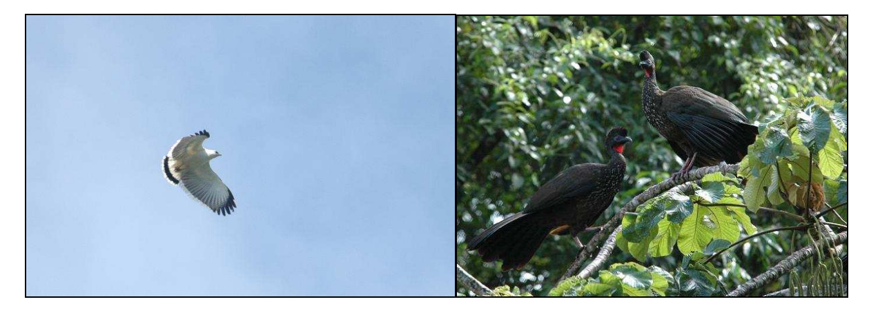
Dec. 8: Esquinas Rainforest Lodge

A night walk with two of the local guides and three other tourists was excellent for frogs, snakes, spiders and odd insects, but an American woman who claimed to be a biologist, kept chattering about herself, thus effectively killing any opportunity to see mammals.