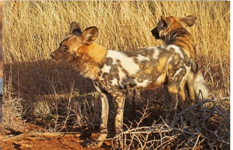
African Wild Dogs