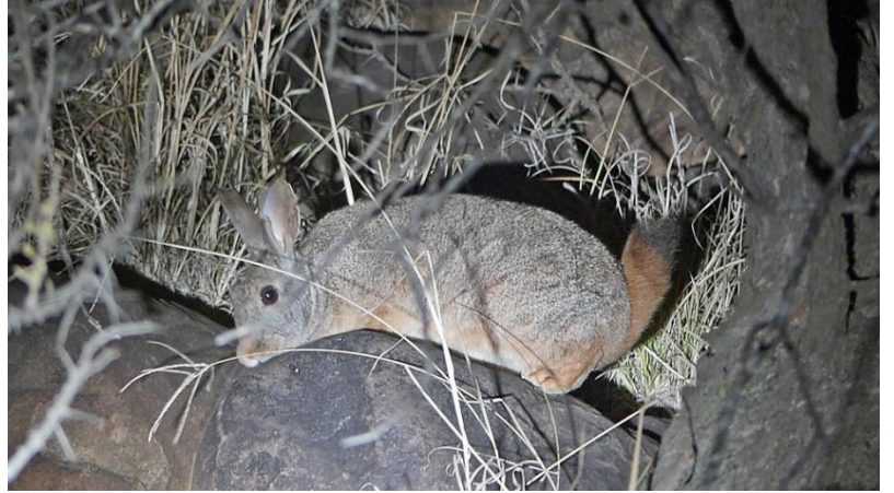
Smith's Red Rock Rabbit