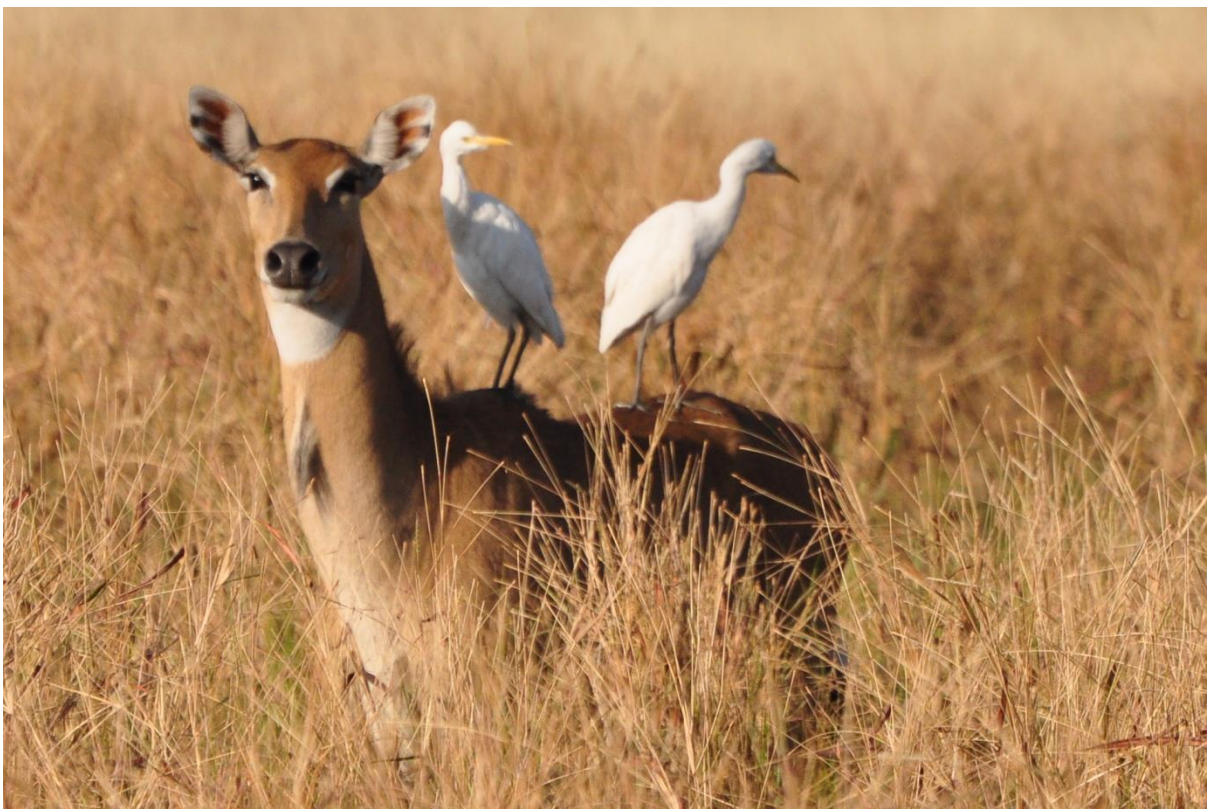
Nilgai, with Cattle Egrets, Velavadar

The afternoon jeep ride into the sanctuary began at 16:00. It started off as expected with the usual Blackbuck , Nilgai and a sow Wild Boar with 2 young. It then got a lot better when we disturbed a Striped Hyena from some vegetation at the side of the track. It shuffled off huffing as it went probably annoyed that we had disturbed its afternoon siesta. A good view was had and we were obviously delighted at the sighting. We exited at 18:00. A quick walk at dusk back at the lodge produced 2 Indian Hares .