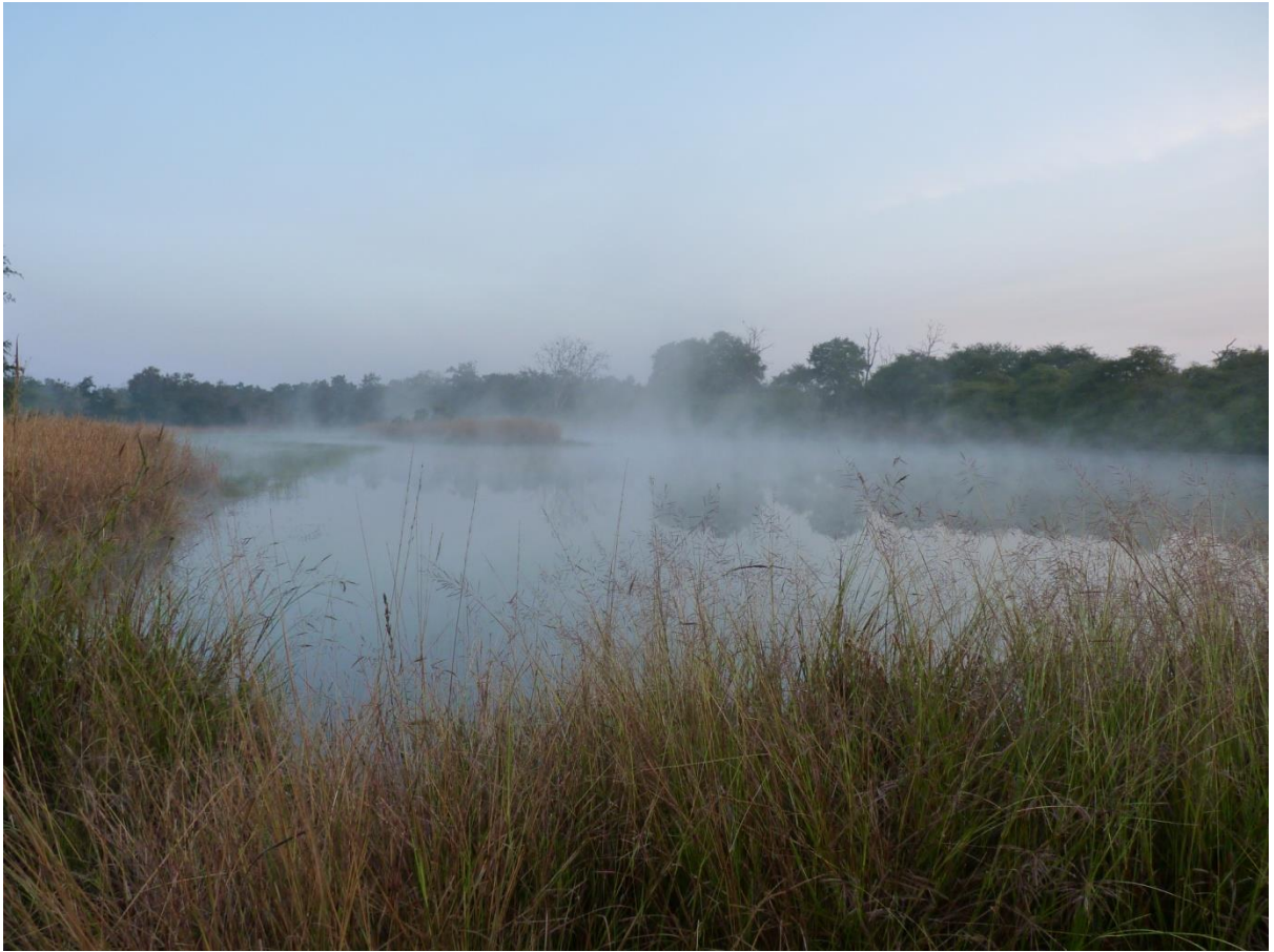
Tadoba, early morning.