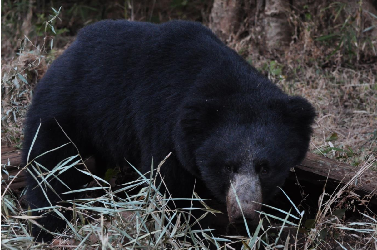
Sloth Bear, Tadoba

across the track stopped briefly to look at us and then went on their way through the trees - super views of a female with a near full grown cub - we couldn't believe our luck. The rest of the drive was uneventful but we did come across 3 female Guars before exiting at 18:00.