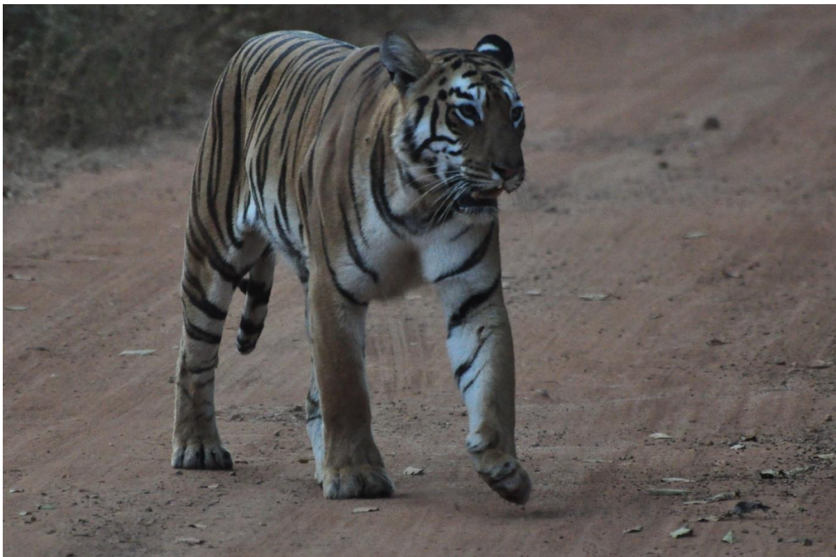
Tiger, female 1, Tadoba

Friday 6 December: Tadoba 06:00 start into the reserve. The usual Spotted Deer, Sambar and Langurs were all seen. We then came across a female Tiger , a different female than the day before, strolling along a track before moving into deep cover. But after about 15 minutes she emerged again and started walking towards us which had our driver quickly putting the jeep into reverse so not to hinder her progress along the track. After watching her for at least 10 minutes she moved off the track and disappeared amongst the trees. You could follow her progress through the trees by listening to the warning calls of the deer. Driving on we came upon a herd of 19 Guar mainly females with calves but also a few young bulls feeding in an open area of forest. We were out of the park by 11:00.