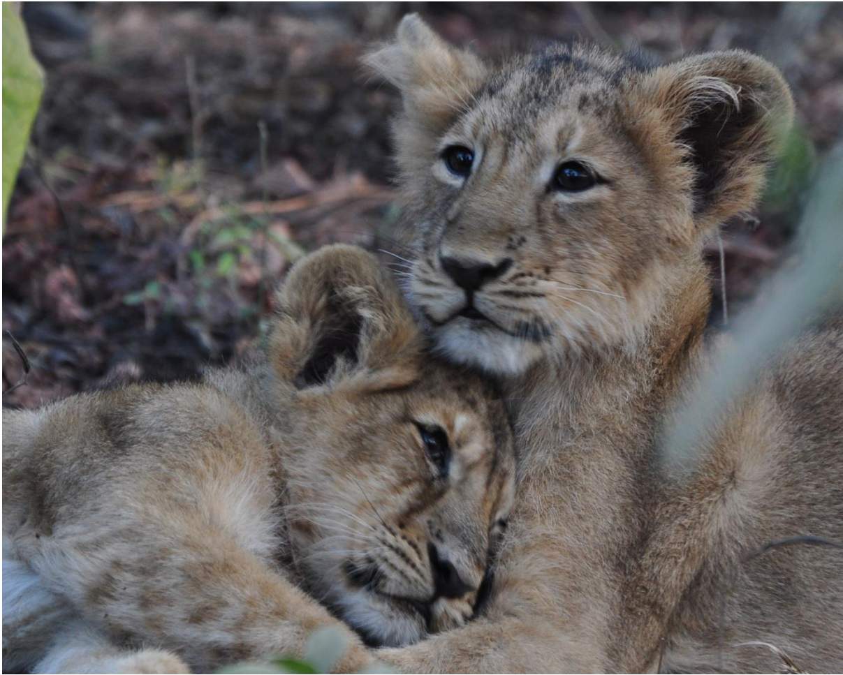
Lion cubs, Gir