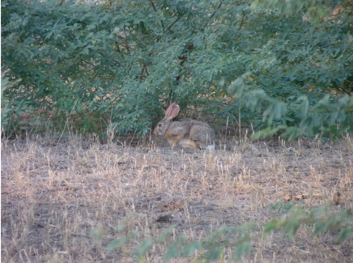
Indian Hare, Little Rann of Kutch

We then spotlit our way back to Rann Riders coming across 5 Indian Hares and 7 Wild Boar - a sow with 5 young and a solitary adult. We arrived back at Rann Riders at 20:00.