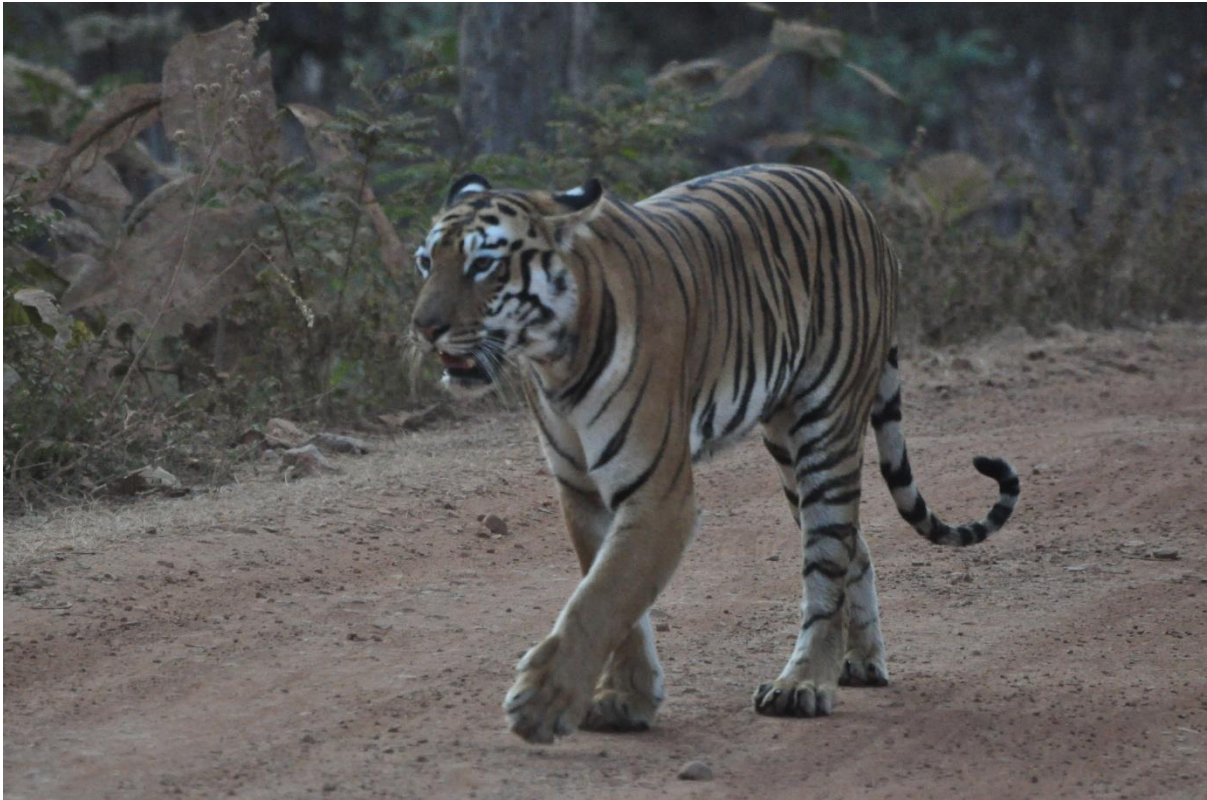
Tiger, female 2, Tadoba