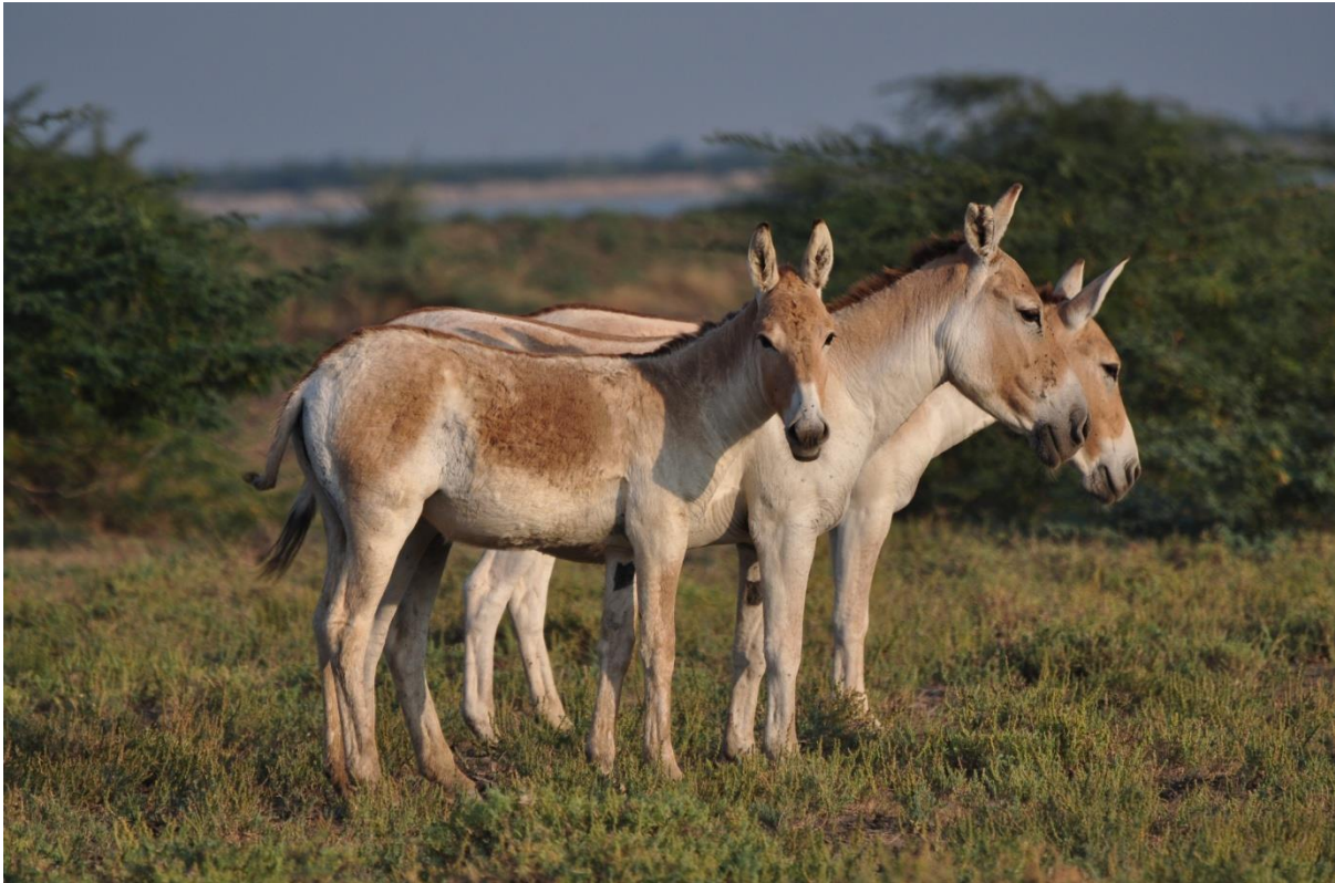
Wild Ass, Little Rann of Kutch