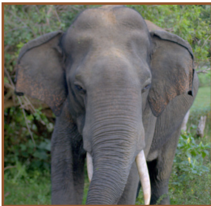
along the tsunami damaged coral reef of Unawatuna.