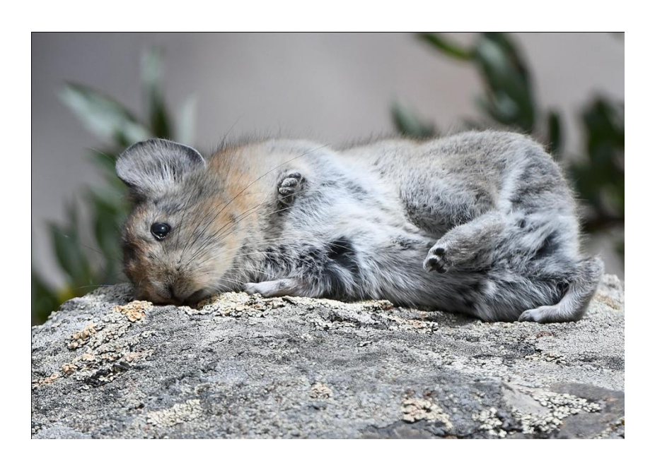
Large-eared Pika sunbathing