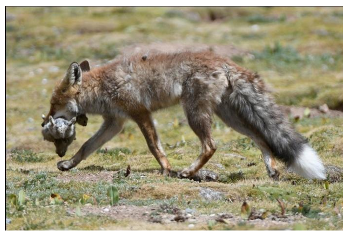
A red fox with 2 Black-lipped Pikas in its mouth