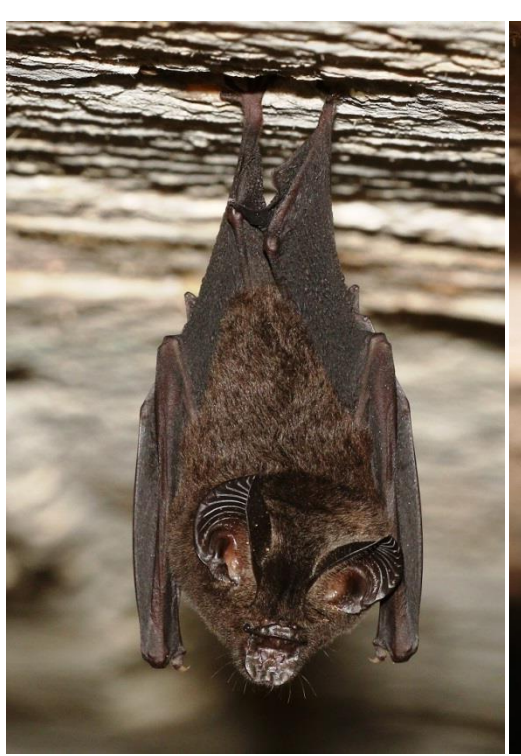
Small-disc Roundleaf Bat (Peter Wheeler)