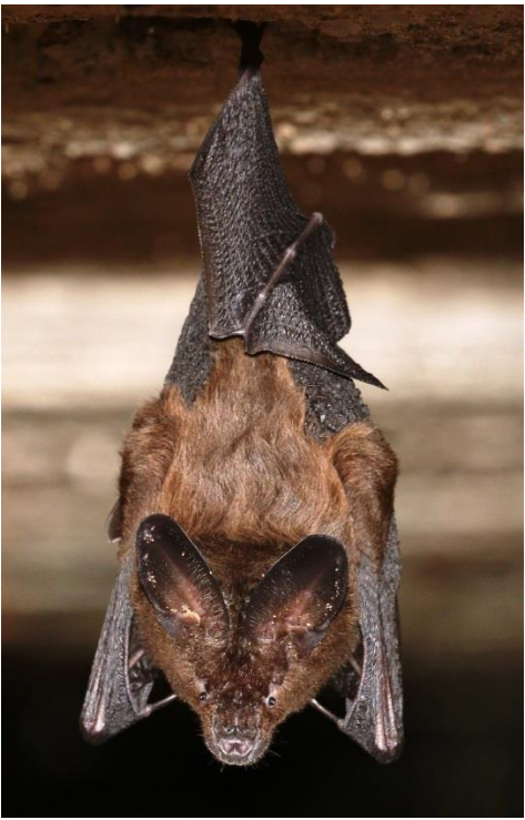
Malayan Slit-faced Bat