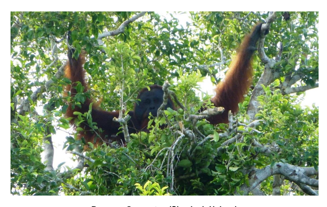
Bornean Orangutan (Sheelagh Halsey)