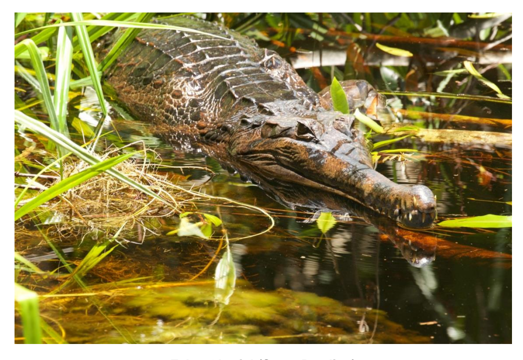
False Gharial

We also saw a selection of unidentified toads, frogs, geckos, skinks, lizards and some impressive flying lizards.