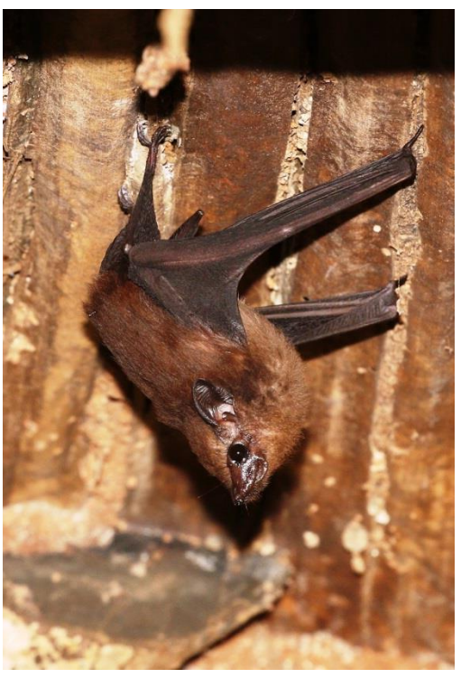
Lesser Sheath-tailed Bat (Peter Wheeler)