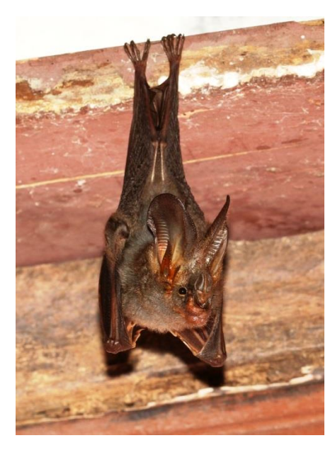
Lesser False Vampire (Peter Wheeler)