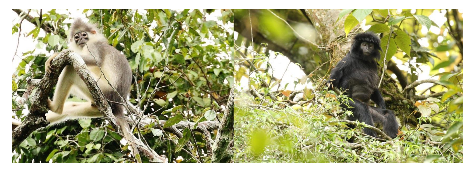
Mitred Langur

Heard but sadly not seen at Gunung Gede.