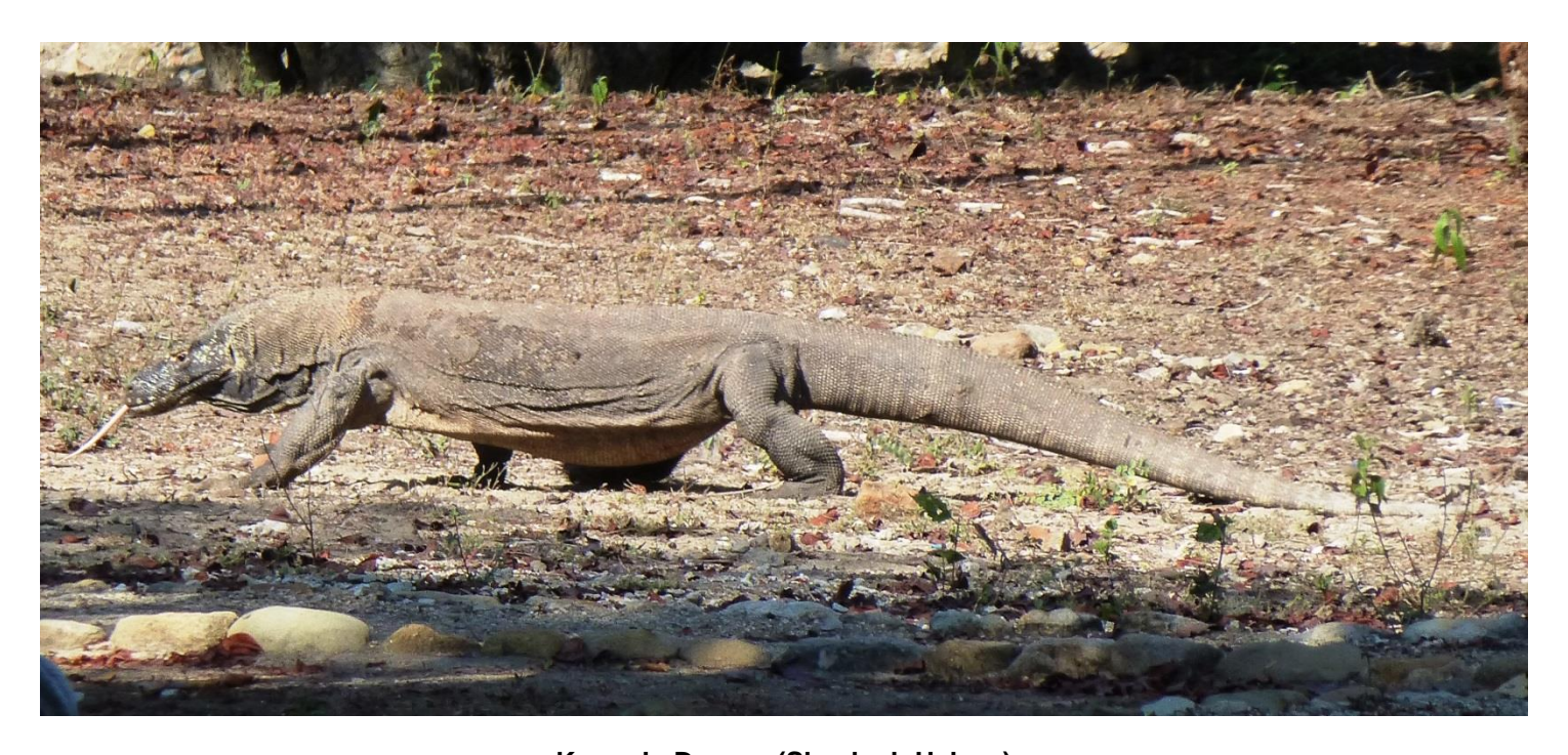
Komodo Dragon (Sheelagh Halsey)