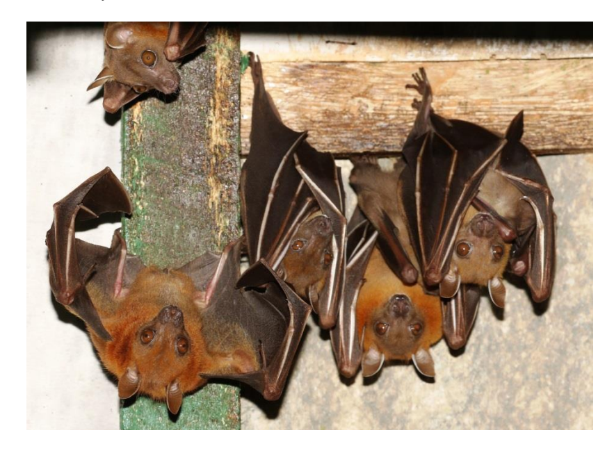
Greater Short-nosed Fruit Bat