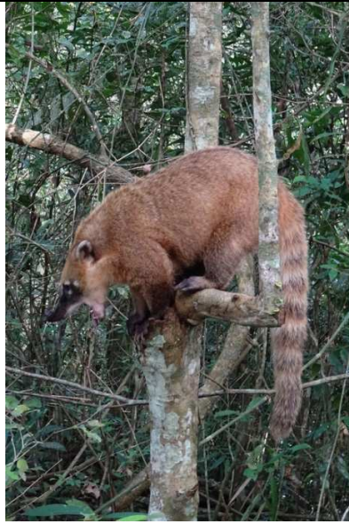
South American Coati