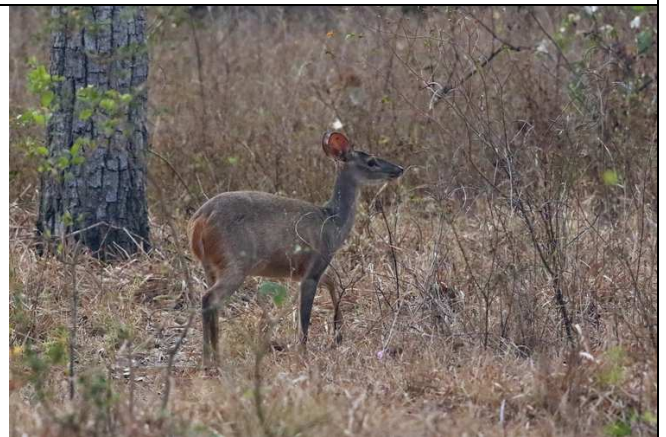
Red brocket Deer