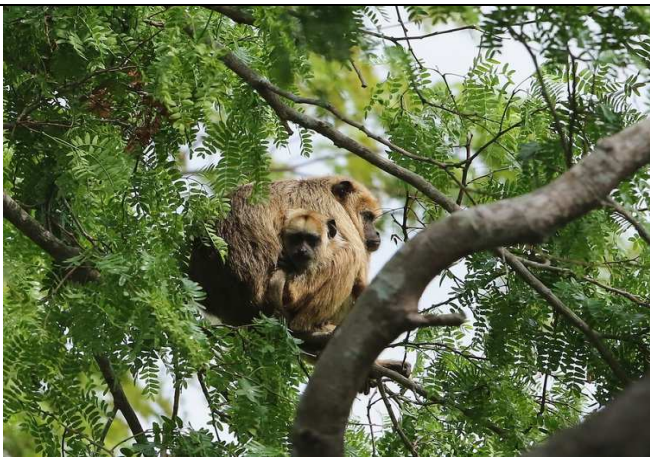
Black and Gold Howler