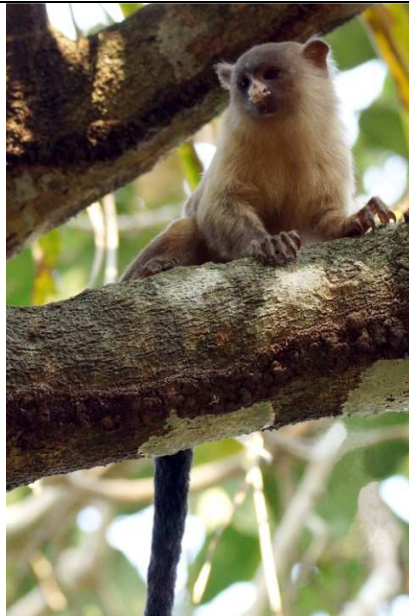
Black-tailed (Pantanal) marmoset