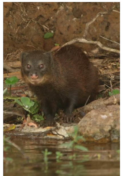
Top: Side-striped Jackal and Bunyoro Rabbit; Middle: Striped Ground Squirrel and Carruther's Mountain Squirrel Bottom: Banded Mongoose and Marsh Mongoose