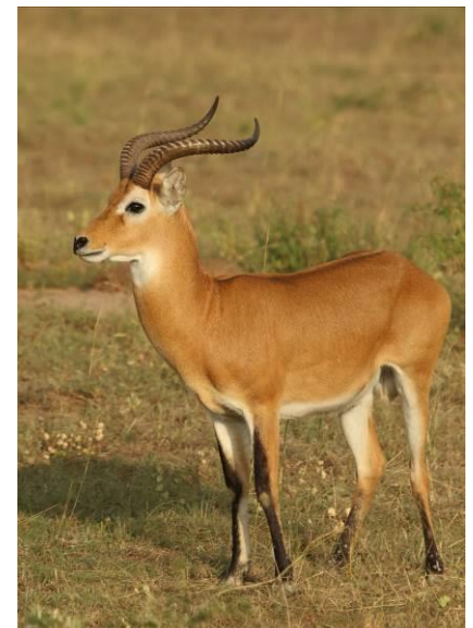
Above: Lelwel and Uganda Kob