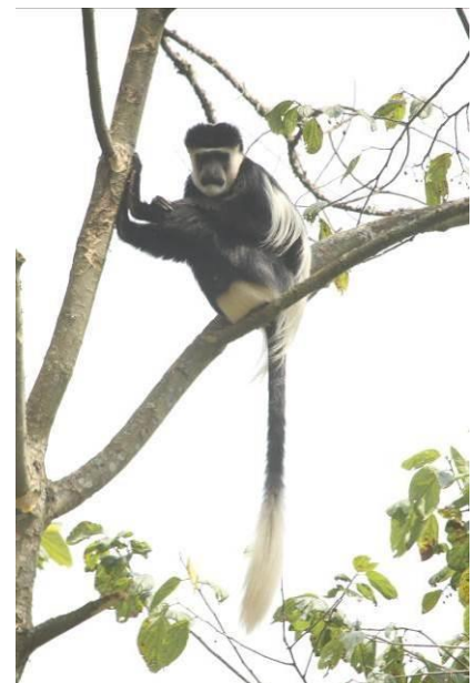
Top: Chimpanzee and Patas Monkey; Middle: Uganda Grey-cheeked Mangabey and Red-tailed Monkey; Bottom: L'Hoest's Monkey and Eastern Black-and-White Colobus