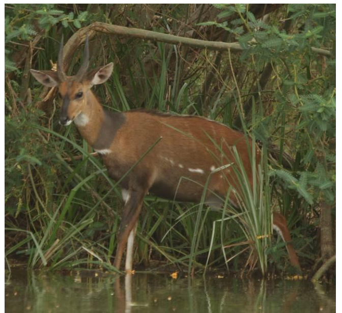
Top: Sudan Oribe and Eastern Bohor Reedbuck; Middle: Cape Buffalo (left) and Lake Chad Buffalo (right); Bottom: Nile Bushbuck (left) and Cape Bushbuck (right)