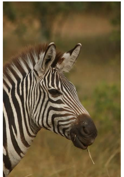
Top: Southern White Rhinoceros and Savannah Elephant; Middle: Giant Forest Hog Bottom: Rothschild's Giraffe and Grant's Zebra