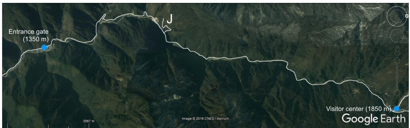
Fig. 2. Labahe NR entrance road. Note different map orientation from Fig. 1.

The 15 km entrance road (Fig. 2) provides access to lower altitudes, but birding was rather poor. There are few opportunities to escape the noise of the rushing river and the steep walls of the gorge, except along the short Road J. The last few kilometers of the road before the entrance gate are pockmarked with divots from falling rocks. It's probably smartest to avoid walking this stretch, especially if there's wind or rain. 200-300 m down the entrance road from the visitor center, there's a small road to the east that leads past a few buildings up into the hillside forest. I didn't walk it and it isn't marked in my maps, but in satellite imagery it seems to stretch for at least a couple kilometers, and could be worth exploring.