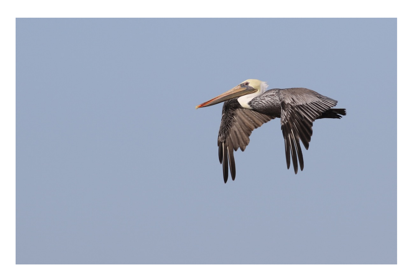
Brown Pelican (above) Heerman's Gull and California Gull (below)