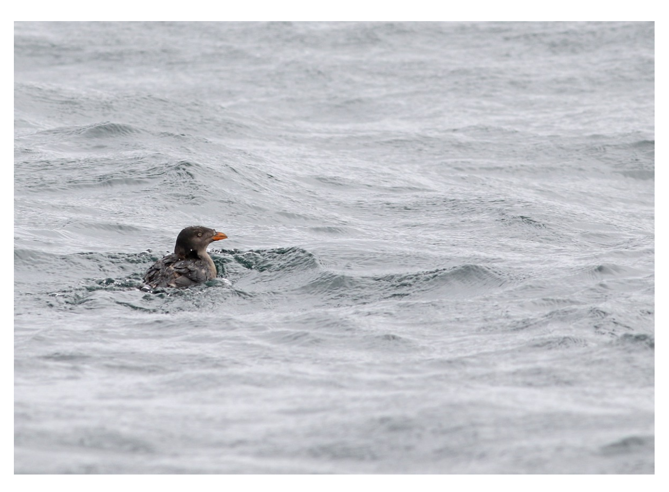
WISE BIRDING HOLIDAYS LTD - CALIFORNIA: Bobcats, Bears, Birds & Yosemite, Sep 2016