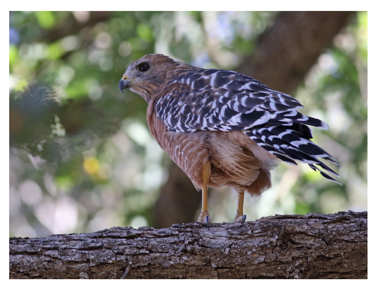
This Red-shouldered Hawk was far from shy at The Pinnacles (above) One of three Prairie Falcons seen in Yosemite on one day (below)