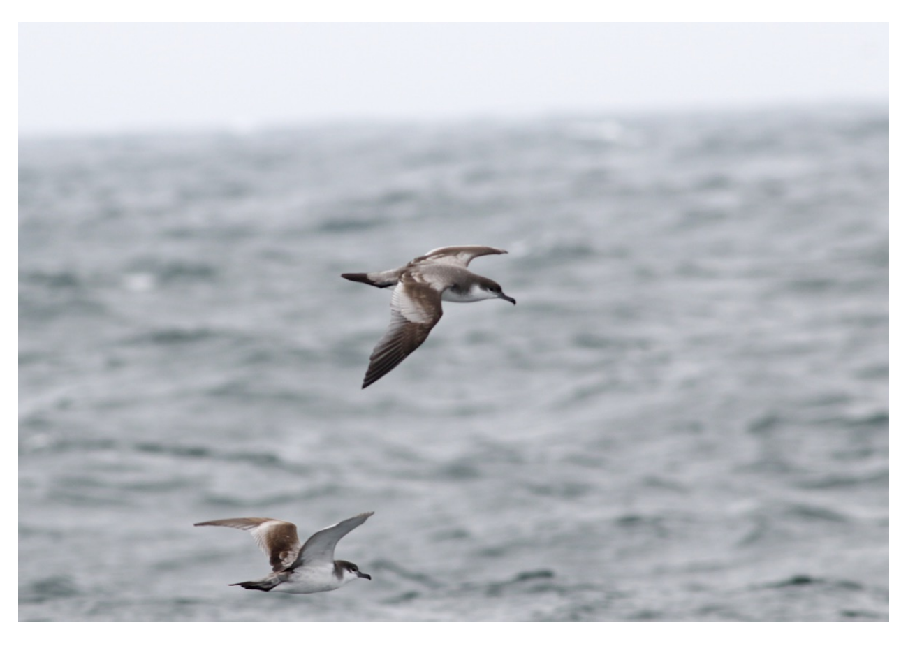
WISE BIRDING HOLIDAYS LTD - CALIFORNIA: Bobcats, Bears, Birds & Yosemite, Sep 2016