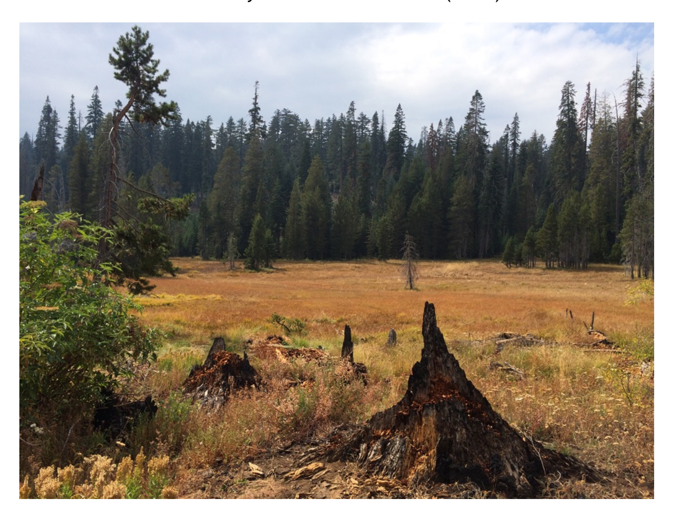
WISE BIRDING HOLIDAYS LTD - CALIFORNIA: Bobcats, Bears, Birds & Yosemite, Sep 2016