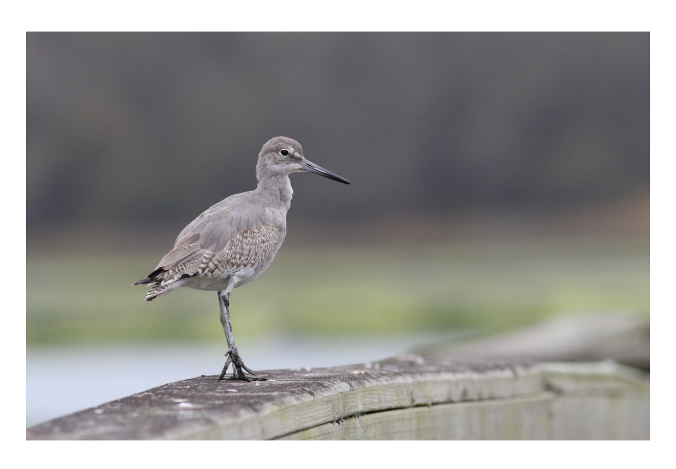
WISE BIRDING HOLIDAYS LTD - CALIFORNIA: Bobcats, Bears, Birds & Yosemite, Sep 2016