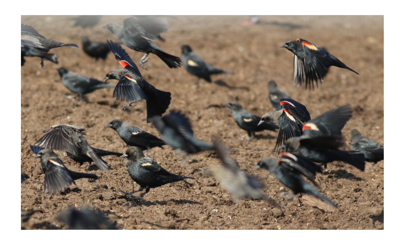
Red-winged Blackbirds at Moonglow Dairy (above) and Anna's Hummingbird (below)