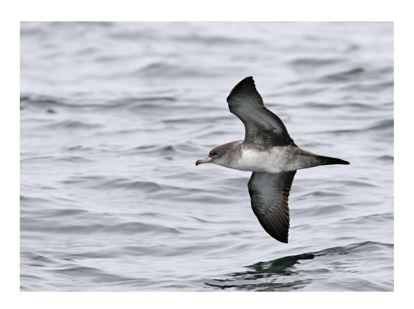
Pink-footed Shearwater (above) and the stunning Buller's Shearwater (below)