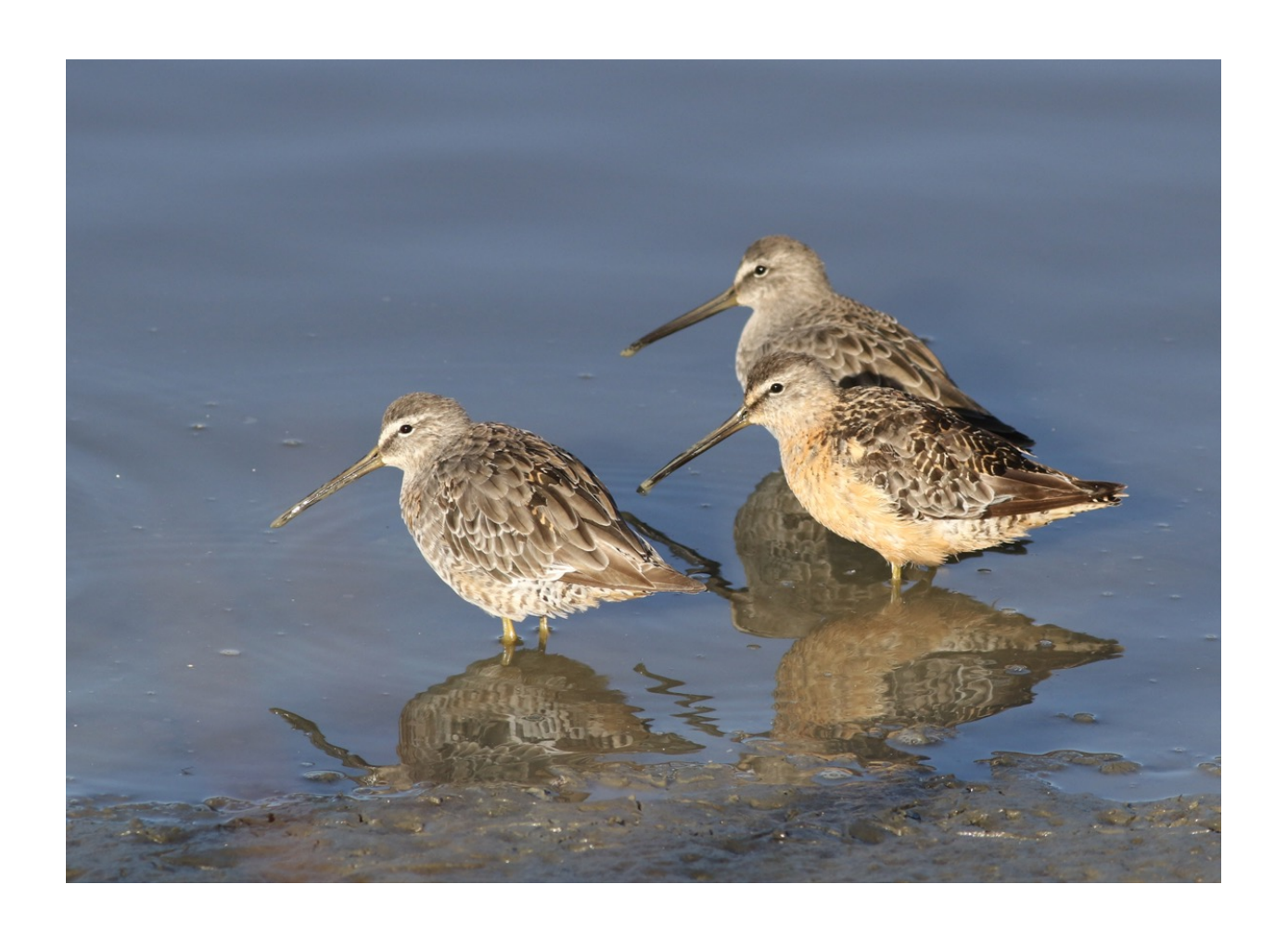
Long-billed Dowitchers (above) and "Western" Willet (Below)