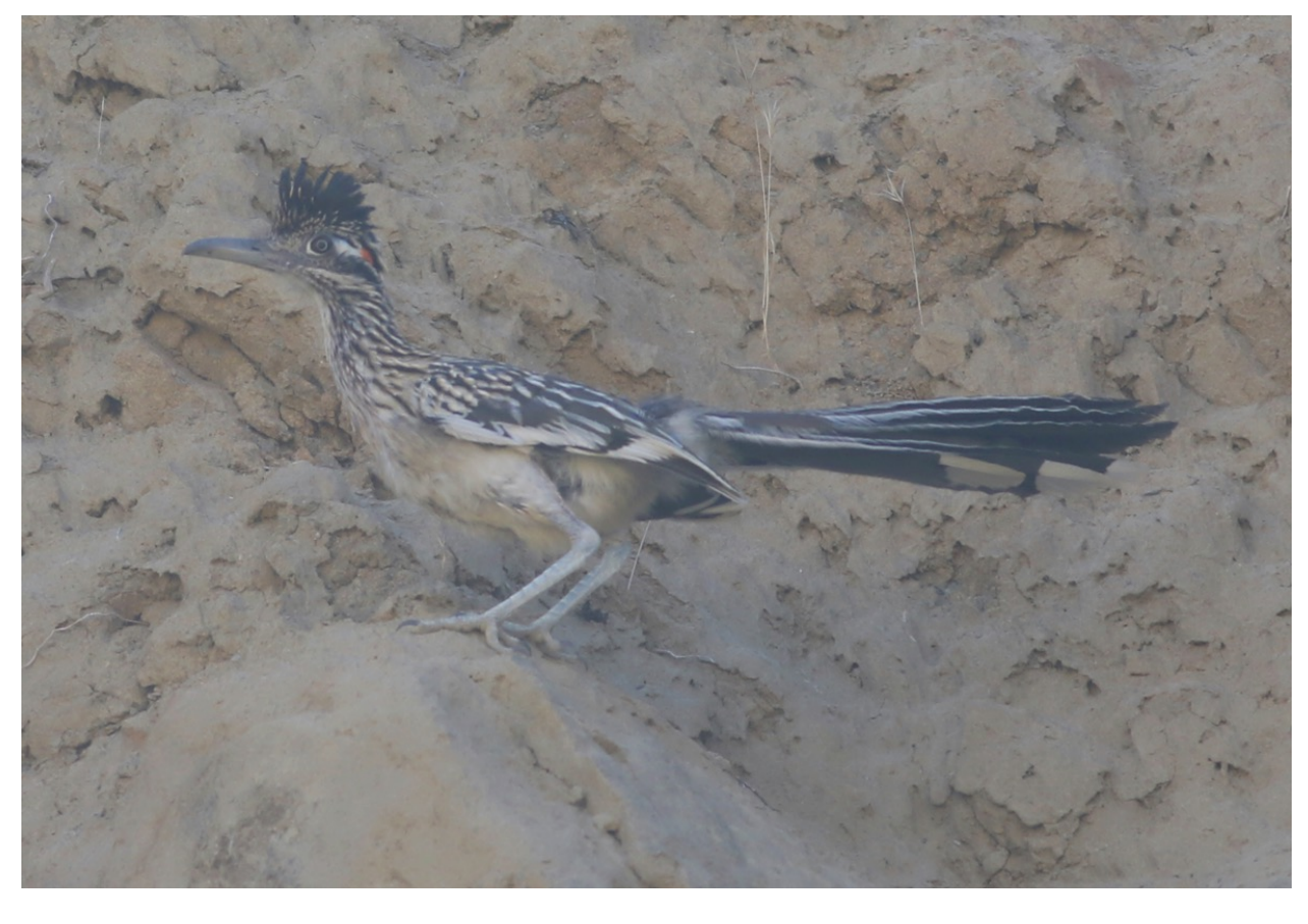
WISE BIRDING HOLIDAYS LTD - CALIFORNIA: Bobcats, Bears, Birds & Yosemite, Sep 2016