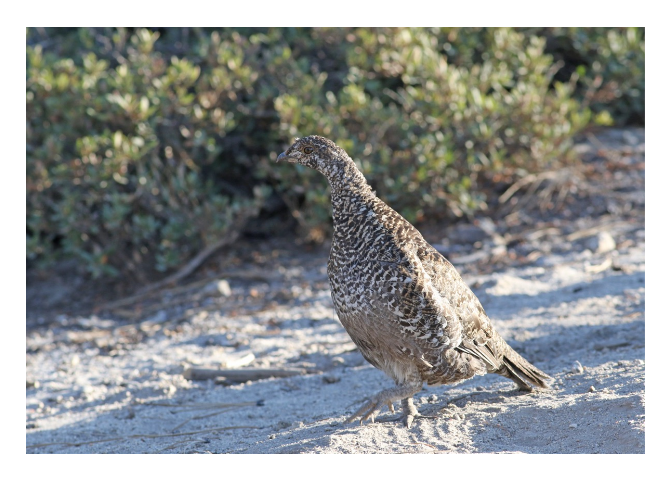
This Sooty Grouse was one of a group of six birds in Yosemite (above) Greater Roadrunner showed well on the Old Hernandez Road (below)