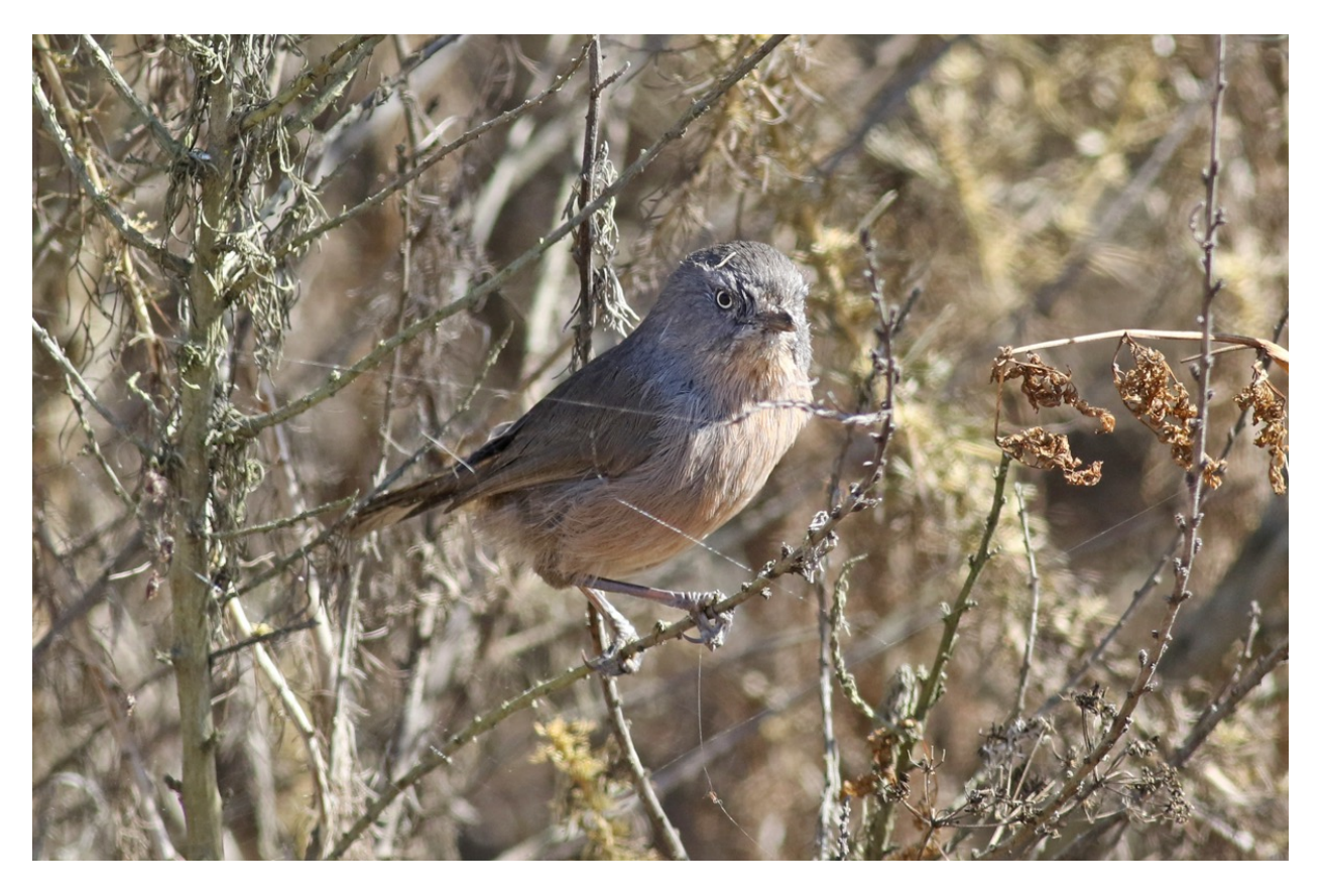
WISE BIRDING HOLIDAYS LTD - CALIFORNIA: Bobcats, Bears, Birds & Yosemite, Sep 2016