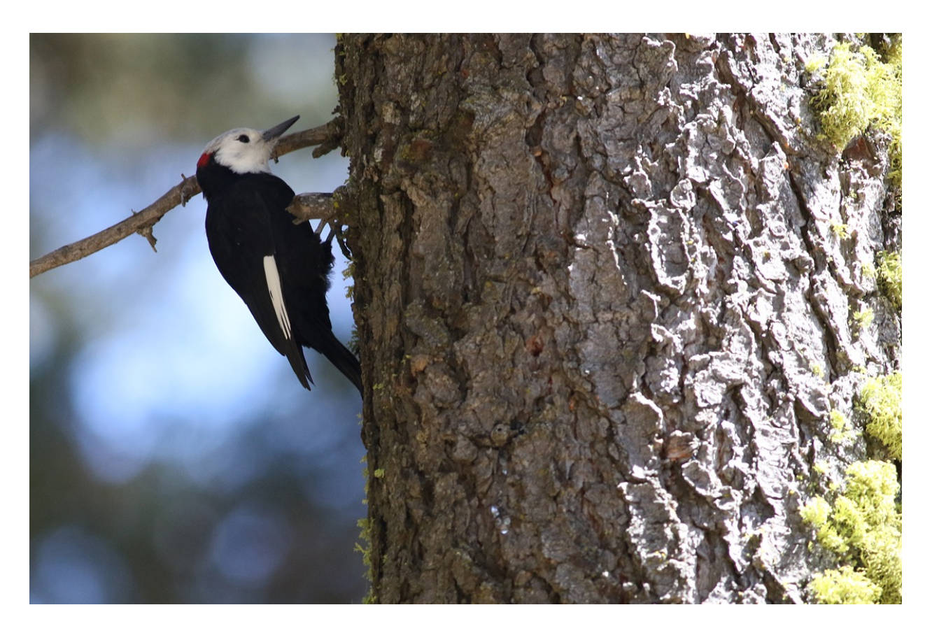
White-headed Woodpecker in Sequoia NP (above) One of the many meadows in Yosemite NP (below)