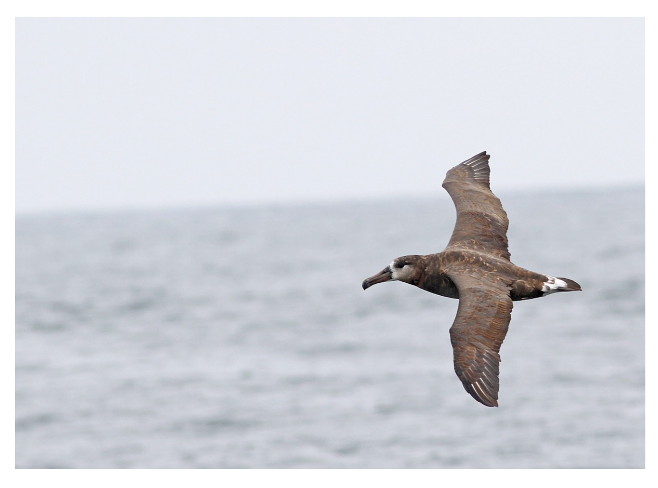
Black-footed Albatross were a joy to watch on the boat trips (above) and Rhinoceros Auklets were seen well in small numbers (below)