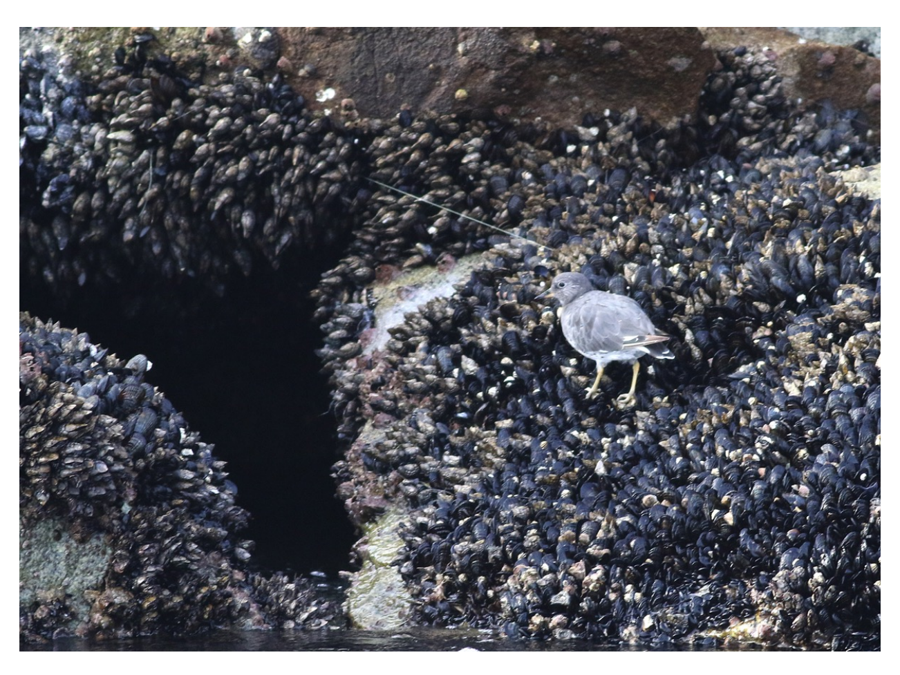
WISE BIRDING HOLIDAYS LTD - CALIFORNIA: Bobcats, Bears, Birds & Yosemite, Sep 2016