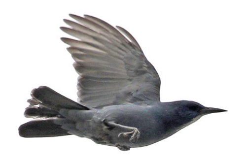
Pinyon Jay (above) Wise Birding Group in Sequoia NP