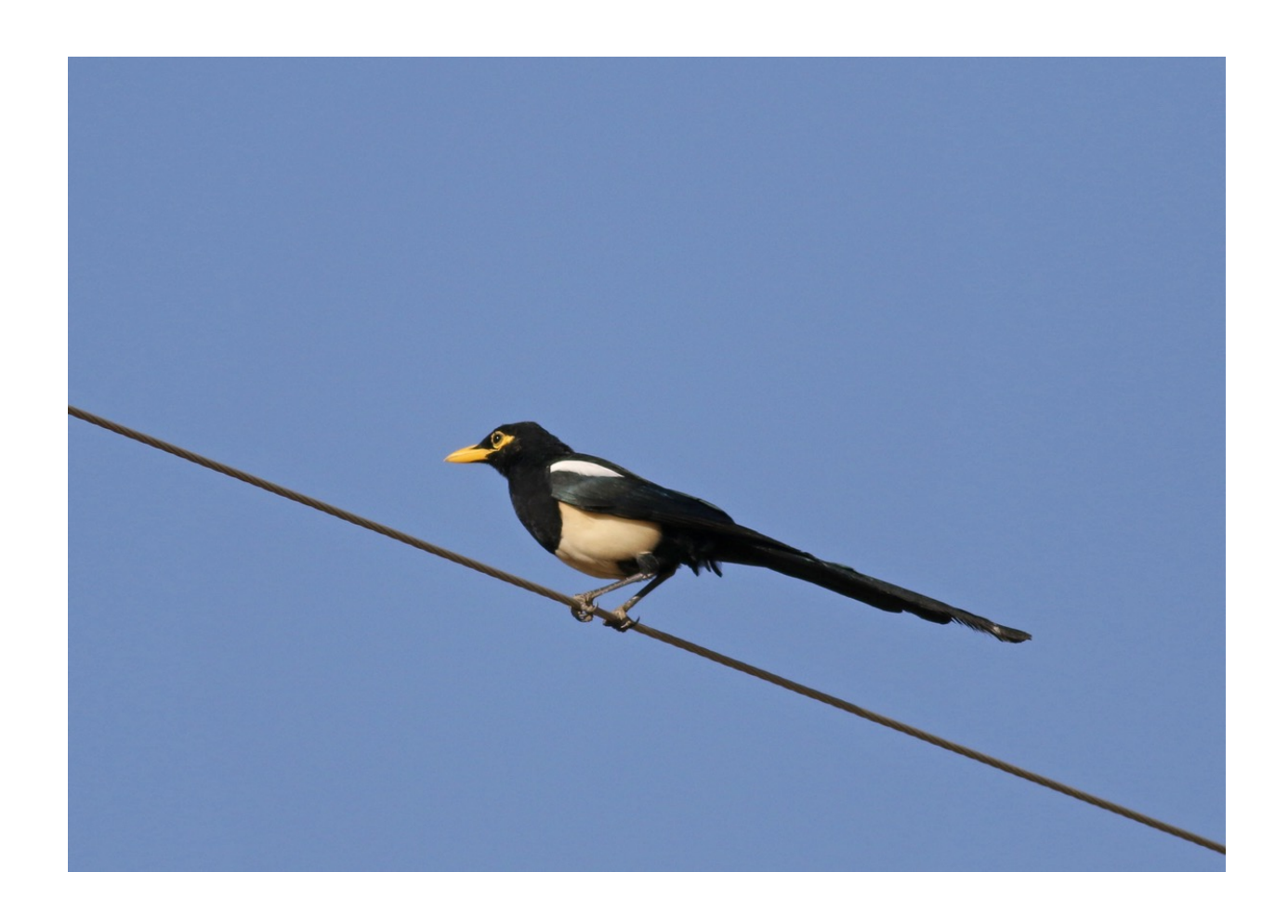
Yellow-billed Magpies (above) and Wrentit (below) are both specialities of California