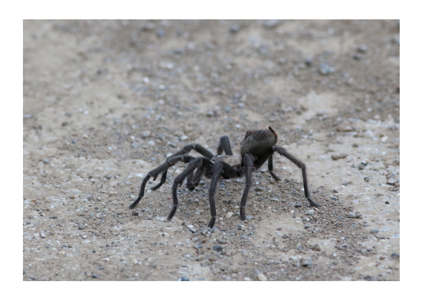
Wandering Tarantula (above) and Gopher Snake (below)