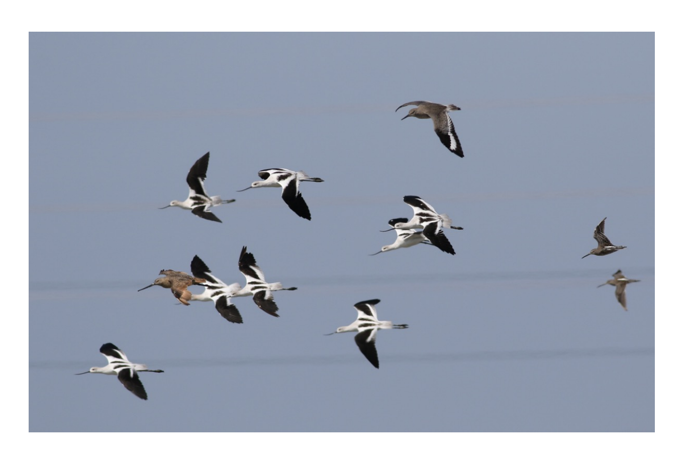
Mixed wader flock of Avocet, Marbled Godwit, Willet & LB Dowitcher (above) and Long-billed Curlew (below)