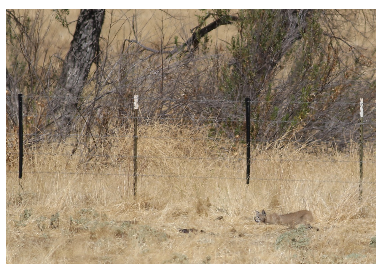
WISE BIRDING HOLIDAYS LTD - CALIFORNIA: Bobcats, Bears, Birds & Yosemite, Sep 2016