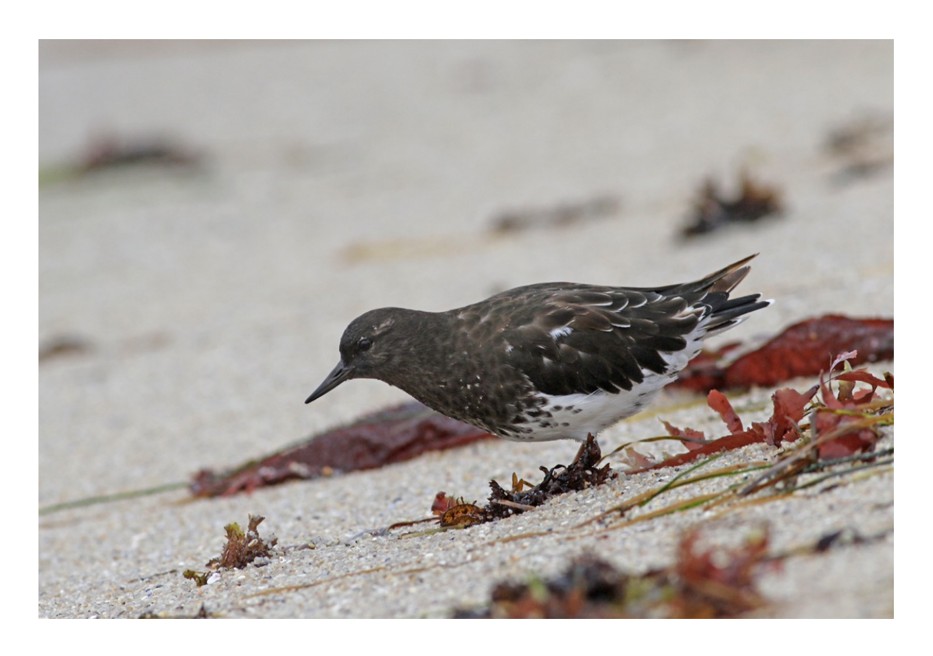
Black Turnstone (above) and Surfbird (below) are both west coast specialities