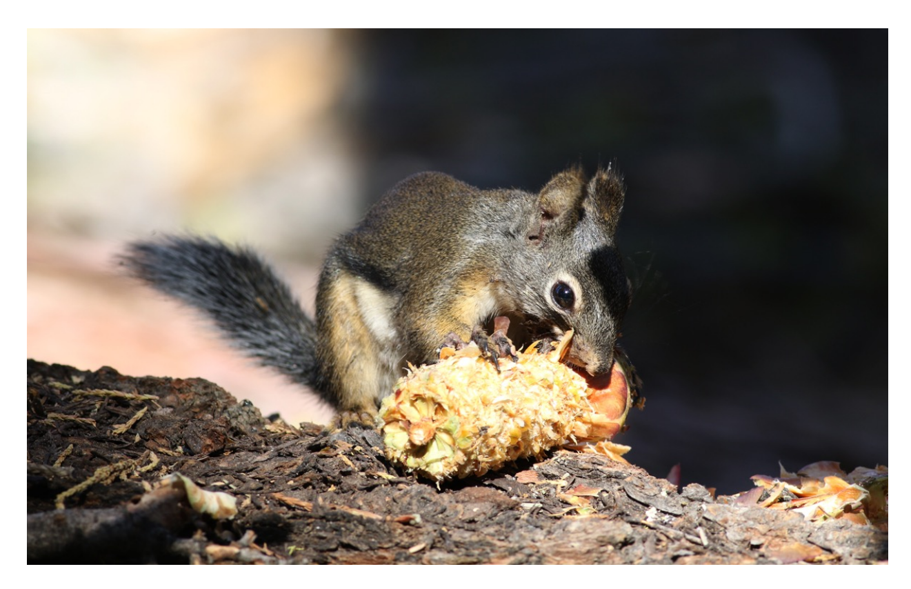
WISE BIRDING HOLIDAYS LTD - CALIFORNIA: Bobcats, Bears, Birds & Yosemite, Sep 2016