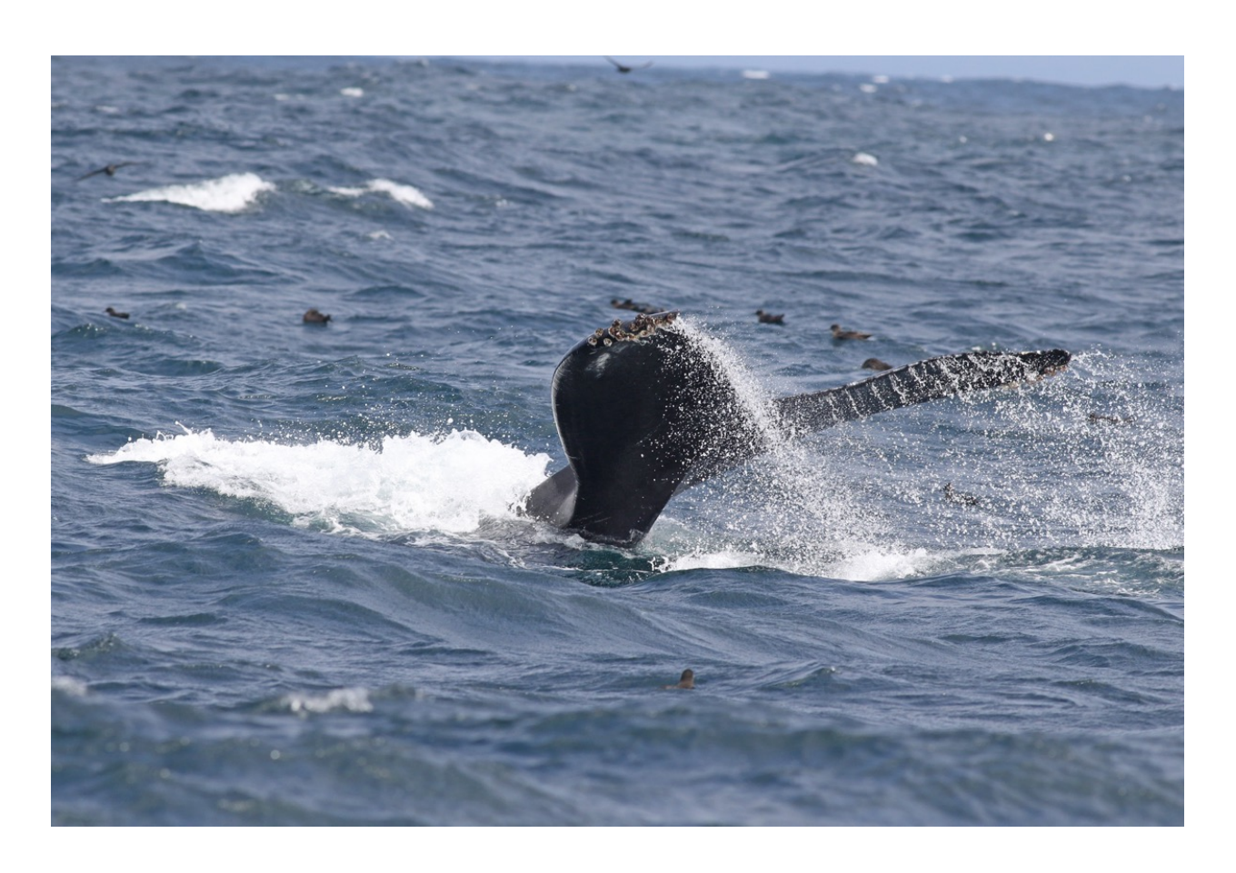
It was great year for Humpback Whales in Monterey Bay this year with numerous sightings of many different animals