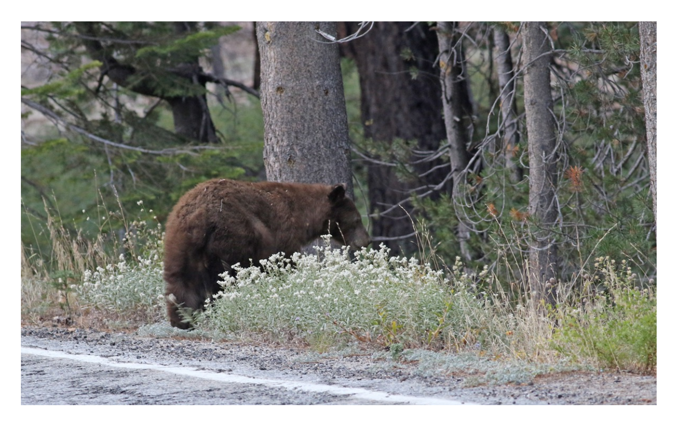
This Black Bear in Yosemite crossed the Glacier Point Road (above) The impressive face of El Capitan from Yosemite Valley (below)