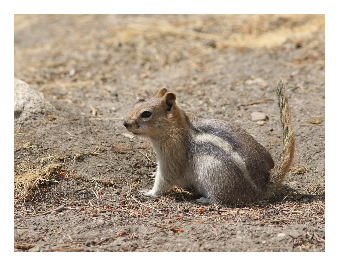
Golden-mantled Ground Squirrel in Yosemite NP (above) Douglas's Squirrel in Sequoia NP (below)