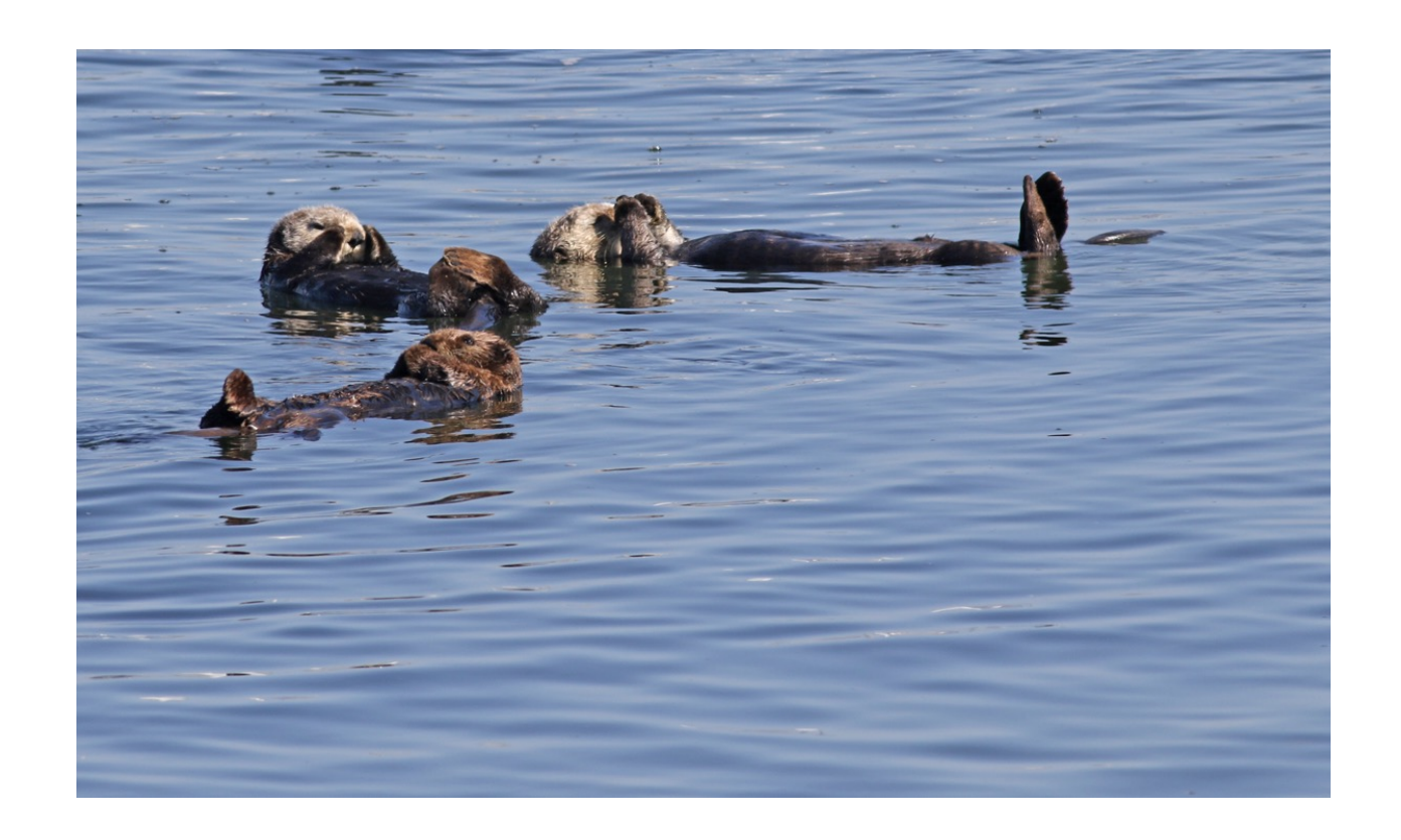
Sea Otters were common sight on the coast (above) and a Steller's Sea Lion resting with a California Sea Lion was seen on one of our pelagics (below)