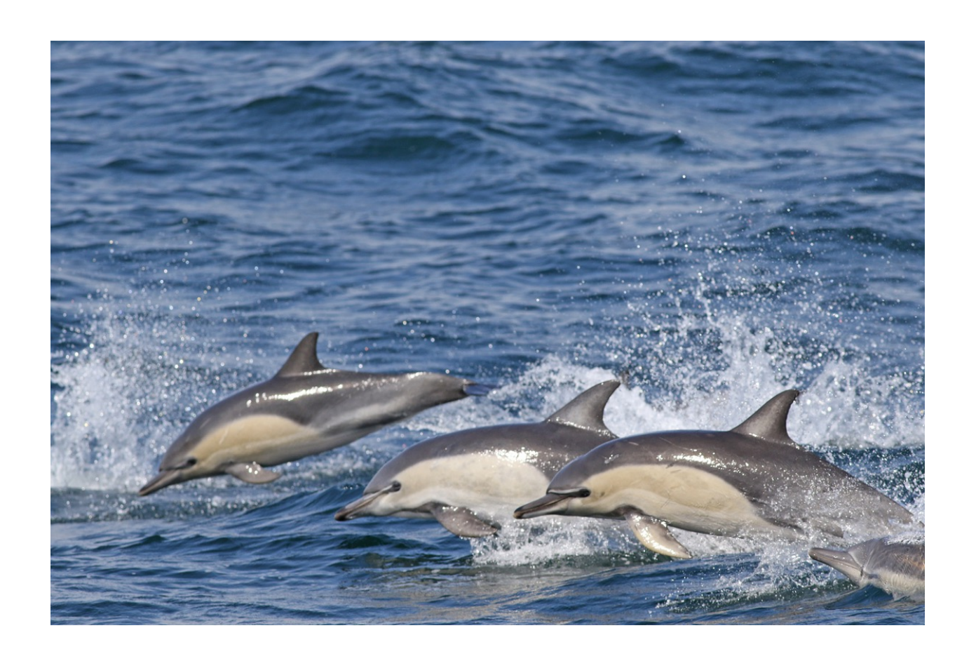
Short-beaked Common Dolphins (above) The seldom seen Baird's Beaked Whale (below)