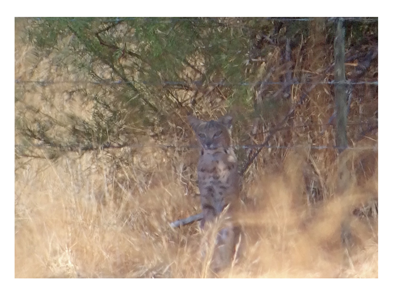
This young Bobcat showed very well as it hunted Rabbits off the Old Hernandez Road