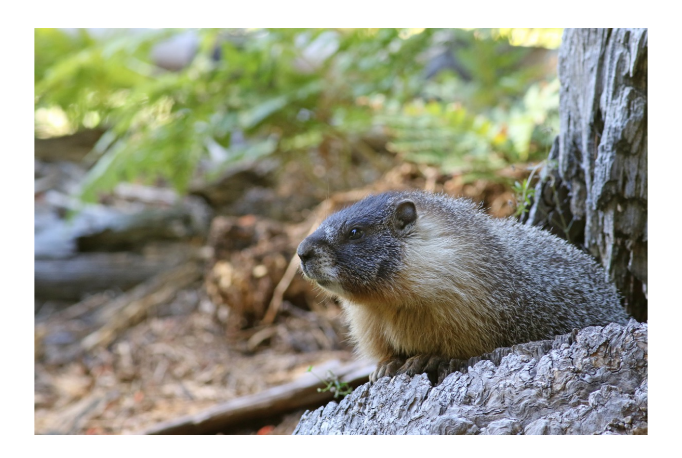
Yellow-bellied Marmots entertained us in Sequoia NP (above) Lodgepole Chipmunks posed also in Sequoia NP (below)