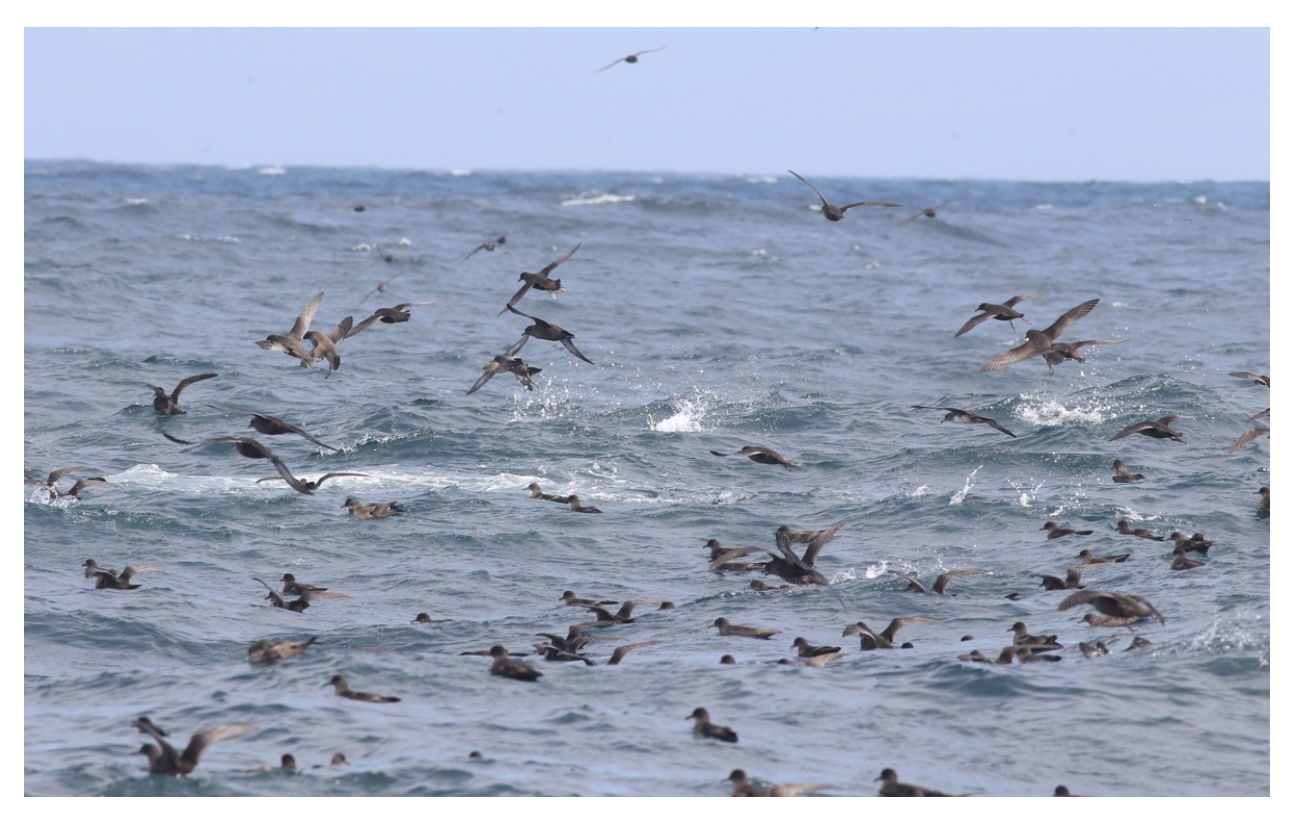
We saw an incredible 20,000+ Sooty Shearwaters in Monterey Bay (above) One of the tiny Pacific Tree Frogs seen in Tuolumne Meadow, Yosemite (below)