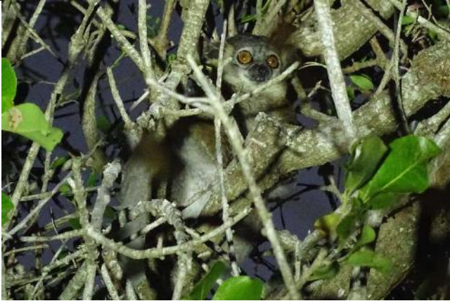
White-footed Sportive Lemur