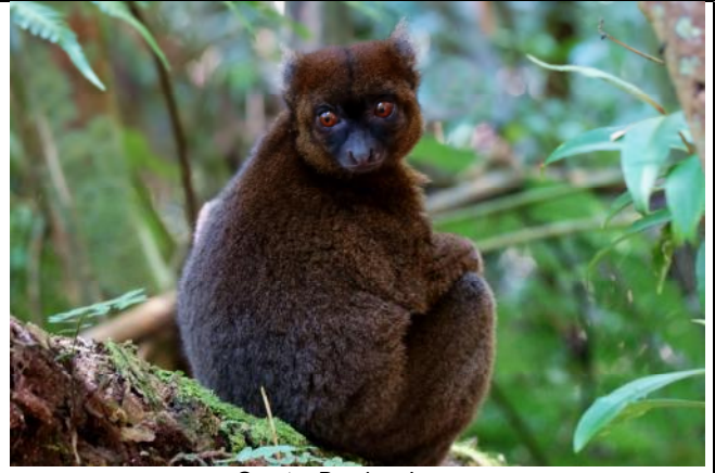
Greater Bamboo Lemur