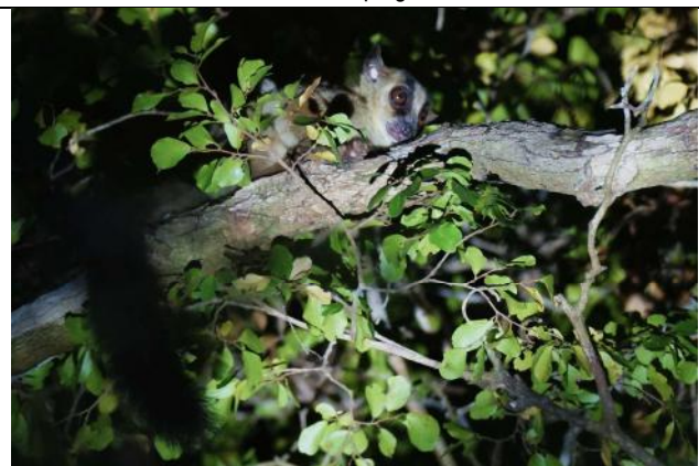
Pale Fork-marked Lemur