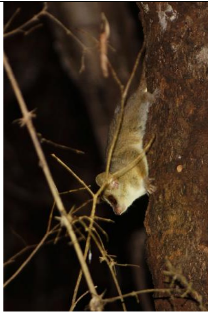
Gray Mouse Lemur