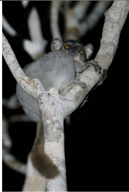
Red-tailed Sportive Lemur