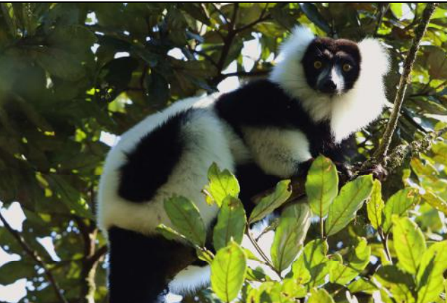
Black & white Ruffed Lemur