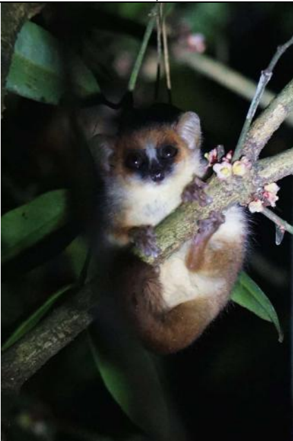
Goodman's Mouse Lemur