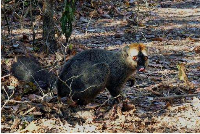
Red-fronted Brown Lemur