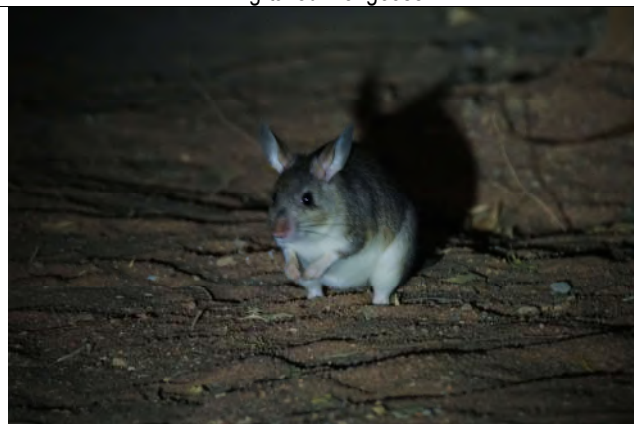
Giant Jumping Rat