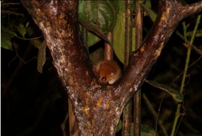
Rufous Mouse Lemur