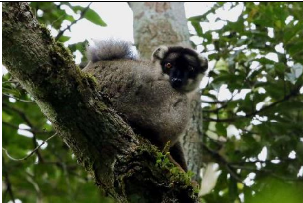
Common Brown Lemur