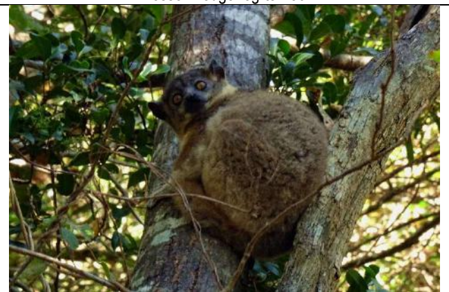
Hubbard's Sportive Lemur