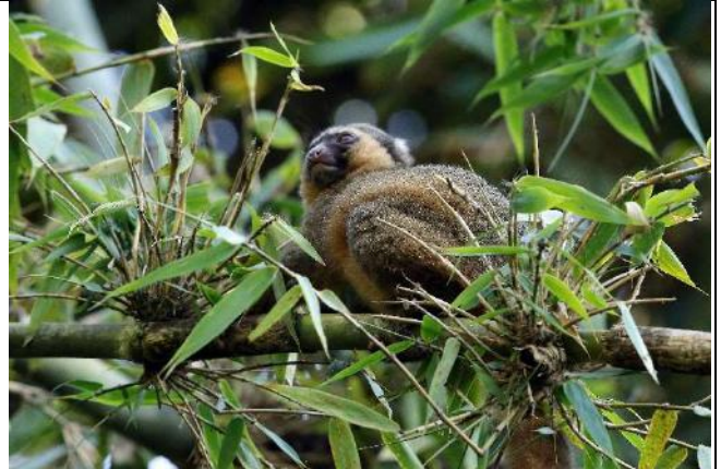
Golden Bamboo Lemur