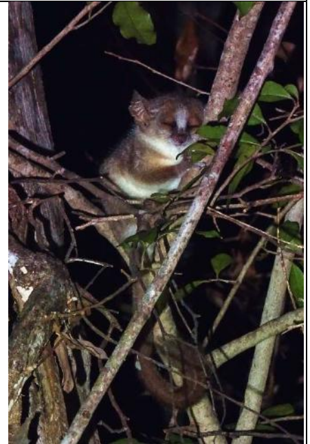
Madame Berthe's Mouse Lemur