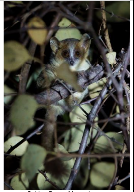
Golden-Brown Mouse Lemur