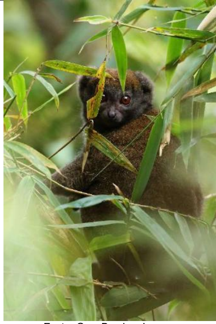
Easter Grey Bamboo Lemur