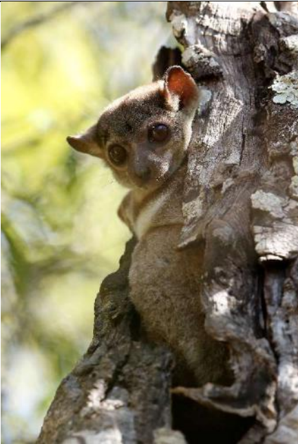
Milne-Edwards Sportive Lemur