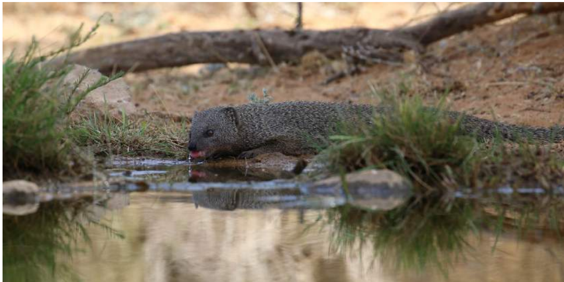
Cape Grey Mongoose