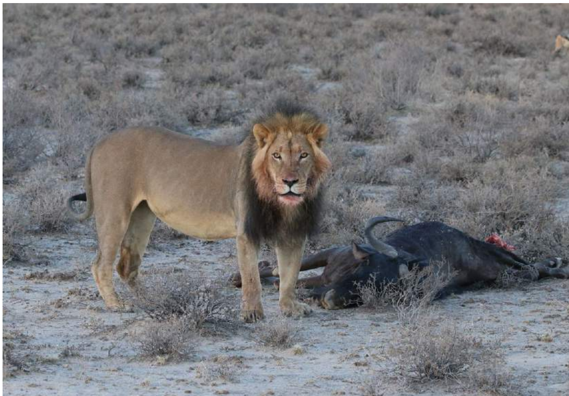
Male Lion with wildebeest kill near Polentswa Lodge

We hired a 4WD Ford Kuga through www.economycarrentals.com ; the car was provided by First Car Rental. Friendly and helpful staff at First. The car was fine, but we both got a little frustrated with the total overkill on useless, intrusive and often illogical electronic technology. We need a “dumber” car next time, long live mechanics.