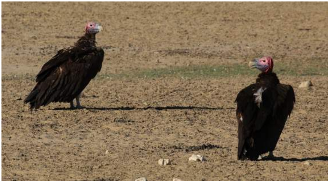
Lappet-faced Vulture at Polentswa Waterhole

Green-winged Pytilia Pytilia melba – a few in WIT Red-headed Finch Amadina erythrocephala – common in MAR and KTP, also seen WIT Violet-eared Waxbill Granatina granatina – a pair at Grootkolk, another pair in a group of queleas near Melkvlei and brief views of two at WIT Common Waxbill Estrilda astrild – two groups in AU and group at the waterhole in MAR Black-faced Waxbill Estrilda erythronotos – fairly common in WIT, also seen in MAR Pin-tailed Whydah Vidua macroura – only seen in WIT including two males in breeding plumage Yellow Canary Crithagra flaviventris – common to abundant in all areas visited White-throated Canary Crithagra albogularis – a few seen in AU Lark-like Bunting Emberiza impetuani – common in AU Cinnamon-breasted Bunting Emberiza tahapisi – one in MAR and one in MOK Cape Bunting Emberiza capensis – about 3-4 in WIT, a few in AU Golden-breasted Bunting Emberiza flaviventris – several at the hide in WIT, fairly common in MOK