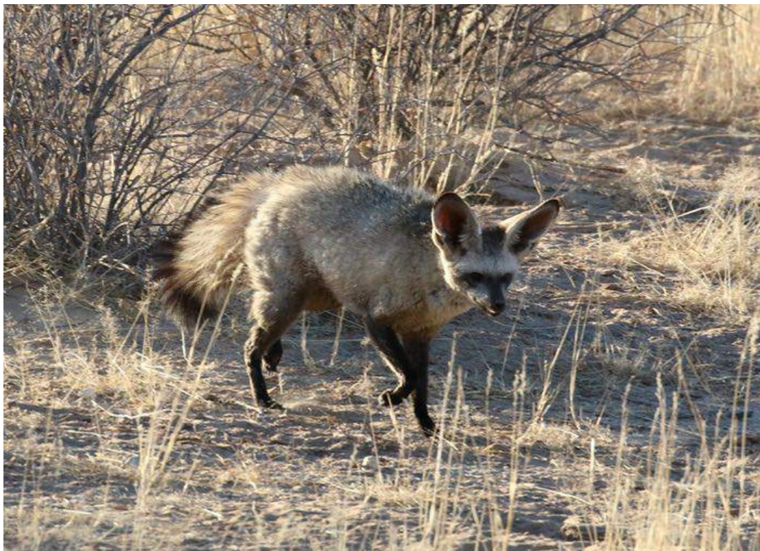
Bat-eared Jackal approaches the badger with puffed-up tail and back hairs up