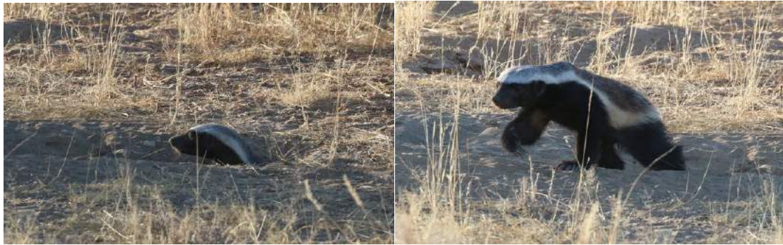
Honey Badger investigating Bat-eared Fox den