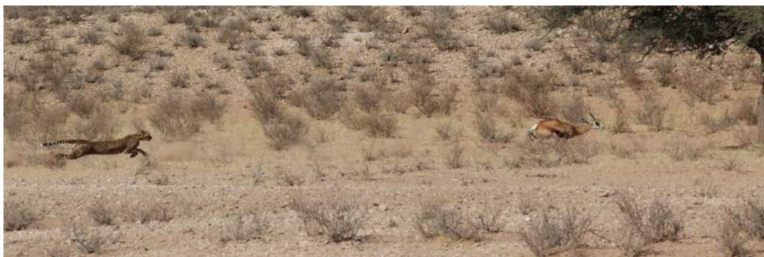
Cheetah seconds away from a kill