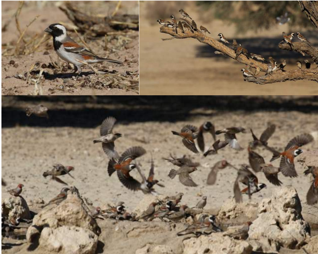
Cape Sparrow (and a few Red-headed Finches)

Rock Martin Ptyonoprogne fuligula – common, particularly in AU but seen throughout Greater Striped Swallow Cecropis cucullata – common, seen in MAR, WIT and AU Lesser Swamp Warbler Acrocephalus gracilirostris – one in AU Icterine Warbler Hippolais icterina – one near Polentswa Pan Yellow-bellied eremomela Eremomela icteropygialis – one in MAR Levaillant's Cisticola Cisticola tinniens – seen in MAR and WIT Desert Cisticola Cisticola aridulus – a few sightings in KTP, not seen well, but had seen the species before Rufous-eared Warbler Malcorus pectoralis – at least one seen and photographed in the Kij Kij/Melkvlei area in KTP (one or two more appeared to be present) Black-chested Prinia Prinia flavicans – common throughout Long-billed Crombec Sylvietta rufescens – one at Polentswa Chestnut-vented Tit-babbler Parisoma subcaerulea – very common in WIT, also seen at MAR, AU Orange River White-eye Zosterops pallidus – only seen in AU Cape Wagtail Motacilla capensis – common in WIT, two in AU, a few in MAR African Pipit Anthus cinnamomeus – a few in KTP Cape Glossy Starling Lamprotornis nitens – common throughout Burchell's Glossy Starling Lamprotornis australis – one in Nossob camp, one near Rooiputs Pale-winged Starling Onychognathus naboroupe – common in AU Groundscraper Thrush Psophocichla litsitsirupa – one between Nossob and Dikbaardskolk Karoo Thrush Turdus smithii – a few in AU Cape Robin-Chat Cossypha caffra – common in AU, two in the garden at MAR, a few in MOK