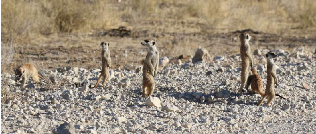
Meerkats on the alert because of a nearby Martial Eagle

accommodation there). From Mata Mata or KTC, driving up to Urikaruus/Kamqua is about the maximum distance that you can cover in a morning. No need to drive further anyway because there should be more than enough action on that stretch if you look carefully. During our stay Cape Fox and Meerkat were regularly seen, Bat-eared Fox slightly less so, but the area proved particularly good for Cheetah and Lion. Spotted Hyenas were less commonly sighted. Leopard and Brown Hyena are around, but we didn't hear of anyone seeing those in the area during our stay.