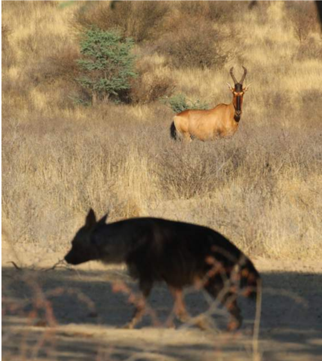
Red Hartbeest and Brown Hyena

waterhole alerted us to a leopard. The leopard was quite close to the road but it almost completely melted away in the dense tangles of branches of a dead tree that had fallen on the ground. After 10-15 minutes it suddenly walked to the other side of the riverbed where it seemed to settle down and relax under a large tree. But after a couple minutes it started staring intensely in the direction of the waterhole and suddenly raced off into the dunes. Maybe lions or hyenas had shown up at the waterhole. We were completely happy with this perfect ending to our stay in Kgalagadi so we did not drive back to check out the waterhole and drove out of the park.