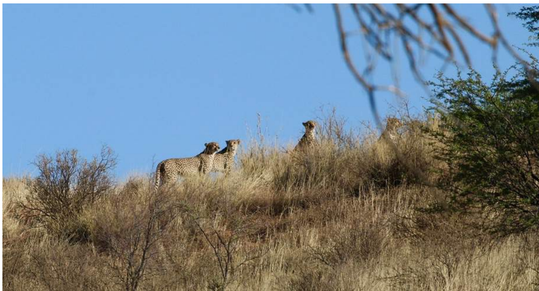
The Cheetah males

On our first morning drive from KTC we first saw a big male lion drinking from the waterhole at Craig Lockhart, then a female lion guarding an Eland carcass at Dalkeith. We then watched a Cape Fox family at their den slightly east of Dalkeith for a while. In the 13 th Borehole area we saw from a distance a group of Springbok in tight formation staring intensely in one direction; just when we arrived on the scene a group of wildebeest came running in the direction of the springboks who then panicked and raced off. Seconds later we saw the first two cheetahs cross the riverbed and head up into the dunes and a second later 2-3 more. We drove towards the cheetahs but they had quickly moved up the dunes. So we saw them for a couple of minutes on the top of the dunes before they moved on. A little frustrating to arrive five minutes too late on the scene.