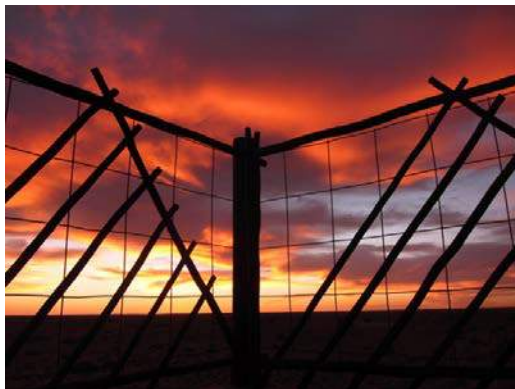
Sunset at Kieliekrankie