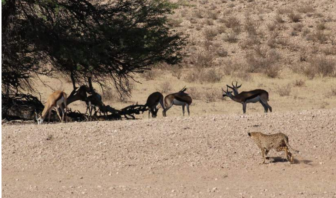
Up to this point she had stalked the springbok already for several hundred meters...