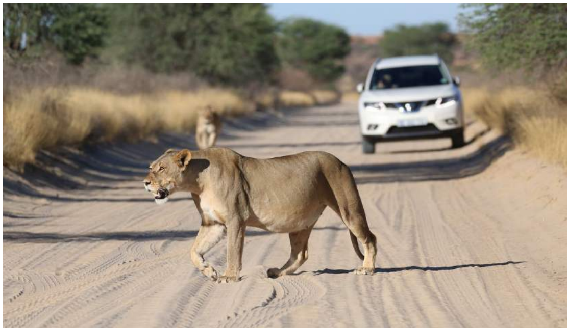
Pregnant or well-fed?

Although the Nossob area is considered a good area for brown hyena, it was interesting to hear that a lot of visitors in Nossob struggled to see this species. There was one group of photographers who had been in Nossob for a week with the aim to see brown hyena but still had not seen one! Kwang and Cubitje Quap are often quoted as good waterholes for the hyena but during our stay most of the sightings appeared to be south of Nossob, and one even showed up at the waterhole in Nossob camp in the morning while most people were out gamedriving.