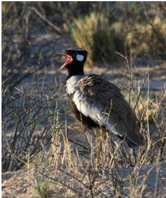
Northern Black Korhaan

The sunset drive from Twee Rivieren was pretty productive with a male lion, brown hyena, three genets, 5+ wildcats, eight Cape foxes and five bat-eared foxes, springhares, jackals and three owl species. Although we saw the brown hyena just when it was getting dark and the light was less than optimal for photography, I was really glad that I had my 2011 Nemesis in the bag within less than six hours in the park.