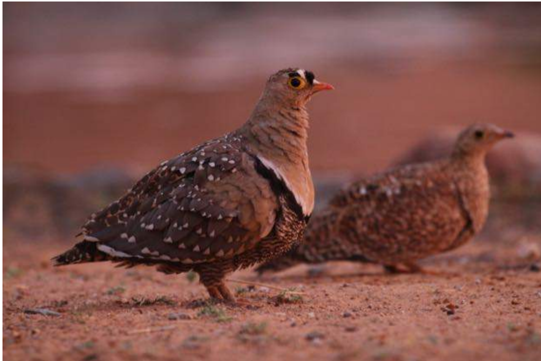
Double-banded Sandgrouse at dusk from the hide

ones in the hide and we had Gemsbok, Springbok, Common Duiker, Scrub Hare, Cape Grey Mongoose, a meeting of the Leopard Tortoise Fight Club (up to four fighting!) and two dozens of Double-banded Sandgrouse less than two meters in front of us. Several sandgrouse in the group were less than one meter away from us. Magic!