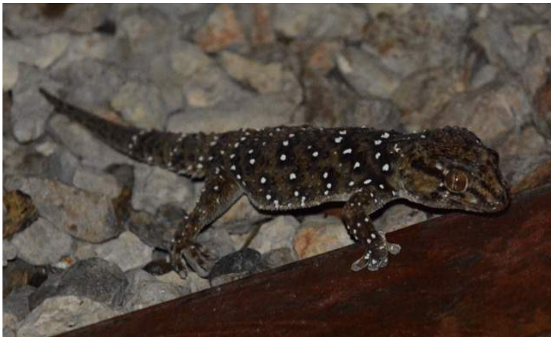
A Thick-toed Gecko species I think?

Striped Skink Trachylepis wahlbergi – a handful seen