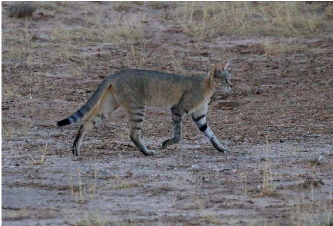
African Wildcat at dawn near Rooiputs

The entire situation with sunset/night drives appeared a bit fragile. Because the one tour operator block-booked sunset and night drives in Mata Mata, the vehicle and guide from Twee Rivieren had to be brought in to help out at Mata Mata, which left Twee Rivieren nightdrive-less for several nights. During our stay it seemed that actual night drives had been cancelled altogether and only sunset drives could be booked. Not such a big deal if their website would actually be a realistic reflection of the availability of activities, because the activities listed on their website and park brochures are currently definitely not a permanent and reliable service, which is in line with our 2011/2012 South Africa visits: cutting corners on activities and (the quality of) guides seems the norm and not the exception.