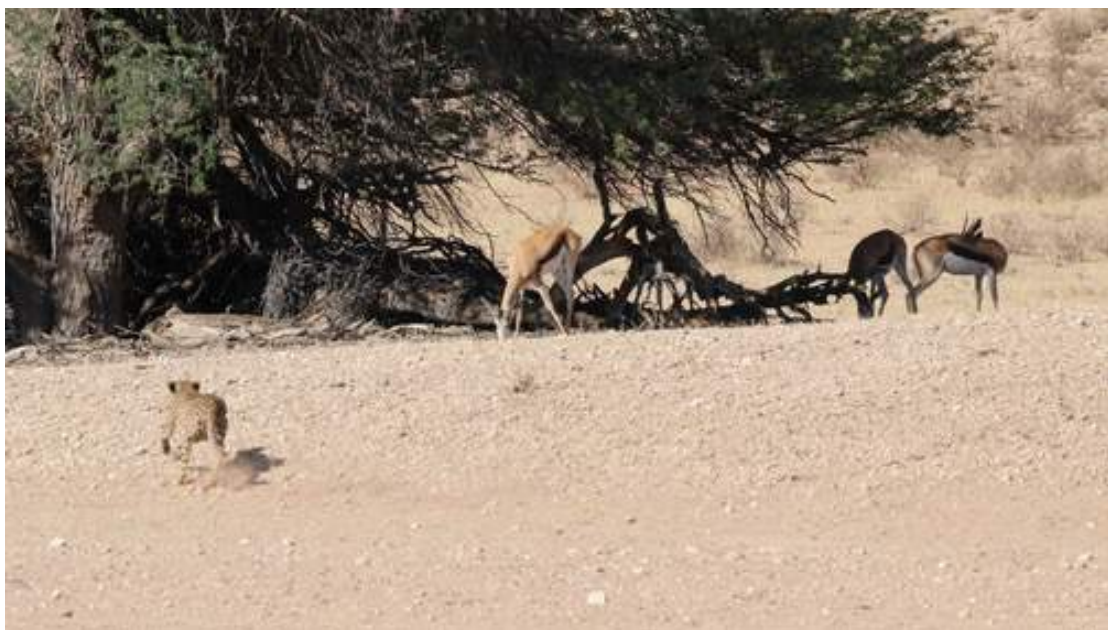
and started to run here - even at this point the Springbok had not noticed her