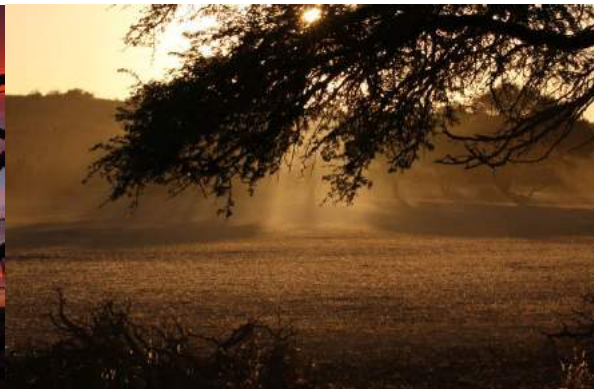
Dawn in the Auob River Valley