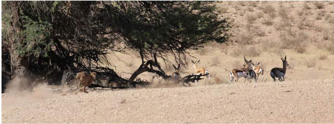
Still it seemed she had started the sprint too soon and at this point I thought she had blown it; However, a second later one of the Springbok made the fatal decision to turn to the right.