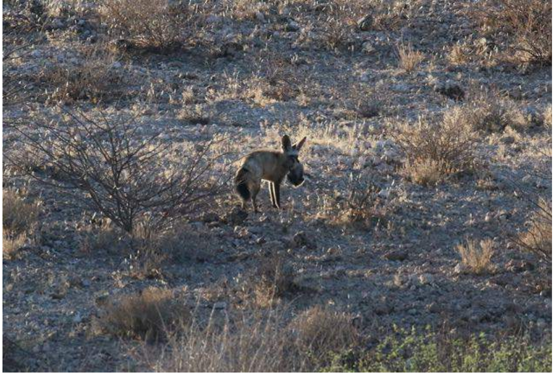
Bat-eared Fox trying to carry the puppy to safety; this was about a minute before the jackal attacked