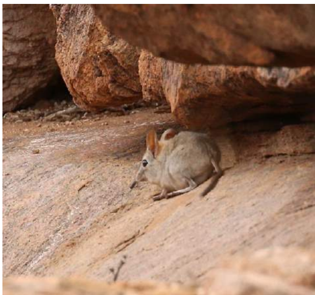
Western Rock Sengi

The Quiver Tree Monitoring Area itself was a little disappointing but driving the loop was well worth doing. If you want to save time, you could make a shortcut by following the Lekkerwaterloop (these shortcuts are shown on the new park map that you get when you register at the reception). This loop shortens the route by about 15 km. A 4WD is not needed to complete the loop.