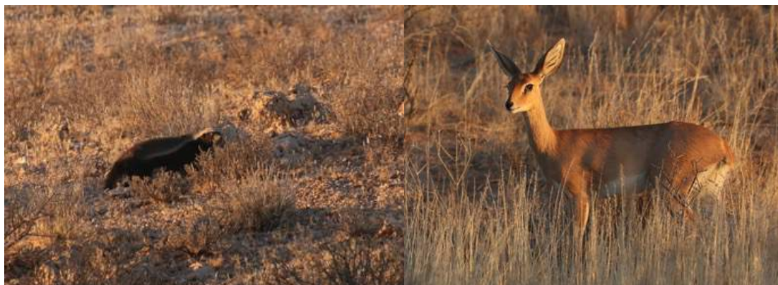
First Honey Badger

and a car behind us blasted past us at high speed without even looking or stopping. Wow, a honey badger at prime time and no one else is interested. What a treat! The badger stayed in view for about a minute, so this was my first opportunity to get some record shots of a honey badger.