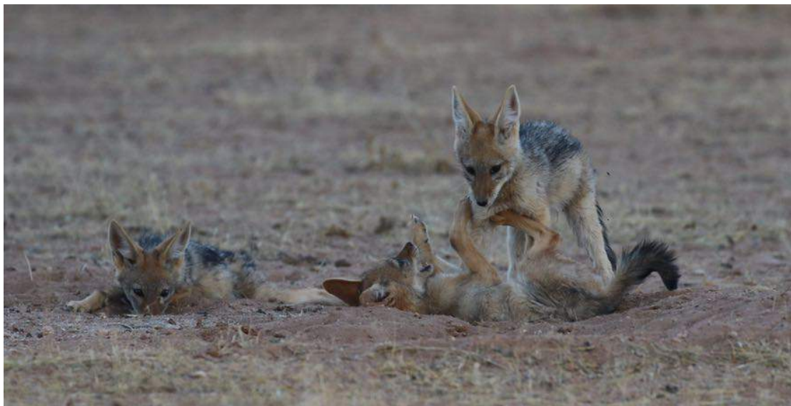
Young Black-backed jackals

Black-backed Jackal Canis mesomelas – common in KTP including several family groups with pups, 1-2 daily in MOK, WIT and MAR