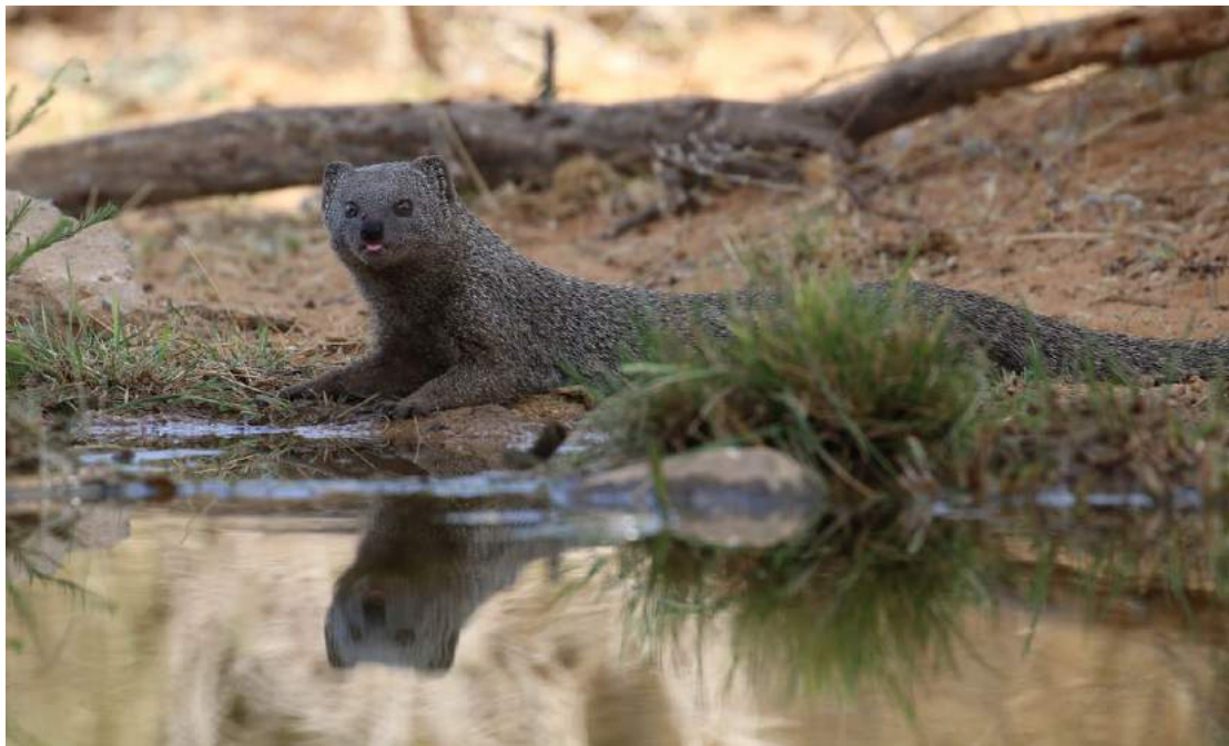
Cape Grey Mongoose

sightings of all these animals are extremely rare (even for them). For Aardvark one of the rangers (unsurprisingly) recommended the winter months. Visitors had seen a Black-footed Cat three months ago while spotlighting, but one of the rangers said it was the first time that he recalled that visitors had seen this species. The other park ranger reckoned that the nearby Langberg mountains and dirt roads in the area are better places to look for Pangolin, Striped Polecat, and Caracal, but since the gate closes around dusk, it would mean you have to stay outside the reserve. More likely but still not commonly sighted in the reserve (according to the park ranger) are Bat-eared Fox and Cape Porcupine. Still, the freedom to drive around after dark in the reserve was a nice change from the usual restrictions. We stayed two nights but if time is an issue, an afternoon and morning is enough to see the white dunes, visit the hide and spotlight in the evening.