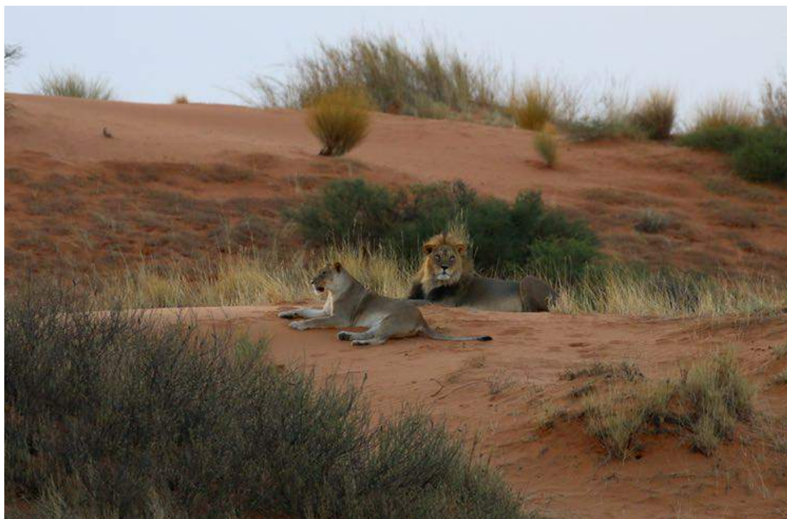
Lions overlooking Rooiputs waterhole

The only disappointment at the Ta Shebube lodges during our stay was the guide. The fact that he introduced himself with the same name as the actor whose character has an extreme jewellery fetish in the 80s series The A-team may have been an omen, but was welcomed by us as eccentrically retro for such a relatively young guy. After a couple of game drives it was clear though that he was a friendly and good-humoured people's person but his mammal knowledge was sketchy and his birding knowledge substandard. Especially on the slower afternoon drives he was struggling to make the game drives interesting, because he simply had little to tell. He guided us at both lodges, so can't comment on the other guides.