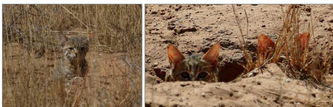
African Wildcat kittens

The morning game drive in the Rooiputs area on November 20 was almost too intense. Remarkable were five sightings of (at least) seven different African Wildcats – kittens and adults. The antics of two Cape Fox families were highly entertaining too, especially because a single Meerkat had joined one of the fox families and acted like he was a family member. Seemed like dangerous living, but interesting to see. We also managed to see twelve different Lions that morning, anything from tiny cubs to fully grown black-maned males. Nevertheless, the lions only proved to be the sideshow that morning.