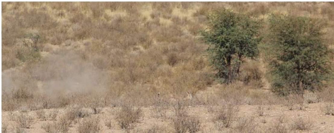
Game over for the Springbok! The Cheetah's tail tip was the last thing we saw before she pulled down the Springbok out of view into the low depression in front of the trees