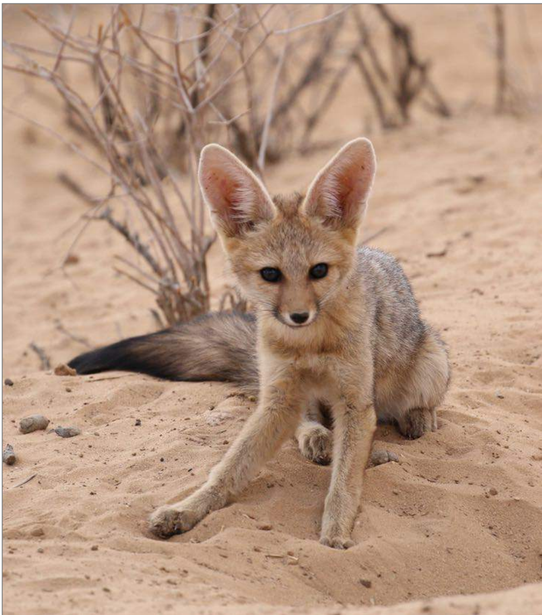
Young Cape Fox

2R = Twee Rivieren area in Kgalagadi Transfrontier Park