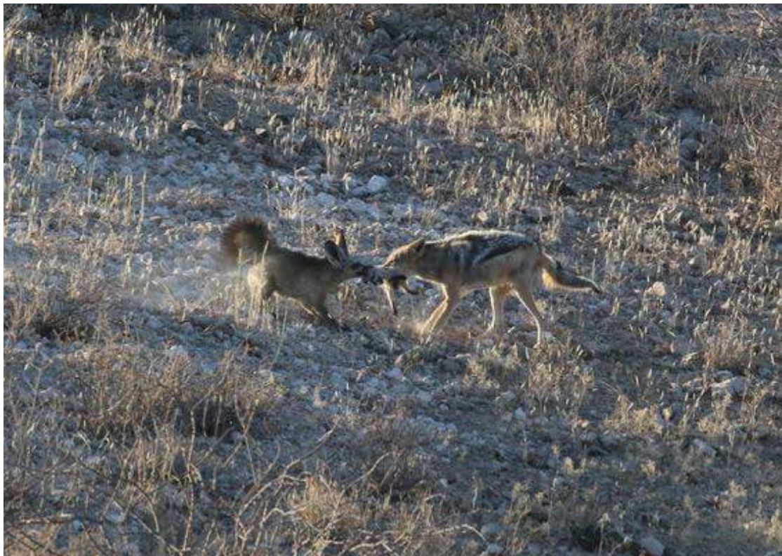
Last seconds of the Bat-eared Fox puppy