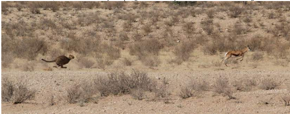
Cheetah turns on the turbo