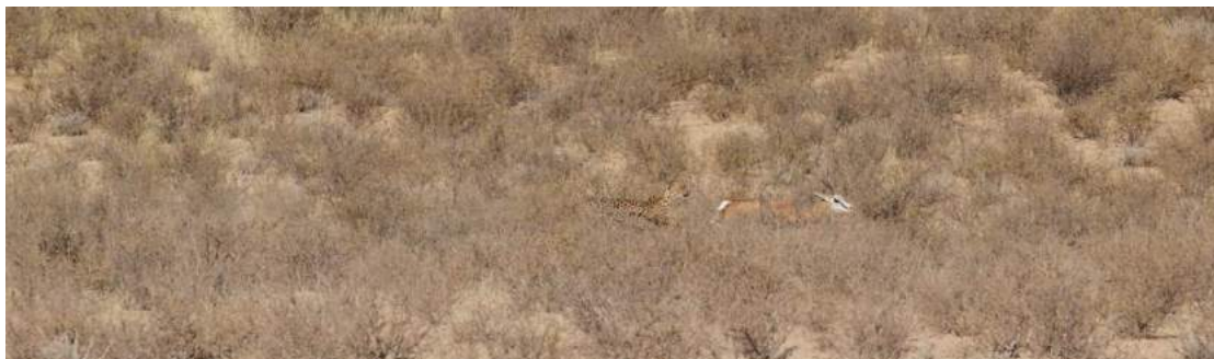
About 2-3 seconds later