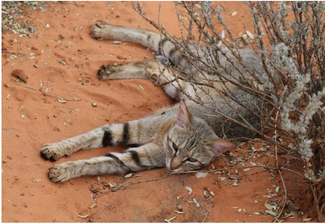
Wildcat relaxing in the shadow of one of the cabins at Kieliekrankie

Kieliekrankie to Kij Kij and Melkvlei. On the dune road we surprised two female lions on a fresh gemsbok kill at Tierkop, and then arrived first on the scene at Kij Kij where two of the four lions were in hunting mode around the waterhole. The lions were a bit half-hearted in their attempts but still pretty entertaining.