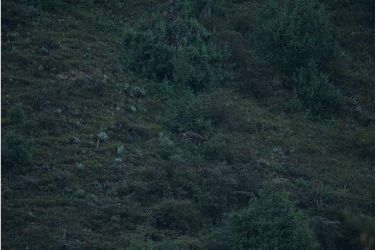
Sika deer (just in the middle)