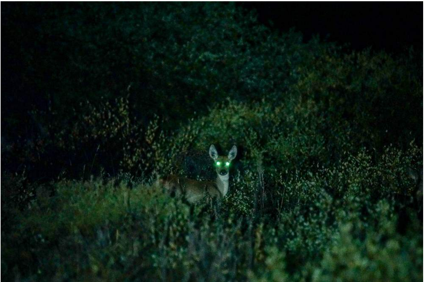
Siberian roe deer at night