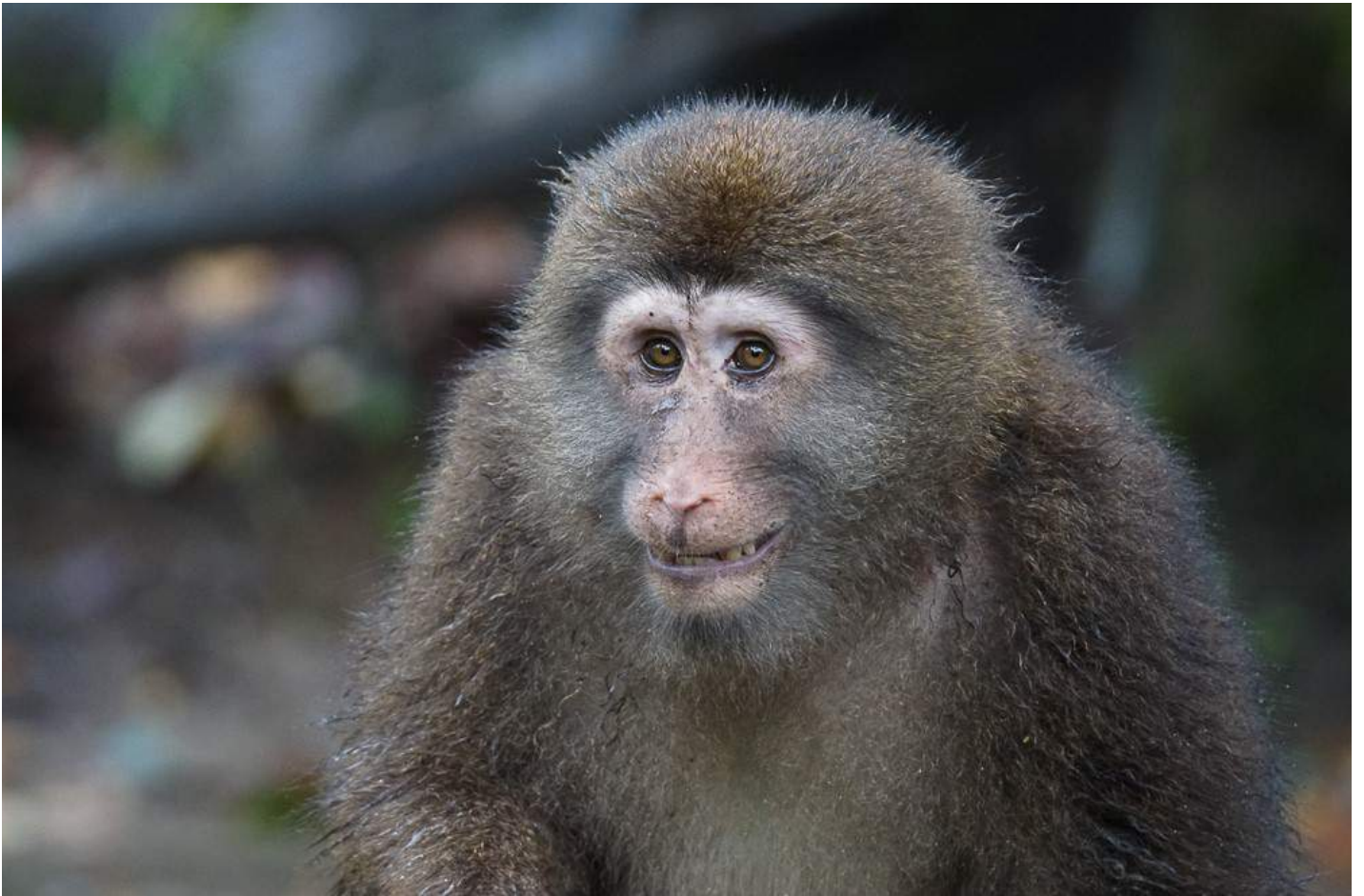
Funny looking, but quit dangerous Tibetan Macaques ( Emei Shan )