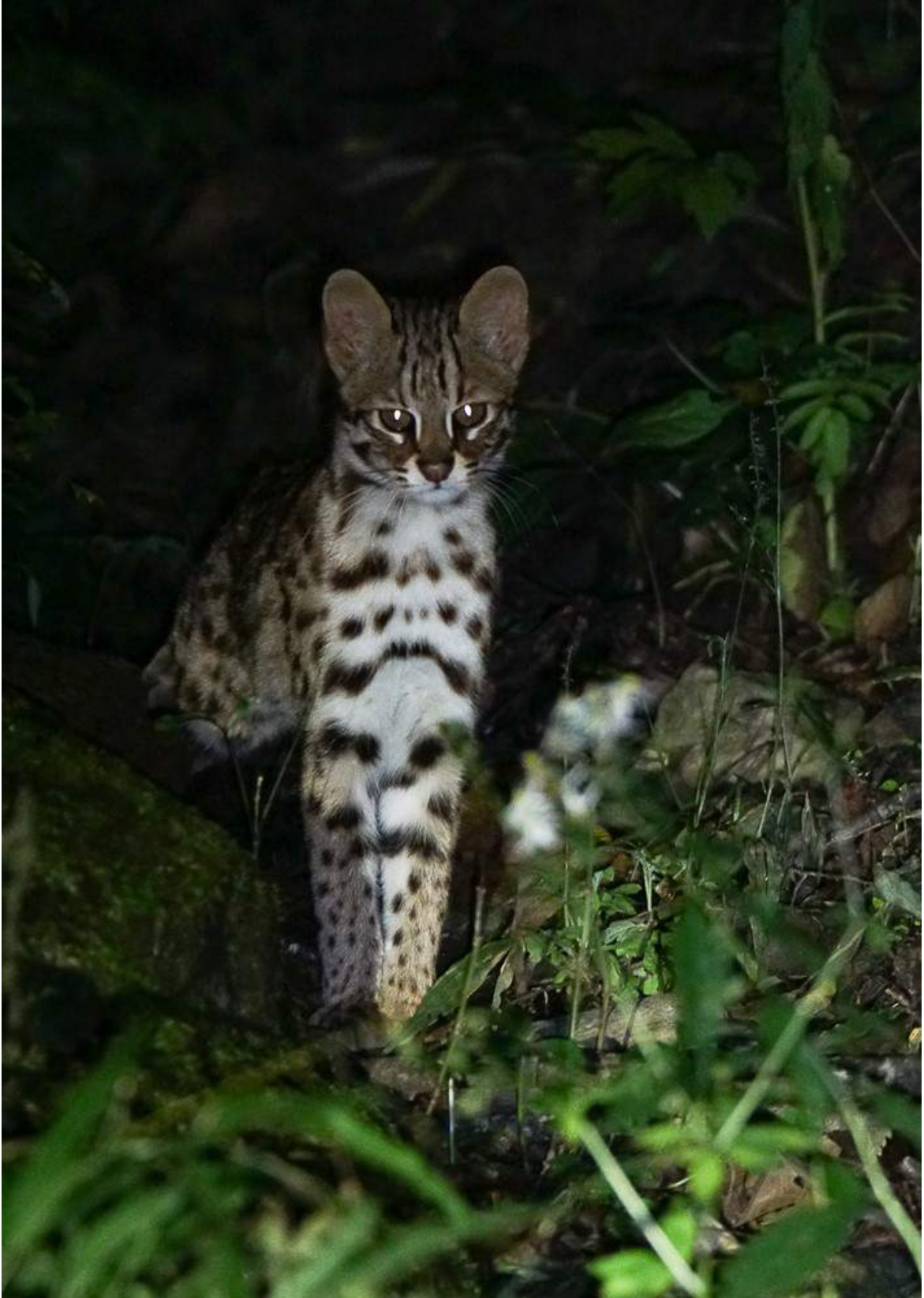
Leopard cat, trip bonus ☺