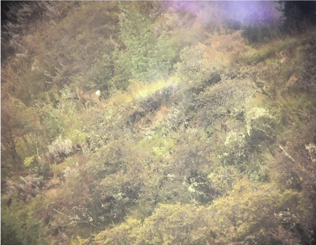
Siberian roe deer (see the white tail/back)