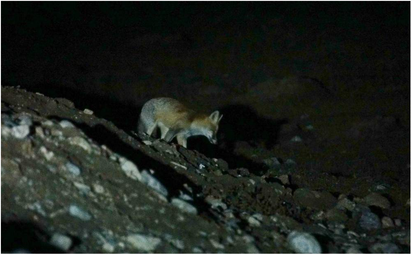
Red fox (above) Tibetan fox