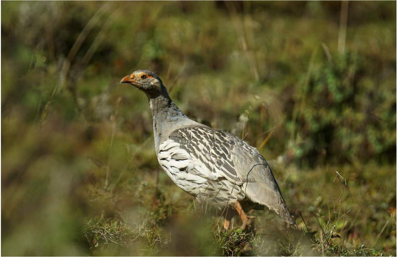
Tibetan Snowcock (took me a very steep hike to get this pic)