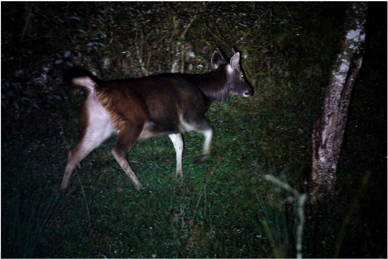
Sambar (above) & red deer