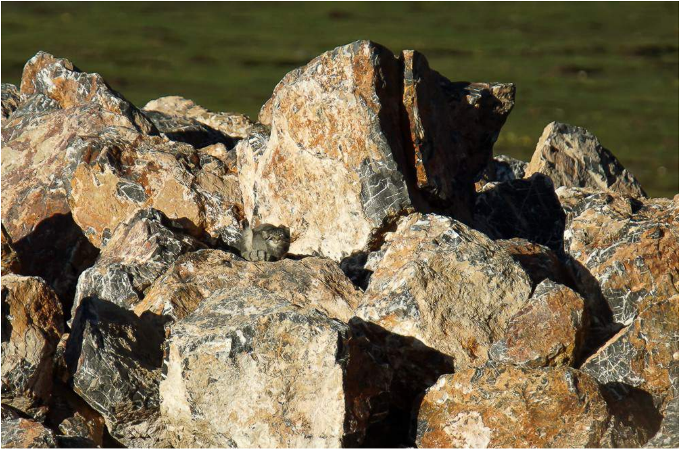
Two Pallas's cats , mind the second one in the upper back just above the rock