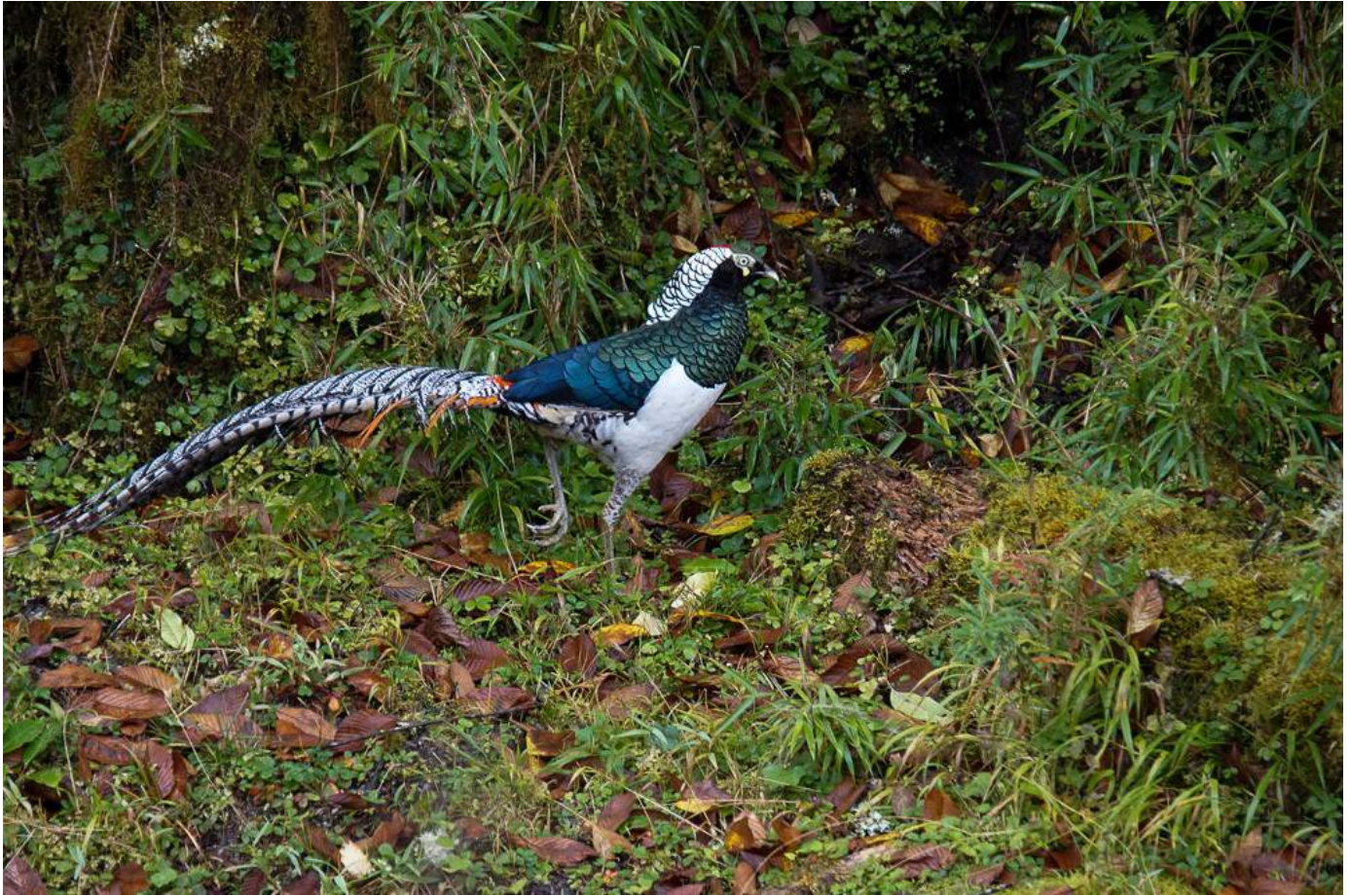
Lady Amherst's Pheasant( above) & Golden Pheasant (bonus birds ☺)