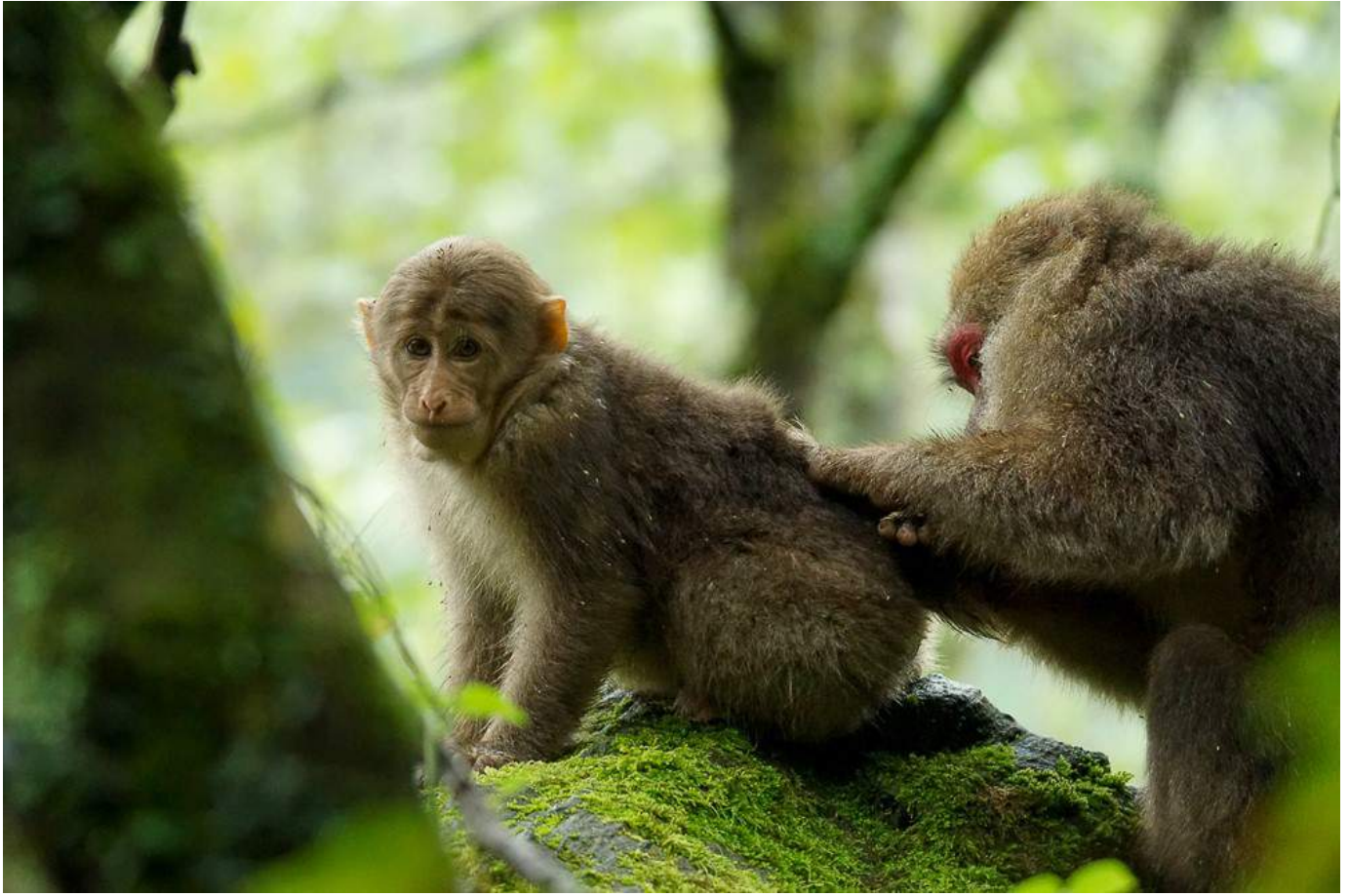
More friendly Tibetan Macaques in Tangjiahe