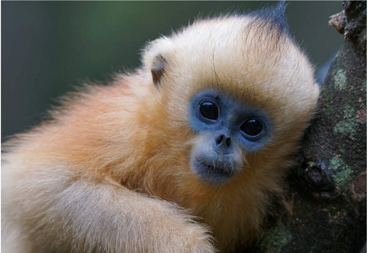
Golden snub-nosed monkey