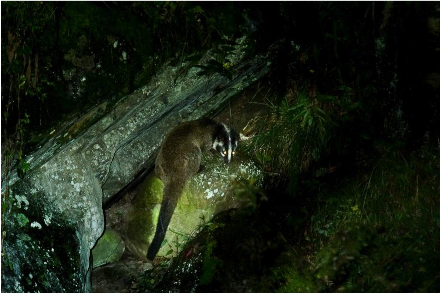
Masked palm civet