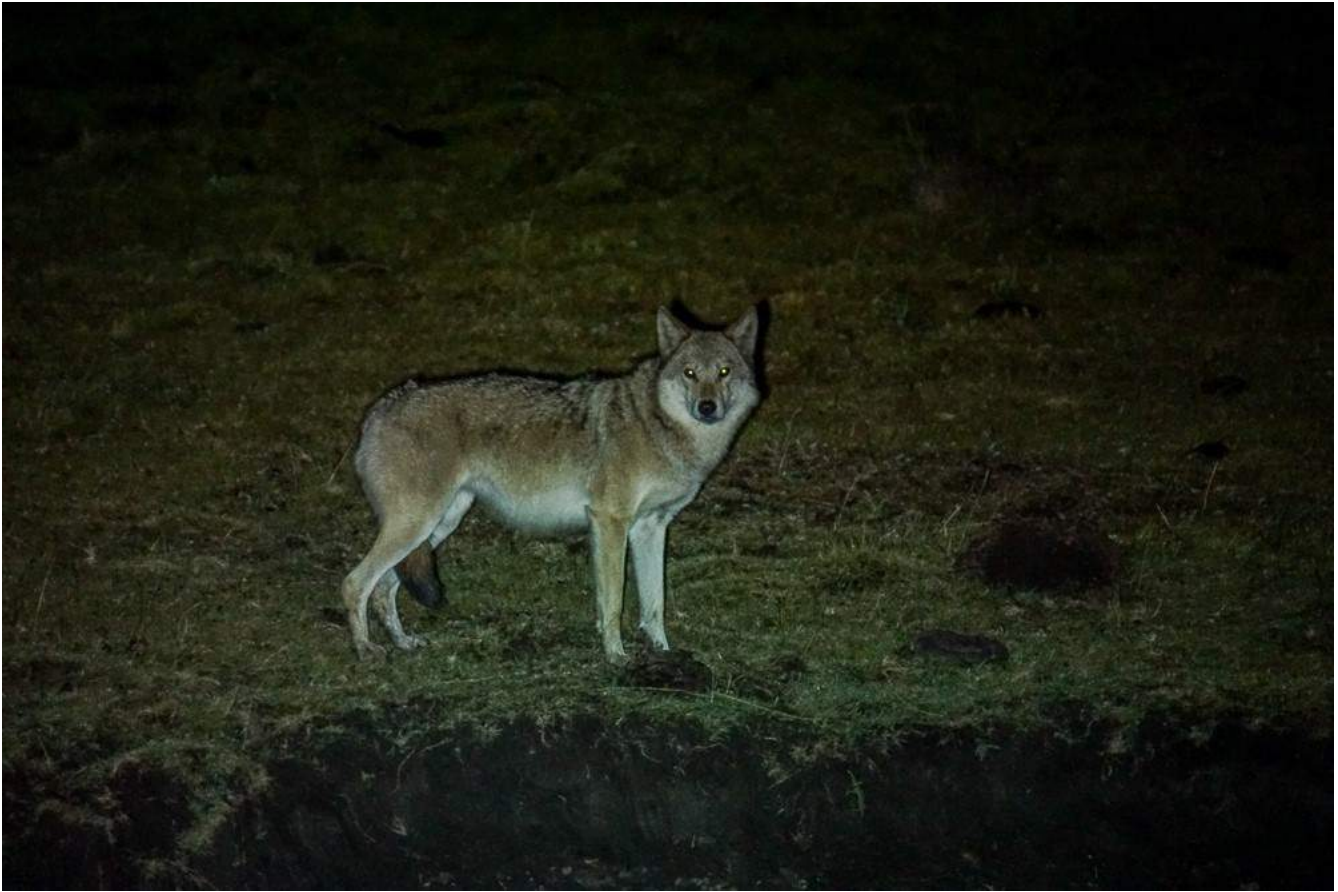
Another picture of the Tibetan wolf