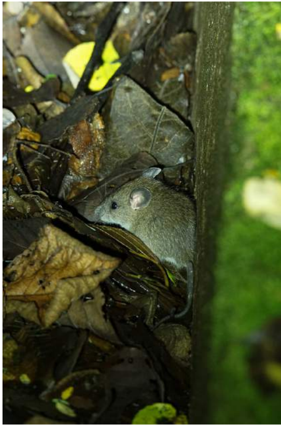
Korean field mouse (probably)