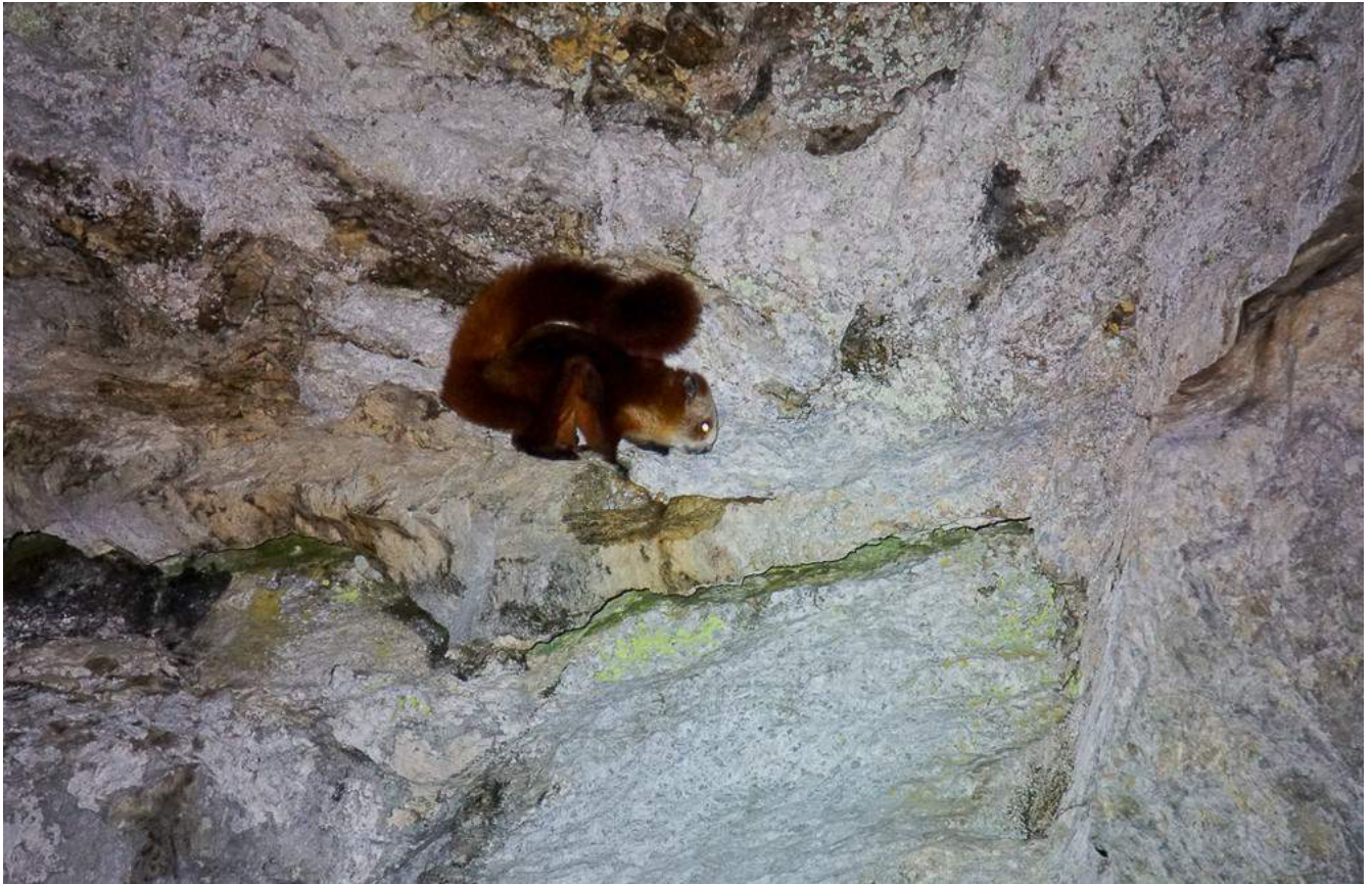
Red-and-White Flying Squirrel