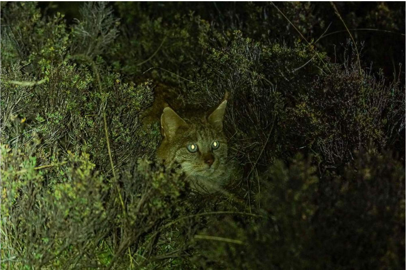
Chinese mountain cat