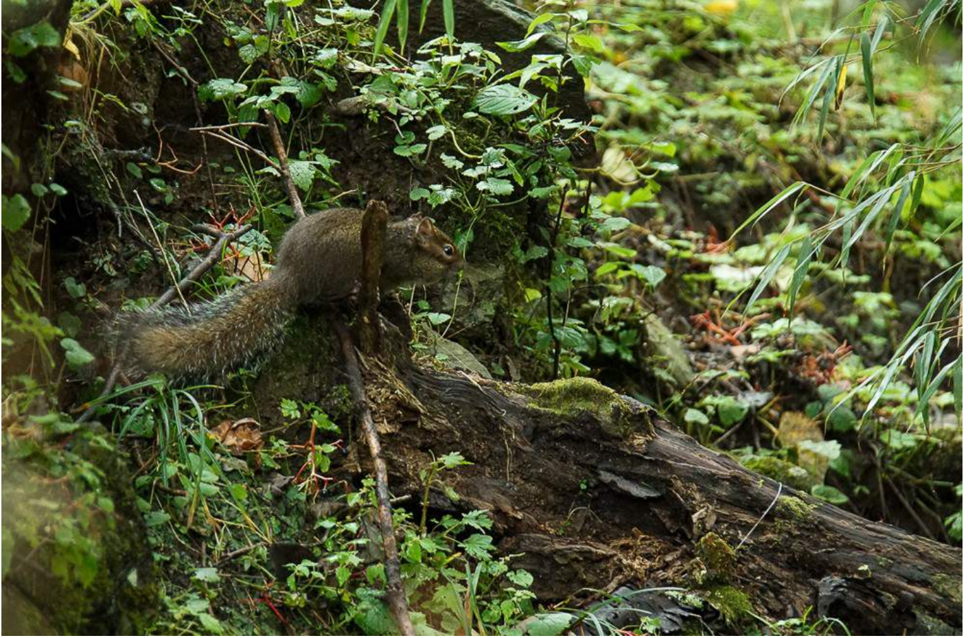
Pere David's Rock Squirrel