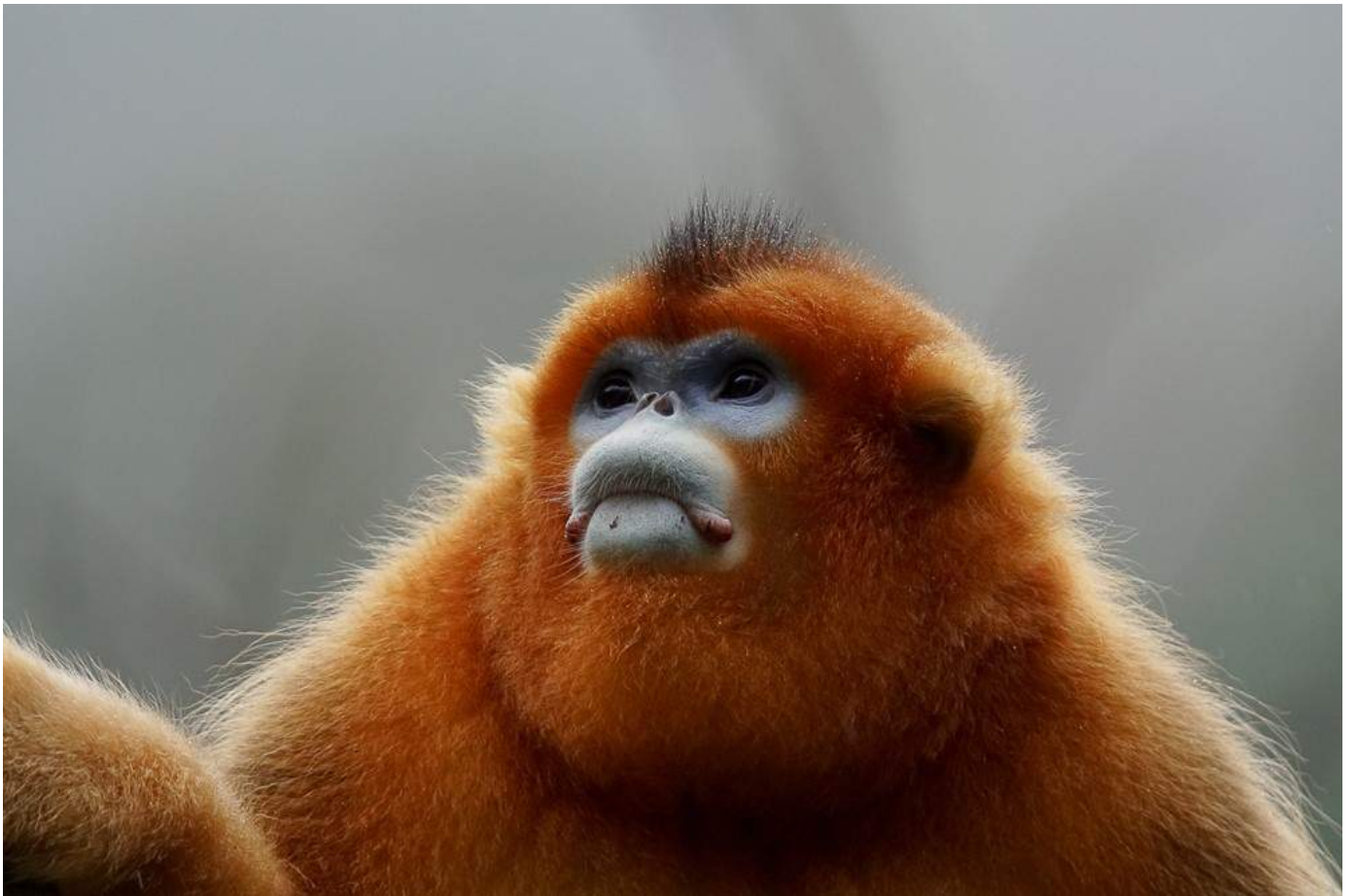
Golden snub-nosed monkey