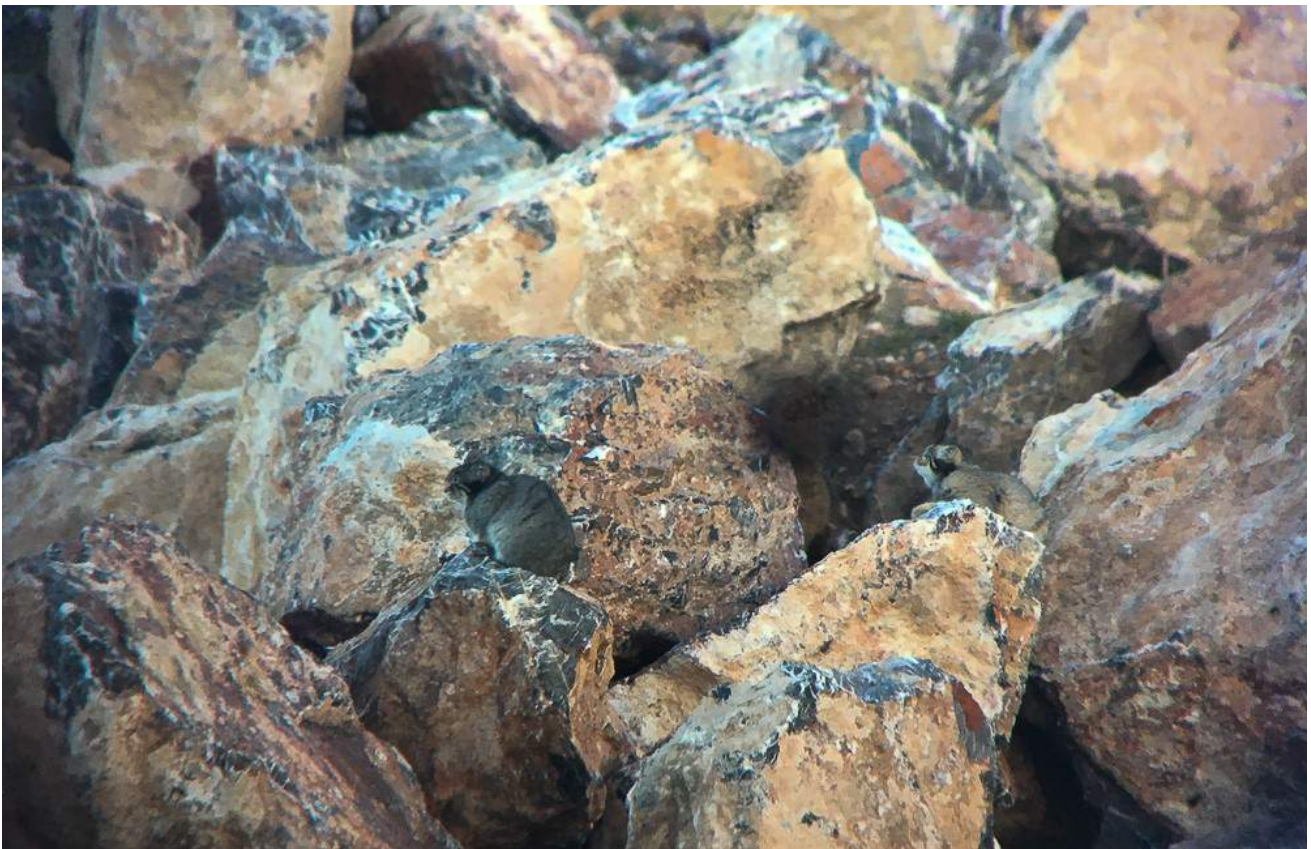
Two Pallas's cats , left and right (I didn't see the rightest one at first)