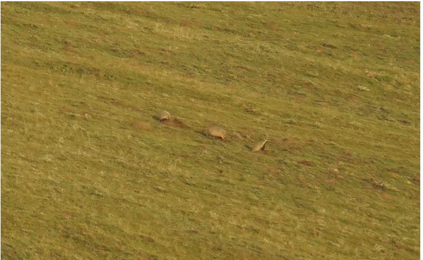
Three Asian badgers