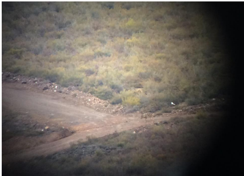
Bad picture of one of the wolves but great views in the scope, Sierra Culebra