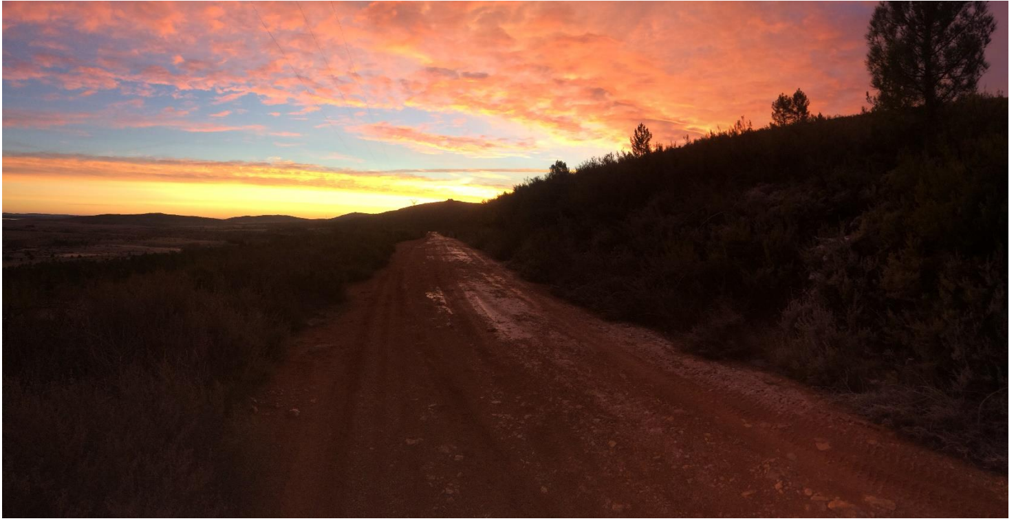
Sunrise in the Sierra de Culebra