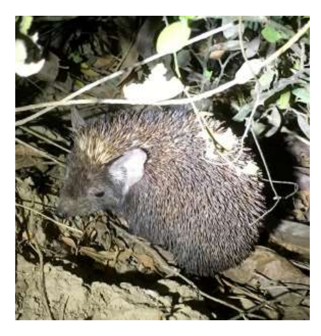
Day 8: 2/18/18 Keoladeo National Park: 20 Rhesus Macaques, 20 Spotted Deer, 40 Nilgai, 6 Wild Boars, 1 Gray Mongoose, 15 Palm squirrels, and 1 Greater Yellow House Bat. Back at the Bagh I found another, or maybe the same, Collared Hedgehog.