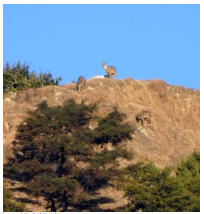
Day 17: 2/27/18 Traveling in the foothills: We saw 2Macaques, 20 Tarai Gray Langurs, 6 more Gorals and 1 Indian Muntjac.