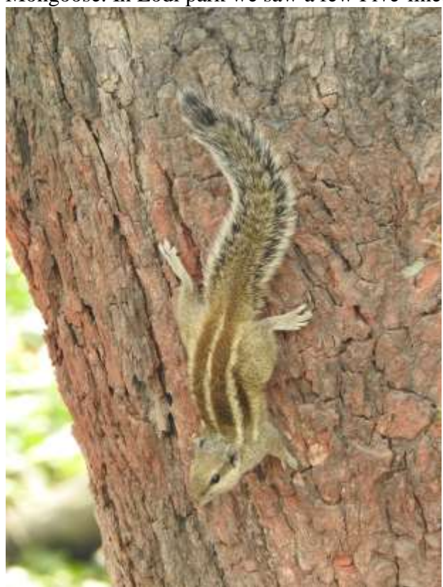
Day 2: 2/12/18

We visited 2 parks Okhla Bird Sanctuary and Lodi Park both very close to Delhi. On the way to the Okhla park we passed several Rhesus Macaques very close to the road. In the park we saw many Five-striped Palm Squirrels, a few Nilgai and an Indian Gray Mongoose. In Lodi park we saw a few Five-lined Palm Squirrels.