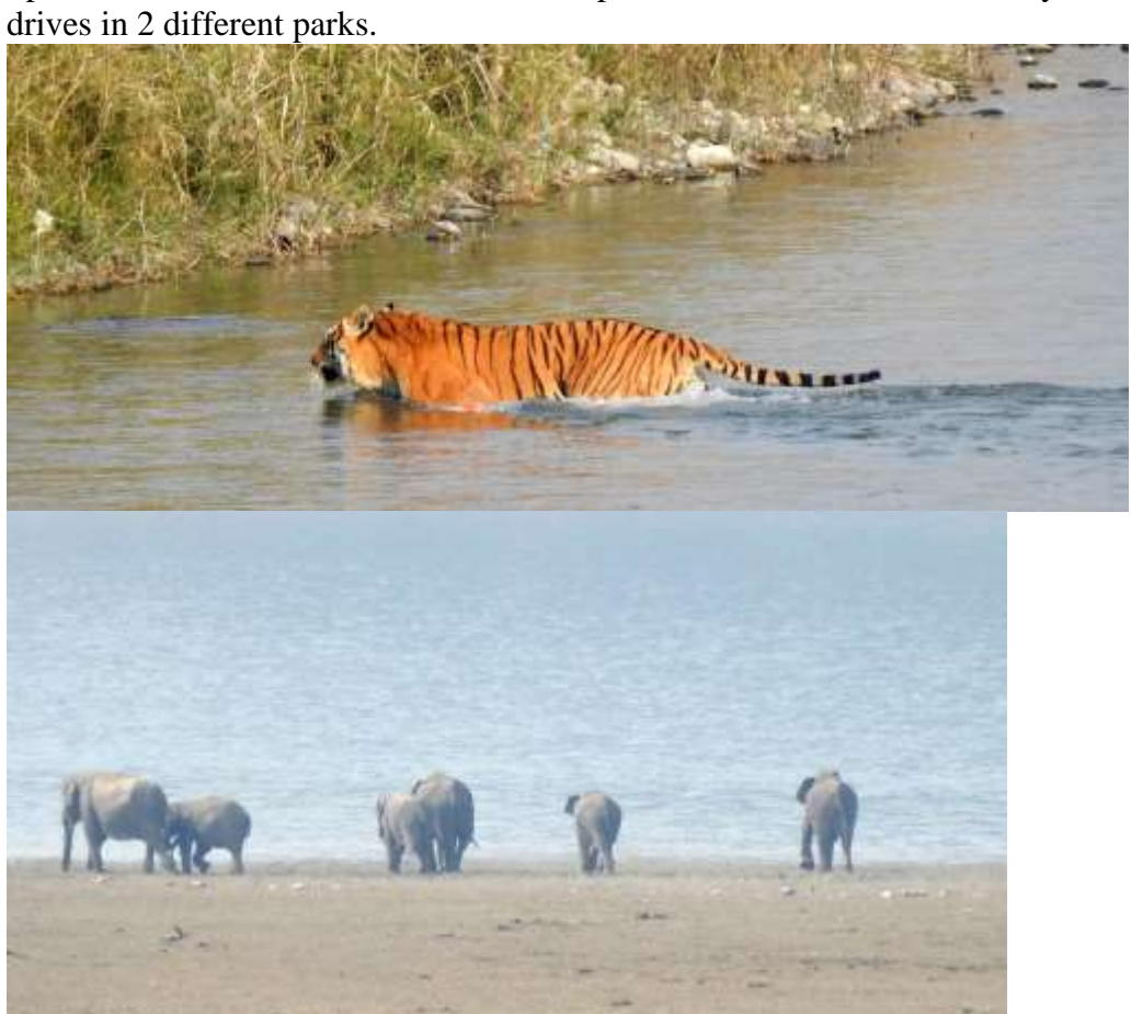
Day 14: 2/24/18 Another morning game drive in Corbett: 40 Macaques, 50 Langurs, 8 Sambar, 3 Muntjacs, 60 Spotted Deer, 1 Asian Elephant

Corbett NP: we did 2 game drives one in the morning and one in the afternoon. 50 Macaques, 60 Northern Plains Gray Langurs, 6 Sambar, 2 Muntjacs, 10 Hog Deer, 50 Spotted Deer, 30 Wild Boar, 20 Asian Elephants, and 3 TIGERS!!! Finally, after 9 game drives in 2 different peaks.