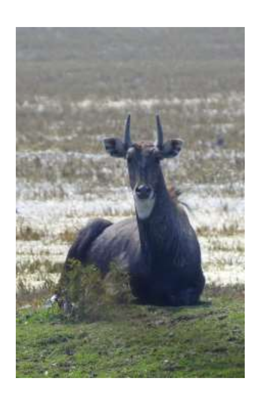
Day 9: 2/19/18 After a visit to the Taj Mahal we made our way to the Chambal Safari Lodge. On the way to the lodge we saw 5 Macaques. We took a boat trip on the Chambal River in the afternoon. It was amazing. The first mammal of the trip was a Jungle Cat, followed by a Smooth-coated Otter, 2 Gangetic Dolphins, and 3 Golden Jackals. 10 spotted Deer and 20 Nilgai were also seen from our boat. We also saw 40+ Gharials and many Mugger Crocodiles. Back at the lodge we counted over 100 Indian Flying Foxes, and 1 Common Palm Civet.