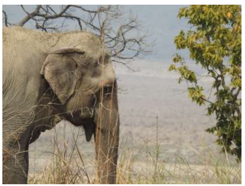
Day 15: 2/25/18

A long trip heading north to Nainital, in the foothills of the Himalayas. Along the way we saw: 15 Rhesus Macaques, 10 Northern Plains Gray Langurs and as we got into the Nianital area 10 Tarai Gray Langur