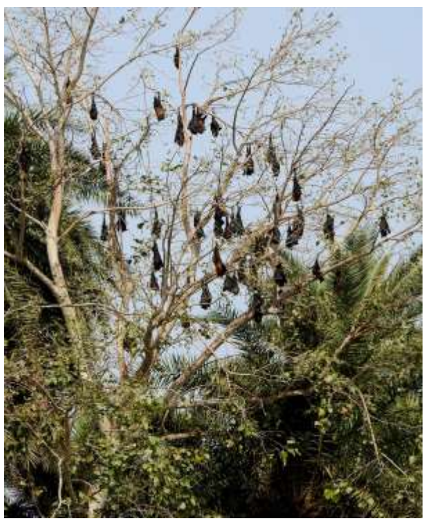
Day 11: 2/21/18 Today is mostly a day of travel. Along the way we saw Palm Squirrels, Macaques, Langurs and Spotted Deer.