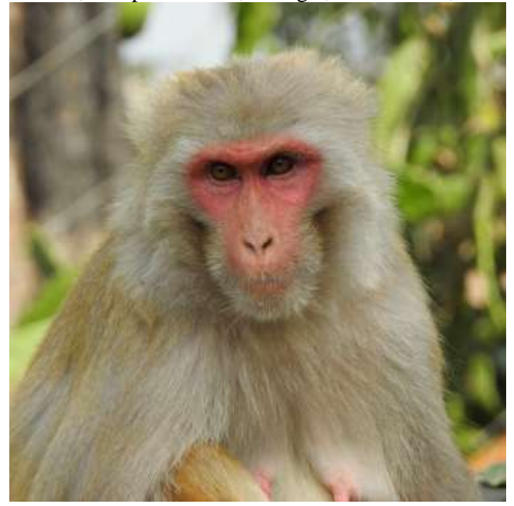
Day 7: 2/17/18 Keoladeo National Park: 230 Rhesus Macaques, 20 Spotted Deer, 20 Nilgai, 5 Wild Boar, 2 Golden Jackals, and 30 Indian Flying Foxes. Just after dark on the grounds of our hotel called The Bagh we found a Collared Hedgehog.