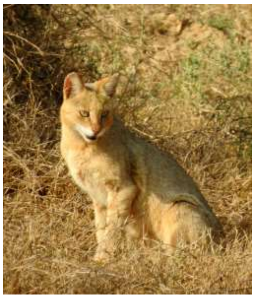
Day 10: 2/20/18

Before we left the Chambal Lodge we walked around the grounds there. We saw 10 Macaques, 3 Nilgai, 2 Black-naped Hares, and about 200 Indian Flying Foxes. When they returned to their roost near our room, around dawn, it was quite a raucous event. We then take an overnight train to Kathcodam to make our way to Jim Corbett National Park in hopes of seeing Tigers.