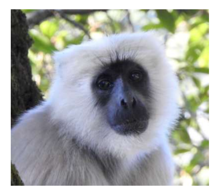
Day 16: 2/26/18

A long trip heading north to Nainital, in the foothills of the Himalayas. Along the way we saw: 15 Rhesus Macaques, 10 Northern Plains Gray Langurs and as we got into the Nianital area 10 Tarai Gray Langur