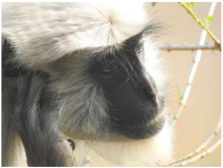
Day 6: 2/16/18 Our last game drive in Ranthambhore is a morning drive. 10Macaques, 80 Langurs, 40 Sambar, 70 Spotted Deer, 3 Nilgai, 6 Wild Boar, and 10 Palm Squirrels. No Tigers