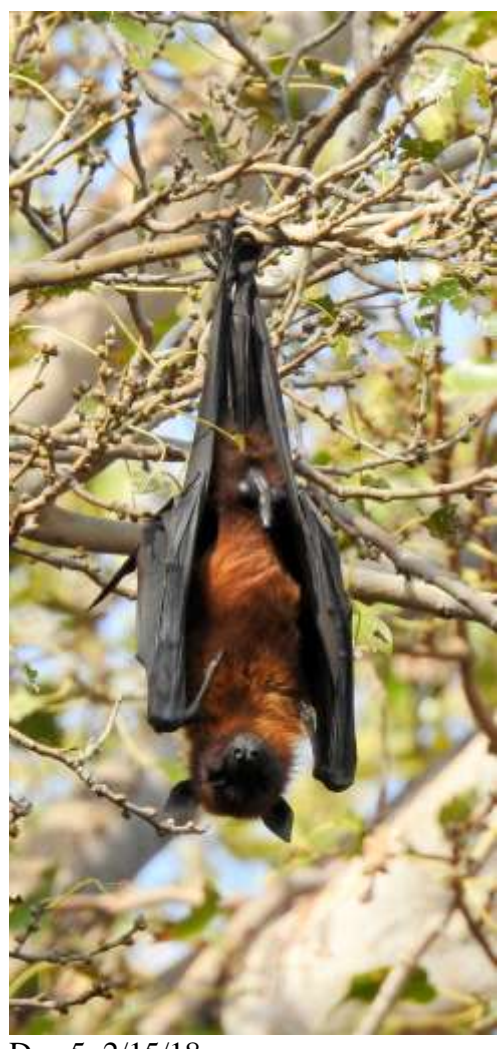
Day 5: 2/15/18 2 more game drives today. 10 Macaques, 100 Langurs, 80 Sambar, 220 Spotted deer, 1 Nilgai, 10 Wild Boar, 1 Ruddy Mongoose, 1 Black-naped Hare, and 15 Palm Squirrels.