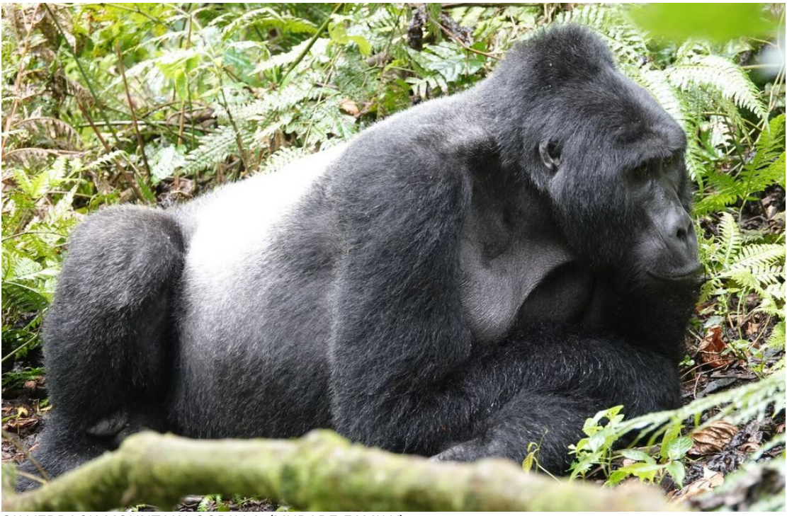
SILVERBACK MOUNTAIN GORILLA (MUBARE FAMILY)

Before our hour was up, we were able to sit and watch this massive silverback lying prostrate watching us; a truly soul-touching experience, and a phenomenal way to end our time in Bwindi!