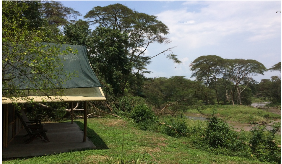
ISHASHA WILDERNESS CAMP

That night after dinner, we retired to a fire-pit on the edge of the river to enjoy a night cap. While we did so, two of the resident 'dugga boys', the affectionate name used to describe the big ol' buffalo bulls, came sauntering through the camp between our rooms and down to the river for a late night graze. The days can be quite warm at this time of the year, so the bulls spend much of the heat of the day relaxing in mud wallows to keep cool, while the nights being much cooler, are great for moving around and grazing. Since these bulls do not follow a herd, their movements are less especially when they find a good patch of grazing and fresh drinking water. During the night we could hear the gentle rapids of the river, which made for all having a great night's rest.