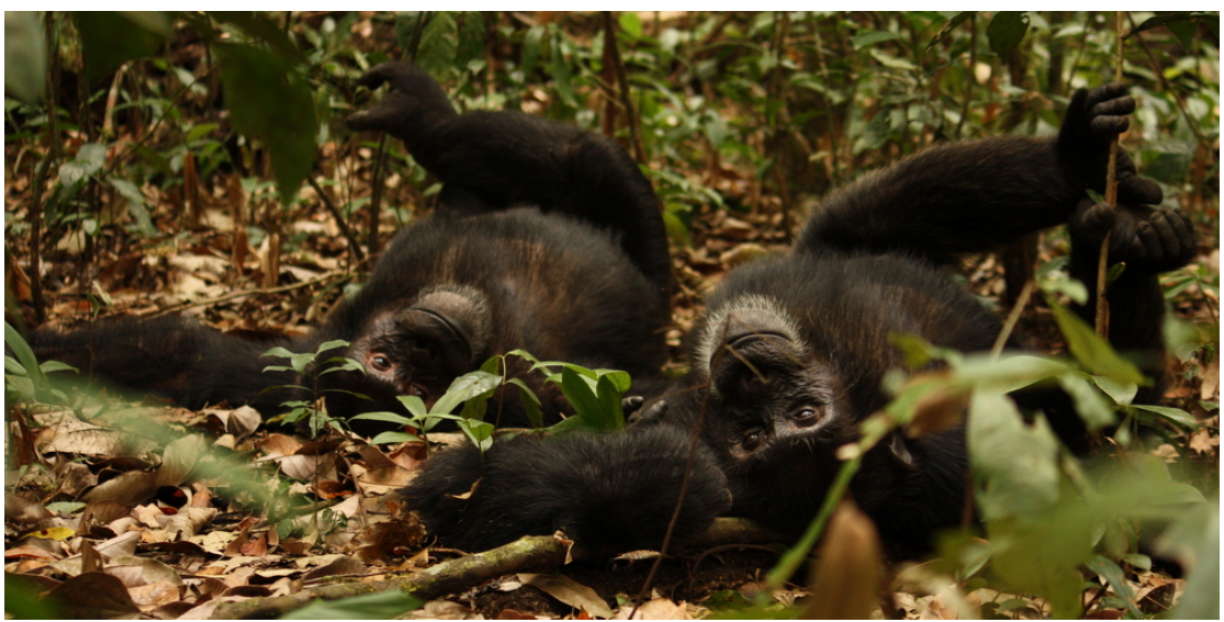
TWO MALE CHIMPS RELAXING

Around midday, our guide told us that we would be going to the habituated family and thanked us for our efforts for spending time in an area of the forest less travelled by humans. It wasn't long before we came across a male chimp, who was seated at the base of a tree, feasting on the bark and even heartwood of the tree. And then another close by who was simply taking a nap in the middle of the trail. We had a great sighting and spent about half an hour watching him as he sat crossed-armed looking straight through us. We he decided to move, he followed a trail where the other had moved towards and soon we were following 5 males striding down the path ahead of us. On all fours, they moved quickly and with purpose.