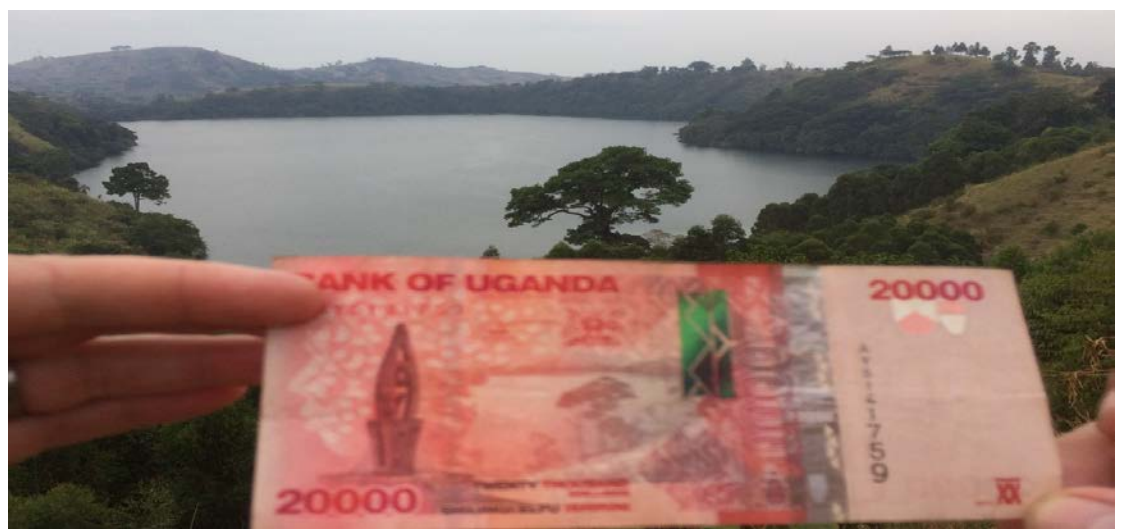
MAKEKWA NDALI CRATER LAKE

While we enjoyed a more leisurely breakfast at a slightly more reasonable hour, we watched Guereza Colobus and Red-tailed Monkeys feeding in the trees around the camp. As we headed back south, we decided to take the back route. After the rains we had a couple of nights ago, we hoped that the dirt road would be less dusty and this proved correct. As we drove, our Toyota Landcruiser handled the conditions extremely well. It was market day, and locals were loading up their bicycles with plantains to sell at the markets. They would walk beside their bikes pushing their heavy loads for kilometers to reach their selling point; no easy feat! We stopped to stretch our legs and enjoy the incredible sight of one of Uganda impressive volcanic crater lakes, Makekwa ndali, which apparently is the same lake that appears on Uganda's bank notes.