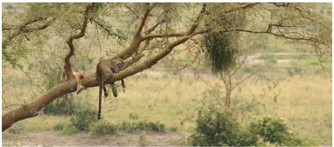
LEOPARD WITH HER PREY

Leopard!!! We went back to the tree with the young Kob that had been hoisted and found a leopard sleeping in the tree alongside her prey. She was so relaxed that she hardly moved; her belly was full and hung between the forks of the branches. We all enjoyed some great photos, albeit at a distance, of this gorgeous feline. A great way to leave behind the riches of Queen Elizabeth National Park as we drove towards the rainforests of Bwindi Impenetrable Forest for our final adventures.