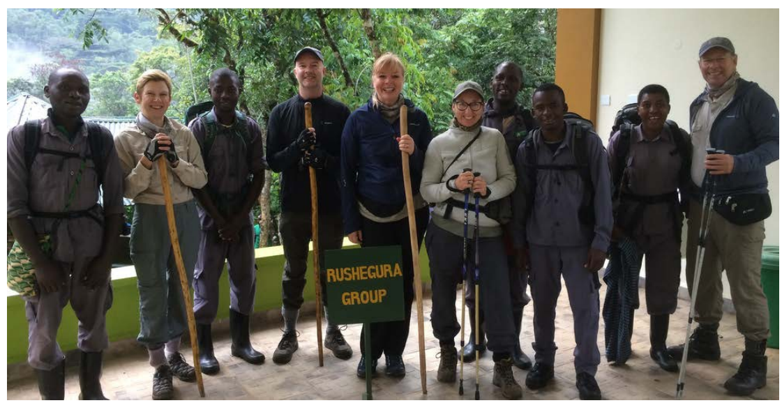
FIRST MOUNTAIN GORILLA TREK - RUSHEGURA FAMILY

After a couple of hours of walking, we were alerted by the trackers, who had headed off earlier to locate signs of the gorilla family, that they had found where the family had slept the night before. Gorillas make a nest on the ground at night to sleep. The trackers guided us to where they were moving, as they were hot on the heels following the fresh tracks of the family.