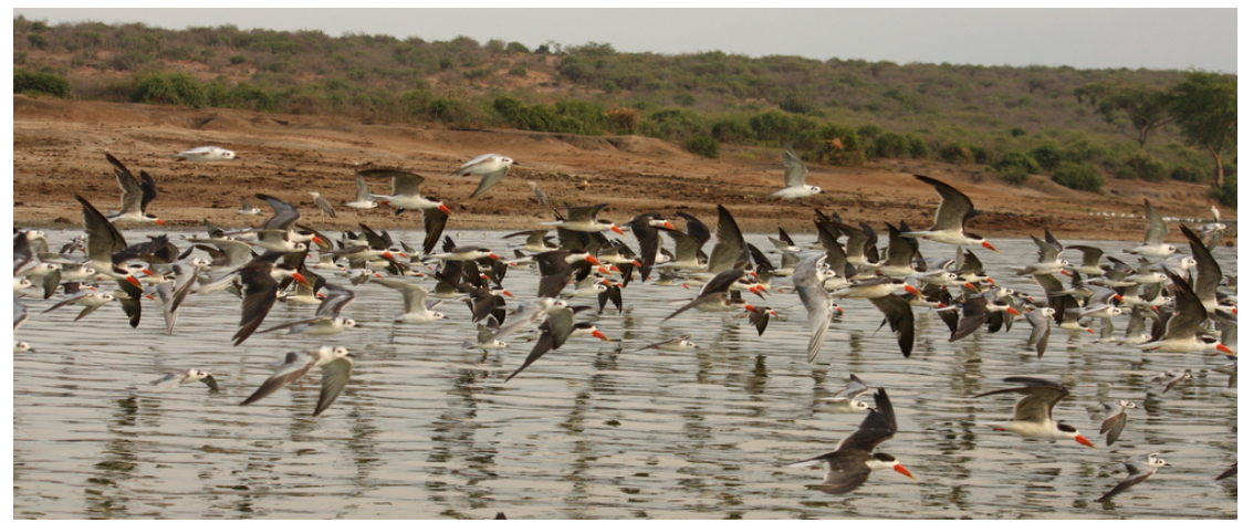
AFRICAN SKIMMERS AND WHITE-WINGED TERNS

On our drive through the park, which hosts more savanna wildlife and very different terrain from the forests where we recently stayed, we were able to see Cape buffalo, Defassa waterbuck, while great sightings of both Cinnamon and White-throated Bee-eaters swooped alongside us catching insect on the wing.