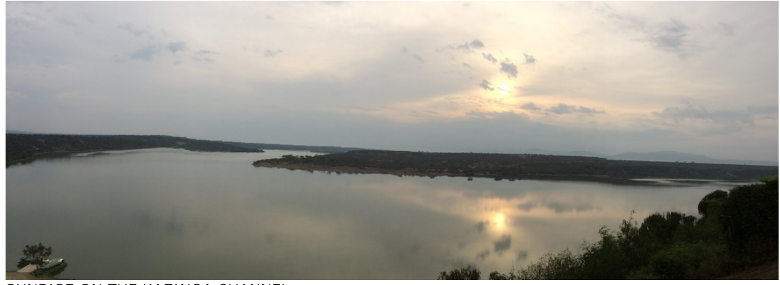
SUNRISE ON THE KAZINGA CHANNEL

The following morning as the sun rose over the channel, to the honking sounds of hippos and striking cries of the African Fish Eagle, we all enjoyed a hearty breakfast before heading to south to Ishasha.