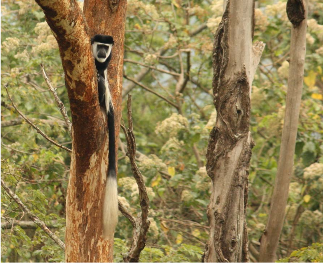
GUEREZA COLOBUS MONKEY

On entering Kibale Forest we spotted our first primate!!! A family of Guereza Colobus monkeys were sitting high up in the Eucalyptus trees, which mark the start of the Forest. These great looking black and white primates were resting after their morning feed. Colobus monkeys, have a complex and sacculated stomach, which is able to process difficult plant materials as they prefer unripe, green or brown fruits, seeds or pods instead of more ripe, soft and colourful fruits like most other primates, and therefore spend long periods resting to allow digestion to take place. This allowed us to get a great view of them before they decided to leap very confidently and acrobatically from tree to tree, with their long balancing tails.