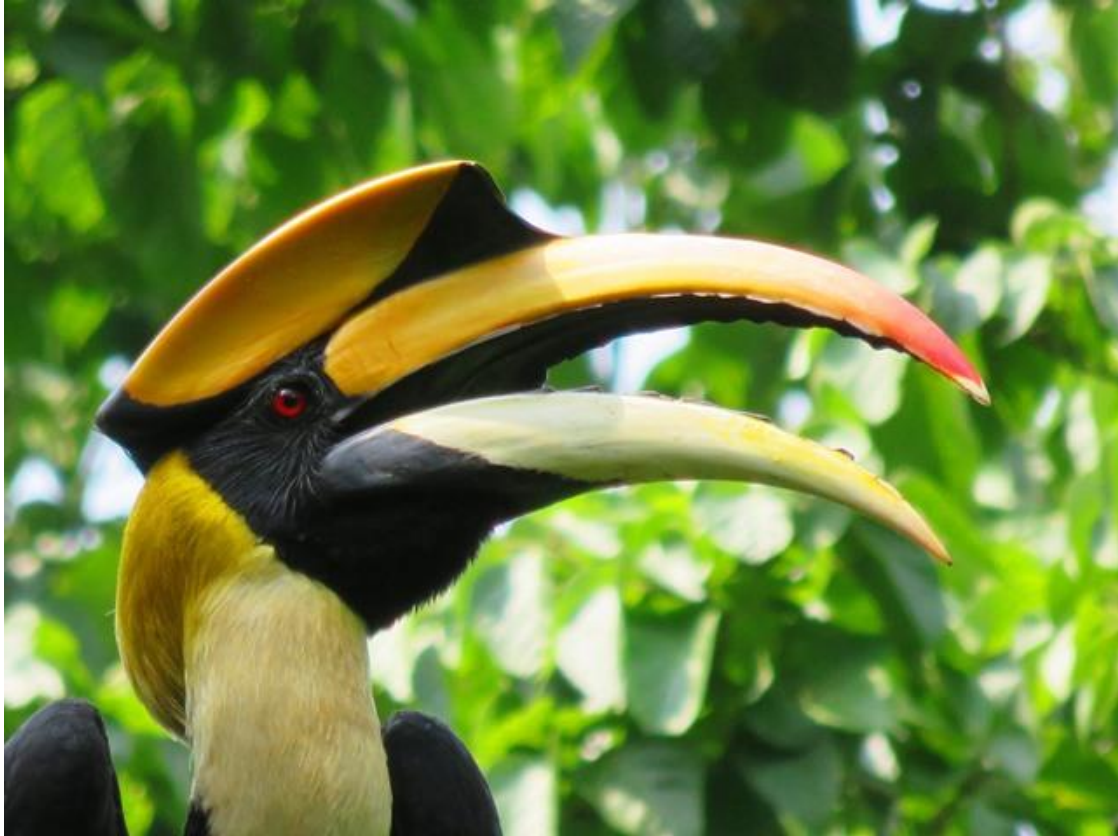
The amazing Great Hornbill

After the last year trip to central India, in 2018 I wanted to visit another wonderful Indian place for mammal watching: Kaziranga National Park in the state of Assam. Having not too many days for holidays, I preferred to spend a lot of time in this Park, visiting all ranges, and not to waste time in long road transfers. I added a day at Hollongapar Gibbon Sanctuary for primates. The last two days were spent in Delhi for archeological sightings and bazaars of this incredible megalopolis.