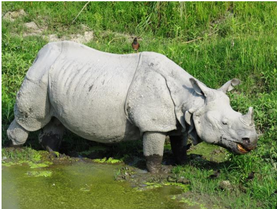
A Rhino male just before wallowing

But the best encounter was with an honorary mammal: the huge and incredible Great Hornbill , seen on two different nests, giving extremely close views of males coming and feeding the females locked inside the tree cavity! Such a huge, grotesque, colorful and impressive bird is a real must-see!