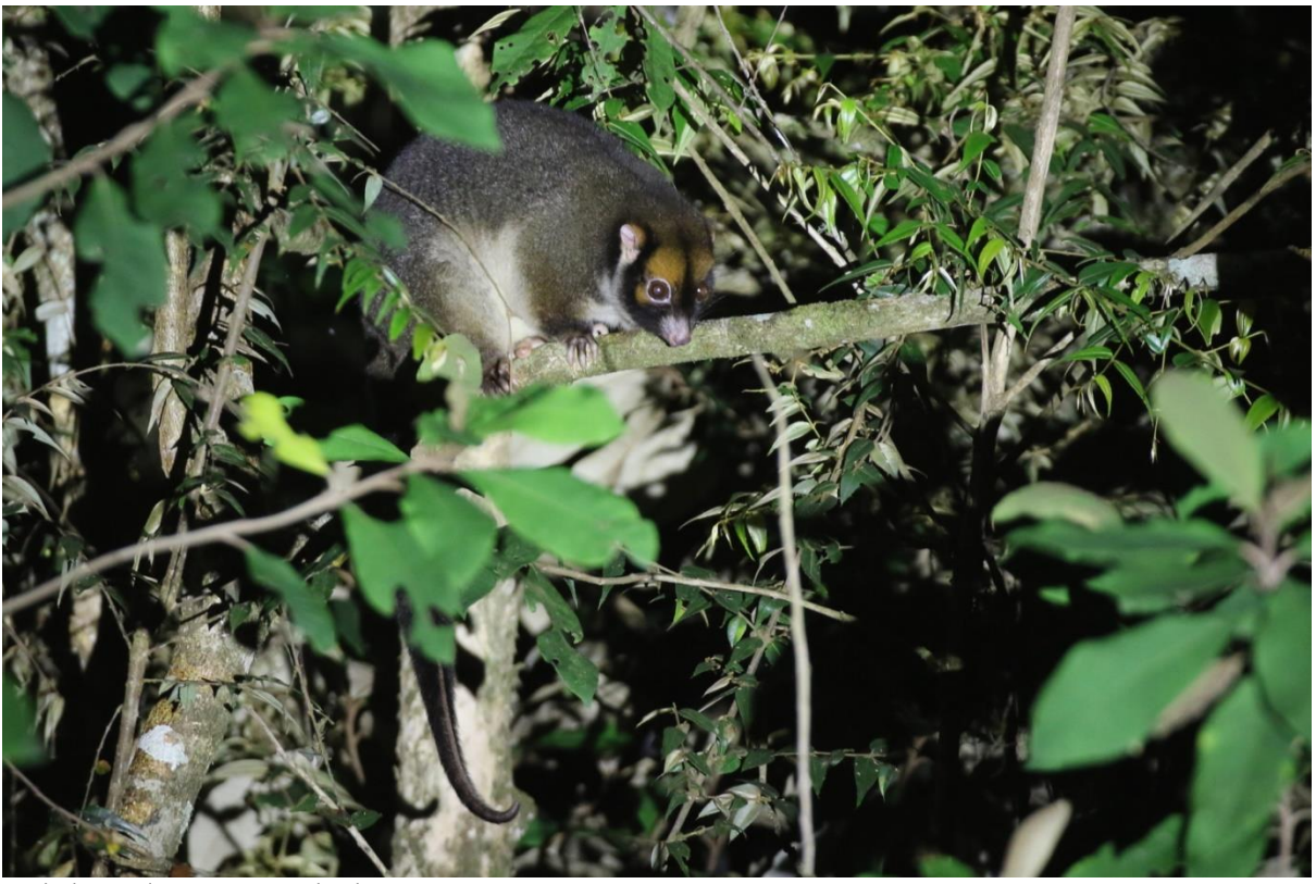
Masked Ringtail Possum at Kumul Lodge

Working as a bird guide but try to see mammals as we go along! Unfortunately we only have limited amount of time to look for mammals on a birdwatching tour, but as more and more people interested in mammals we try to see as much as possible – combine night birding with mammals. Some locations visited for birds can be interesting for mammals too so a few notes and coordinates could help future mammal watchers when planning a tour. All coordinates were taken out from the maps.me app which I used during the tour. It has been a few years I was in PNG and since that visit my interest also turned towards mammals as well. This is a short recap what we managed to see on the BIRDQUEST classic PNG tour in 2022.