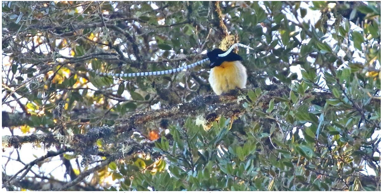
Finally there is no PNG report without Bird-of-paradise. This is a male King-of-Saxony Bop.

This is a posh lodge near Tari on the way to the Tari Gap. It is operated by Trans Niugini Tours and can be pre-booked (<a href="http://www.pngtours.com/lodge1.html">http://www.pngtours.com/lodge1.html</a>). It has a good garden for wildlife and also several fantastic locations along the road towards the Tari Gap. We mostly did night birding in the lodge garden. The only mammal we saw daytime way a fantastic Speckled (Spotted) Dasyure, probably the same individual on two consecutive days. Details see at species accounts. The lodge garden produced some great mammal watching and throughout 4 nights we managed to find Black-tailed Dasyure Murexia melanurus , Mountain Cuscus Phalanger carmelitae , Ground Cuscus Phalanger gymnotis , Feather-tailed Possum Distoechurus pennatus , Long-fingered Triok Dactylonax palpator , Large Tree-Mouse Pogonomys loriae and Brown Rat Rattus norvegicus .