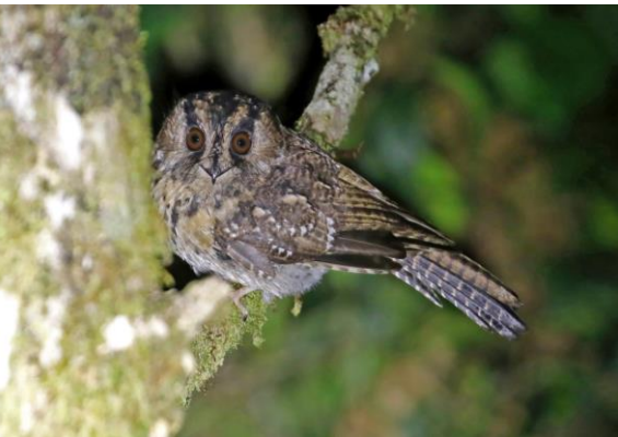
Honorary mammal Montane Owlet-nightjar