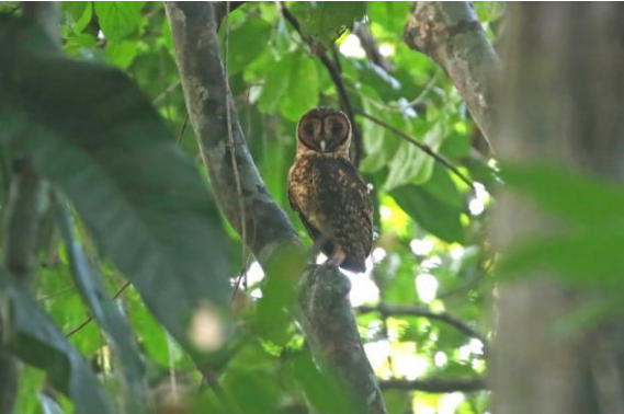
Honorary mammal Golden Masked Owl