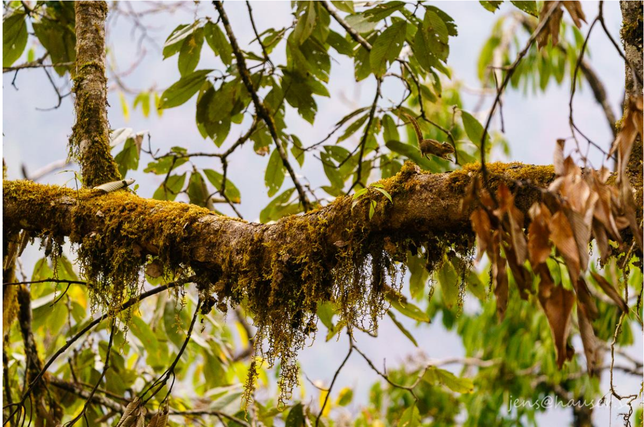
Five-striped palm squirrel ( Funambulus pennantii )

In the evening, we drove up and down the road to Bongpu Camp, and it was one of the best sightings of the whole trip to Eaglesnest. We spotted Red giant flying squirrel ( Petaurista petaurista ), Northern red muntjac ( Muntiacus vaginalis ), Bhutan giant flying squirrel ( Petaurista nobilis ) and Red giant flying squirrel ( Petaurista petaurista ).