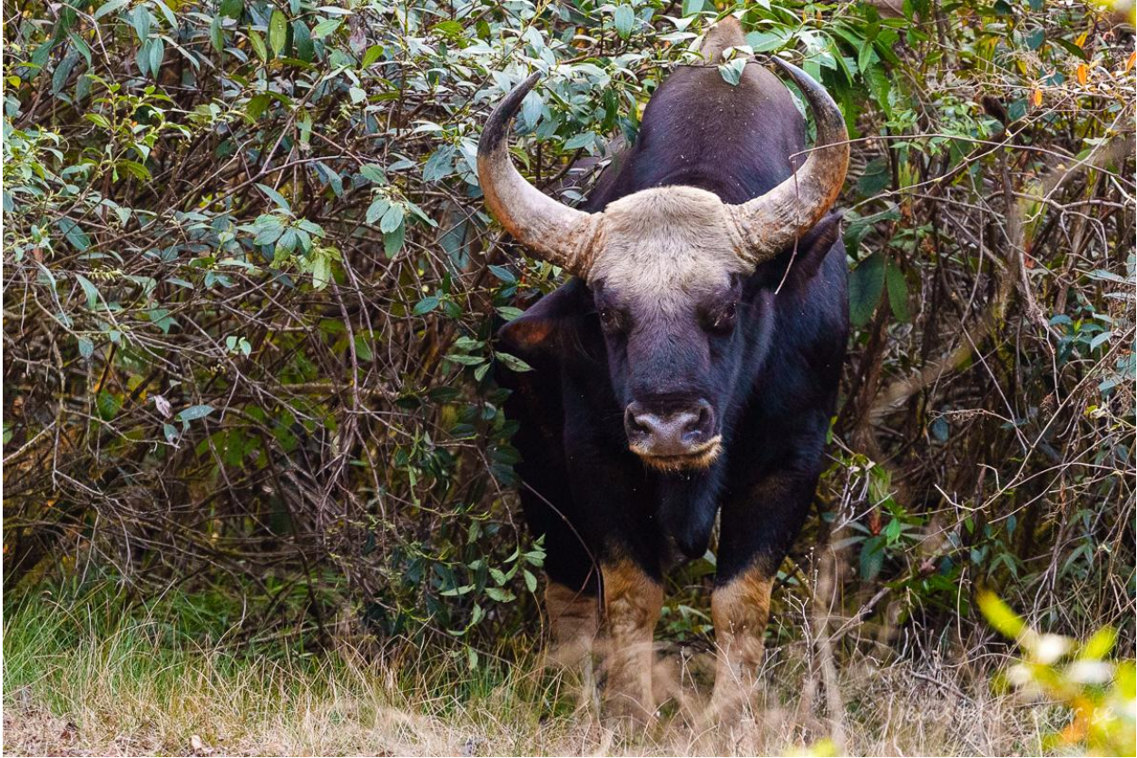
Gaur ( Bos gaurus )

After breakfast, we drove from Bongpu Camp to Lama Camp and saw two very angry Gaurs ( Bos gaurus ) that didn't want us to pass. We had to sit in the car and wait for them to calm down a bit and return to the forest again. They are just massive and could easily squash the car like a bug.