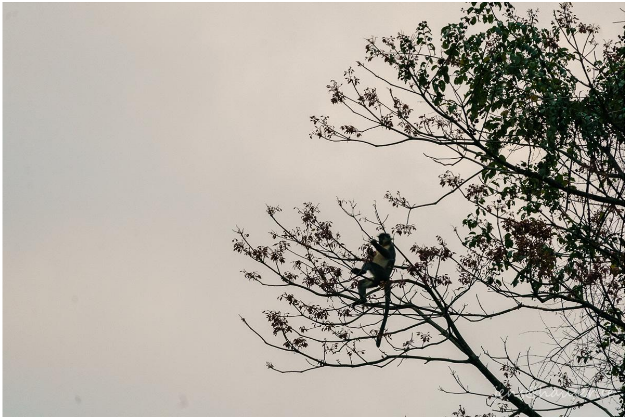
Capped Langur ( Trachypithecus pileatus )

We drove the road to Lama camp in the evening and didn't find any mammals at all.