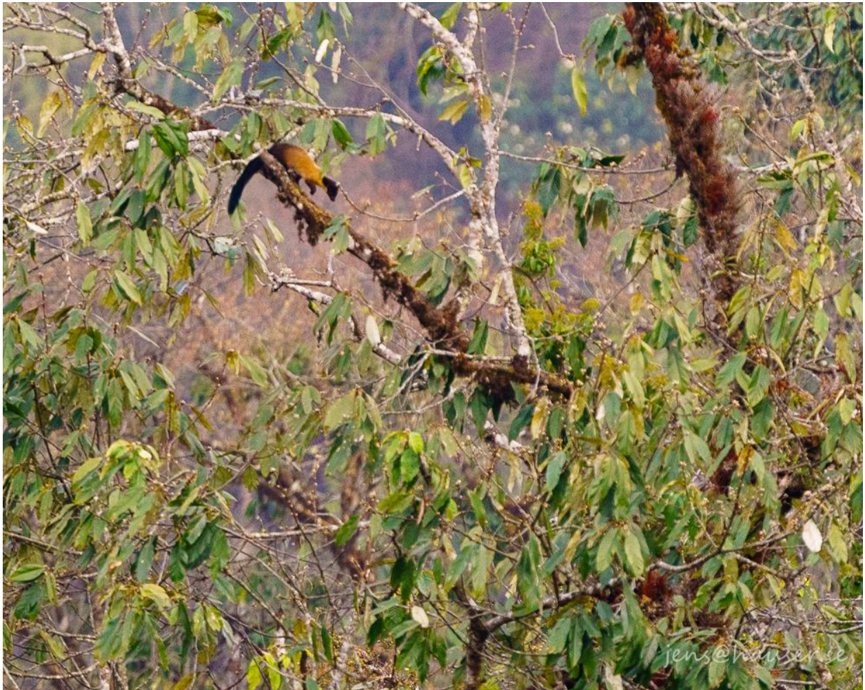
Yellow-throated marten ( Martes flavigula )

https://www.mammalwatching.com/wp-content/uploads/RV-Arunachal-Pradesh-2019.pdf