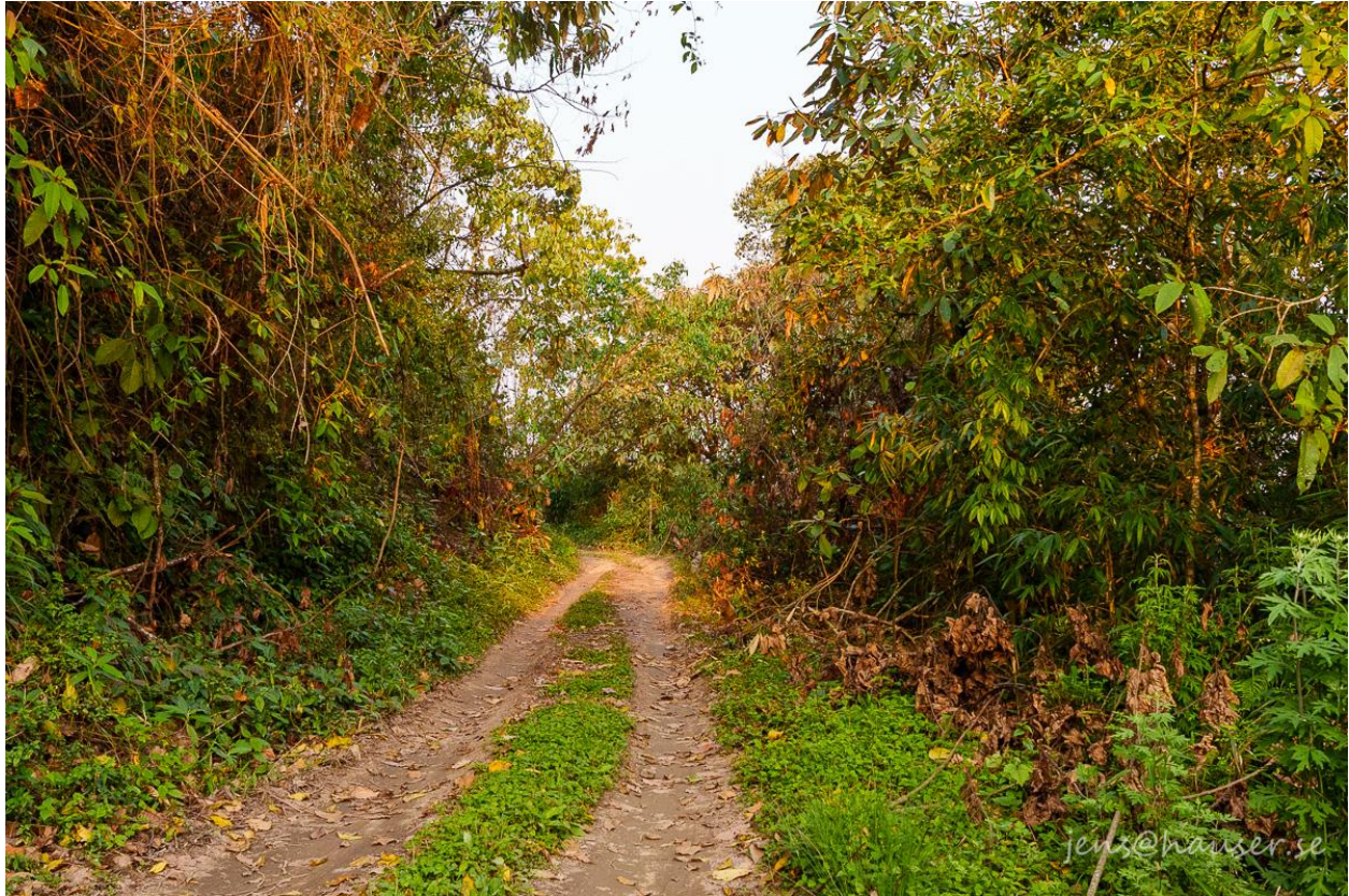
The road between the camps.