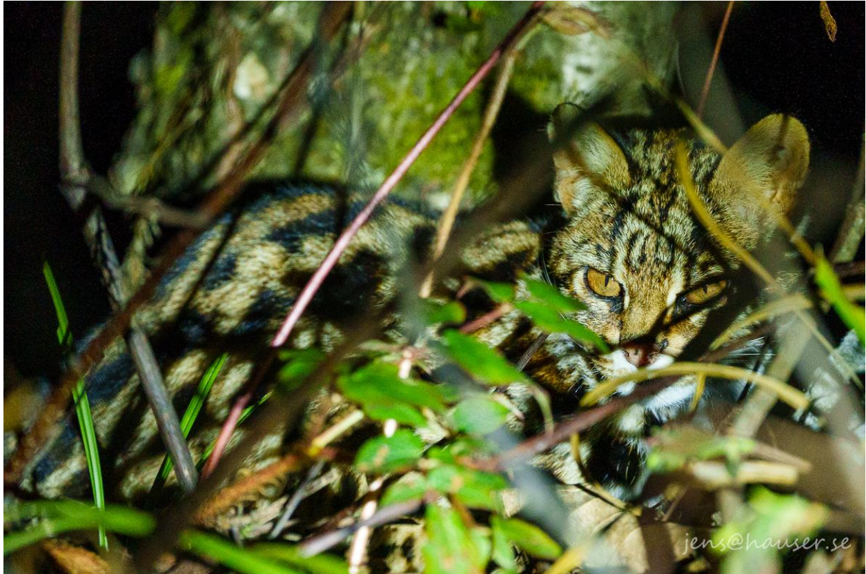
Leopard cat ( Prionailurus bengalensis )