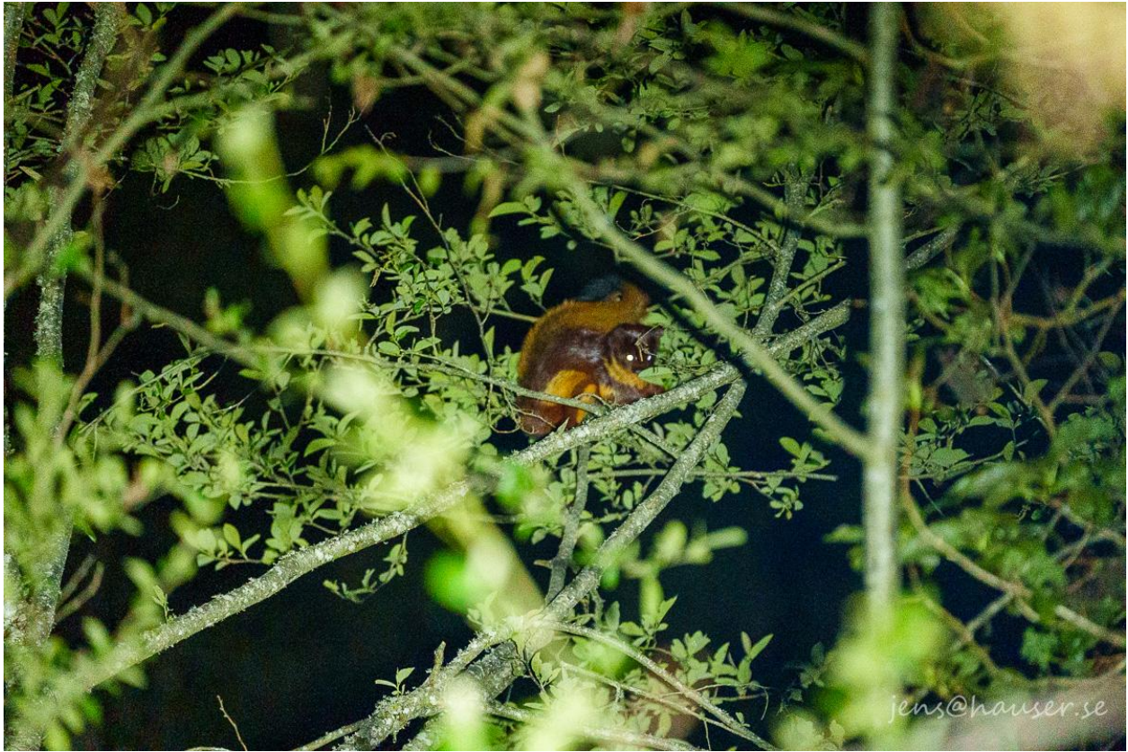
Red giant flying squirrel ( Petaurista petaurista )