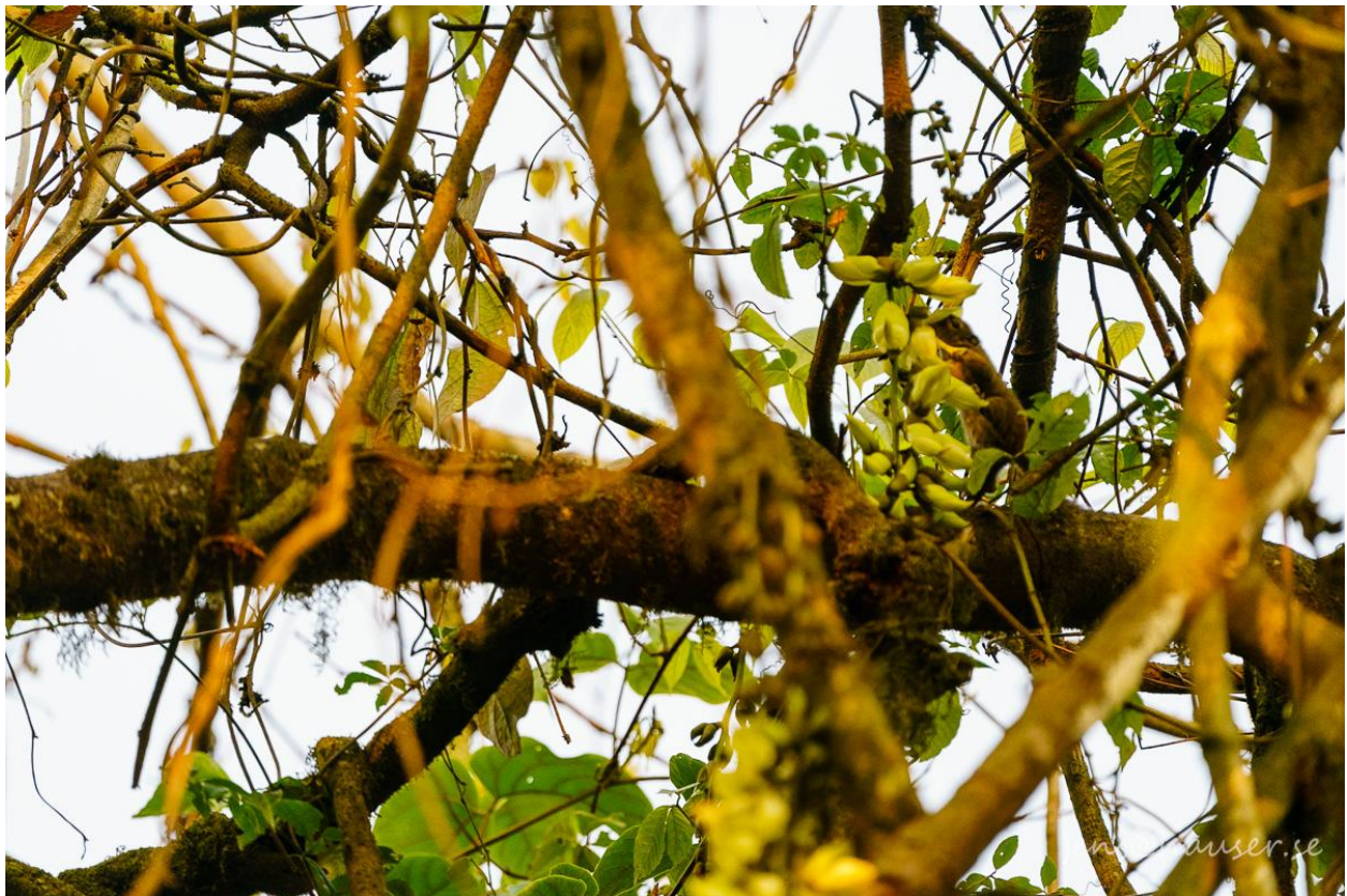
Orange bellied Himalayan squirrel ( Dremomys lokriah )

In the evening, between 19-23, we drove the car up and down the road between the camps, and I only saw a Northern Red muntjac ( Muntiacus vaginalis ).