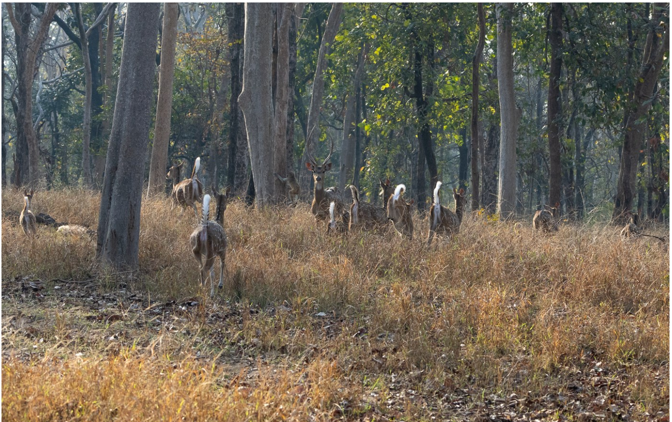
Alarmed spotted deer