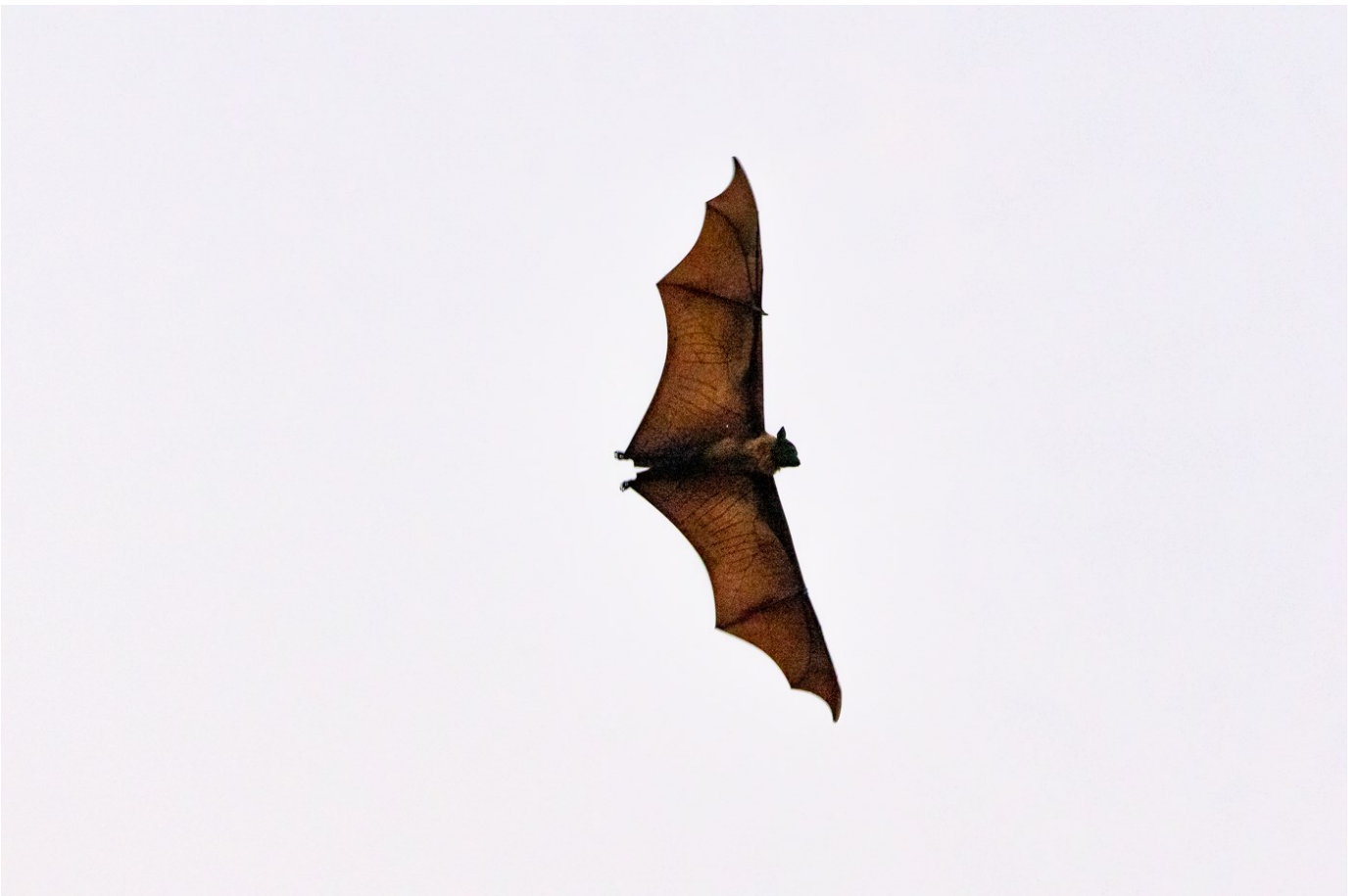
Flying fox fly by