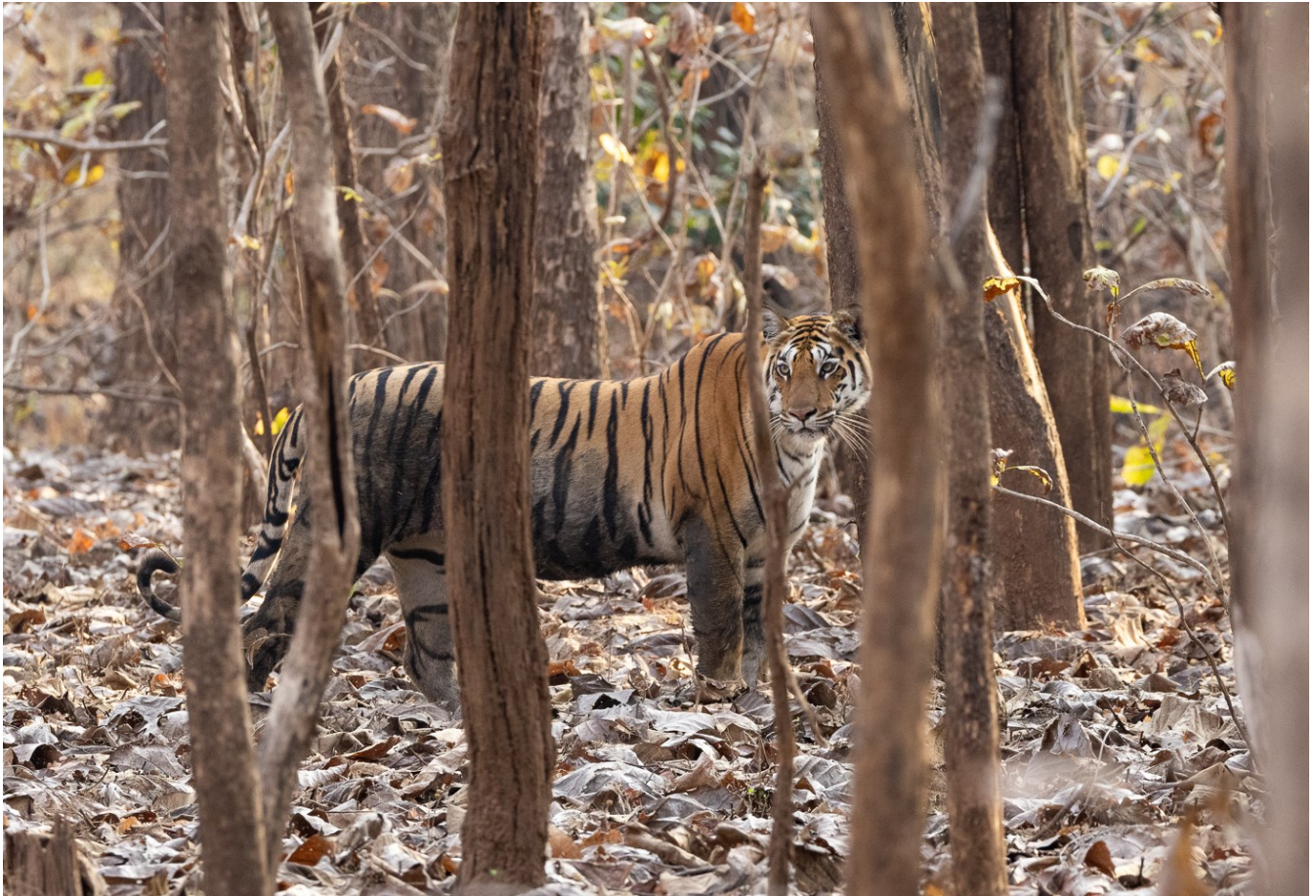
A second tigress taking a walk after a nice mud bath