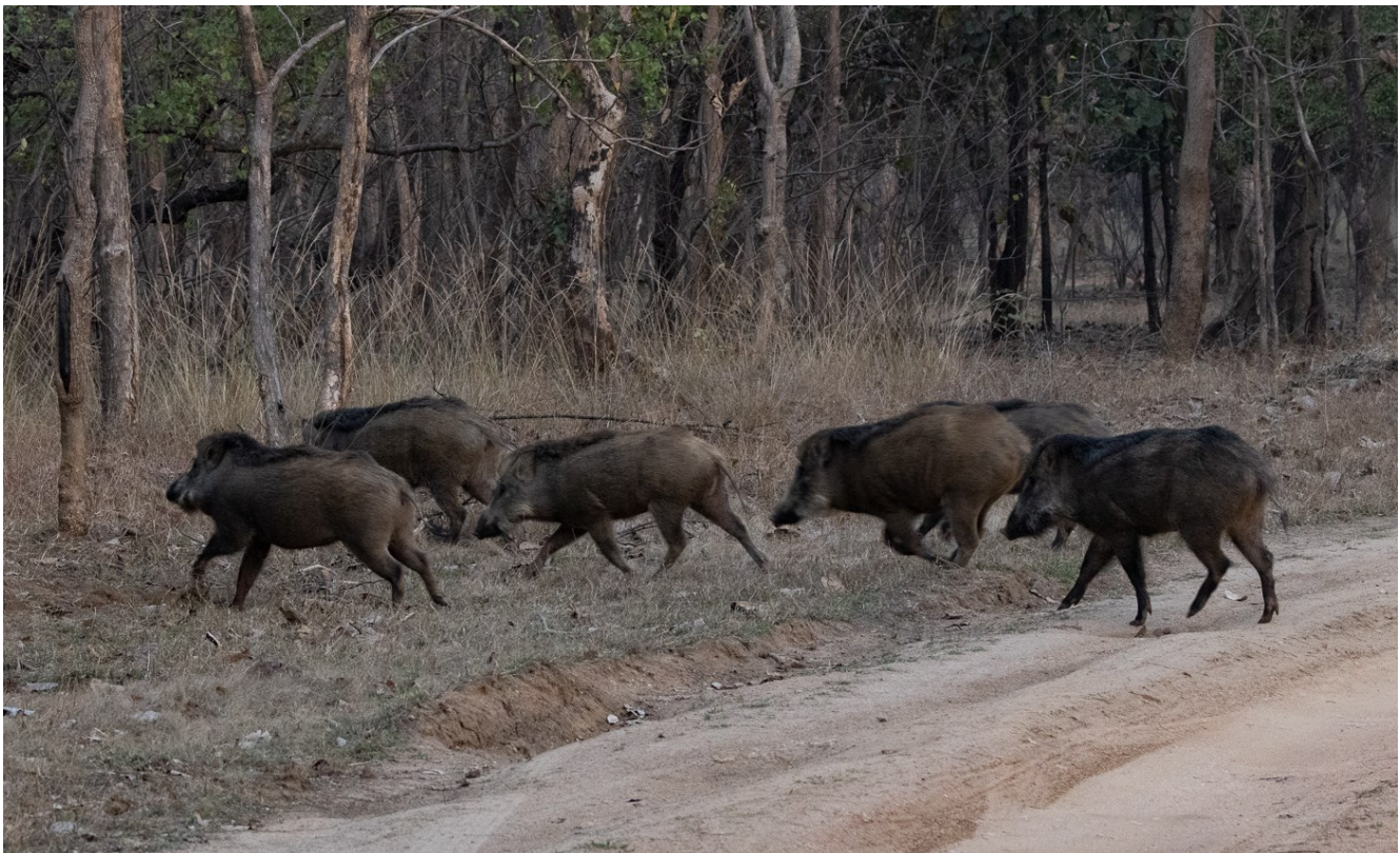
Alarmed wild boar