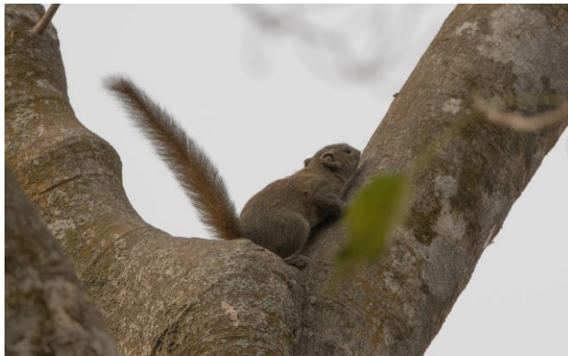
Hoary bellied squirrel in hotel tree (Guwahati)