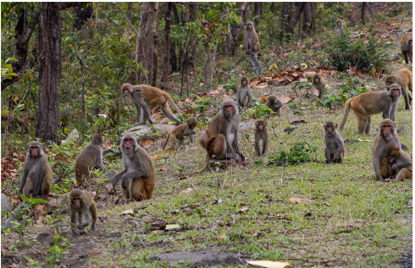
A family of rhesus macaques in the roadside near Nameri National park