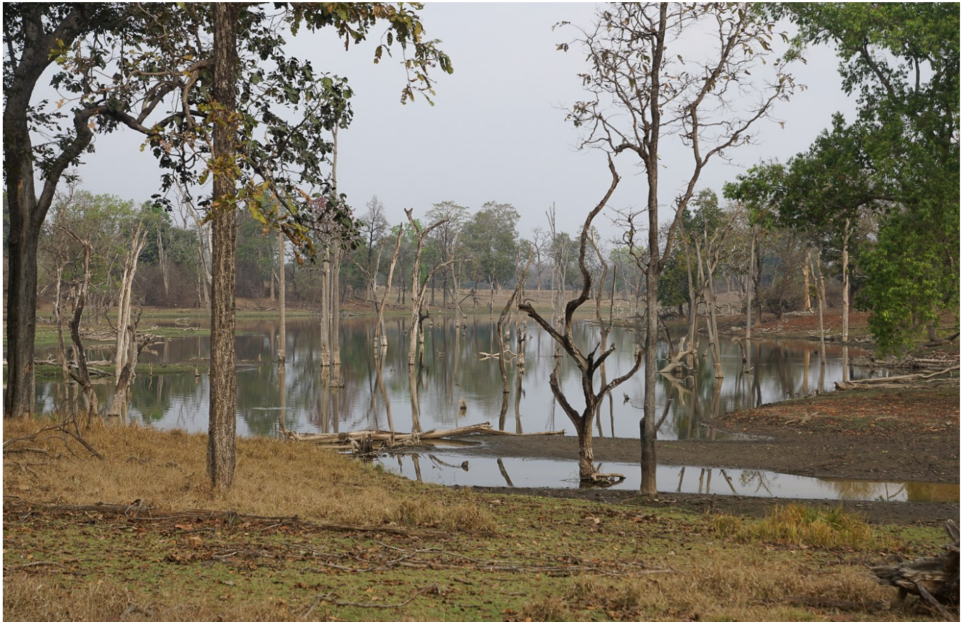
Pench little lake view