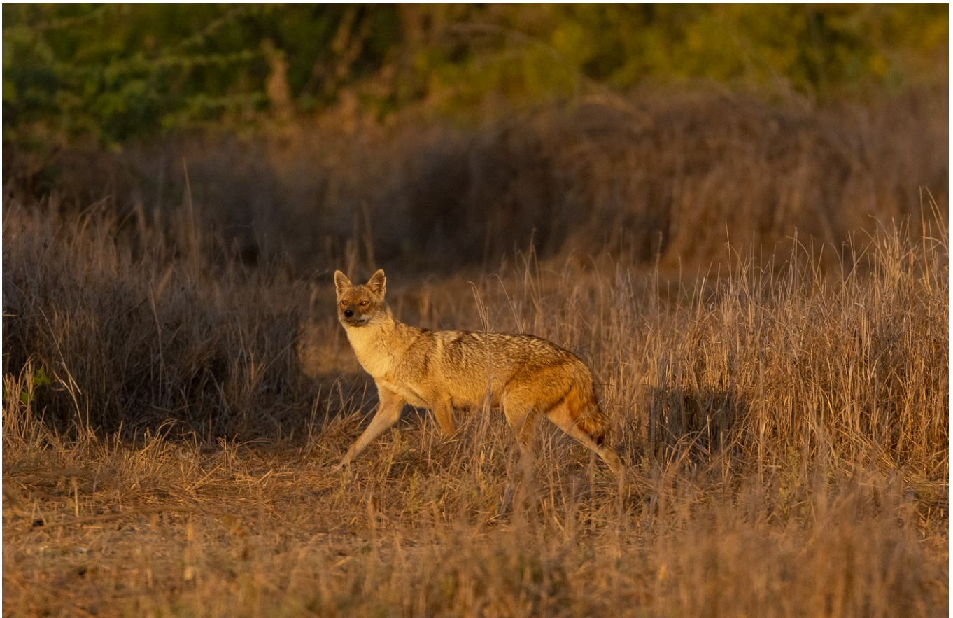
Golden jackal on the move at sunset