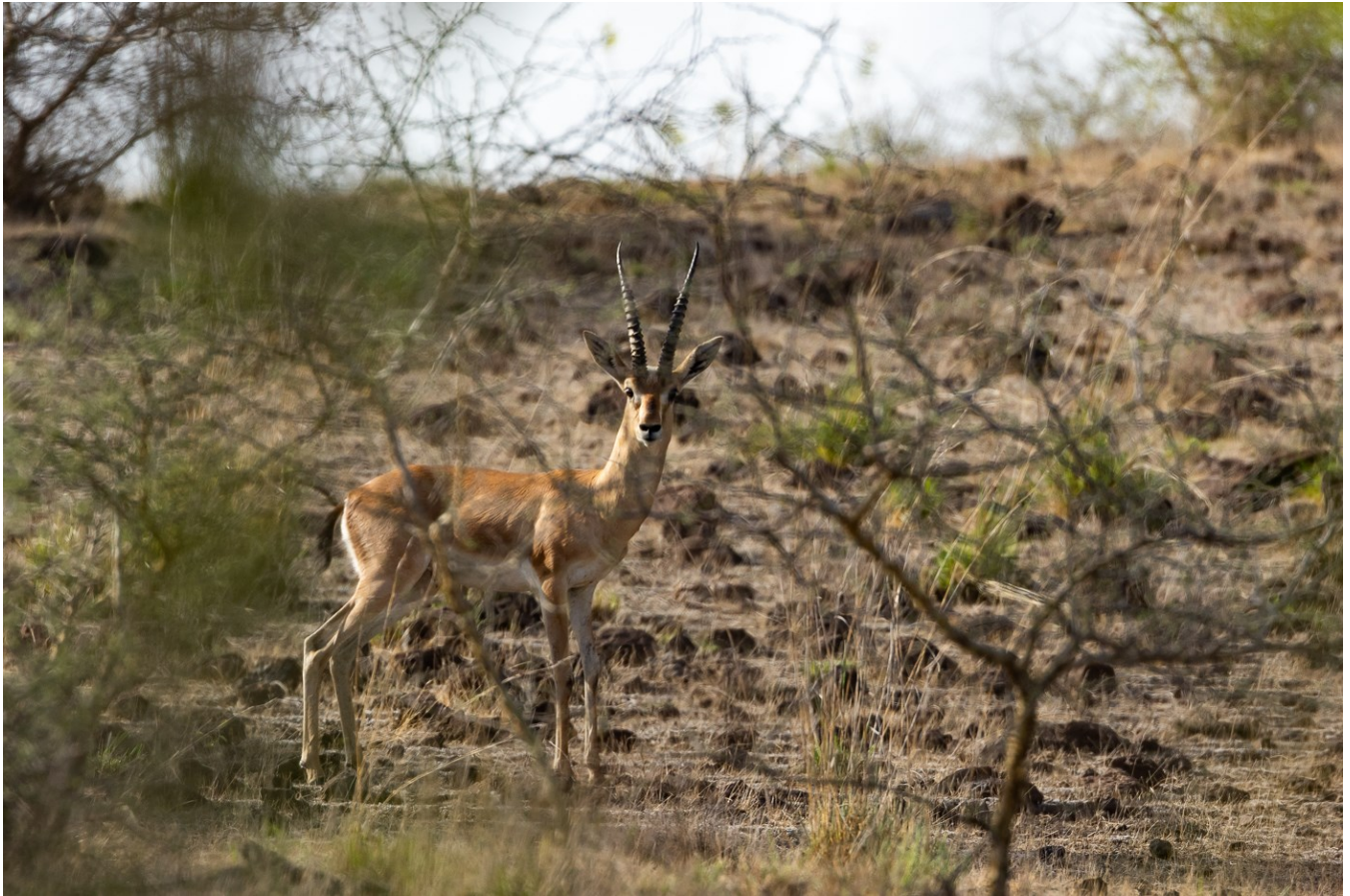
a very skittish Chinkara