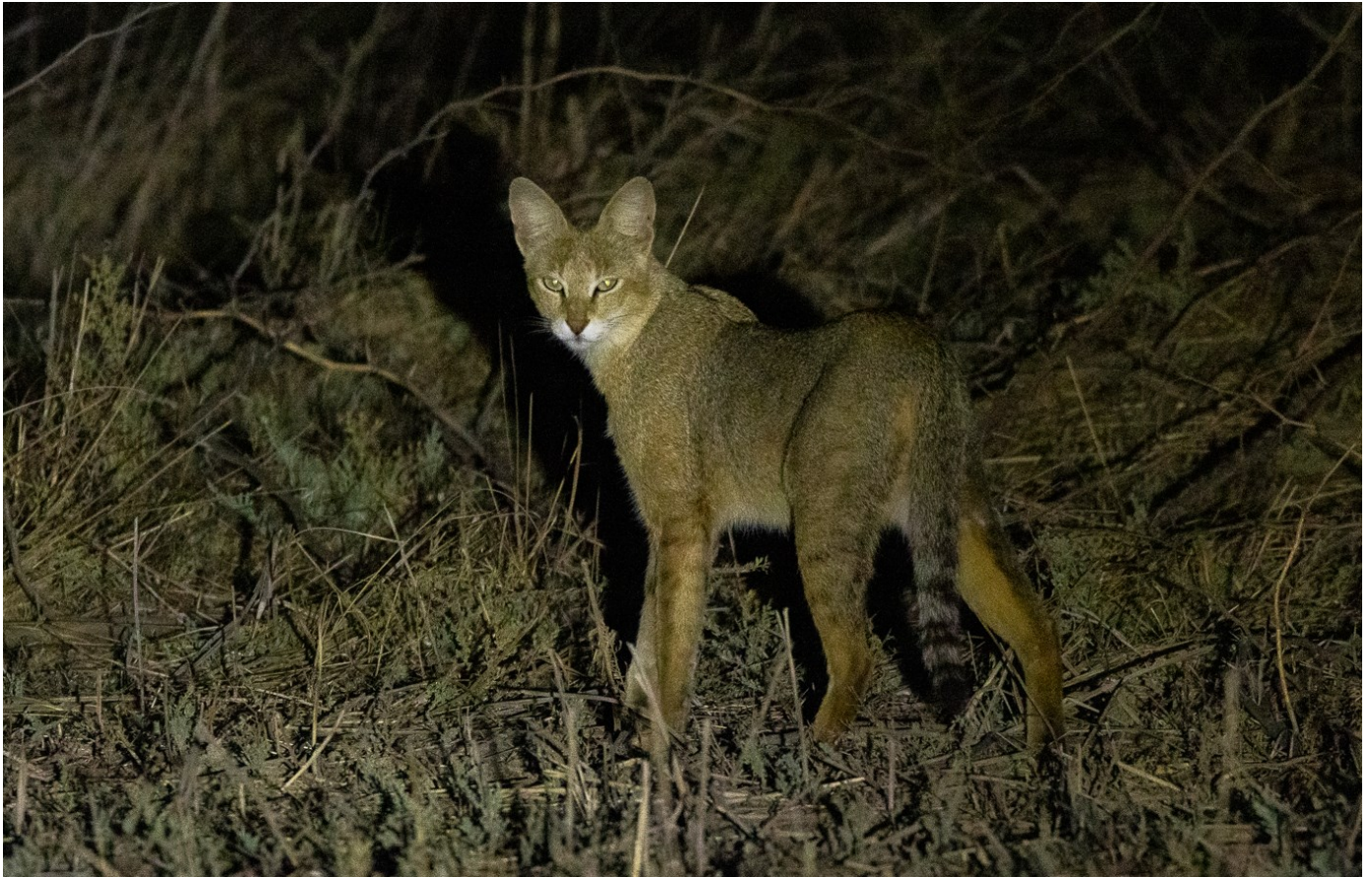
Jungle cats & A serious jungle cat 'stand-off'