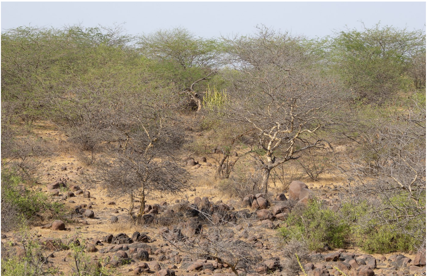
Thorn-scrub forest of Gujarat