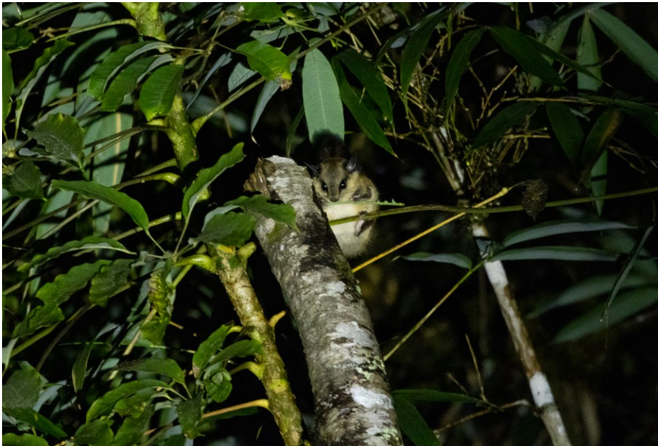
Parti-coloured flying squirrel