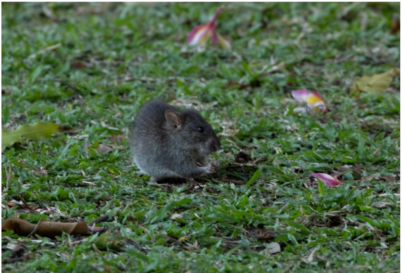
Brown rat in a Mumbai city park