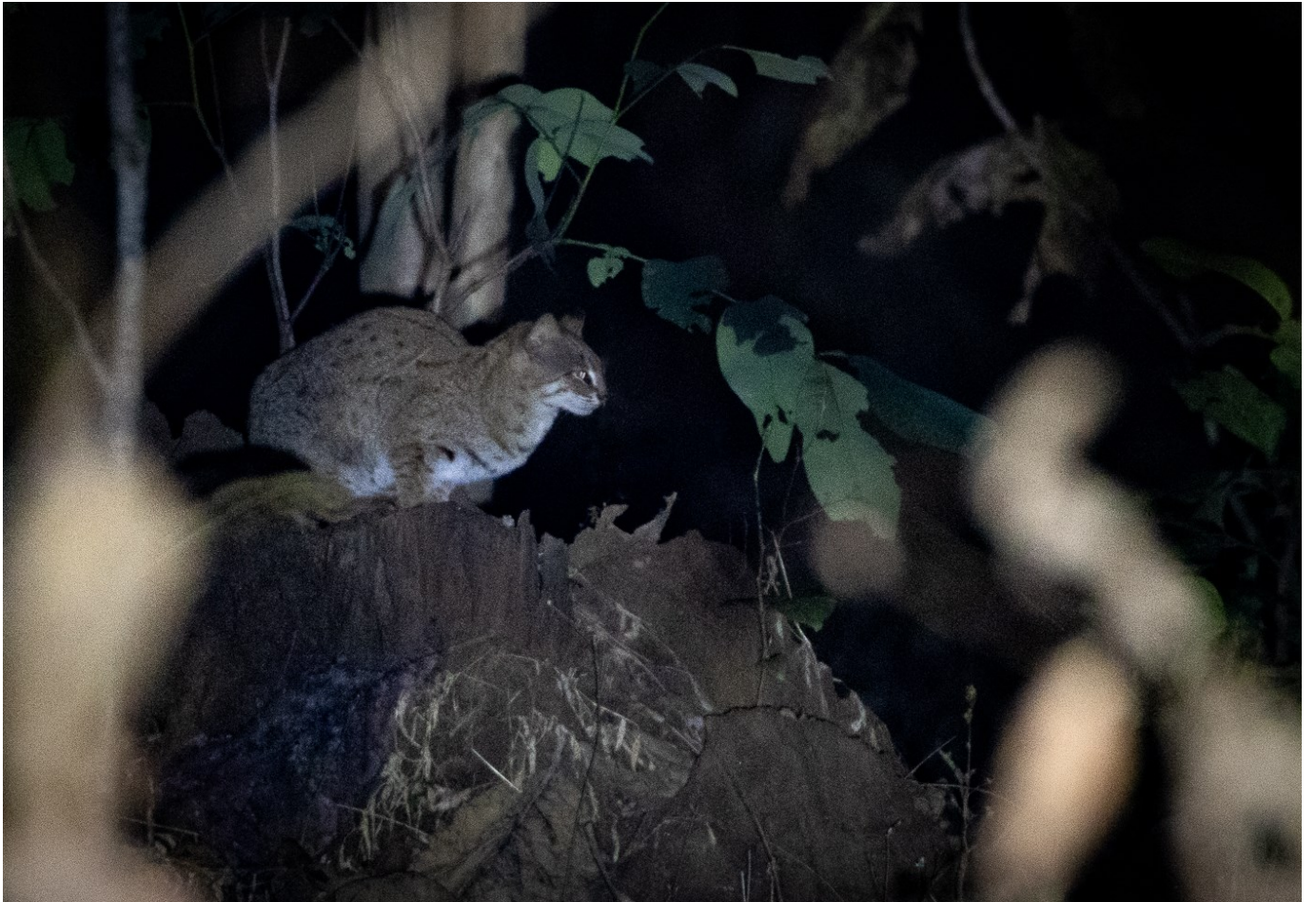
The trip-surprise: Rusty spotted cat!