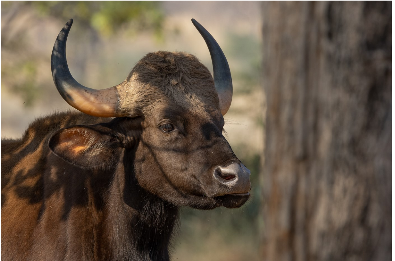
Gaur, only seen in the area close to the large lake of Pench