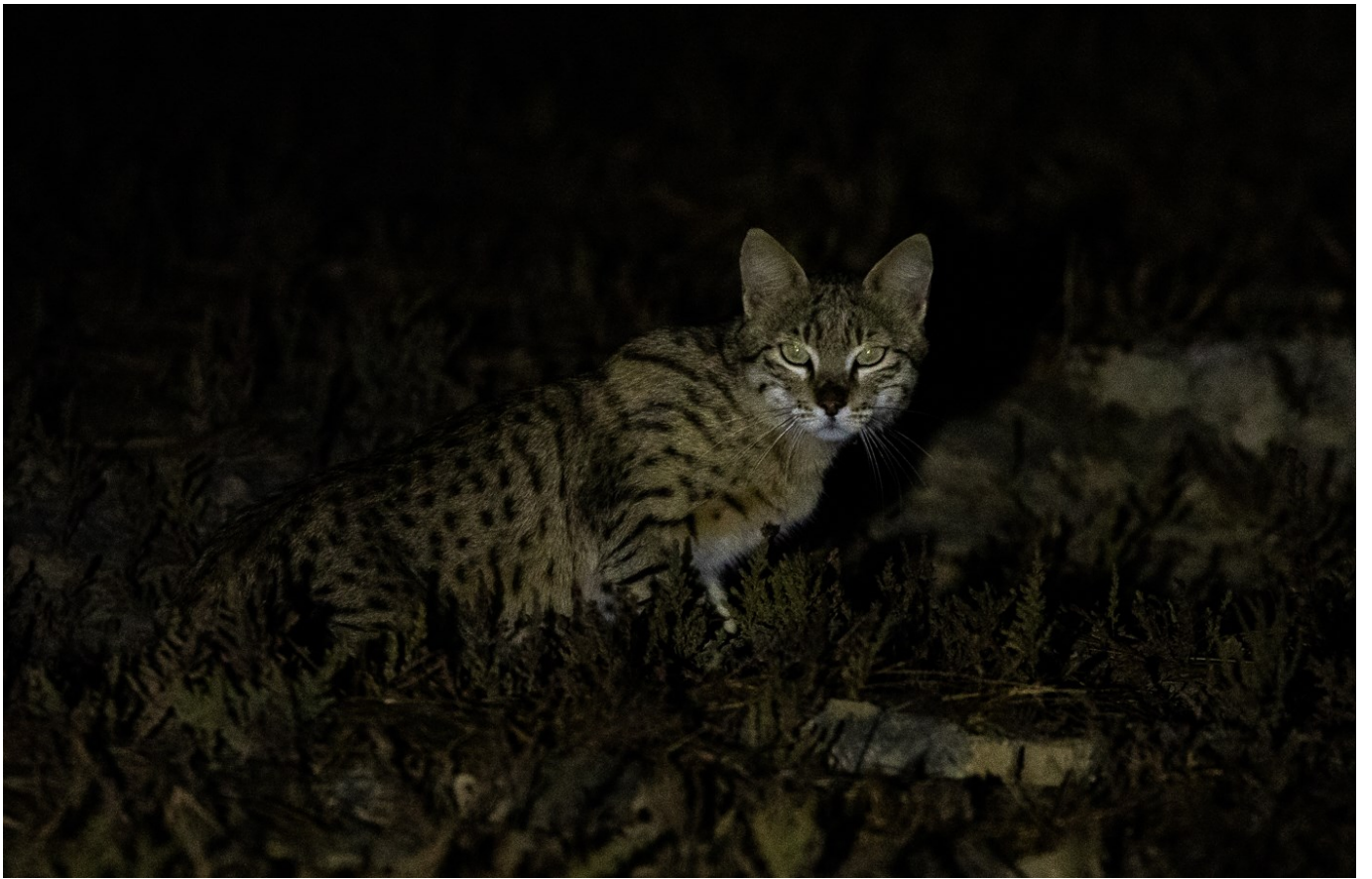
Asiatic wild cat or desert cat on the hunt