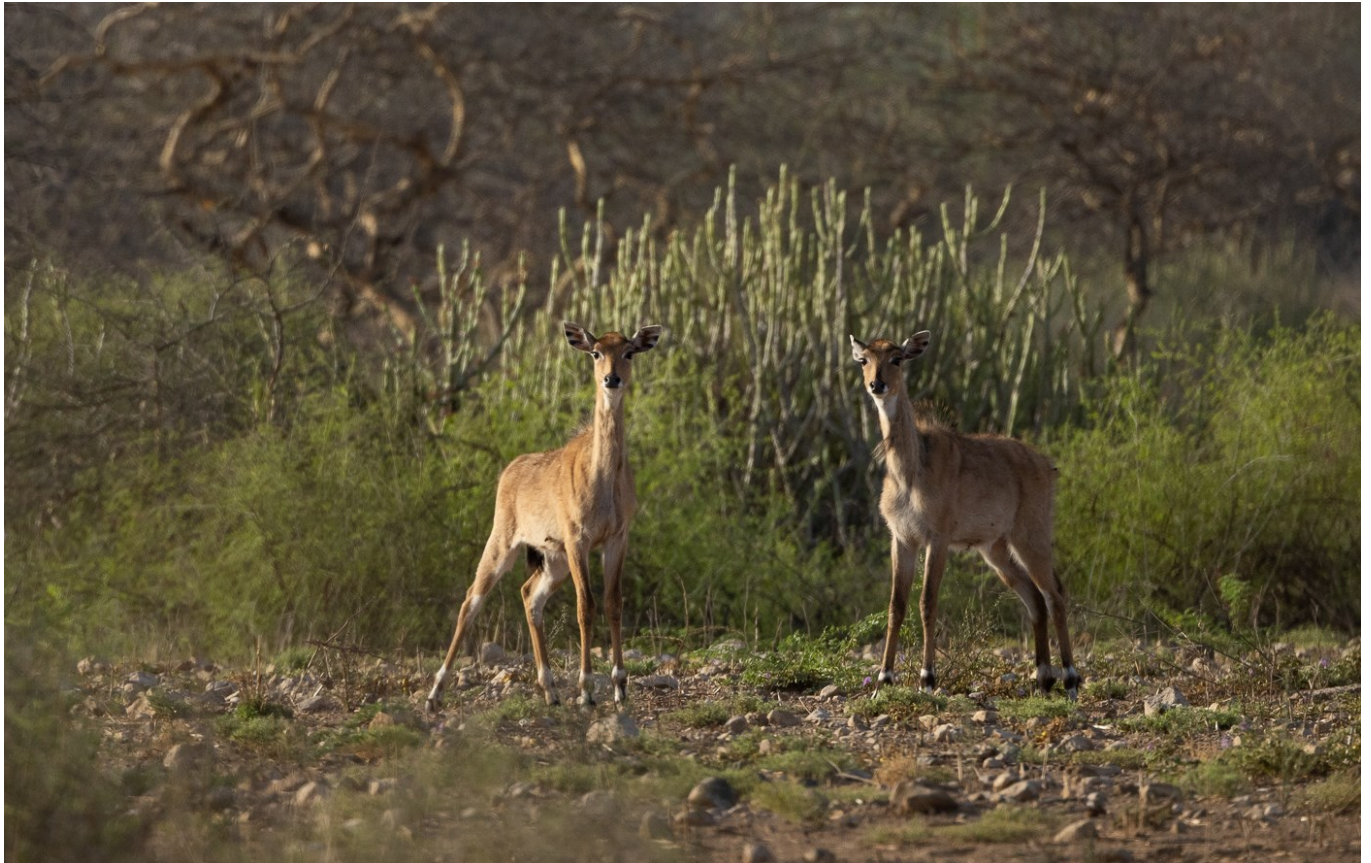
Nilgai females (above) & Nilgai bull (beneath)