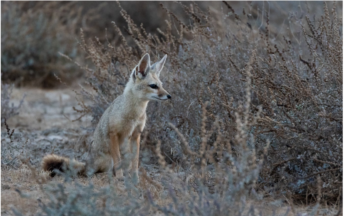
Indian foxes around the den at sunset