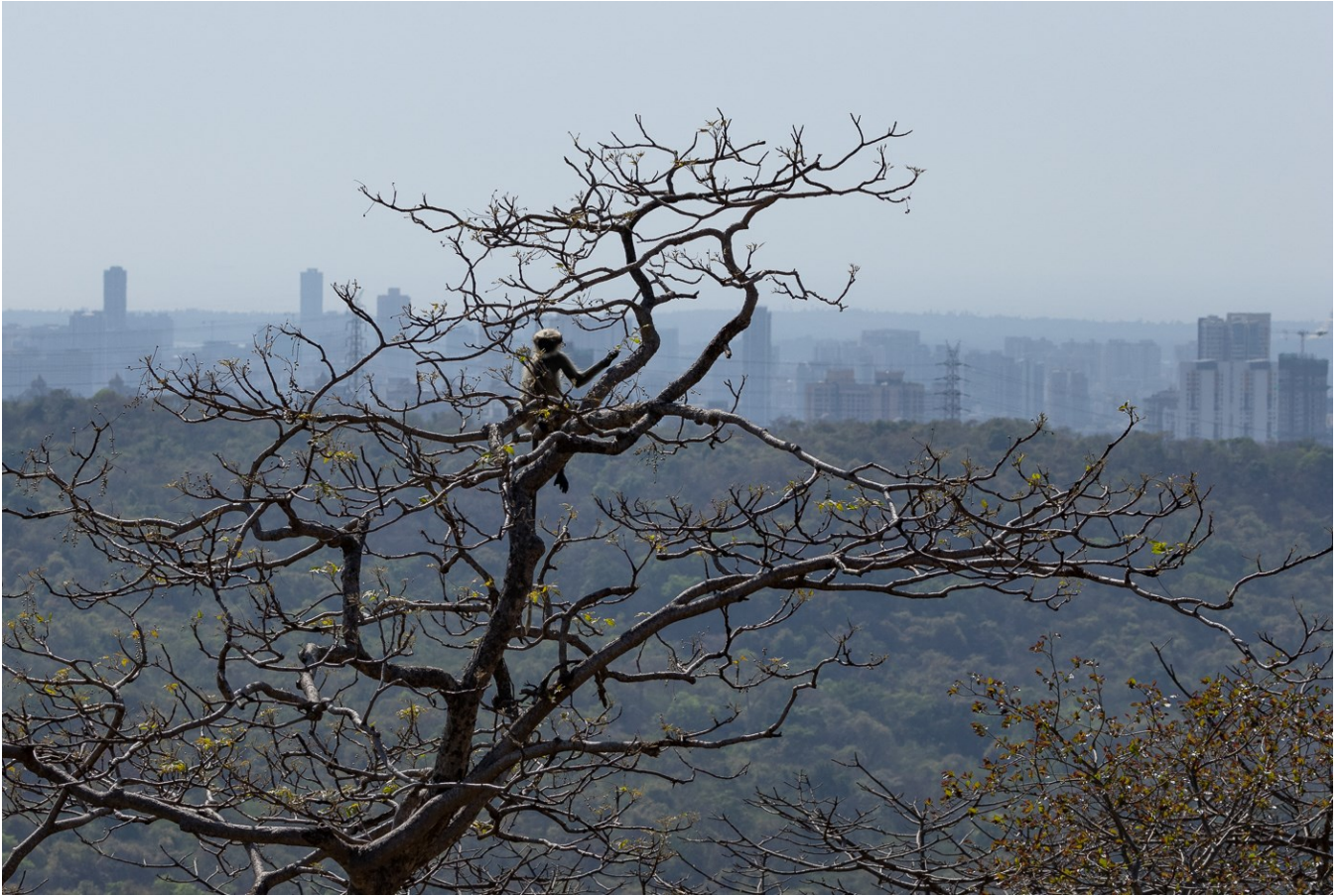
Hanuman langur with Mumbai city overlook