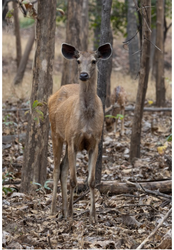
Tigress on the hunt - Sambar & Rhesus macaques