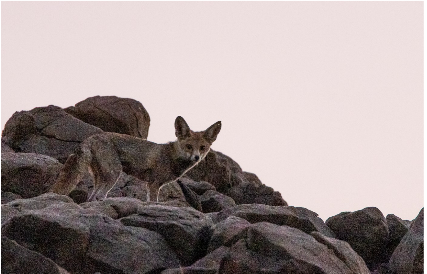
Desert fox 'on bird rock'