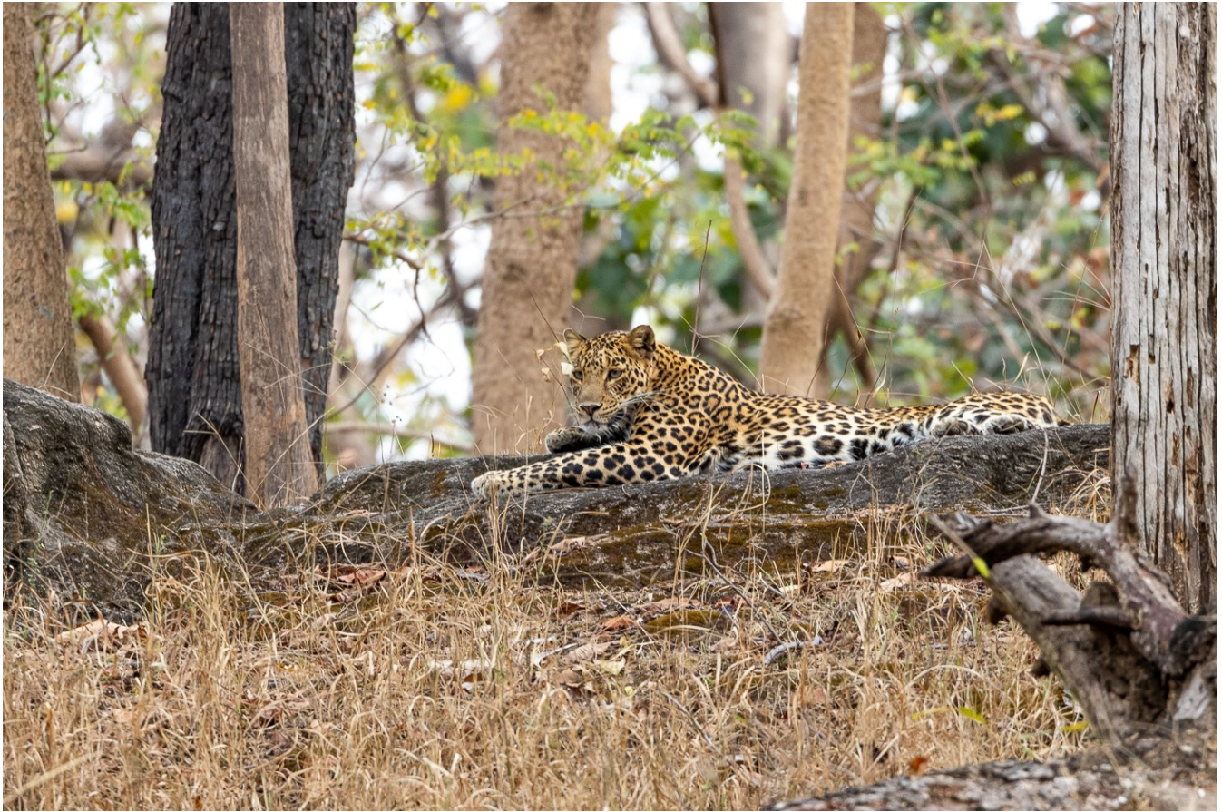
Leopard 'on the rocks'