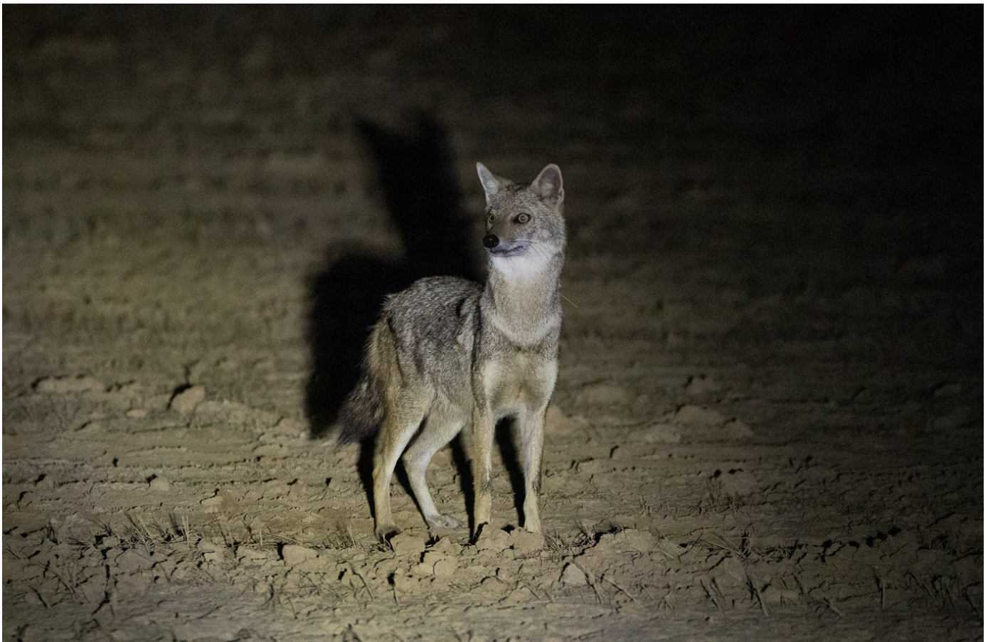
Golden jackal in the spotlight