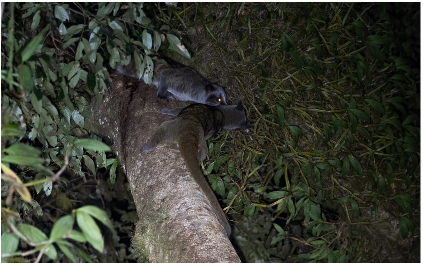
A second one in the same tree means fight!