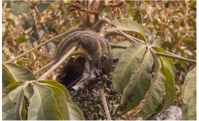
Himalayan striped squirrel