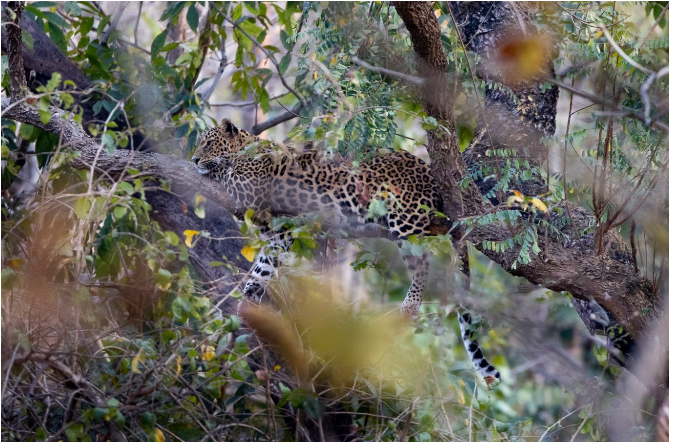
A male leopard relaxing on a tree branch