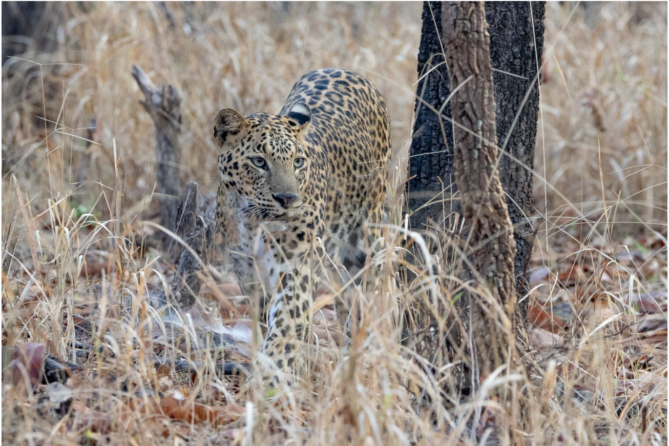
Leopard on a stroll