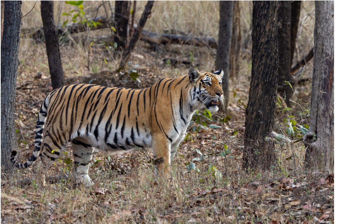
Majestic tigress shows herself