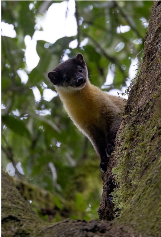
Curious yellow-throated marten