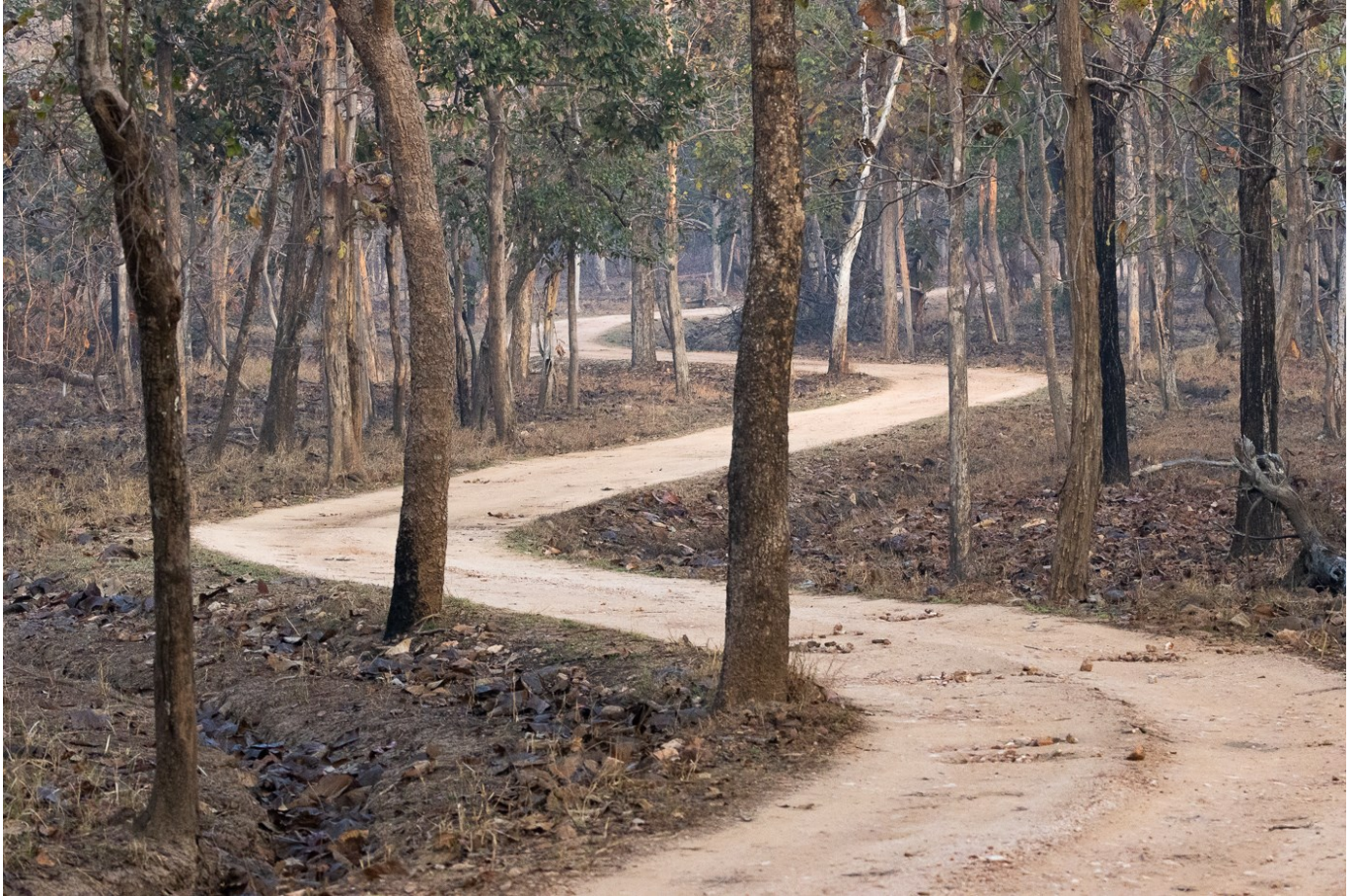
Typical Pench safari roads