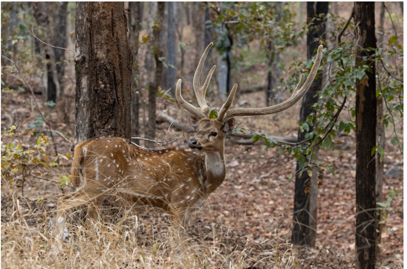
spotted deer alert for danger