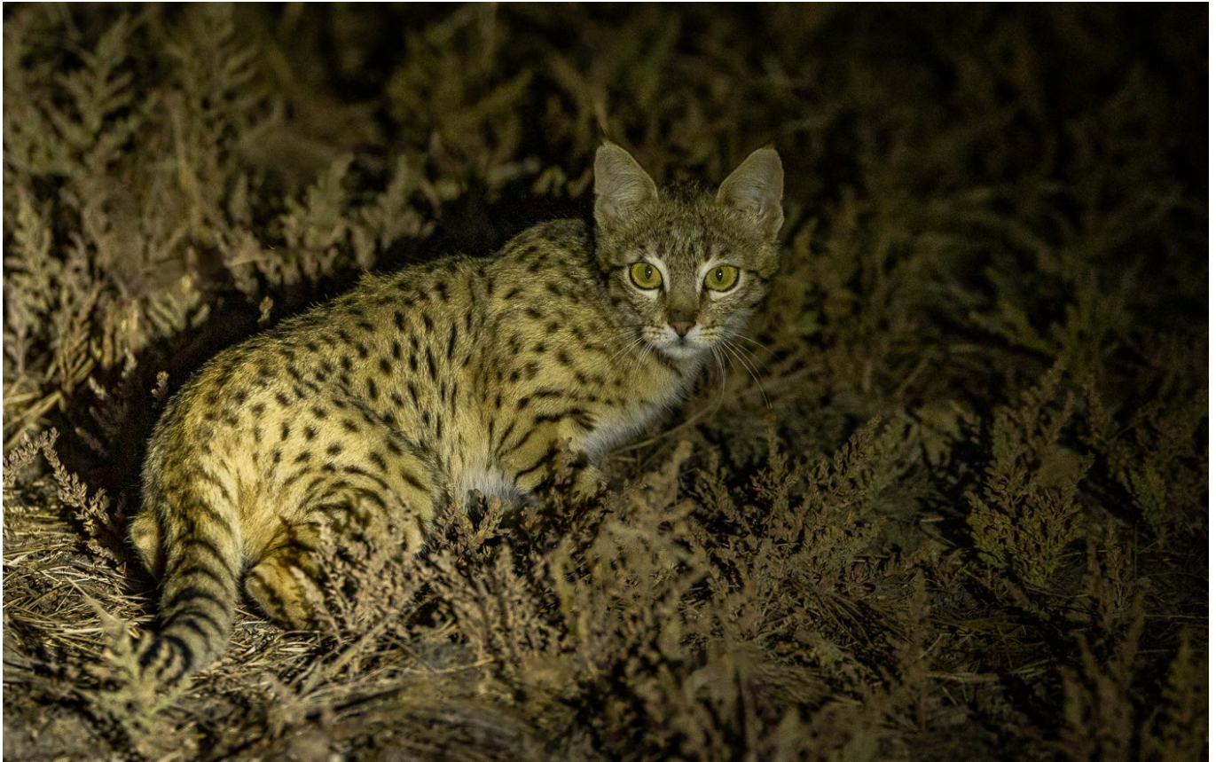
Another Asiatic wild cat – desert cat