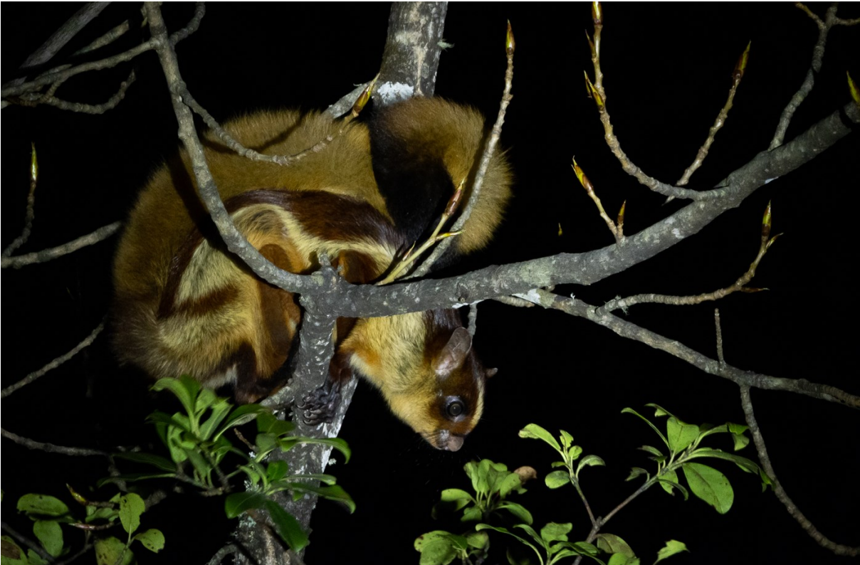
Buthan giant flying squirrel