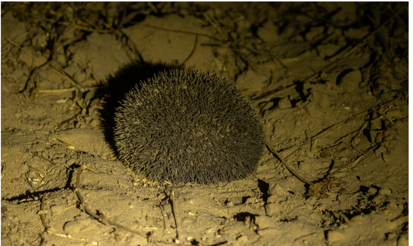
Collared or Desert Hedgehog (dark spines)