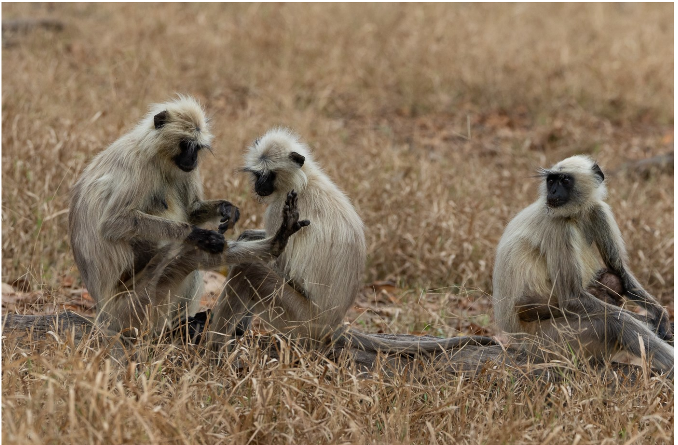
Hanuman langur grooming session