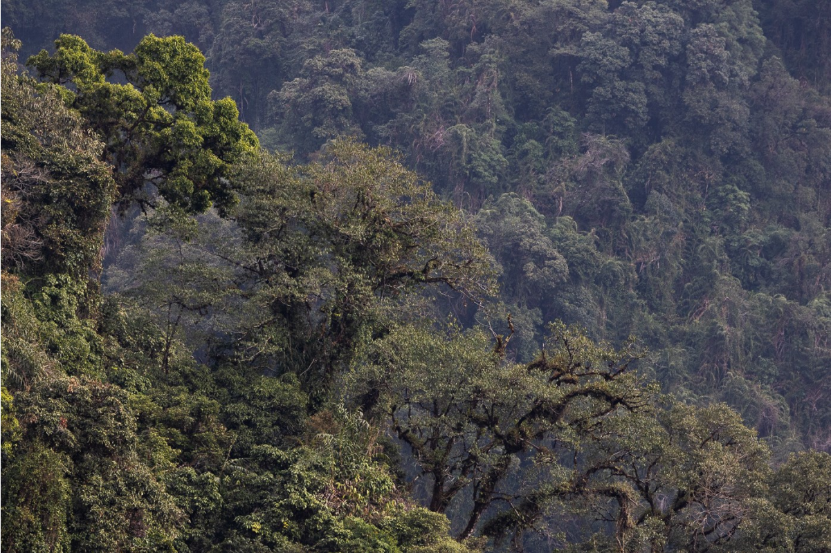
Cloud forest of Eagle's Nest