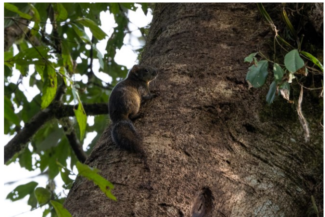
Pallas's squirrel or Orange-bellied Himalayan squirrel?