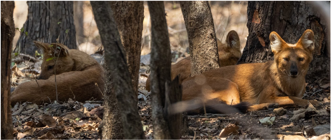
A family of dholes relaxing under the trees