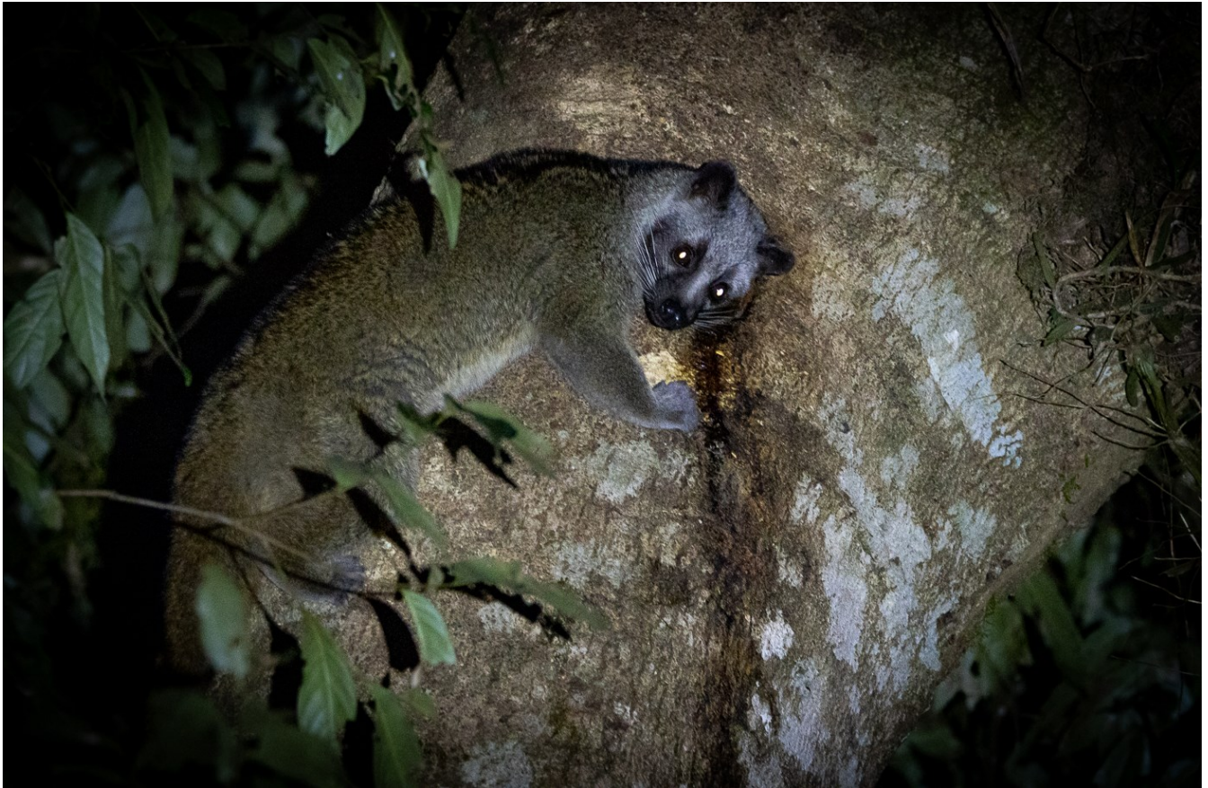
Masked palm civet curious for some tree juices