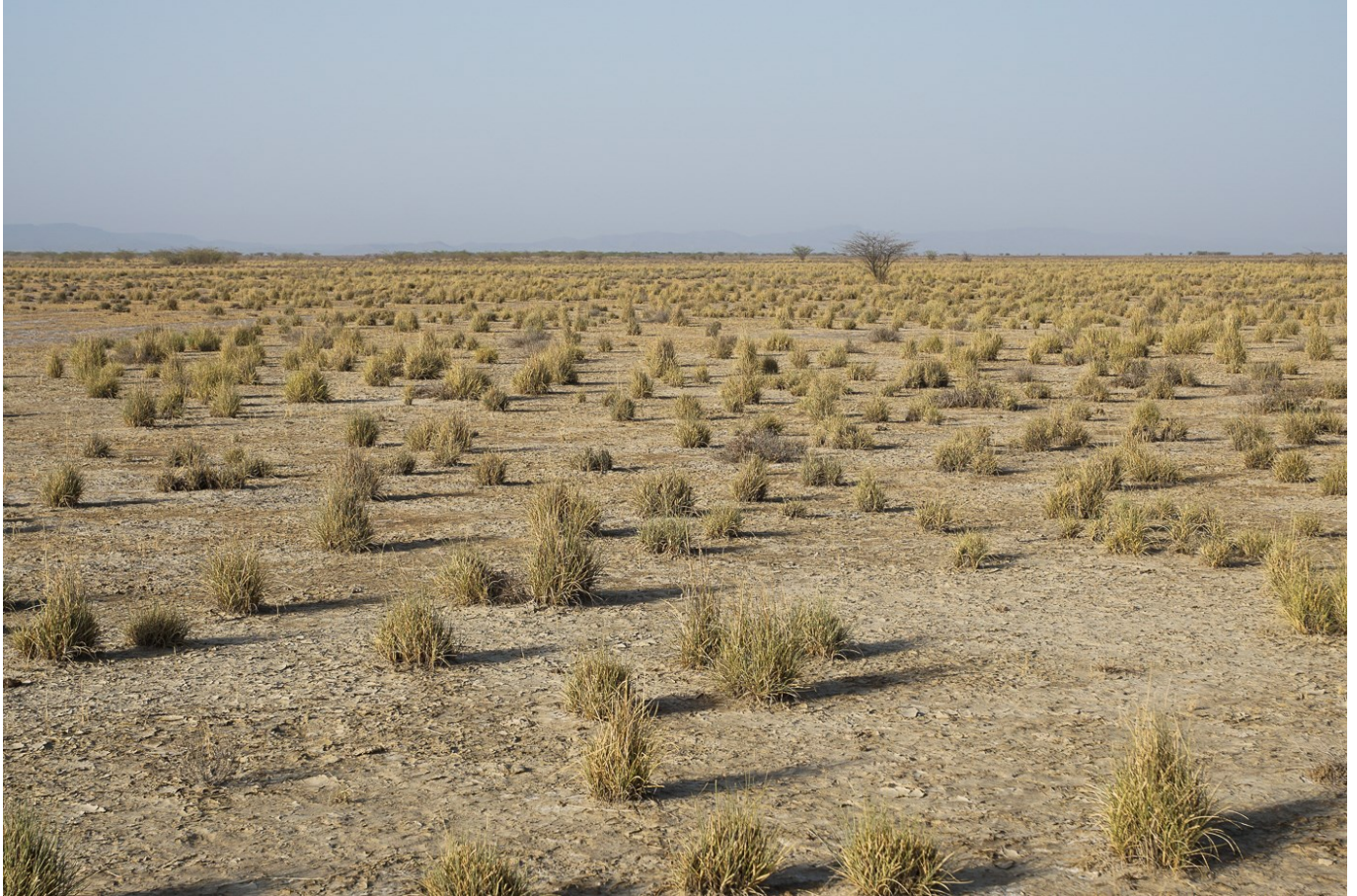
Banni Grasslands, Great Rann of Kutch