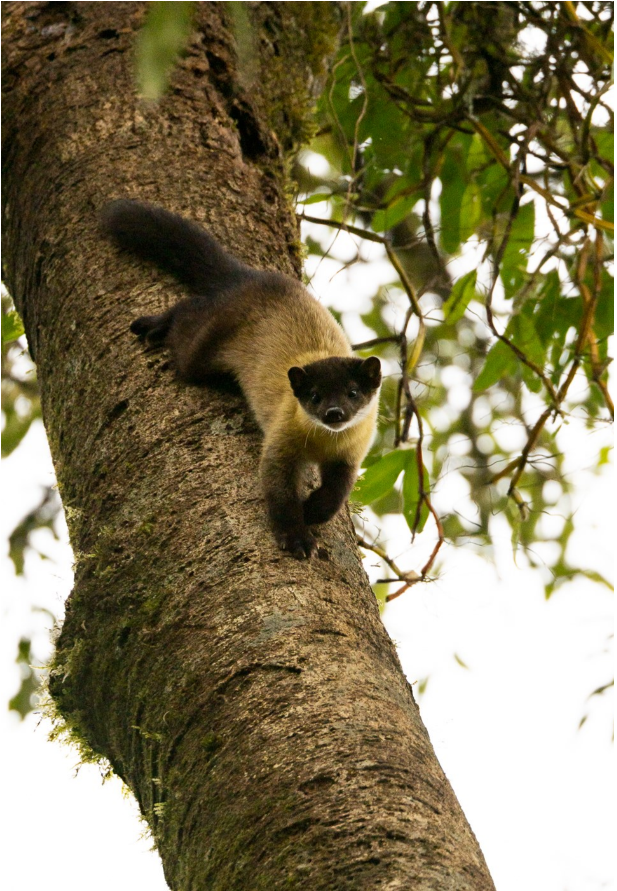
Yellow-throated marten gives a show