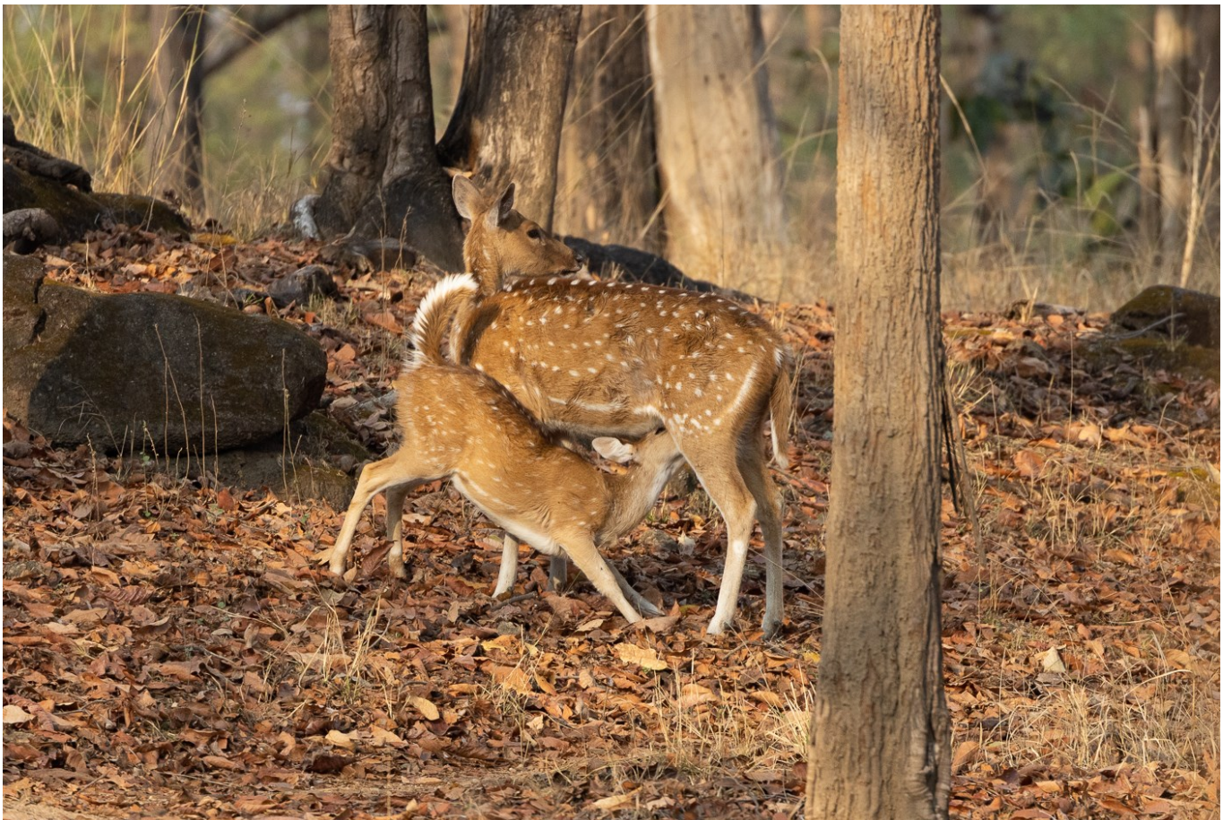
Spotted deer always on the lookout for danger