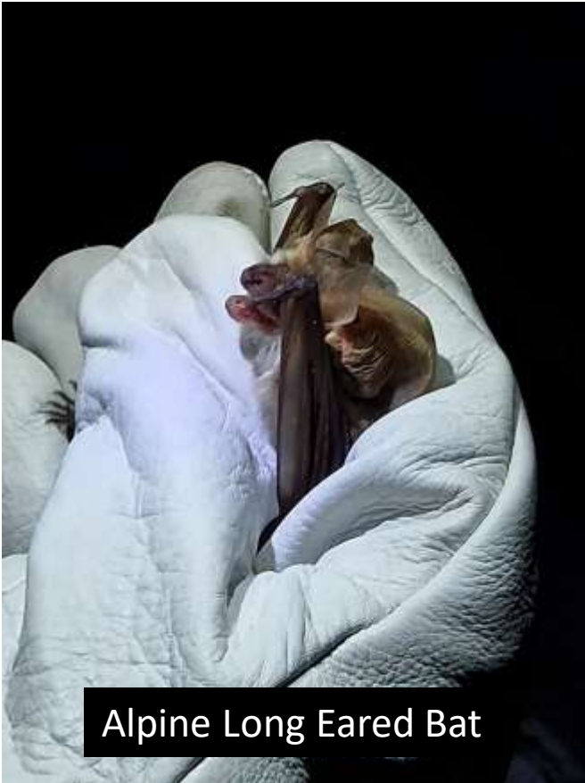
Alpine Long Eared Bat