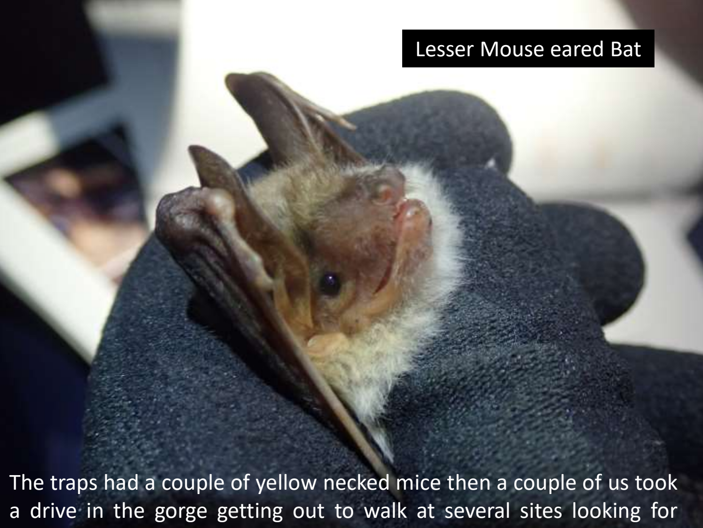
Lesser Mouse eared Bat

The traps had a couple of yellow necked mice then a couple of us took a drive in the gorge getting out to walk at several sites looking for wildlife, plentiful bird life, dipper, crag martin, black redstart along with a smooth snake and a few nice plants including flowering houseleeks. Late afternoon we headed back for dinner then headed to Podmalinsko Monastery to bat trap by the river, this was quite successful with Whiskered, Parti coloured, lesser mouse eared and natterer's bats.