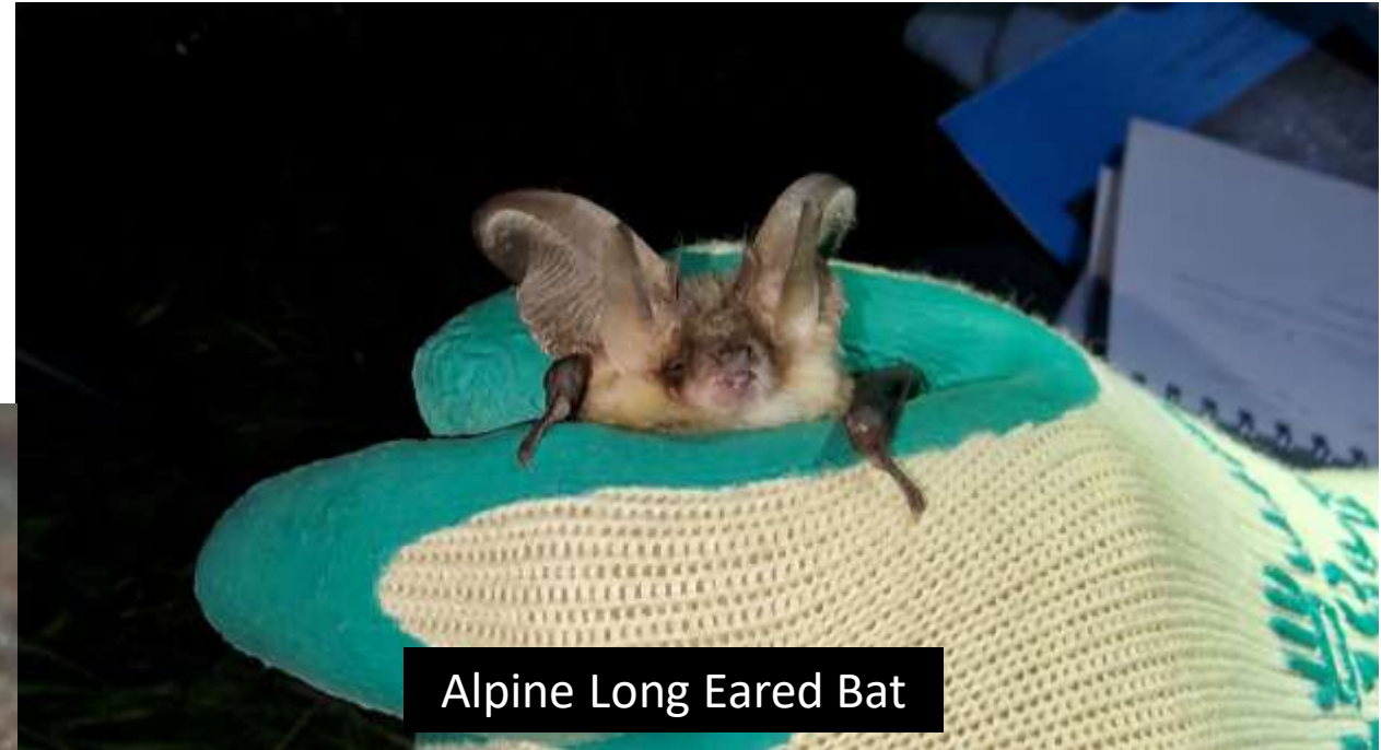
Alpine Long Eared Bat

We headed to the gorge to bat trap, I took the moth trap as well (Jersey Tiger, sprinkled rustic, gold triangle). Bat wise we caught Alpine long eared bat, Geoffroy's and natterer's bats.