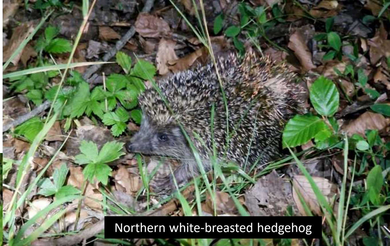
Northern white-breasted hedgehog

I took a walk down to the local church in the afternoon a stoat crossed the path, very nice and a large tortoiseshell. A rain shower interrupted proceedings and after dinner we check the longworth traps a common vole the only thing present, but I did find an edible dormouse that was present in a disused building. Driving back in the dark we came across two Northern white-breasted hedgehogs and an Aesculapian snake eating an edible dormouse.