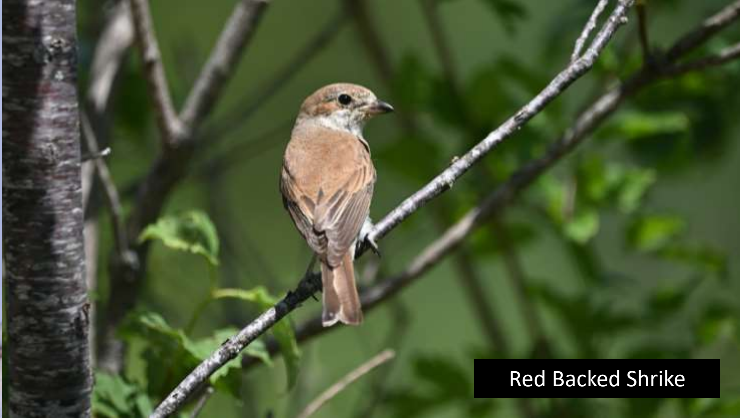
Red Backed Shrike

My last full day and after trap checks a couple of wood mice and a yellow necked mouse I walked back to the accommodation from the trapping site, I had a nice honey buzzard, some bee eaters, a red backed shrike family, loads of butterflies and I spent quite a bit of time photographing them before heading back to base for an ice cream and a couple of hours relaxing before dinner. It was trap checking after dinner one yellow necked mouse and I had the moth trap running for the last time – fortified carpet and Burren green the pick. It was midnight so cake and beers for my birthday a nice way to finish off a nice trip.