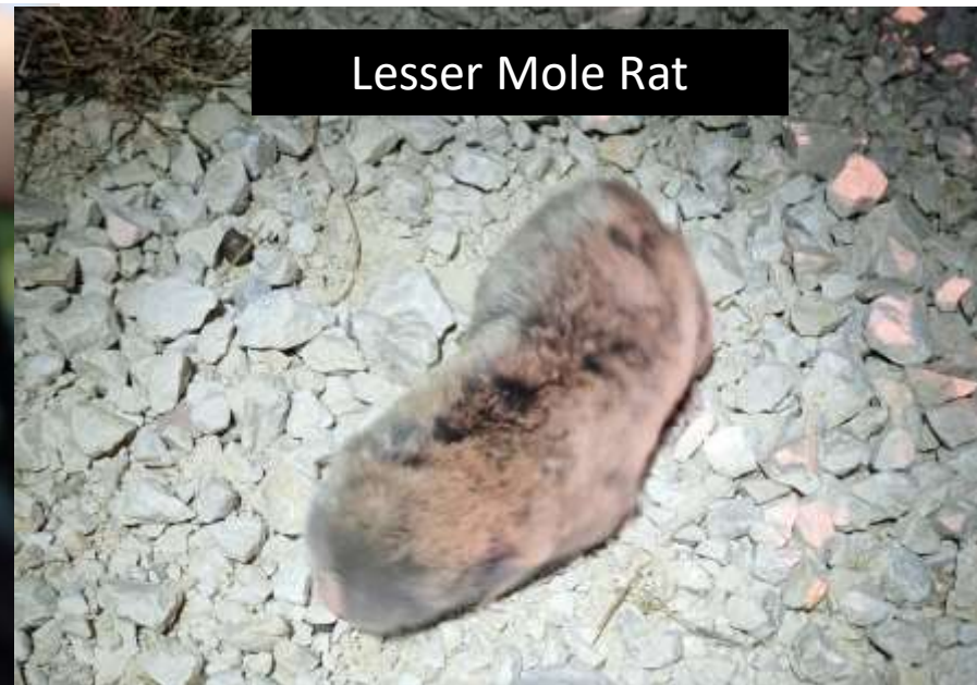
Lesser Mole Rat