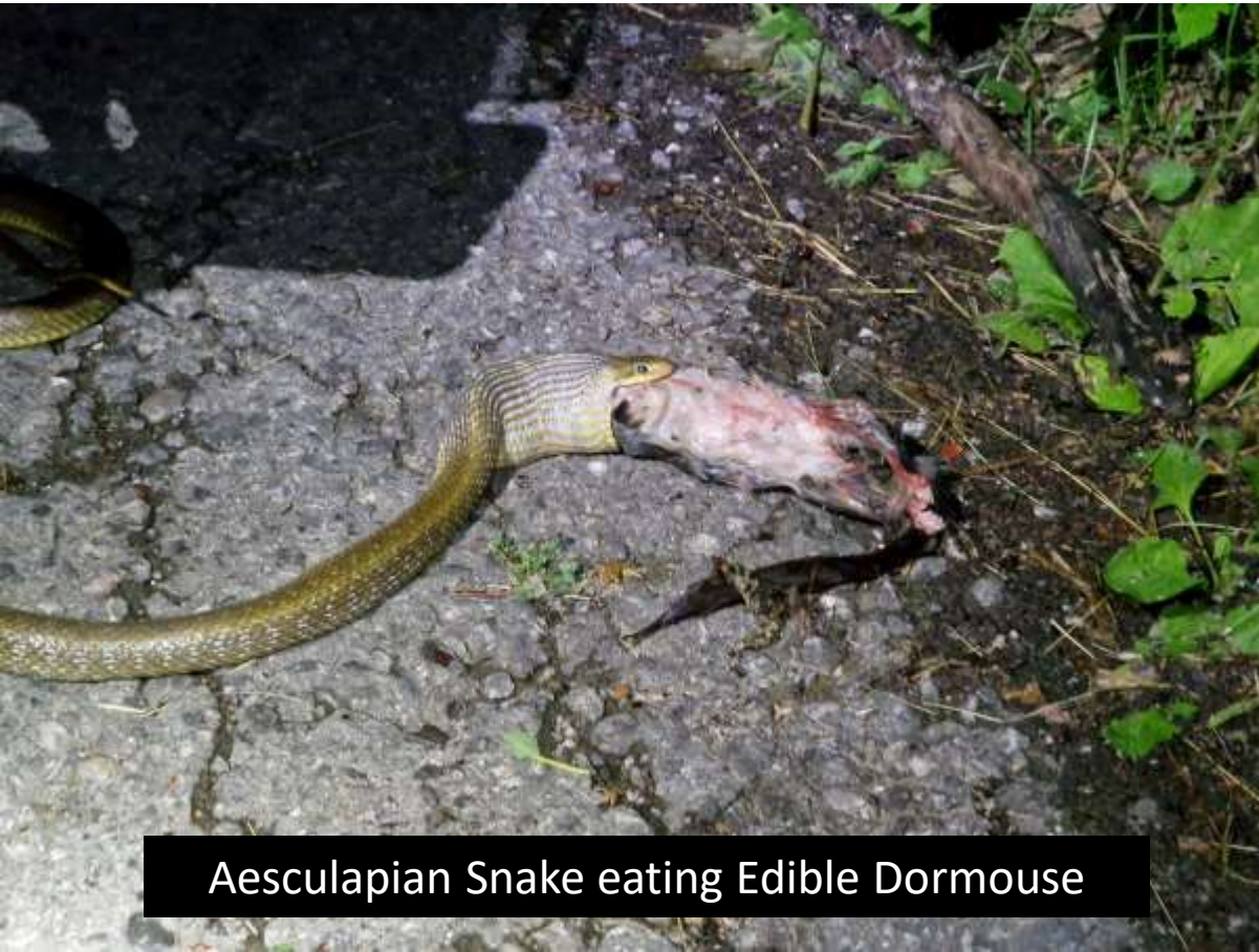
Aesculapian Snake eating Edible Dormouse

Another hot day, checking the traps we had an Edible dormouse in one of the large Shermans but not much else. A nice honey buzzard, a hare, a nice hummingbird hawkmoth.