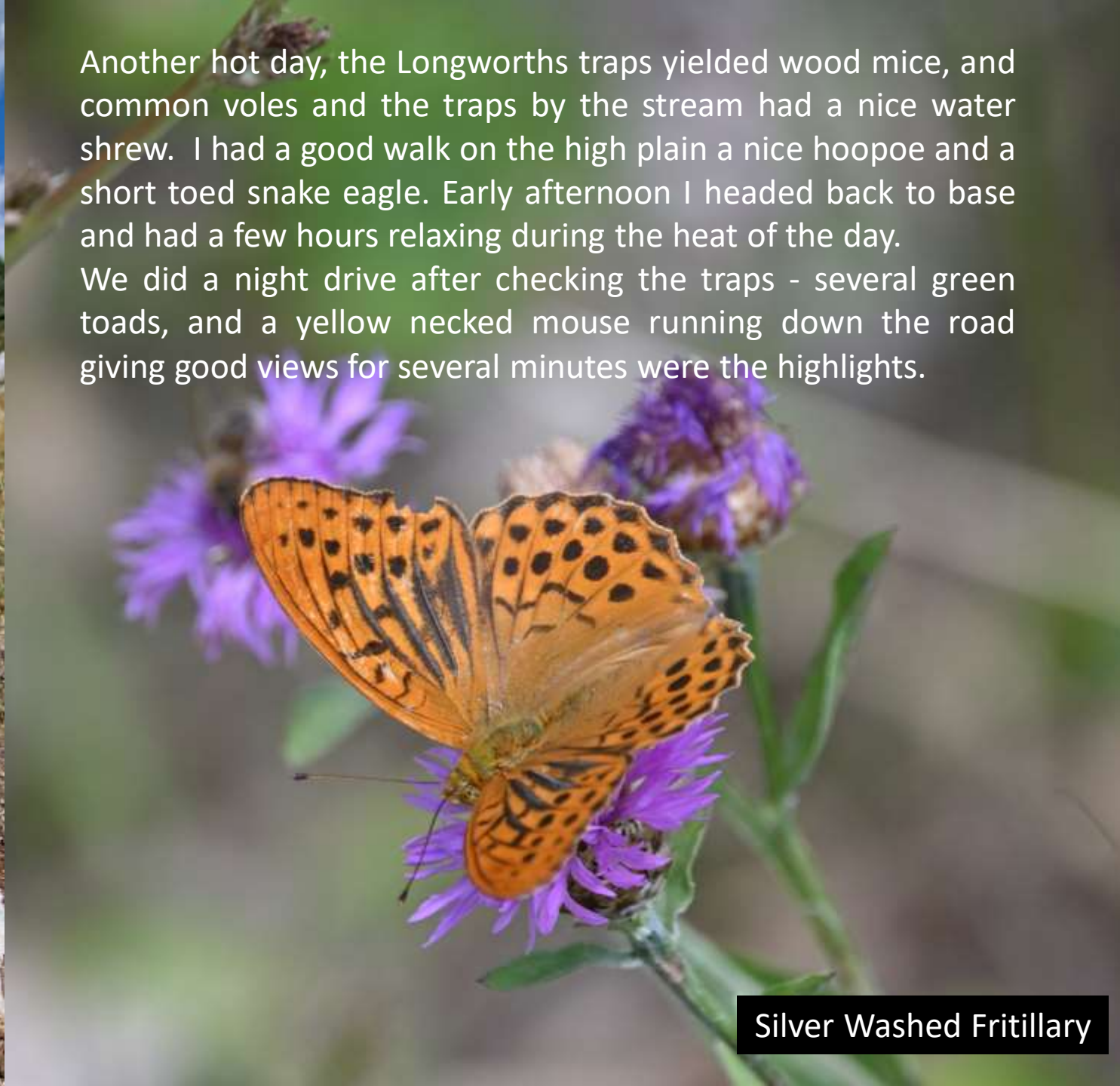
Silver Washed Fritillary

Another hot day, the Longworths traps yielded wood mice, and common voles and the traps by the stream had a nice water shrew. I had a good walk on the high plain a nice hoopoe and a short toed snake eagle. Early afternoon I headed back to base and had a few hours relaxing during the heat of the day. We did a night drive after checking the traps - several green toads, and a yellow necked mouse running down the road giving good views for several minutes were the highlights.