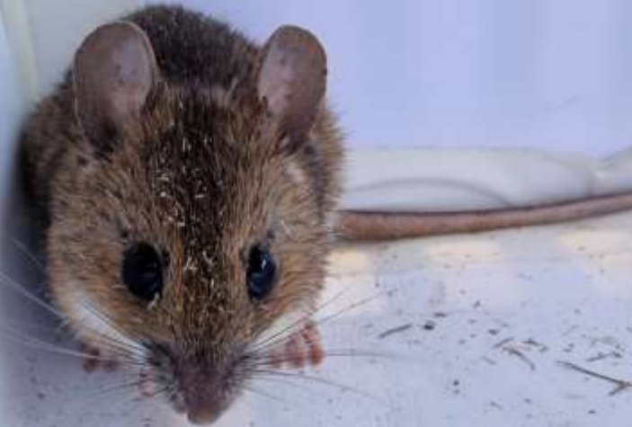
Yellow Necked Mouse