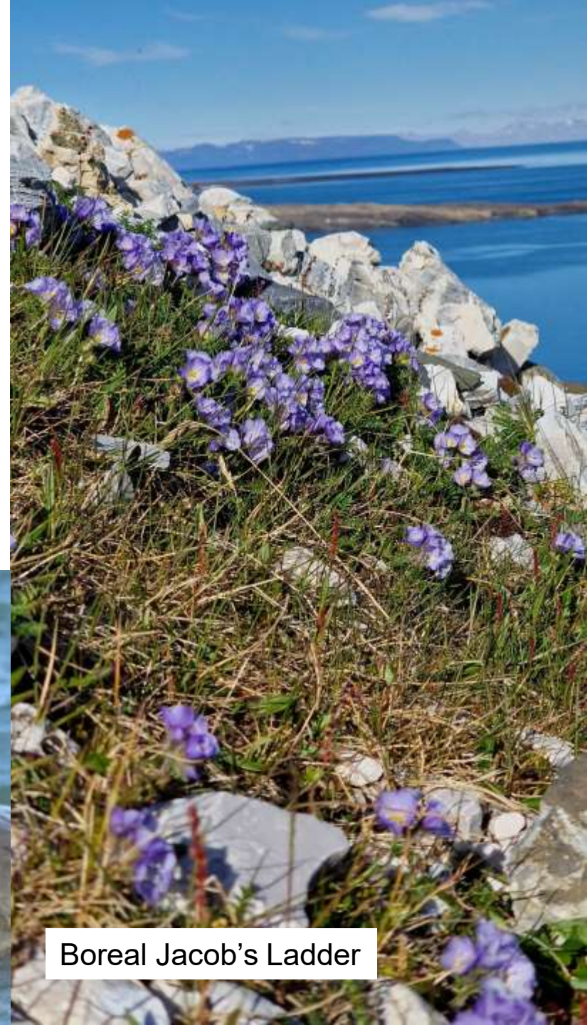
Boreal Jacob's Ladder