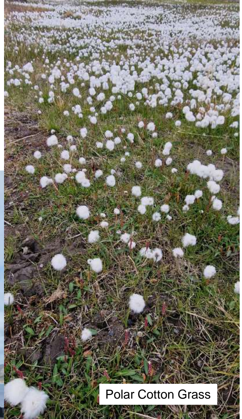
Polar Cotton Grass