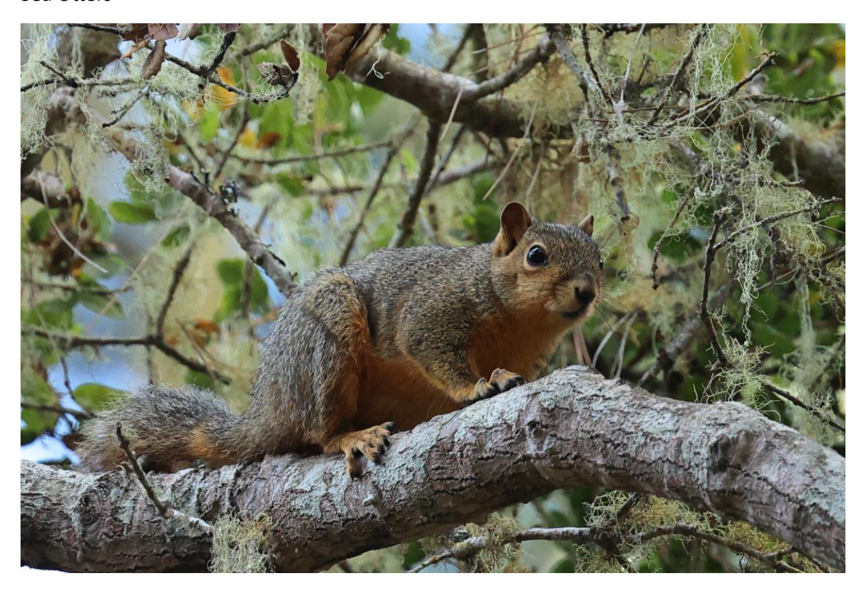
Eastern Fox Squirrel