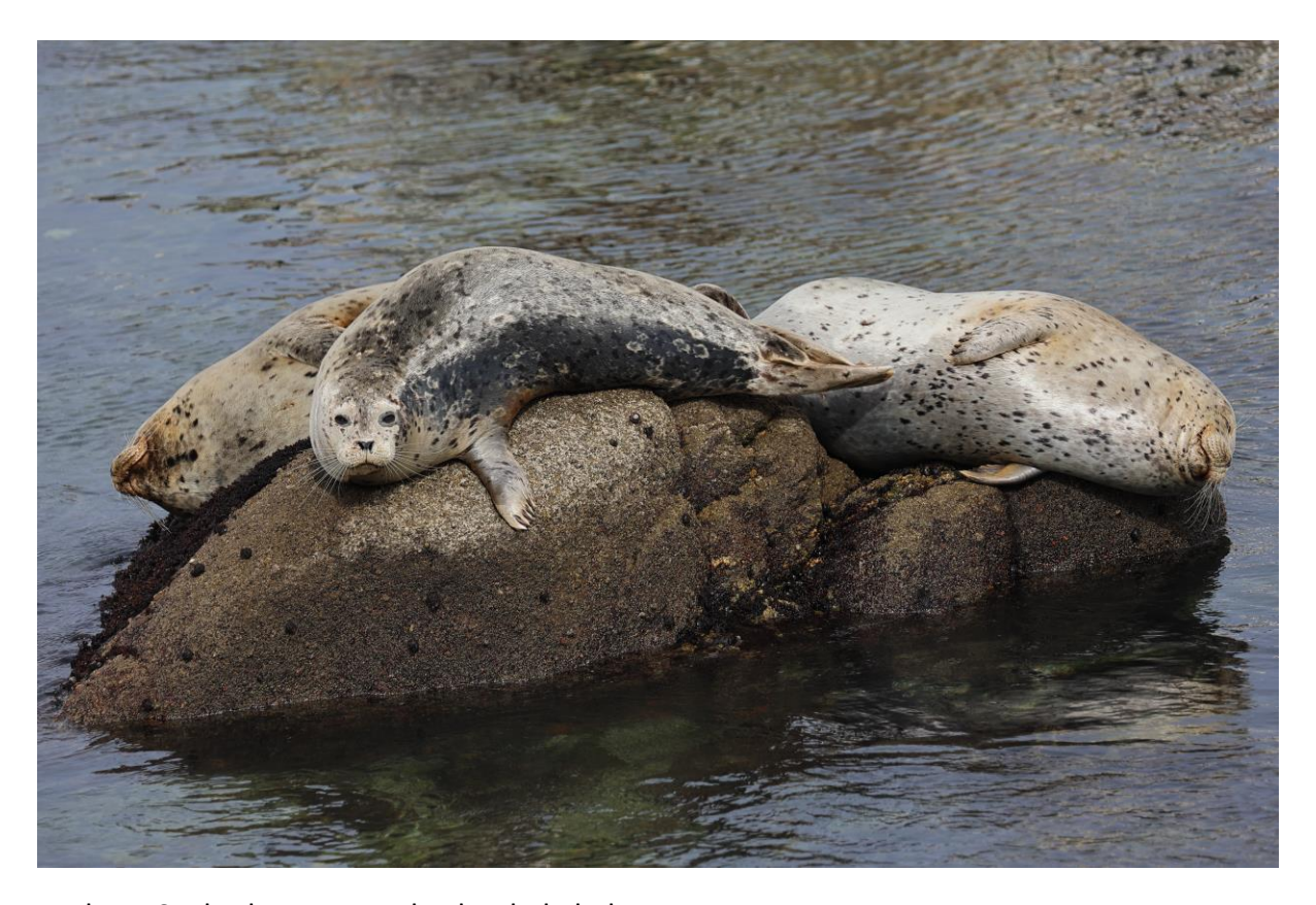
Harbour Seals above, Humpback Whale below