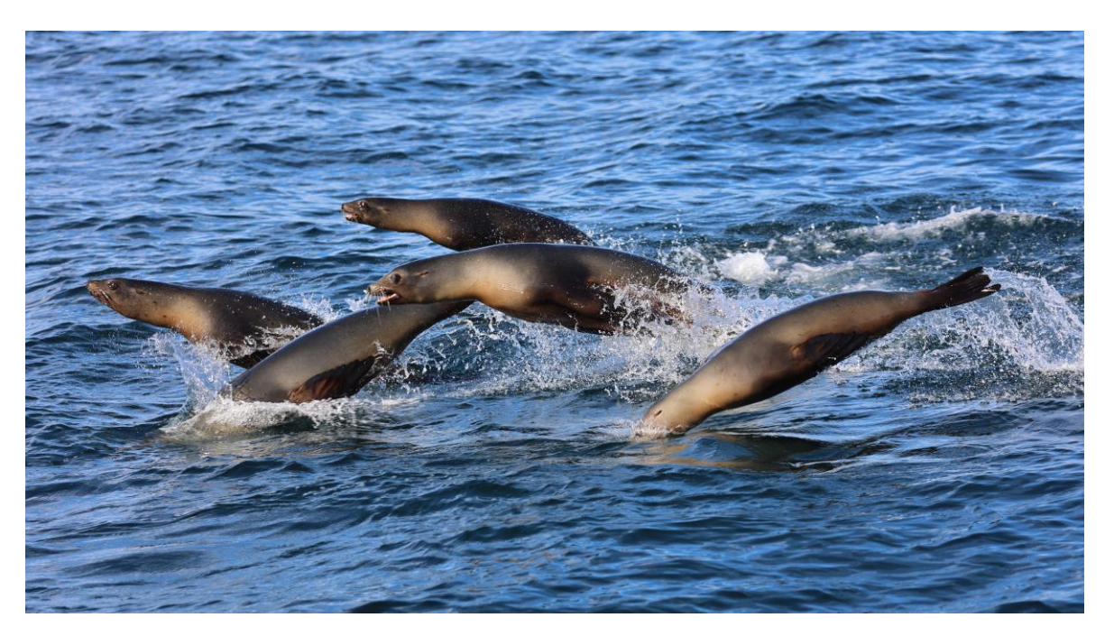
California Sea Lions

Monterey Bay Whale Watch - 21 on the 4-hour trip, 10 on the 8-hour trip.