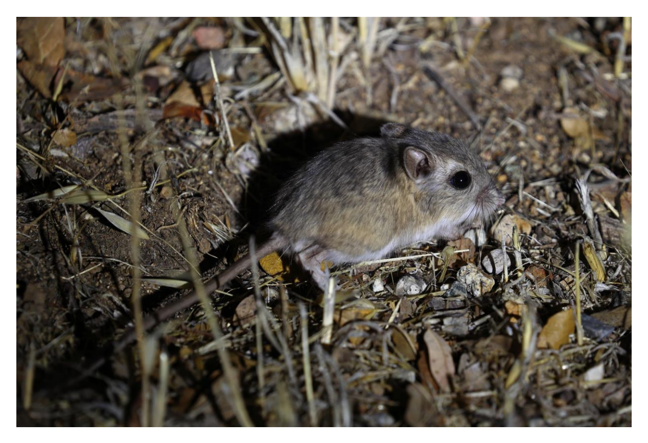
Heermann's Kangaroo Rat