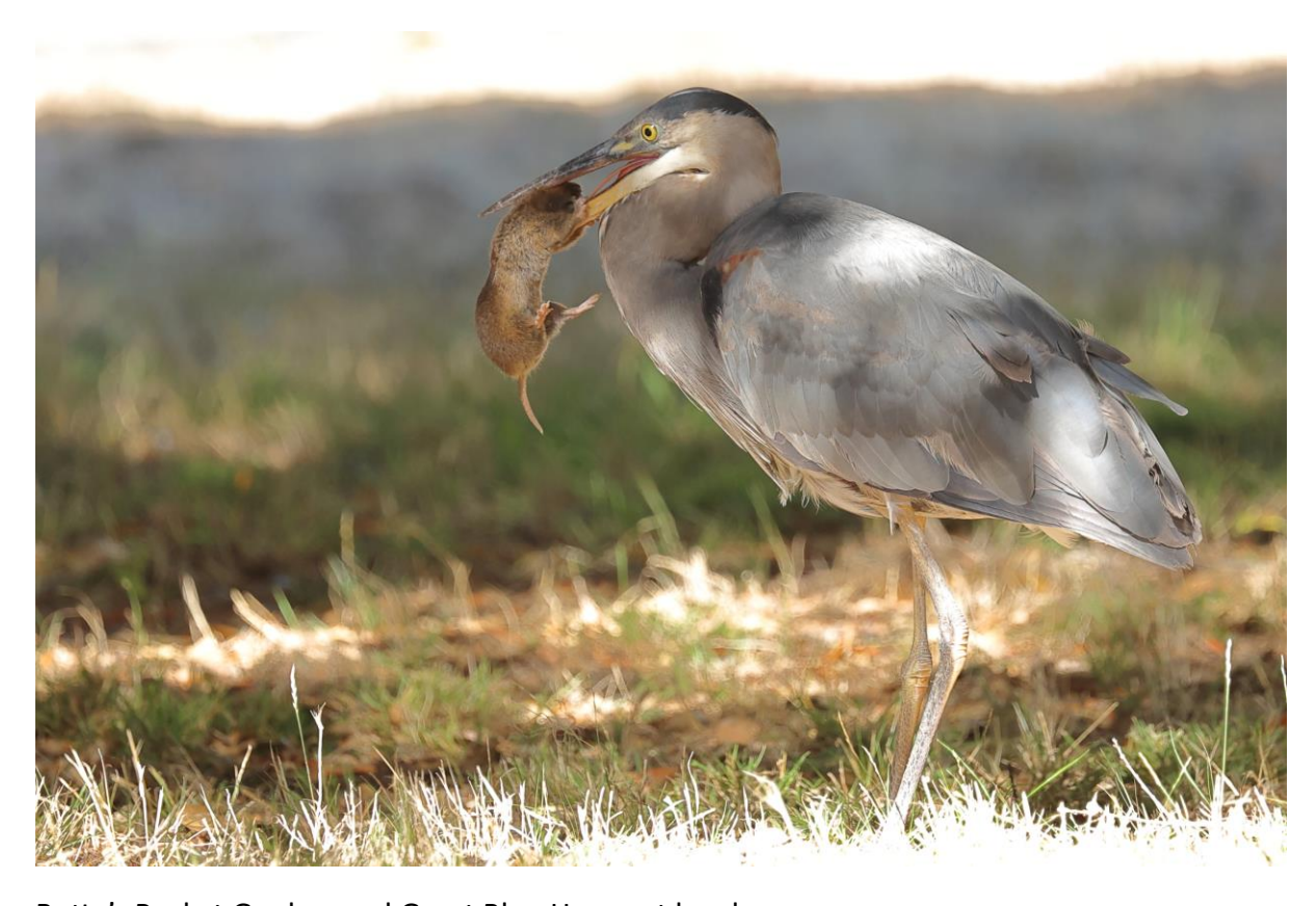
Botta's Pocket Gopher and Great Blue Heron at lunch