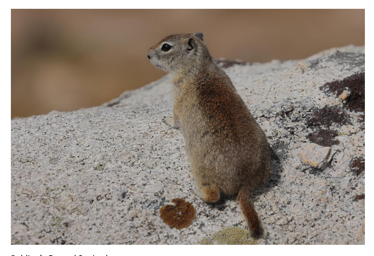
Belding's Ground Squirrel