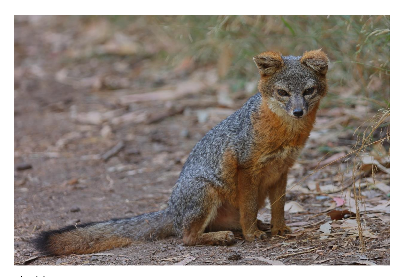
Island Grey Fox

Wed - Santa Cruz Islnd, Channel Island National Park: Island Grey Fox, California Sea Lion, Common Dolphin.