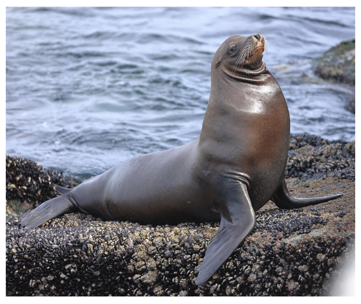
California Sea Lion