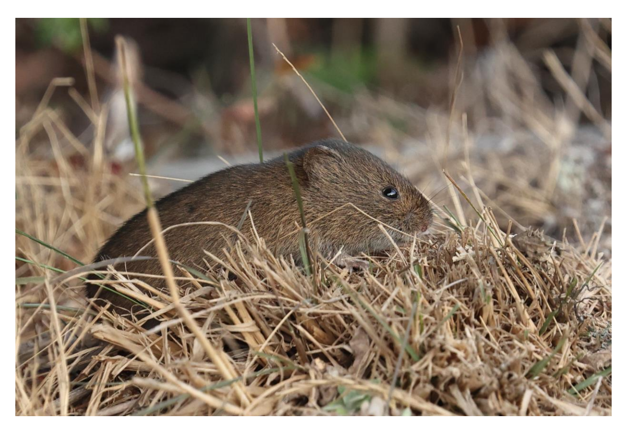
California Vole above, California Ground Squirrel below.

Thurs – Big Sur/Highway 1: Mule Deer, Racoon, Bottlenose Dolphin. Los Lobos State Park: Western Grey Squirrel, California Vole, Brush Rabbit, Sea Otter, California Sea Lion.