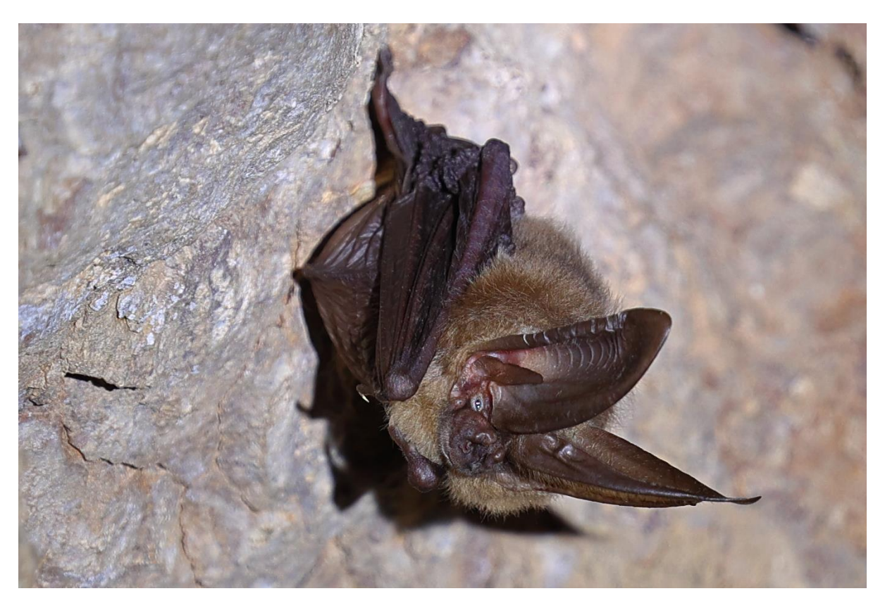
Townsend's Big-eared bat