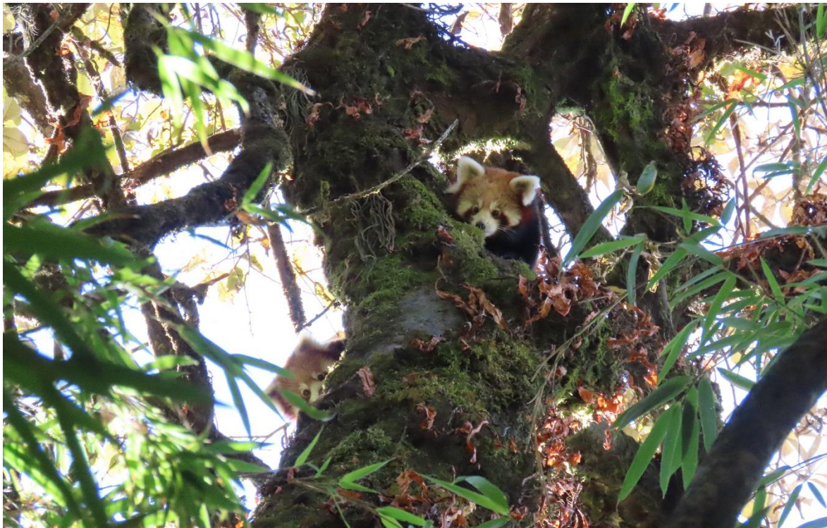
The climax of the trip was this inquisitive pair of cubs that eventually climbed down to within a couple of metres of us.