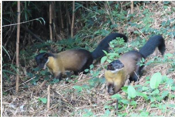
Yellow-throated Martens at the Habre's Nest bird hide.