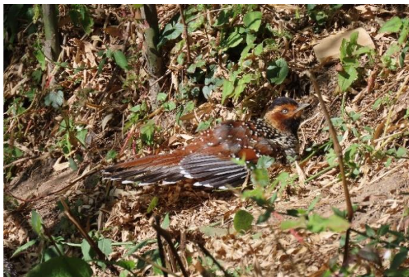
Spotted Laughingthrush soaking up the sun.