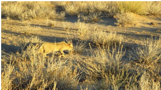
African Wild Cat