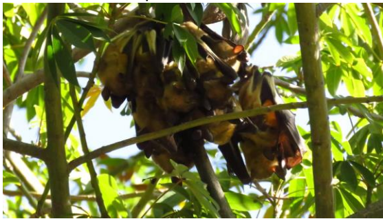
Straw-coloured Fruit Bat