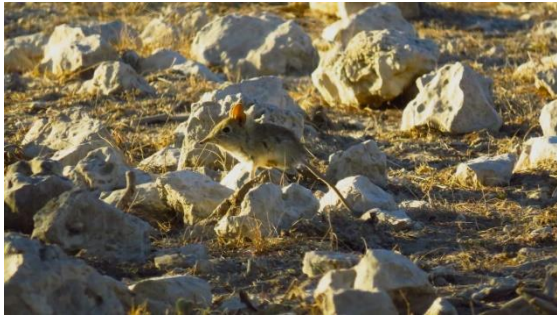
Western Rock Elephant-shrew