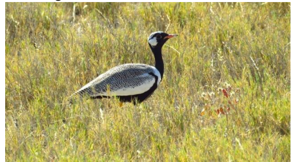
Northern Black Korhaan