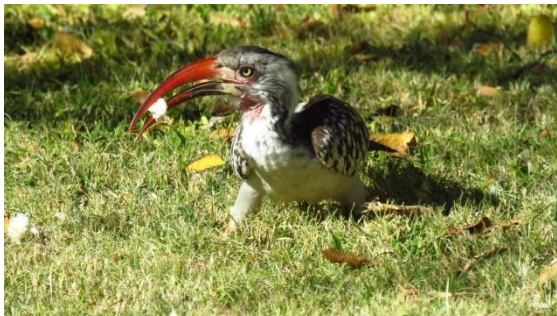
Southern Red-billed Hornbill