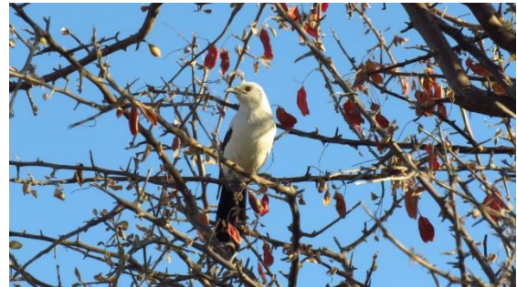
Southern Pied Babbler