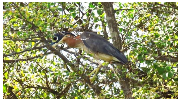
White-backed Night Heron