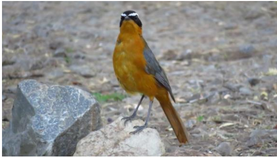
White-browed Robin Chat