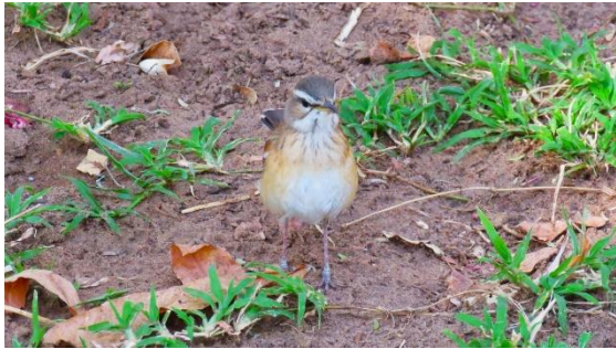
White-browed Scrub Robin