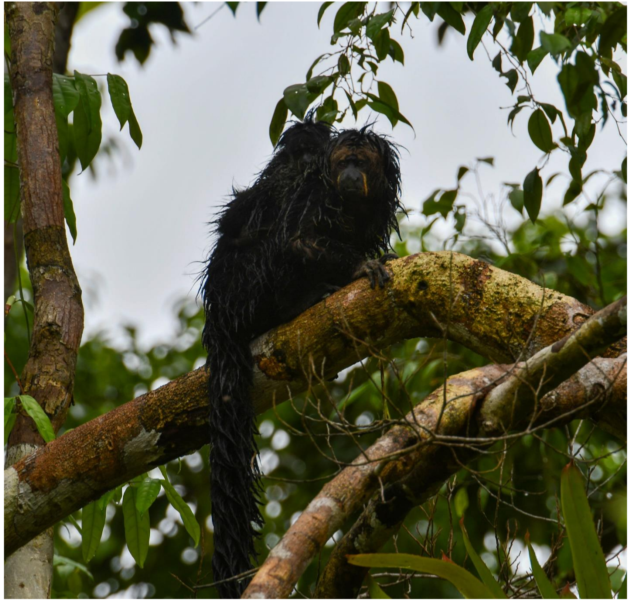
(mother and baby Monk Saki Monkey)

My sister's family finally caught up with us after missing their connecting flight to Lima in Dallas and having to fly to LAX, wait a day and then catch a red-eye to Lima. In the afternoon they canoed through the flooded forest and hiked as we did and were fortunate to see a small group of Giant River Otters briefly.