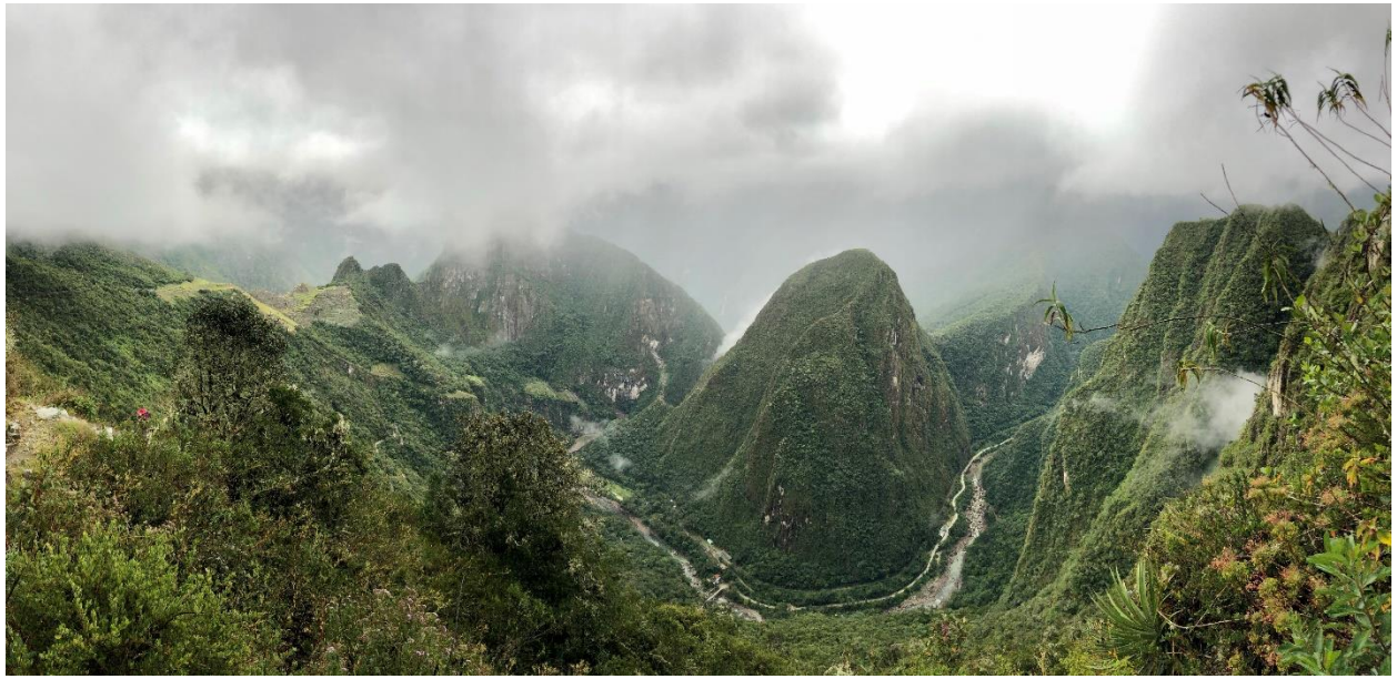
The Urubamba River and Machu Picchu from the Sun Gate