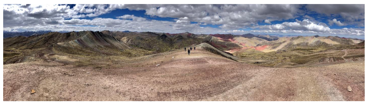
Palccoyo or Rainbow Mountain with Ausungate a peak of 20,954 feet in the far left corner

Mammal Species List (not so technical or scientific, 20): Pink River Dolphin Red-Faced Uakari Common Squirrel Monkey Monk Saki Monkey Dusky/Copper Titi Monkey Brown-Faced/Large Headed Capuchin Pygmy Marmoset Night/Owl Monkey Common Wooly Monkey Brown-Throated Three-Toed Sloth Southern Tamandua Paca Red Acouchy White-Faced Tree Rat Yellow-Crowned Brush-Tailed Rat Common Opossum