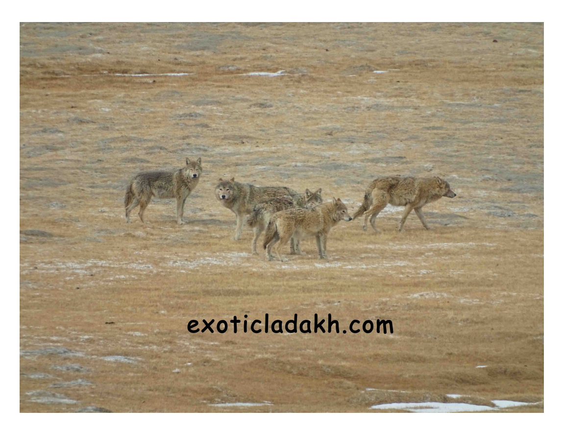
The 03rd of march, we see 9 wolves, then 1 red fox, 1 wooly hare, and 6 other wolveslater. The 04th of march 9 wolves again, our first Tibetan fox who was hunting mices, then a red fox, then 2 more wolves, plus 2 great eagle owls copulating the evening!