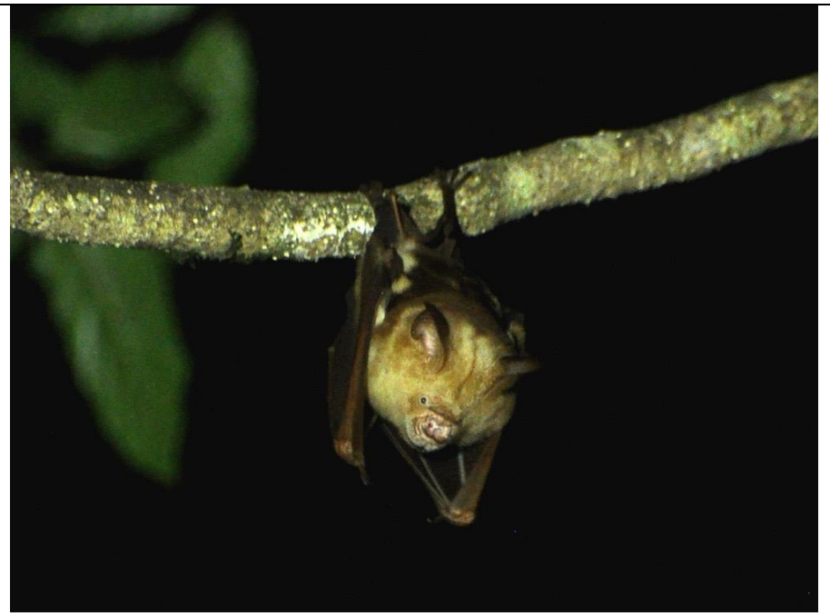
Diadem Leaf-nosed Bat