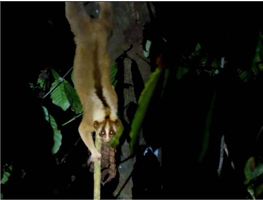
Javan Slow Loris