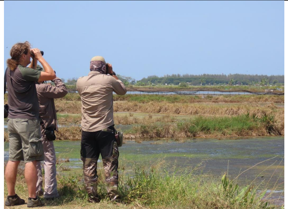
Central Java – Javan Mongoose Searching