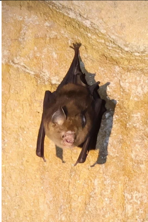
Fawn Horseshoe Bat