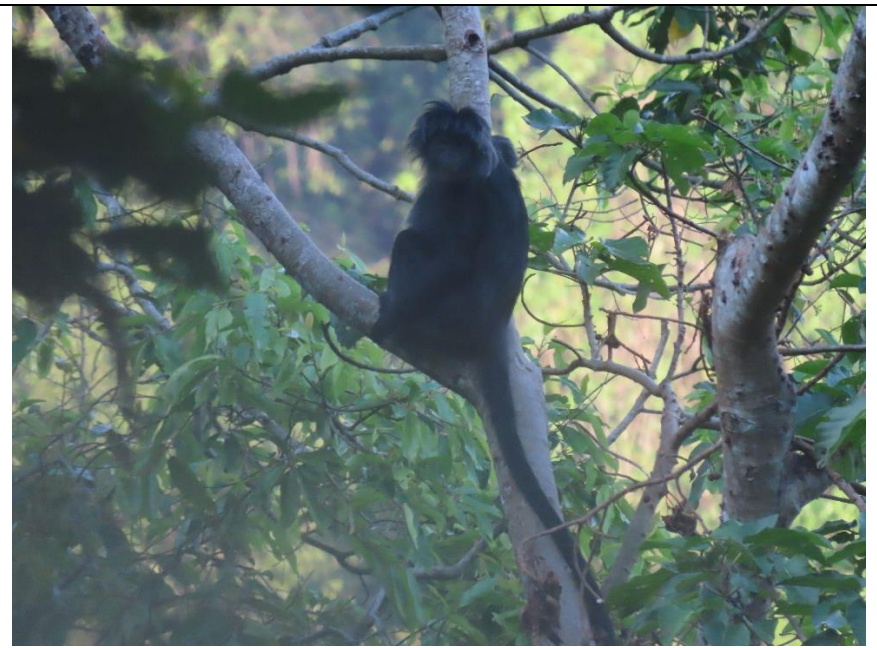
Western Javan Lutung