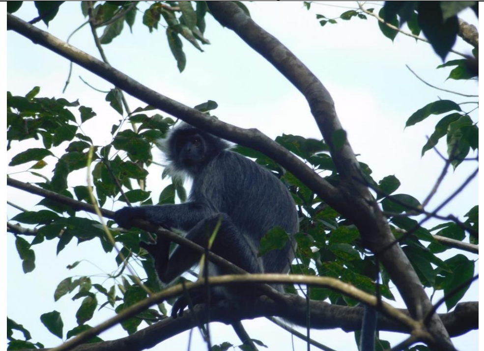
Sundiac Silvered Langur