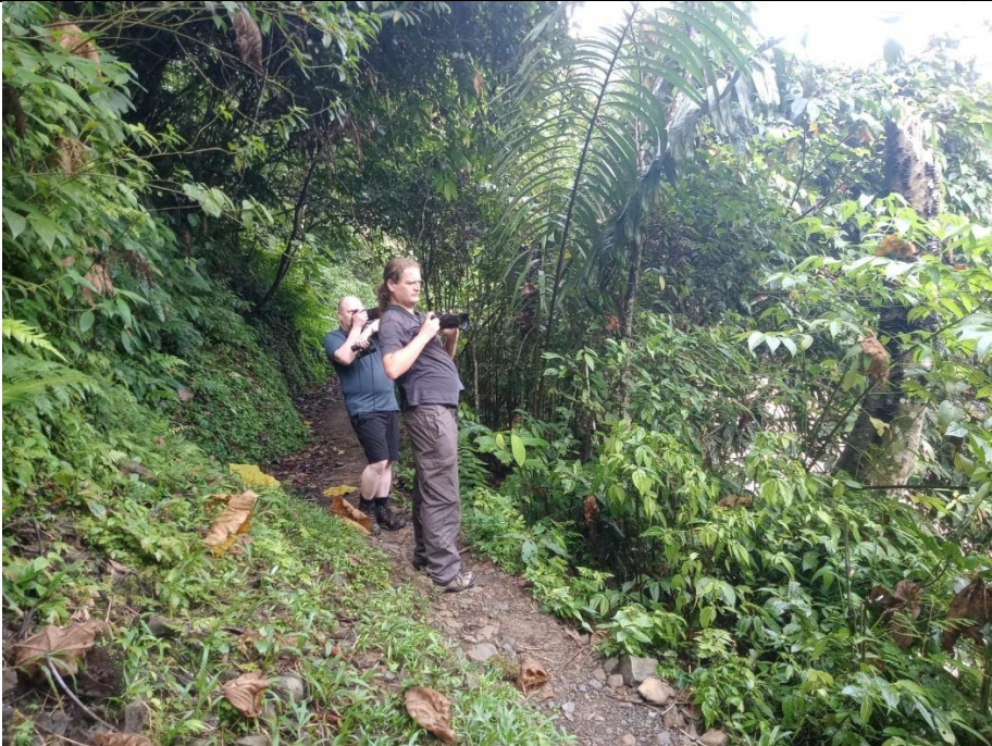
Mammalwatching by Foot