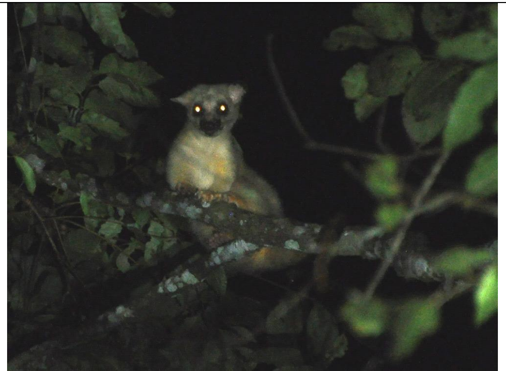
Javan Small-toothed Palm Civet