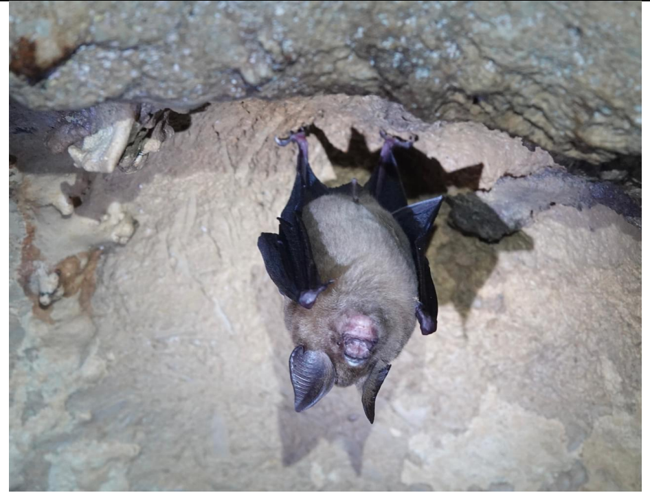
Arcuate Horseshoe Bat