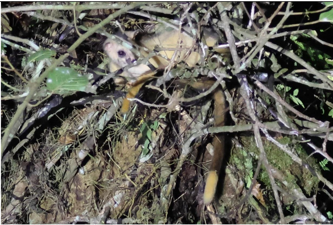
Javan Small-toothed Palm Civet