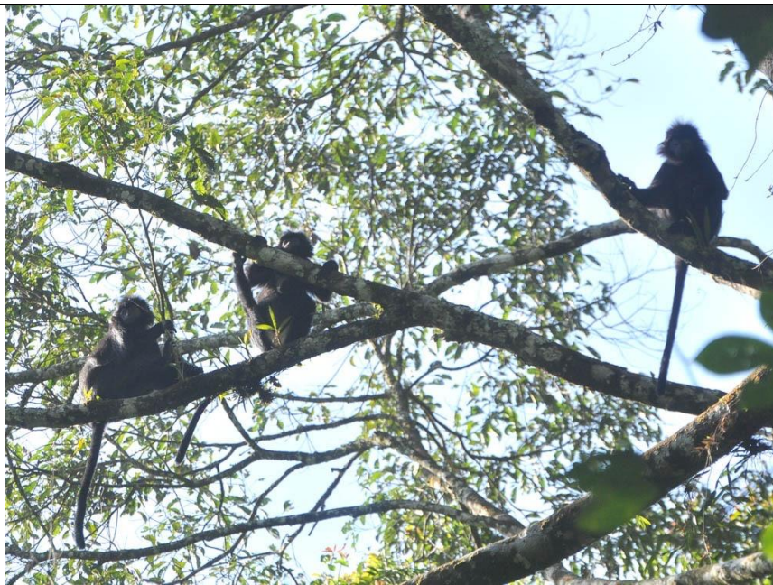
Eastern Javan Lutung